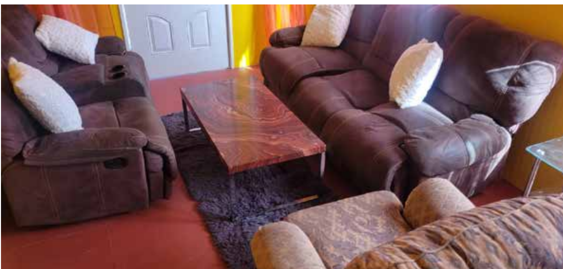
The house comes fully furnished thanks to donations from several corporate citizens