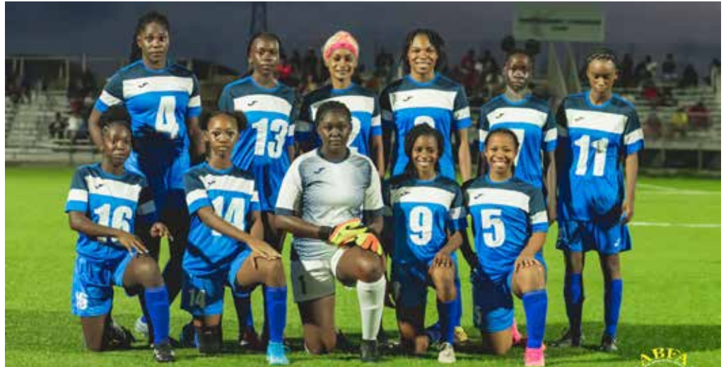
Players of the Fort Road female football team.

Kevoncia James scored for All Saints United in the 62nd minute.