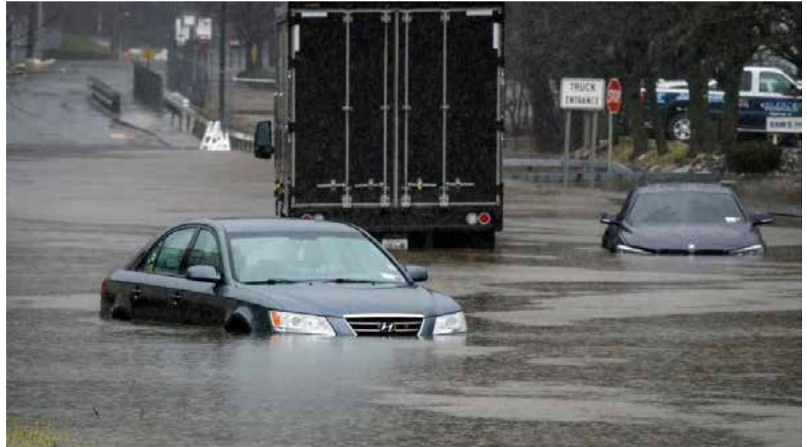
In northern New York, heavy rains flooded cars in the streets.