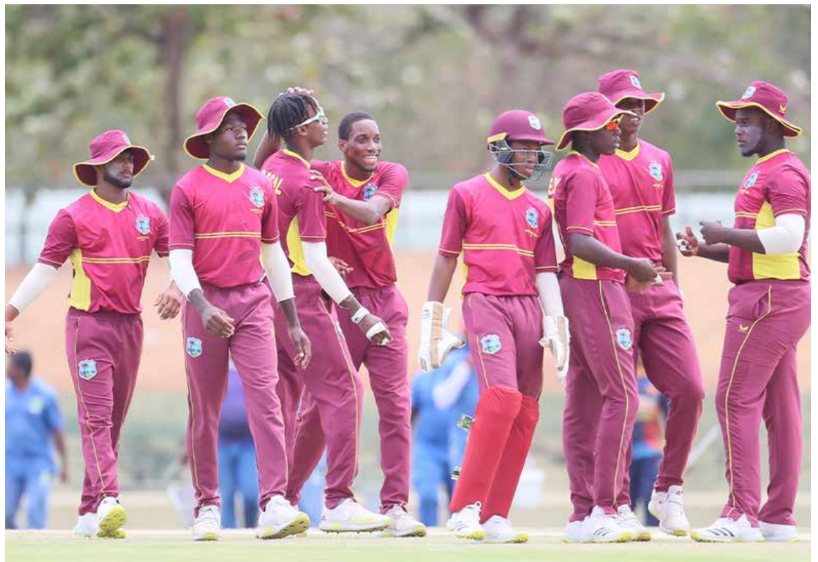
The West Indies Rising Stars Men's Under 19s during the Youth ODI Series in Sri Lanka earlier this year. (File photos)

class debut for the West Indies Academy against Emerging Ireland last month and impressed with his pace. He took 12 wickets in two matches at an average of 6.16 per wicket.