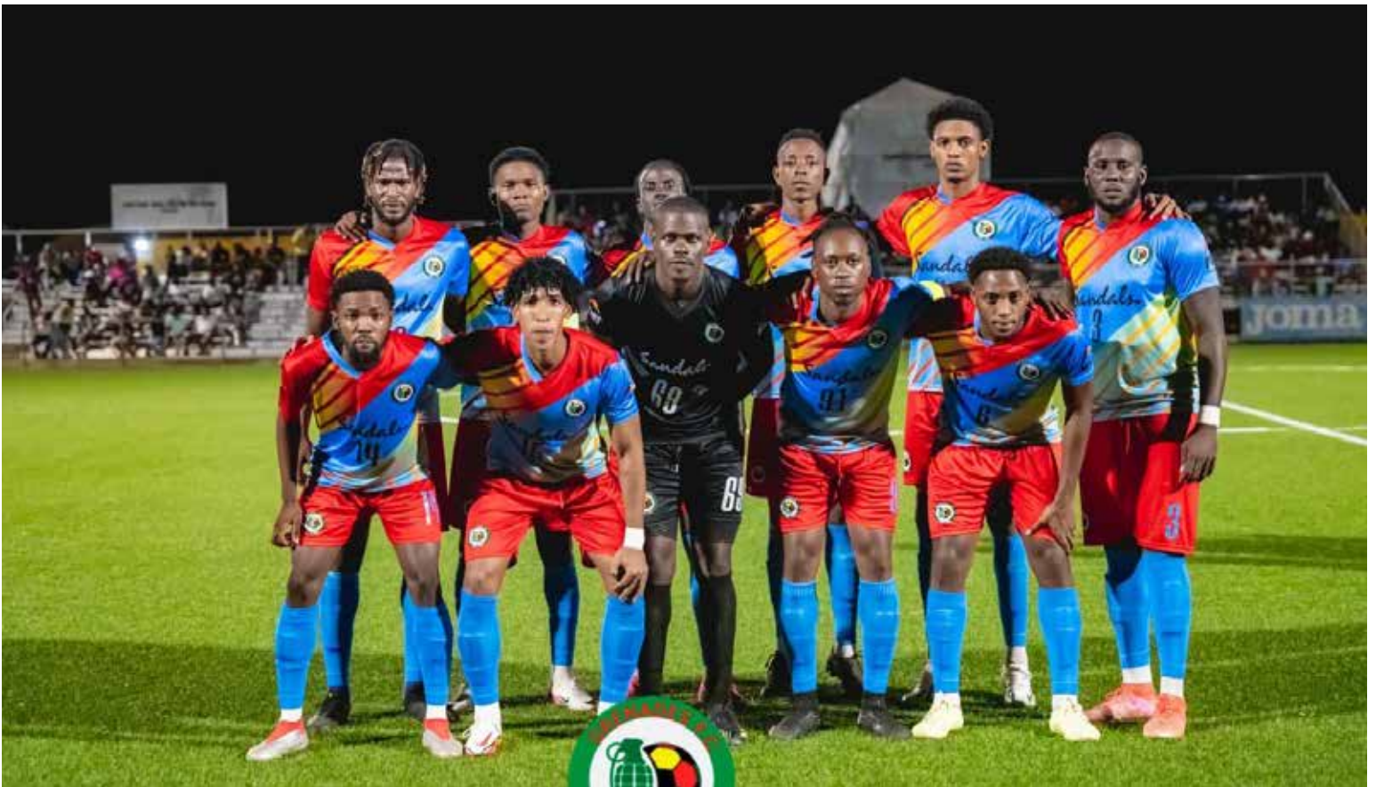
The Sandals Inet Grenades football team. (File photo)