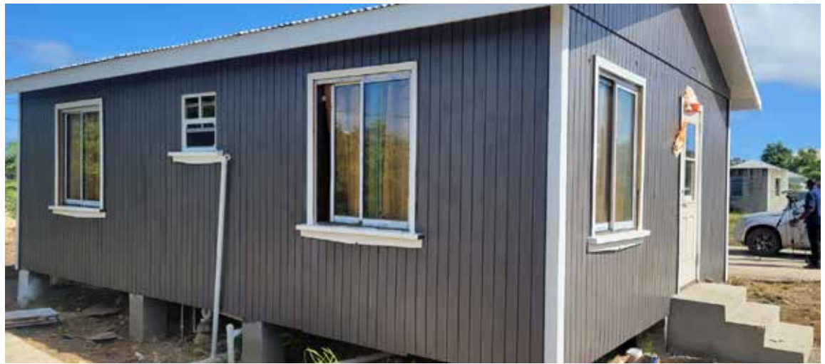
New house located at Bay Street, Villa Area, presented to family following devastating fire stated.

Prime Minister and Parliamentary Representative, Gaston Browne, said the greatness of a nation is represented by the way that it treats the poorest in the society. "Today, you are witnessing the tangible example of our charity in that we are helping one of the poorest families in the community to own a home," he