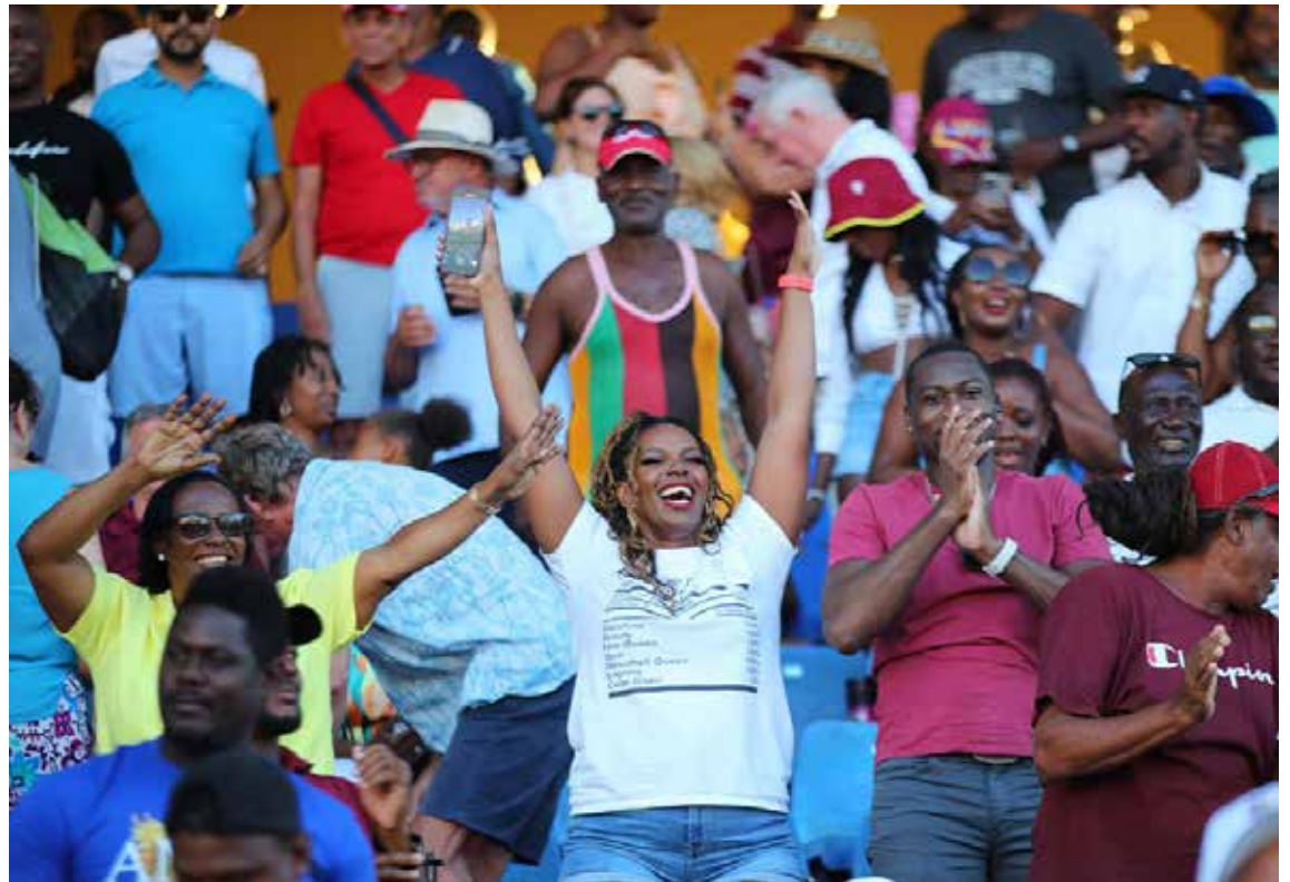
Spectators at a cricket match in the West Indies.

IMG ARENA will capture official data from more than 450 matches across