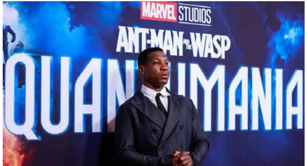
Jonathan Majors’ films include Marvel’s Ant-Man and The Wasp: Quantumania.

capable of love,” the actor sent in September 2022 while threatening to kill himself.