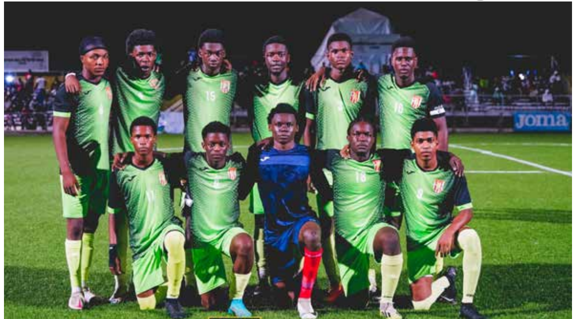
Players of the Villa Lions football team.