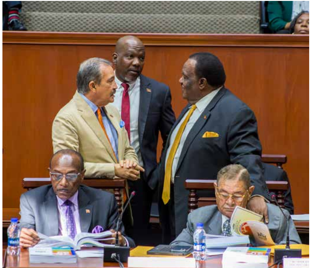
Members of Parliament at the Budget presentation last Friday

PM Browne explained that in or cont'd on pg 3