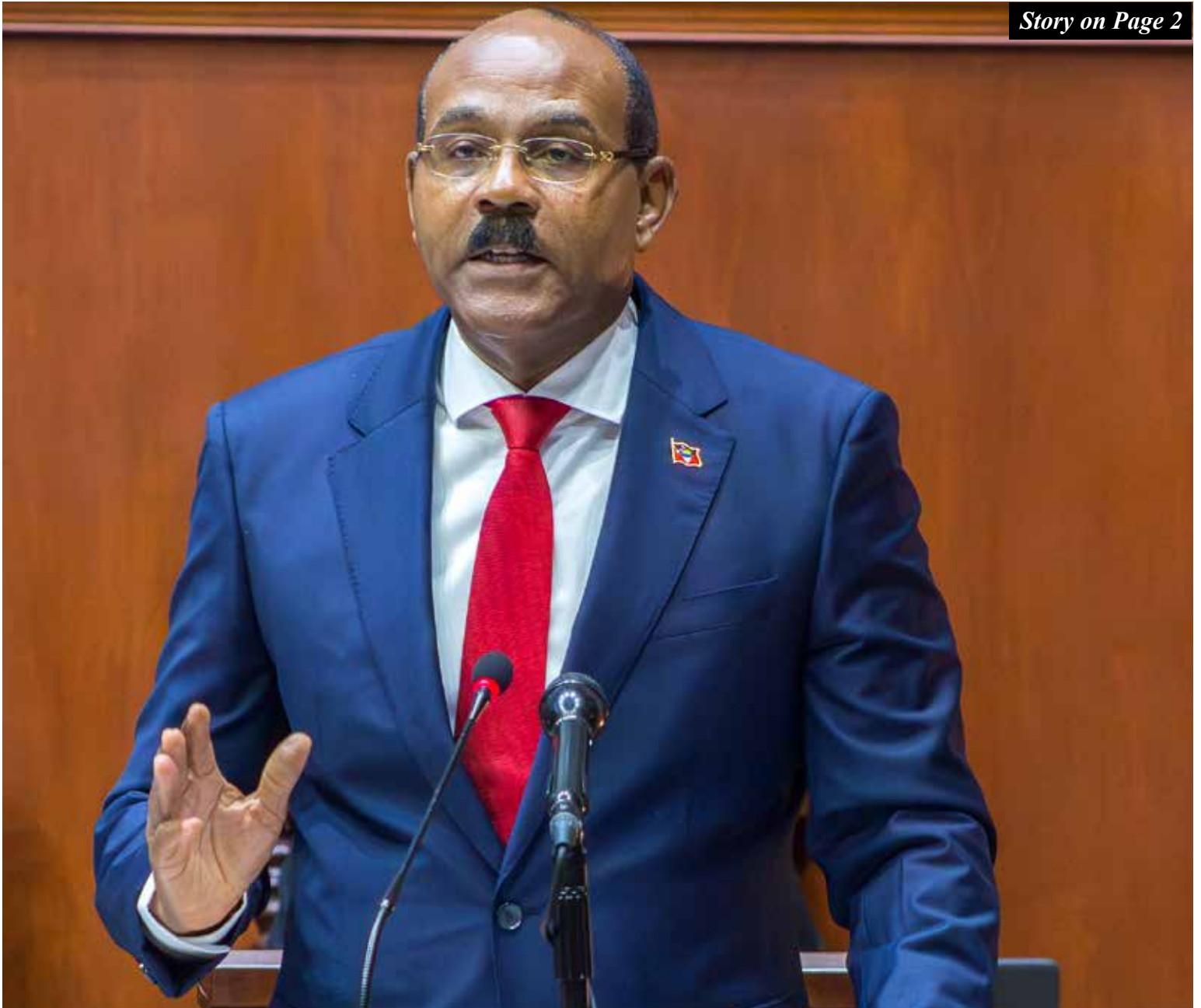
Prime Minister Gaston Browne