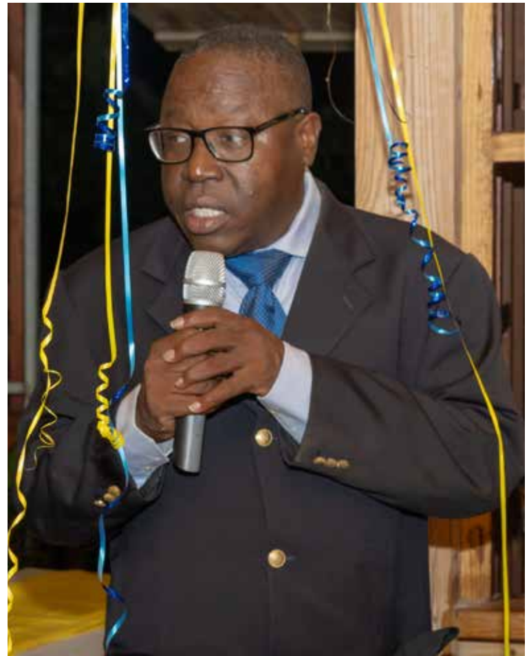
Deverel Forde widely known as Big Brother