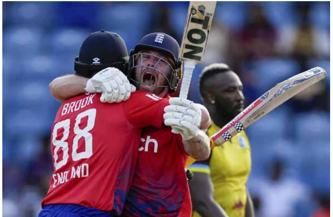
England's batsmen Harry Brook, left, and Phil Salt celebrate defeating West Indies by seven wickets with one ball remaining during the third T20 cricket match at National Cricket Stadium in Saint George's, Grenada, Saturday, Dec. 16, 2023.

intent from ball one. It's something we've asked him to do, but for him to go on and stay in the game a bit longer, it can surprise you how much he can do in the end."