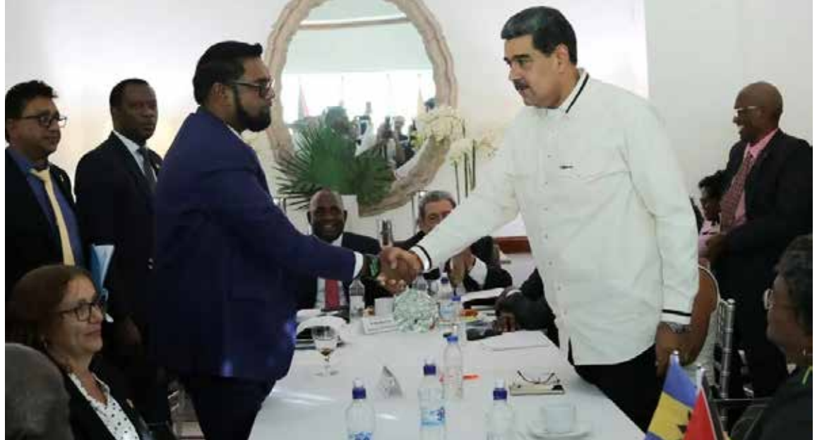
Venezuelan President Nicolás Maduro (right) with the President of Guyana, Irfaan Ali.