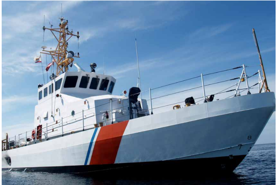
US Coast Guard.

"Stopping the flow of drugs to the United States is a challenging mission that requires a significant