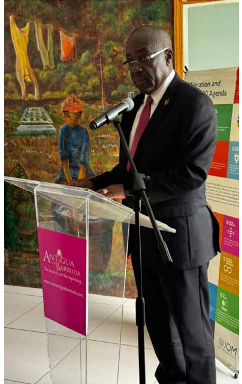
Foreign Affairs Minister, E.P. Chet Greene speaking on the issue of migration in the Caribbean last Friday

In return, Greene suggested that the nation has itself benefited tremendously from remittances, acquired knowledge and skills, technology transfers, together with a growing awareness