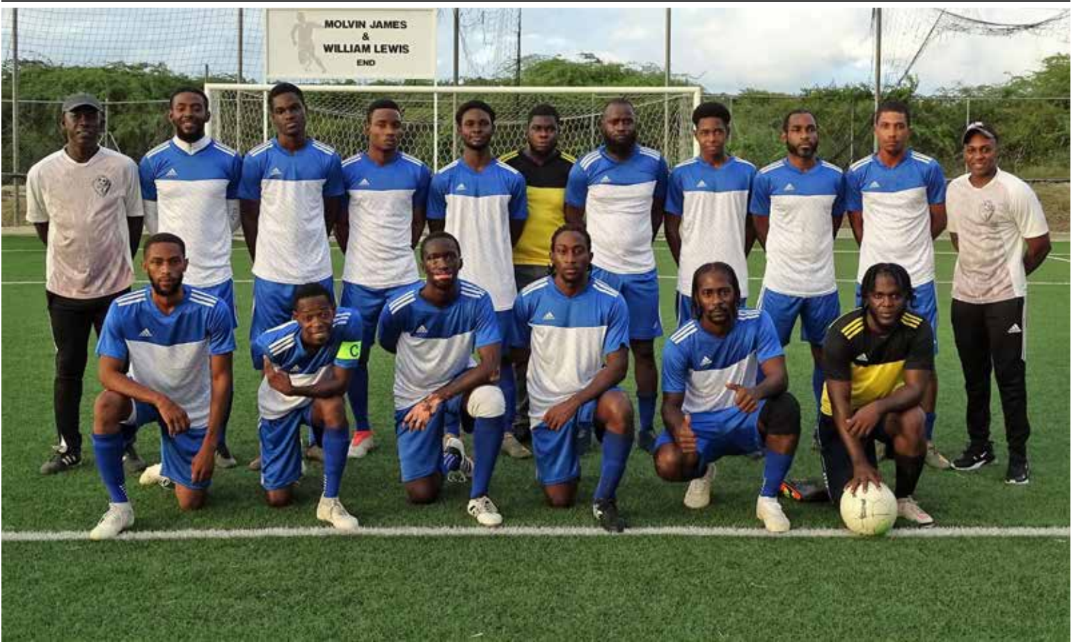
The Sea View Farm football team. (File photo)