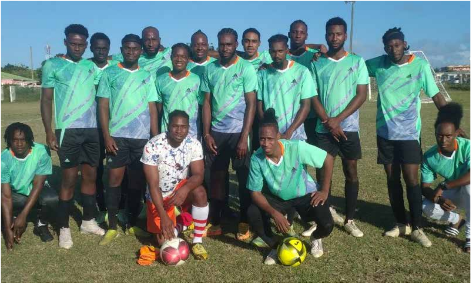
The Potters Tigers football team. (File photo)