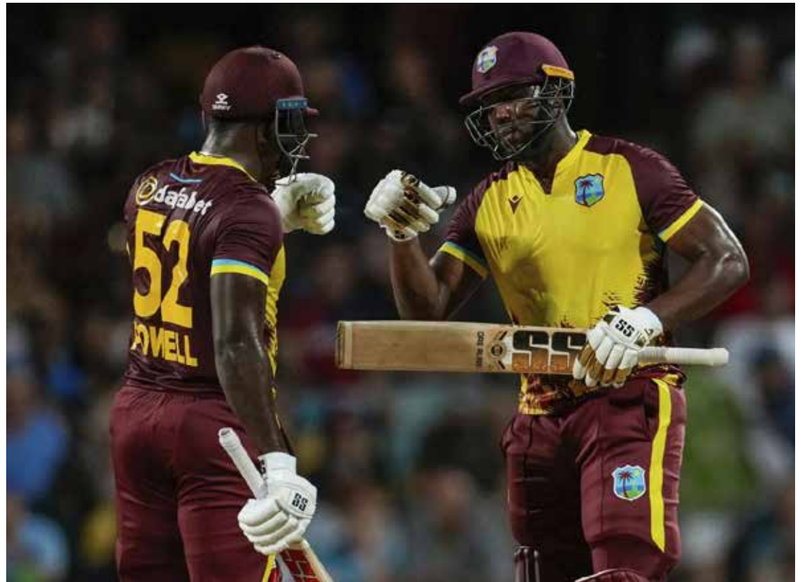
West Indies' batsmen Andre Russell, right, and Rovman Powell celebrate during their partnership against England in the first T20 International cricket match at Kensington Oval in Bridgetown, Barbados, Tuesday, Dec. 12, 2023.

Russell, making his first appearance for the West Indies in more than two years, produced a brilliant bowling performance by grabbing a format-best three for 19 in