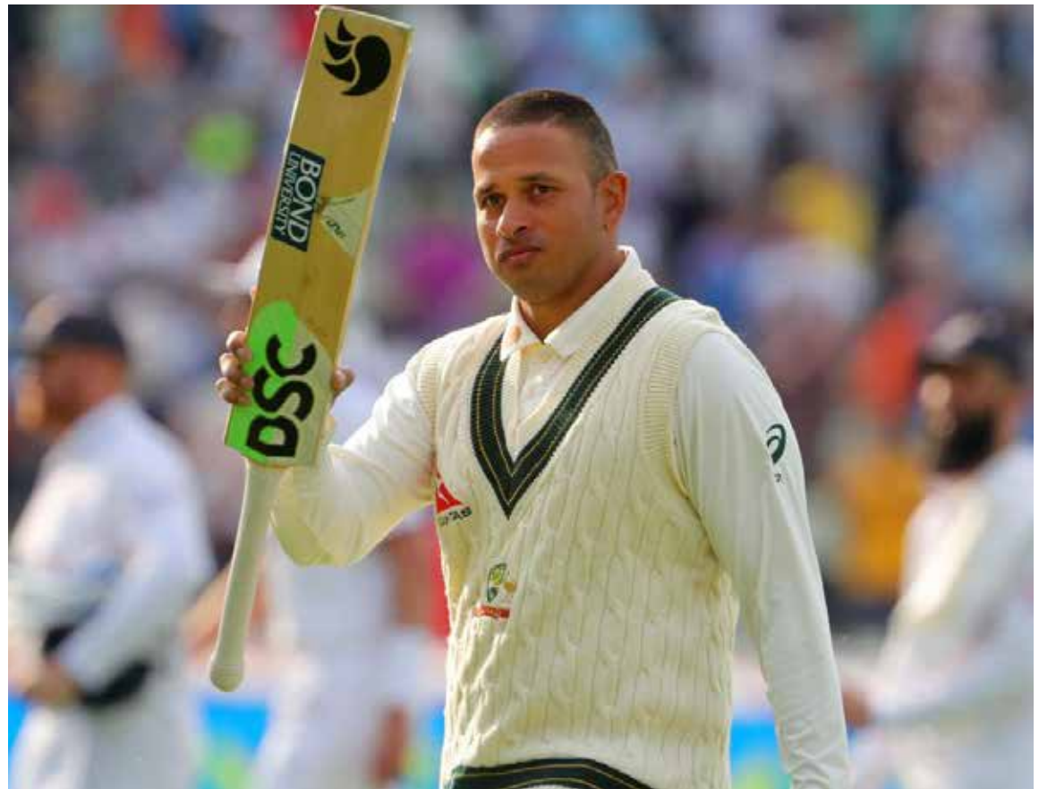
Australia batsman Usman Khawaja.

The ICC Code of Conduct forbids players wear-