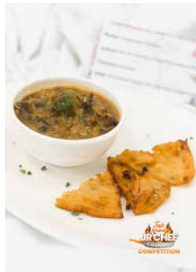
Round 1 - Winning Dish Sir McChesney George Secondary.

For its entry, the Seventh-day Adventist School claimed victory with their flavorful rendition of Pep-