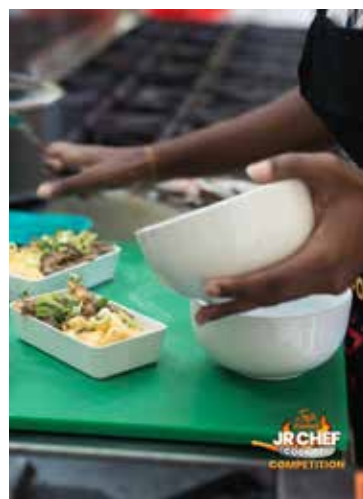
Round 2 Winning Dish - Seventh-day Adventist Secondary