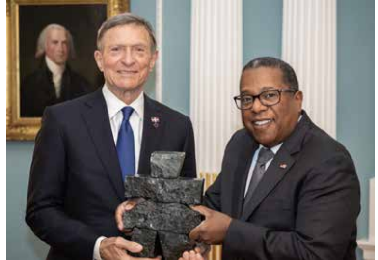
Dominican Foreign Minister Roberto Álvarez (left) and Assistant Secretary of State of the United States Brian Nichols.

The Dominican Republic is the second Ca-