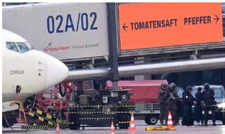
The suspect was detained by special forces.

They later clarified that he stopped the vehicle where a commercial flight full of passengers was preparing to take off. Everyone on board was evacuated safely.