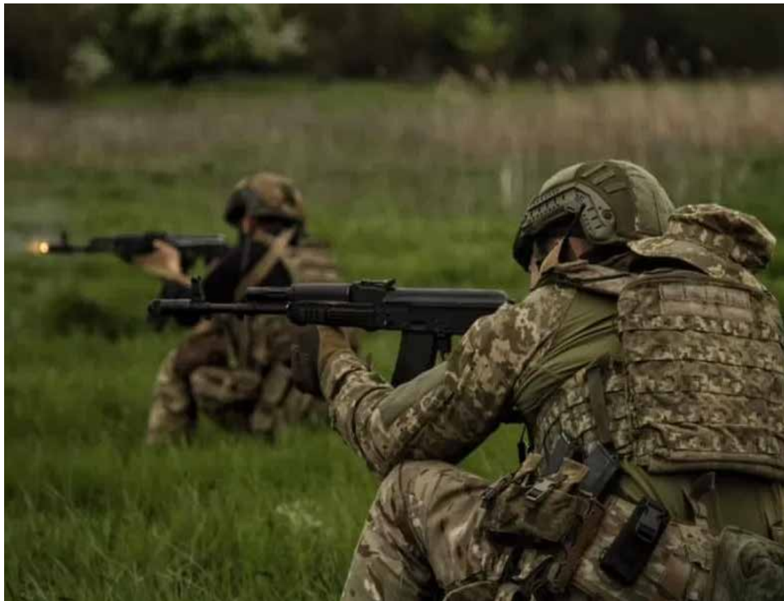
Many of the 128th Brigade's personnel - as seen in this archive photo - are from Ukraine's westernmost Transcarpathia region.

emerged on a Russian Telegram channel purportedly showing the moment of the deadly strike on what looked like an open-air ceremony.