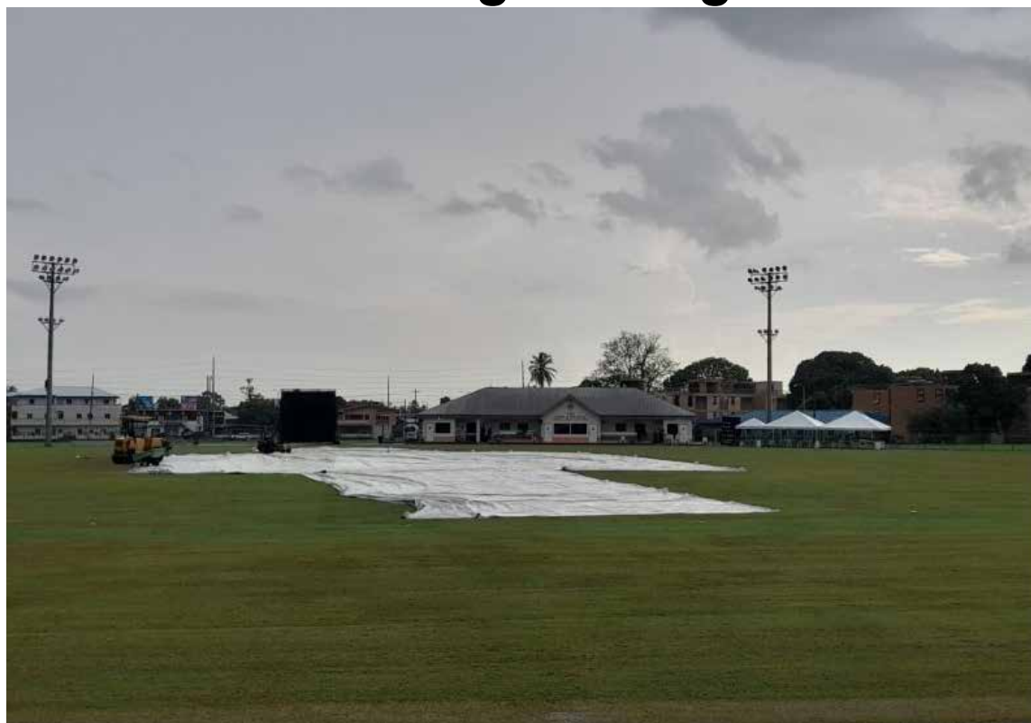
Not a ball was bowled in the CG United Super50 Cup match between the Leeward Islands Hurricane and the CCC at UWI SPEC, St. Augustine, Trinidad, on Saturday, November 4, 2023.

The Leewards, who could still be overtaken, regained the top spot with a four-wicket win against the Barbados Pride via the Duckworth-Lewis-Stern method in their penultimate match of the preliminary round at the Brian Lara