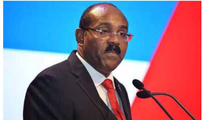
Prime Minister Gaston Browne

However, according to the prime minister, despite the millions spent to improve water production and distri-