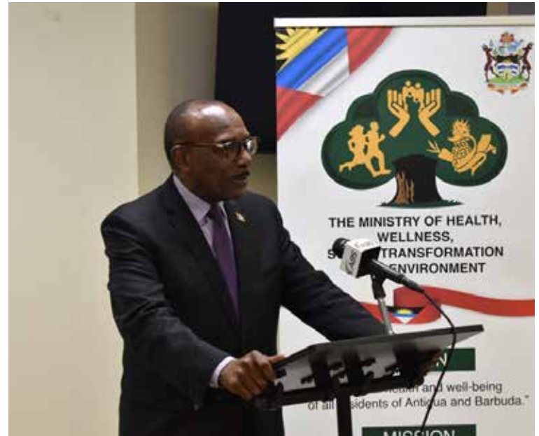
Health Minister Sir Molwyn Joseph thanks CAF for continued support for SLBMC.

The training which lasted 5 days; three virtual and