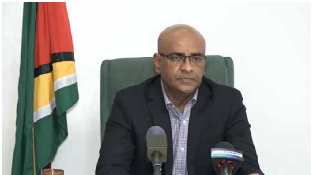
Vice President Bharrat Jagdeo

referendum on December 3 on the Essequibo issue and has promised to provide identification cards to people residing in the area.