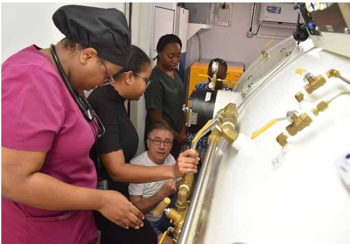
Technicians were very attentive during the training

As a result of this collaboration, Sir Lester Bird Medical Center is now better prepared than ever to handle complex medical cases, ensuring that the people of Antigua receive world-class healthcare services.