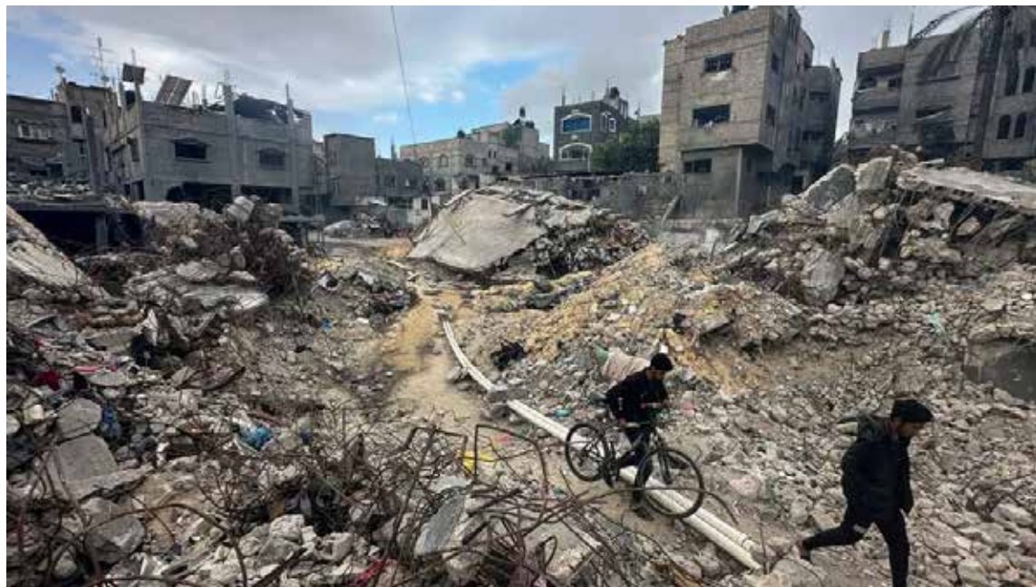
The pause in the fighting is also allowing a big increase in deliveries of aid to war-torn Gaza.

Israeli officials said three-year-old twins and their mother were among them, along with six more