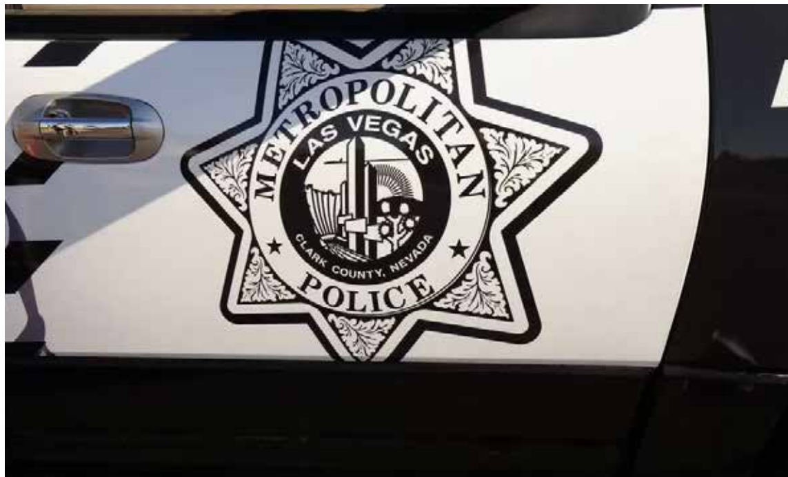
Police say the dispute was over a set of headphones and a vape stolen from the victim or his friends.