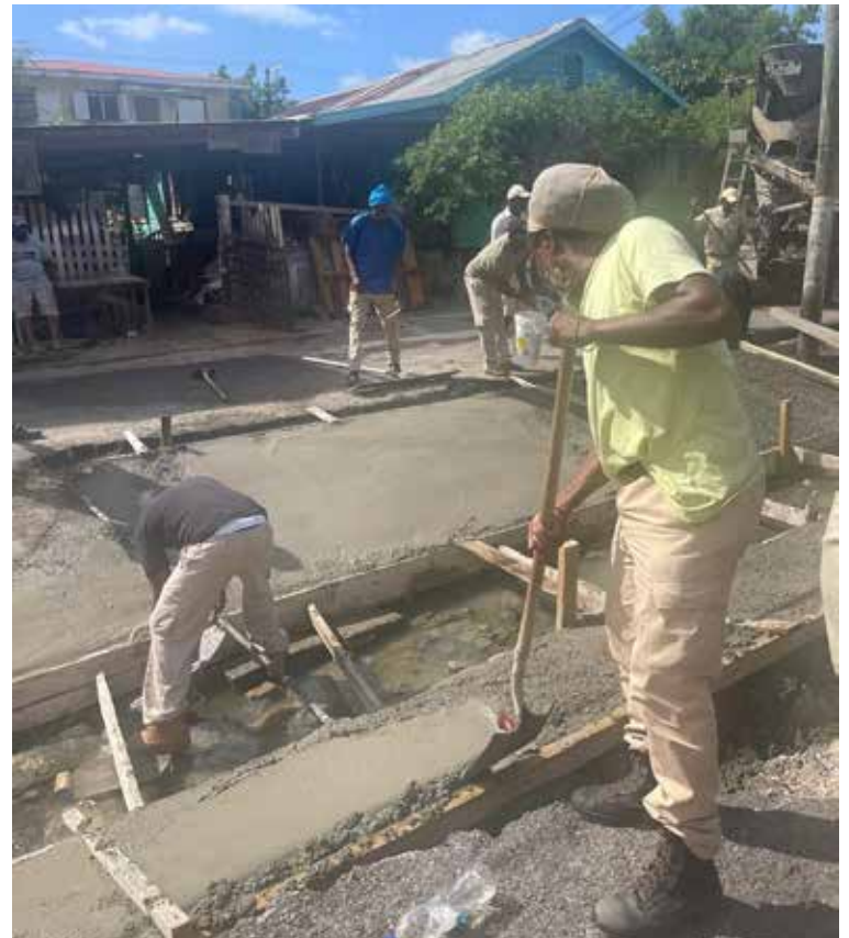
Work being done on Tanner Street.