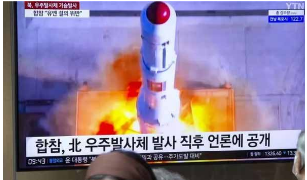
A spy satellite is a coveted prize for North Korean leader Kim Jong Un.

"It is also a very serious matter that greatly concerns