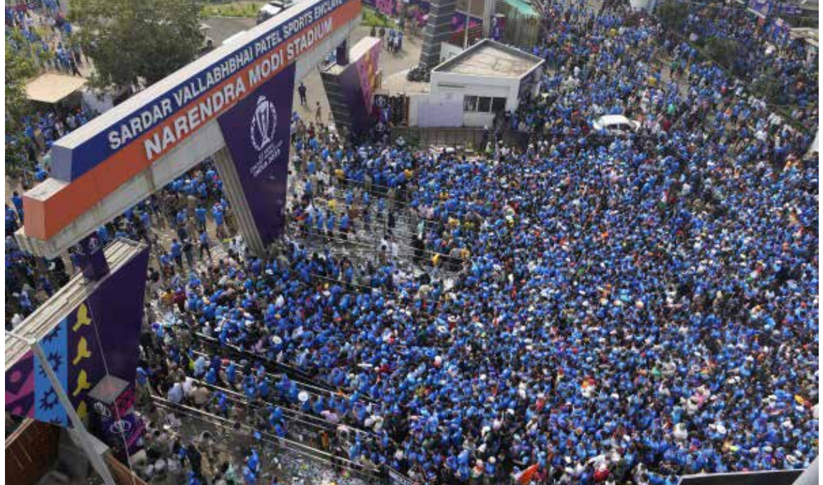
Indian fans arrive to watch the ICC Men's Cricket World Cup final match between Australia and India at Narendra Modi stadium in Ahmedabad, India, Sunday, Nov. 19, 2023.