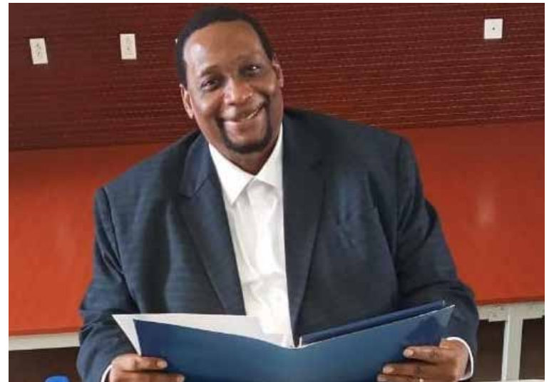
Permanent Secretary in the Ministry of Trade, Ambassador Clarence Pilgrim

“There were discussions held on the Distribution and Price of Goods Cap 138. The price control order is currently under revision, with thirty-six (36) items that are subject to control. Some items are to be removed and others are to be added intending to reduce Non-Communicable Diseases (NDCs) in Antigua and Barbuda. Consultation has been carried out with several focus groups to include a wide cross-section of stakeholders. These consultations are ongoing,” according to