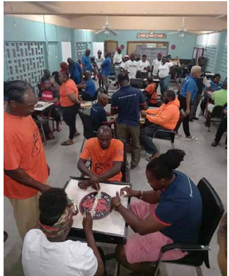
Players participating in the latest ABNDA's three-hand domino competition at its headquarters in Ottos.

Everyday Service Station Double Six prevailed