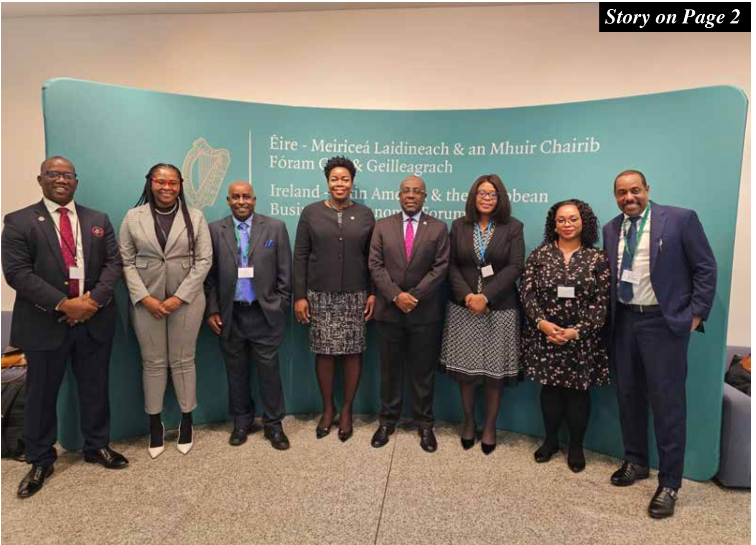
The Antigua and Barbuda delegation to the third Investment and Business Forum in the UK.