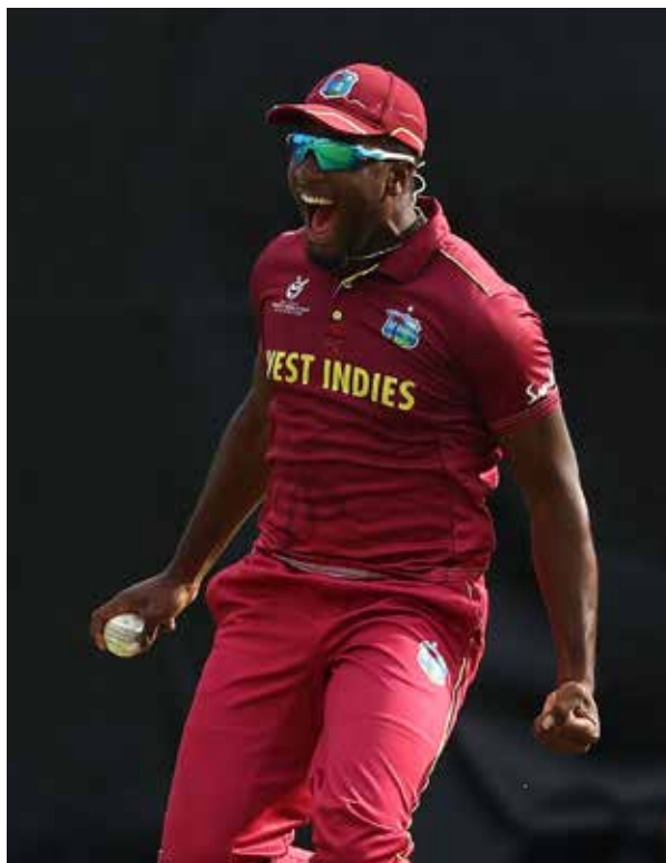
Bowling all-rounder Matthew Forde.

FULL SQUAD: Shai Hope (captain), Alzarri Joseph (vice-captain), Alick Athanaze, Yannic Carriah, Keacy Carty, Roston Chase, Shane Dowrich, Matthew Forde, Shimron Hetmyer, Brandon King, Gudakesh Motie, Kjorn Ottley, Sherfane Rutherford, Romario Shepherd, and Oshane Thomas.