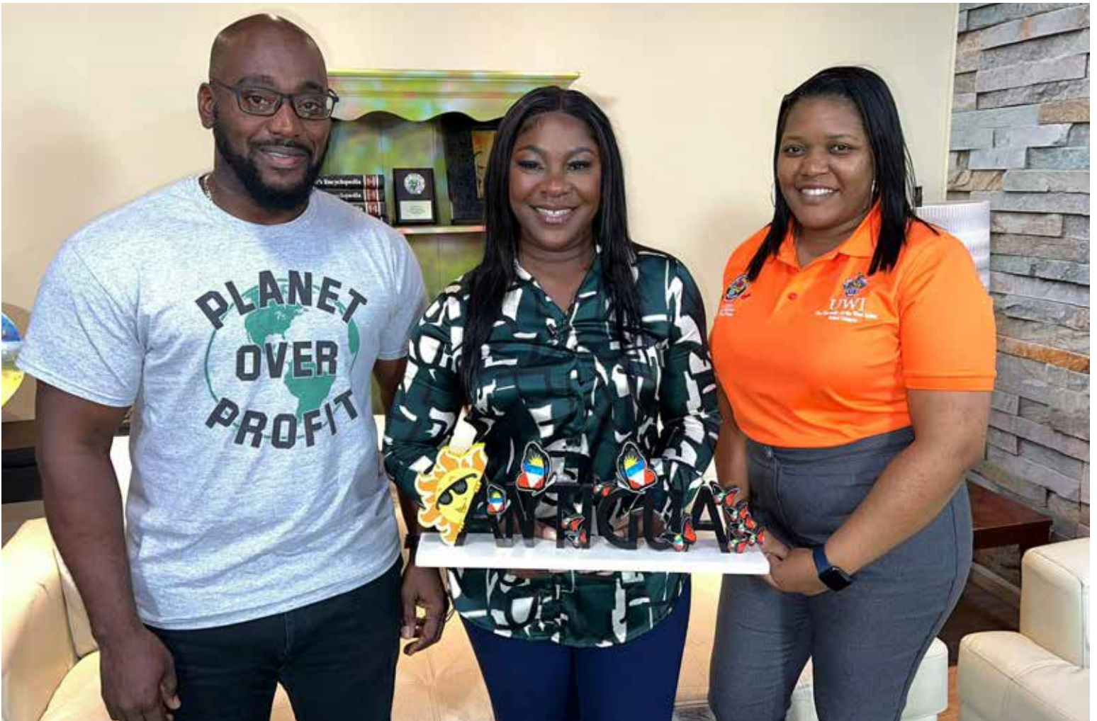
A Week of Activities that featured a series of events designed to foster community spirit, advocate for important causes, has just been concluded by The University of the West Indies Global Campus Antigua Guild of Students. Story on page 6.