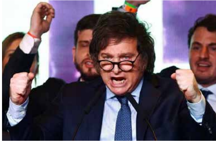
Right-winger Milei won Argentina's presidential poll.