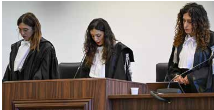
The judges in the case were placed under police protection.

The trial, the largest of its kind since the 1980s, saw judges examine thousands of hours of testimony. Former