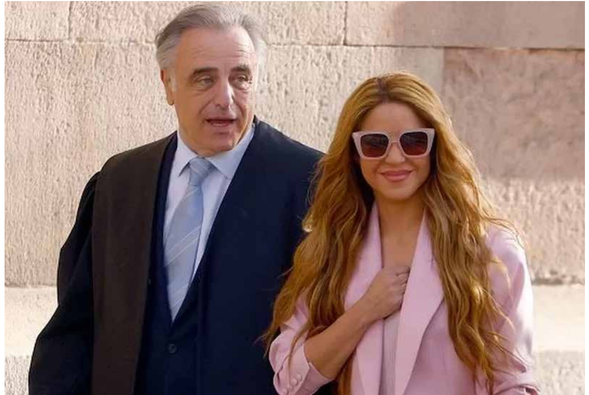
Shakira arriving at court: “I need to move past the stress and emotional toll of the last several years”.

“Unfortunately, and despite these efforts, tax authorities in Spain pursued a case against me as they have against many professional athletes and other high-profile individuals, draining those people’s energy, time, and tranquillity for years at a time.