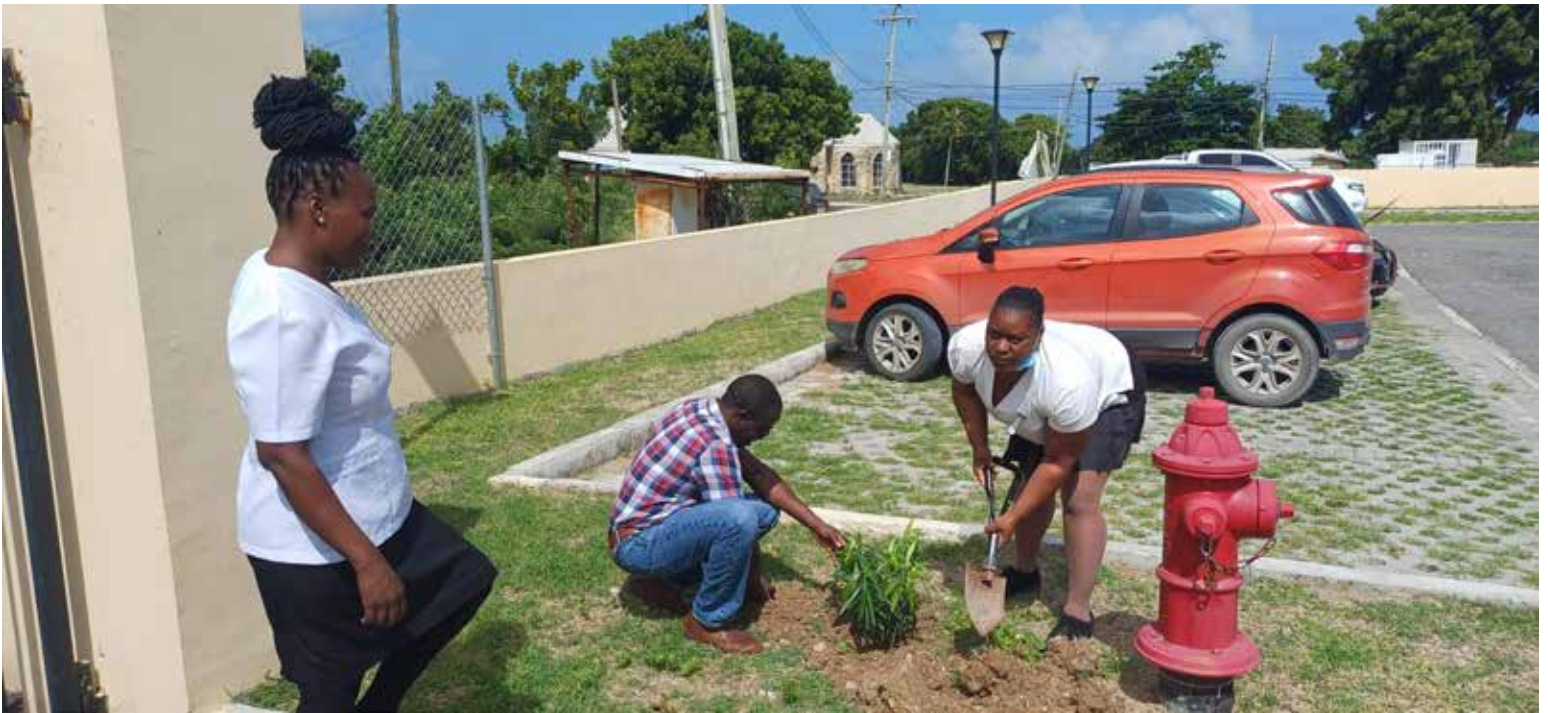
Students had their turn to assist with the tree planting