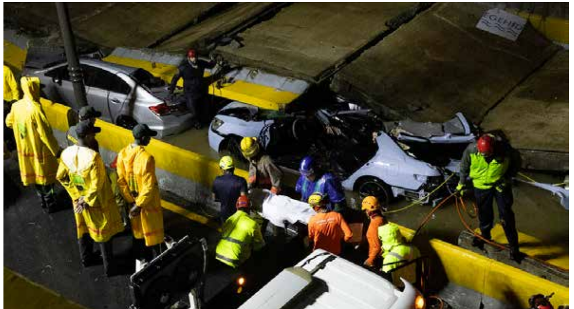
Rescue teams carry a deceased person from the place where a wall collapsed at the entrance of a tunnel in Santo Domingo, Dominican Republic, Saturday, November 18, 2023. According to Civil Defense at least 9 people were killed when the wall fell down due to heavy rains.

Dominican geologist Osiris de León recalled that the first warnings about the wall were made more than two decades ago. He posted a story from December 1999 on X, formerly known as Twitter, in which El Siglo newspaper quoted the college recommending that the wall be rebuilt because it was cracked and "it can fall and cause a tragic accident."