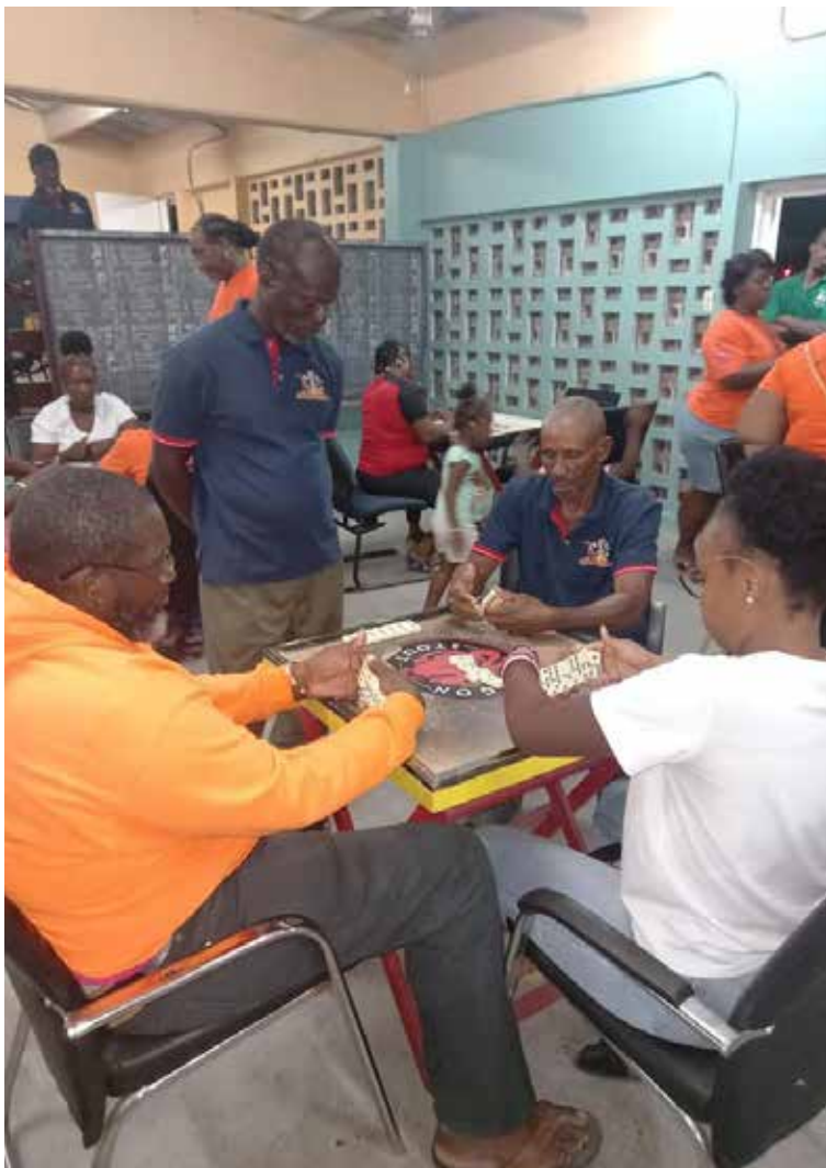
Players participating in the latest ABNDA's three-hand domino competition at its headquarters in Ottos.

The Full Clip A team took an early lead after the opening round of matches in the Antigua and Barbuda National Domino Association's final three-hand competition of the year.