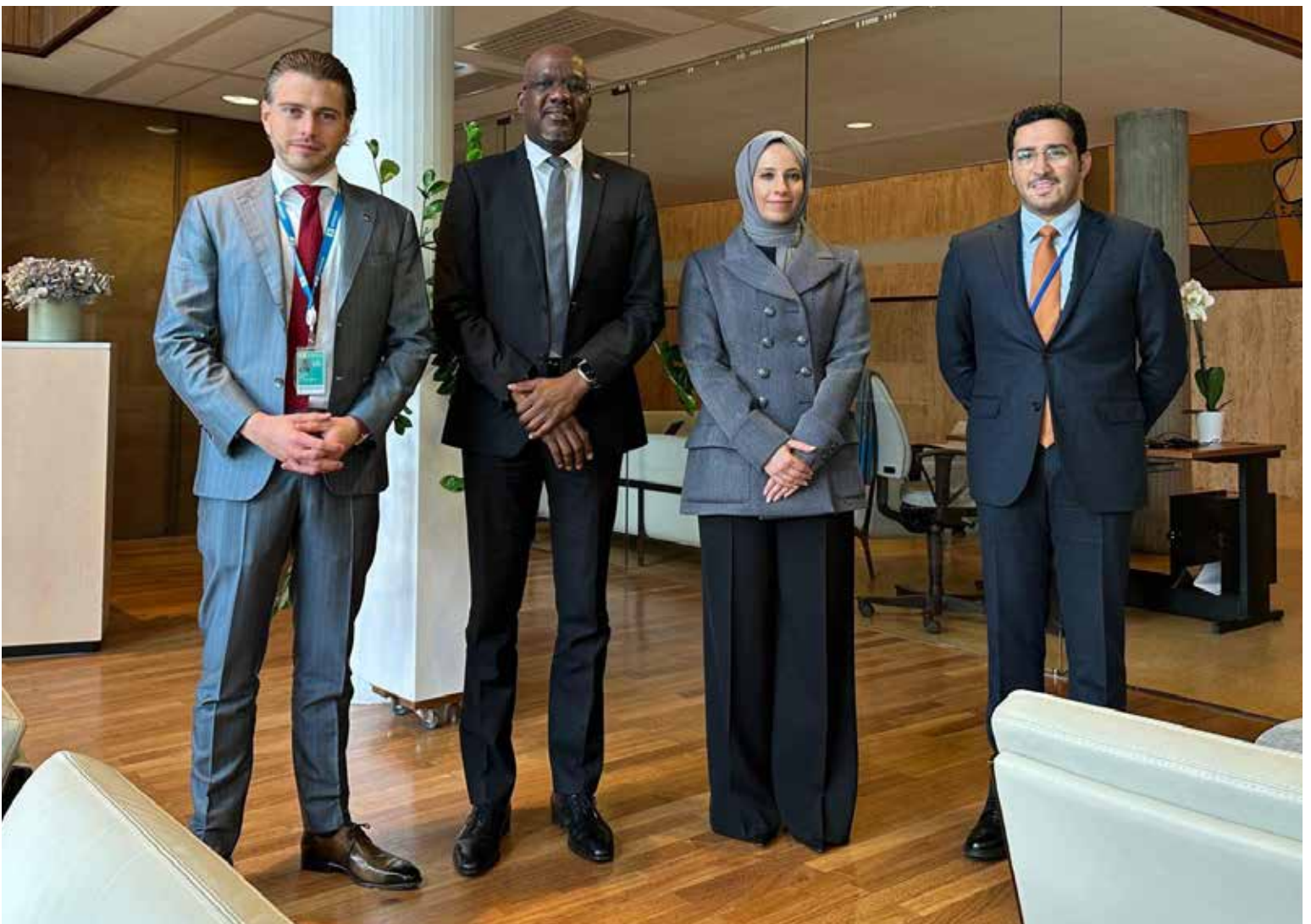
Antigua and Barbuda and the United Arab Emirates have committed to strengthening the bonds of friendship that already exist between the two nations. Story on page 8.