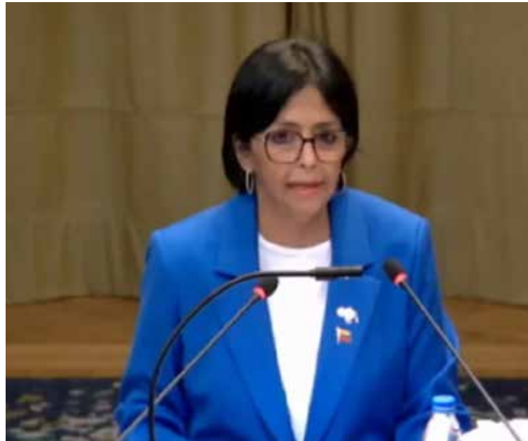
Venezuelan Vice President, Delcy Rodriguez addressing the ICJ.

Venezuelan Vice President, Delcy Rodriguez told the Court that “nothing will prevent