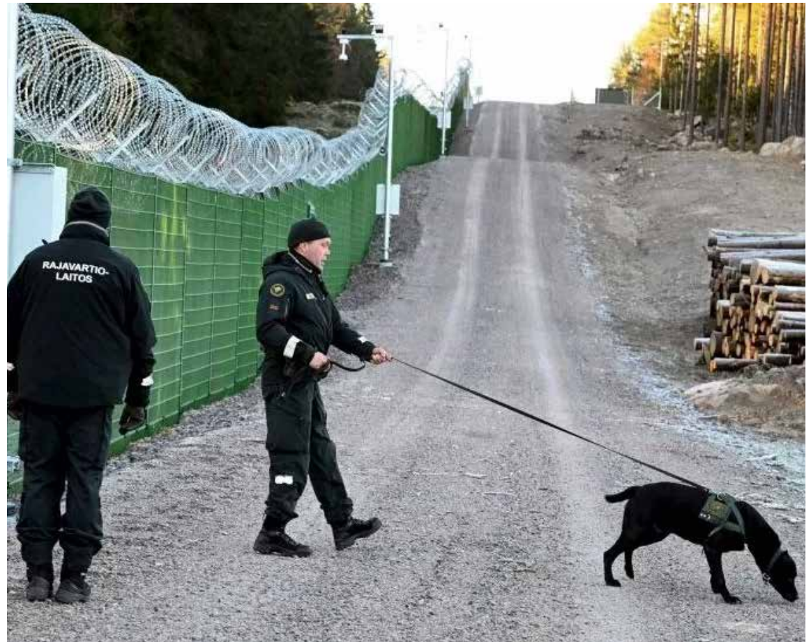
Finnish border guards patrol the frontier with Russia.

Many of the migrants are crossing into Finland