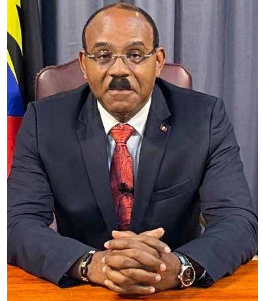
Prime Minister Gaston Browne

Some of the issues down for discussion area deepening CARICOM-Saudi Arabia relations designed to support the sustainability of the Community's development objectives through the coordinated use of financial, technical, and human resources, to promote economic and social development among Member States; World Expo Council for the Arab States of the Gulf (GCC); Agriculture and Food Security,