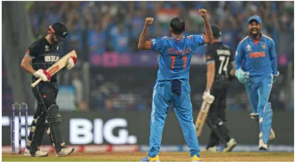
India's Mohammed Shami celebrates the wicket of New Zealand's Daryl Mitchell, left, during the ICC Men's Cricket World Cup first semifinal match between India and New Zealand in Mumbai, India, Wednesday, Nov. 15, 2013.

Ticket Outlets Antigua: Landing Strip, Roti King, Eighteen Plus 1 Restaurant Ticket Outlets Montserrat: Beni's Jewelry, Summer Breeze Restaurant