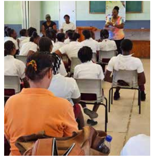
GARD Centre team interacting with Barbuda students

On Friday, the team returns to speaking with students in the nation's schools with visits to the Old Road Primary and the All Saints Secondary School. Saturday's event is a Pop-Up market, taking place at Judgment Square