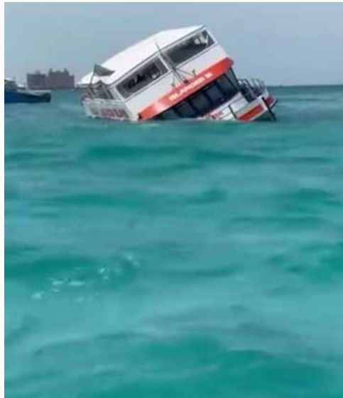
Pleasure craft takes on water en route to Blue Lagoon Island in The Bahamas on November 14, 2023.

the ride the vessel experienced rough seas in the area which resulted in the boat taking on water and becoming submerged in waters just outside Blue Lagoon.