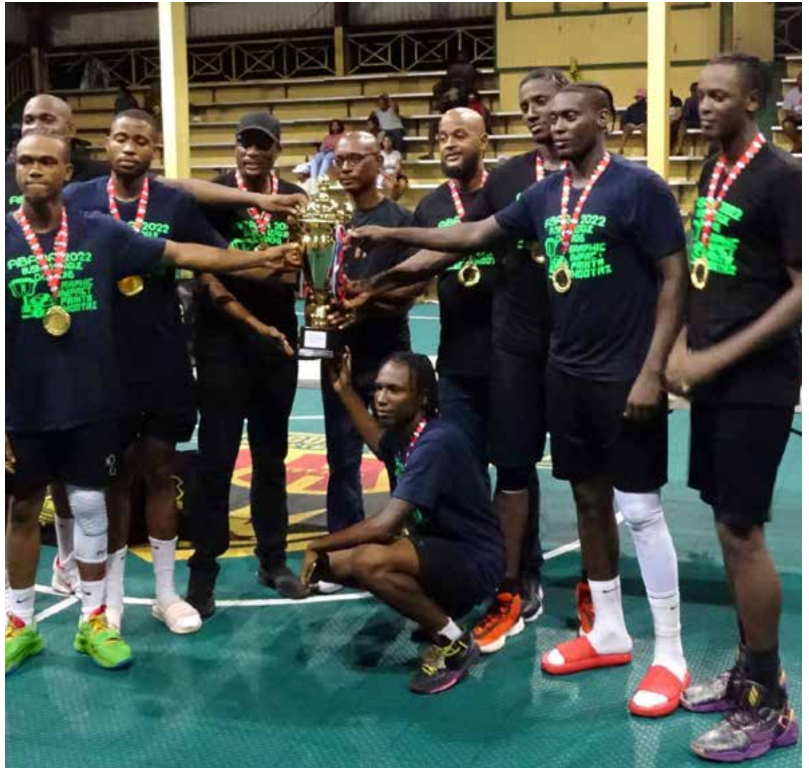
Richie's Shooterz, formerly Graphic Impact Shooters, took a major step in making a successful defense of their playoff title in this year's Cool and Smooth Antigua and Barbuda Basketball Association's (ABBA) Business League competition on Tuesday night.

the Transport Board will face off in the opening game of the best of three business league playoff finals at the JSC Sport Complex at 7:30 this evening (Thursday).