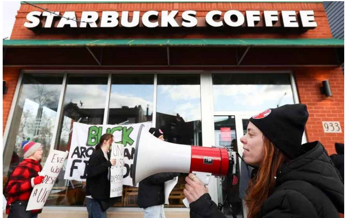
Starbucks Workers United said this year's Red Cup walkout would be bigger than in 2022.

Members are also protesting work conditions, including inadequate staffing