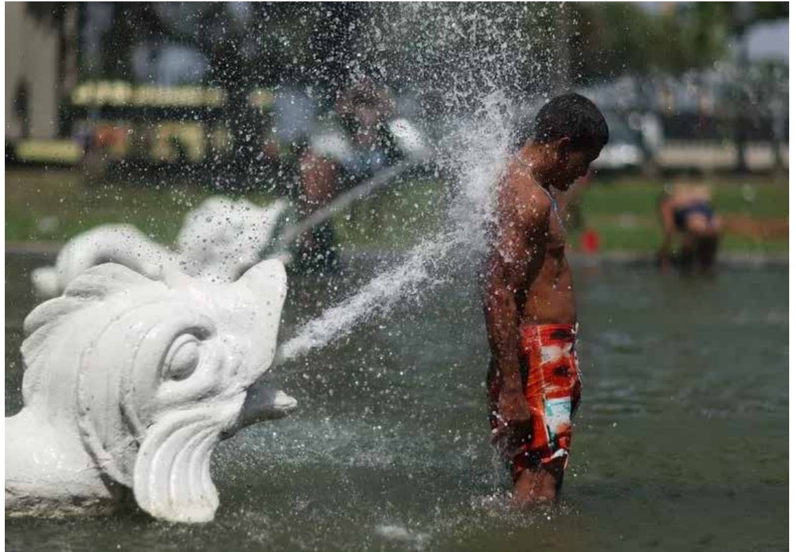
The authorities have attributed the heatwave to the El Niño phenomenon and climate change.

The city of São Paulo saw average temperatures of 37.3C on Tuesday afternoon, the National Institute of Meteorology (Inmet) reported.