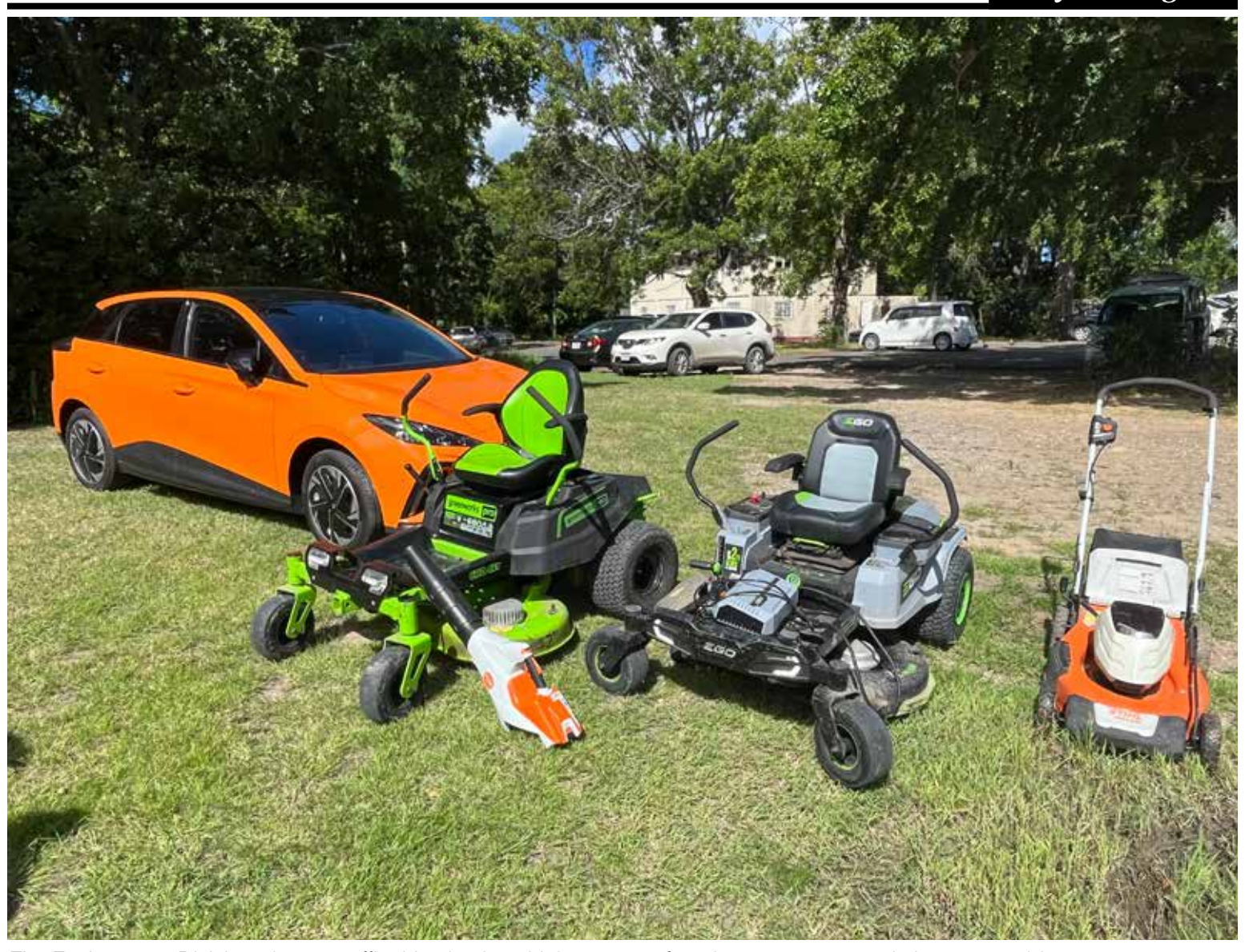
The Environment Division plans to raffle this electic vehicle as part of push to encourage switch to renewable energy sources as Arbor Month 2023 was officially launched. Also on display are a set of electric-powered landscaping tools. Story on page 3.