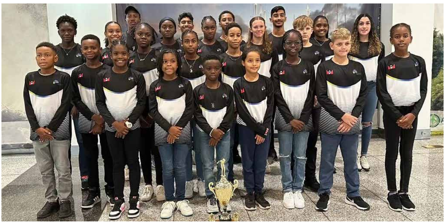
Antiqua and Barbuda retained the Organization of Eastern Caribbean States Swimming Championships in St. Lucia over the weekend.