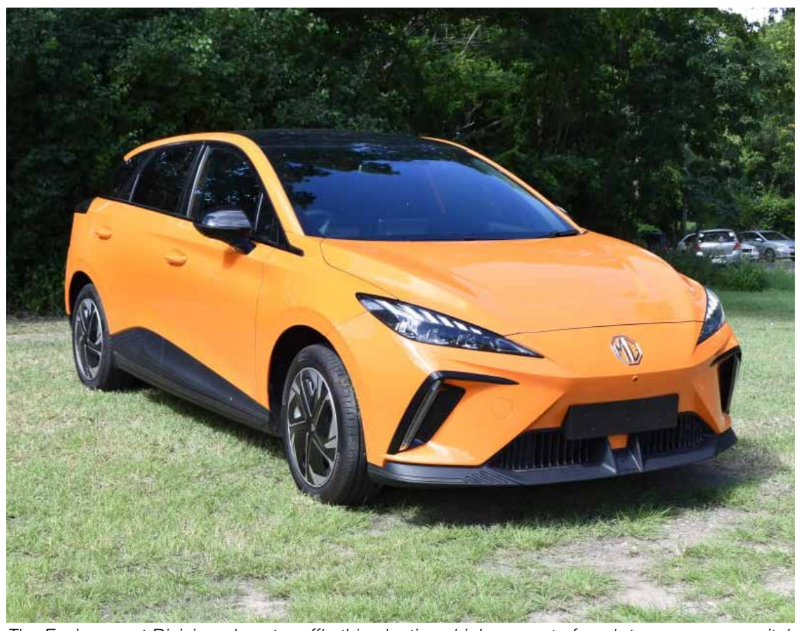
The Environment Division plans to raffle this electic vehicle as part of push to encourage switch to renewable energy sources