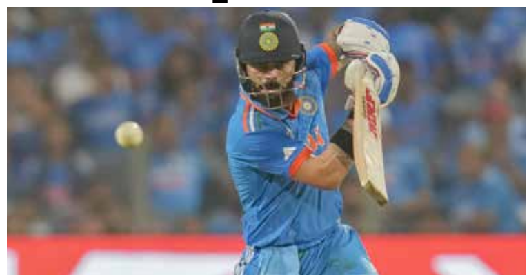
India's Virat Kohli plays a shot during the ICC Men's Cricket World Cup match between Bangladesh and India in Pune, India, Thursday, Oct. 19, 2023.

But injuries took their toll and they only reached the semis after snapping a four-game losing run with a victory over Sri Lanka, a result which all but ended Pakistan's chances.