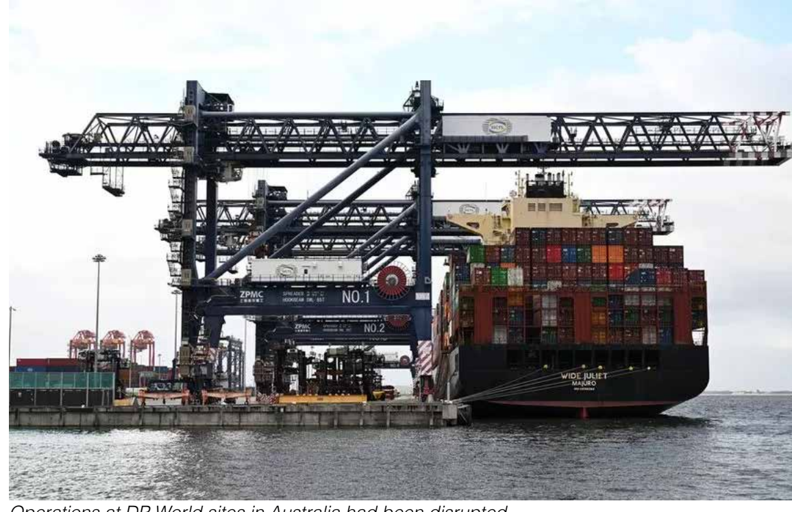
Operations at DP World sites in Australia had been disrupted.

DP World said it halted internet connectivity at its