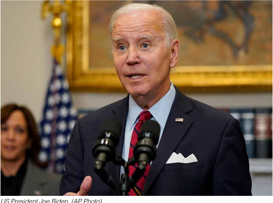
US President Joe Biden.

ready issued a State of Emergency (SoE) on St Croix.