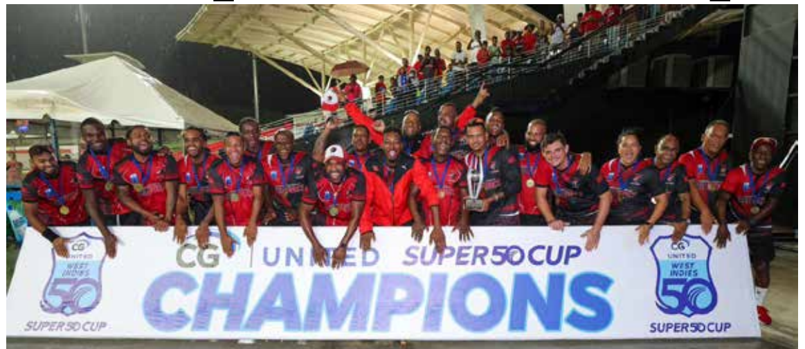
New champions Trinidad and Tobago Red Force celebrate with their trophy after winning the 2023 CG United Super50 Cup title at the Brian Lara Cricket Academy in Tarouba, Trinidad, on Saturday, November 11, 2023.

The Leewards, who have depended heavily on