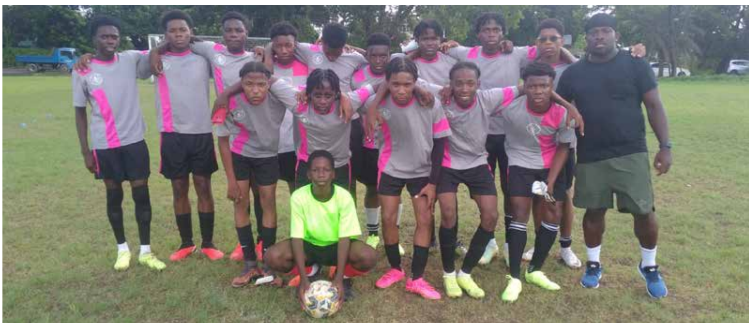
The Princess Margaret School Under-20 Boys Division football team. (File photo)