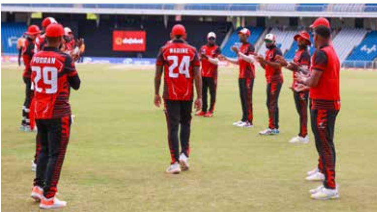
Off-spinner Sunil Narine is given a guard of honour by teammates of the Trinidad and Tobago Red Force during the final of the CG United Super50 Cup against the Leeward Islands Hurricane at the Brian Lara Cricket Academy in Tarouba, Trinidad, on Saturday, November 11, 2023. It was Narine's last regional match for Trinidad and Tobago after announcing his retirement from International and List A cricket on Sunday, November 5, 2023.