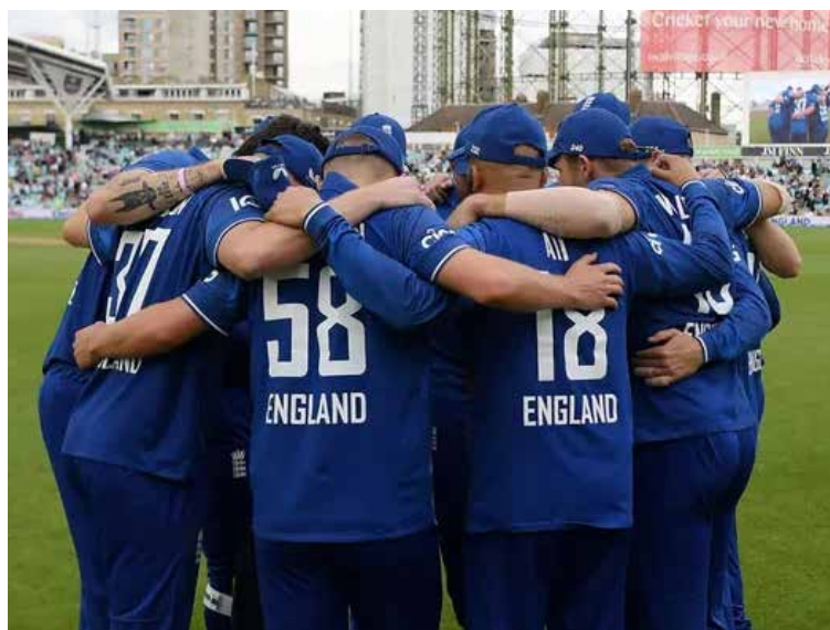
England named new-look squads for next month's white-ball tour of the West Indies

Jonny Bairstow, Joe Root and Mark Wood have been rested ahead of Janu-