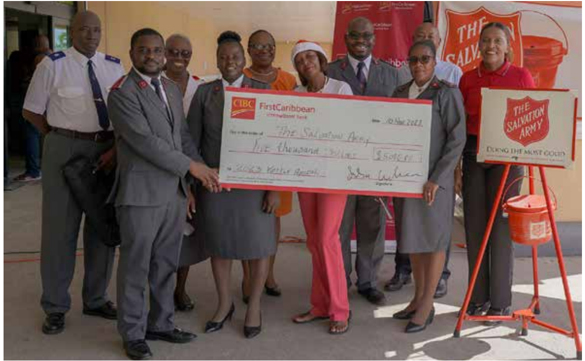
CIBC FCIA Donates $5000.00 to Salvation Army

He said the monies raised go towards those members of society who require assistance, as the