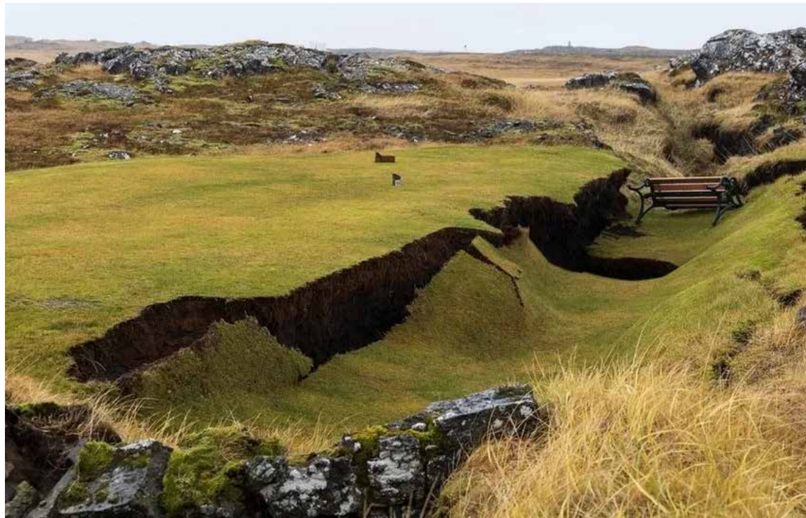
Earth tremors have caused the ground to slip at this golf course and elsewhere in Grindavík.

trated in Iceland’s Reykjanes Peninsula, which had remained dormant to volcanic activity for 800 years before a 2021 eruption.