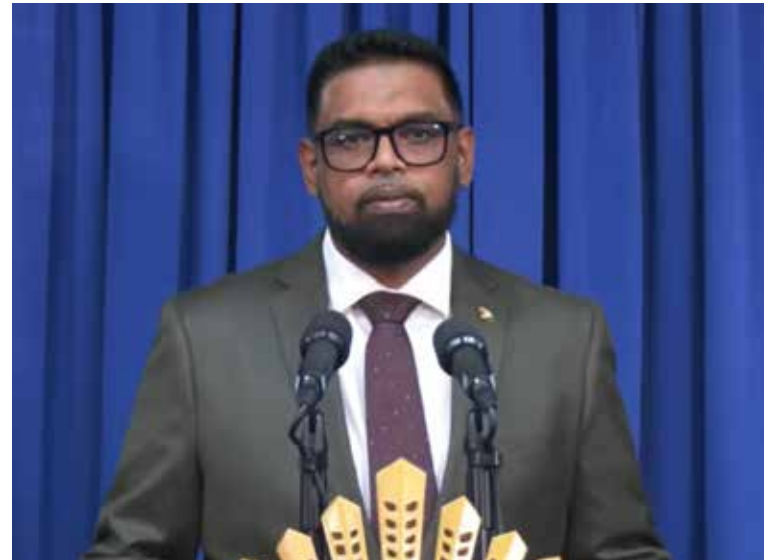
President Dr Mohamed Irfaan Ali.

Meanwhile, the salaries of Community Infrastructure Improvement Project (CIIP) Community En-