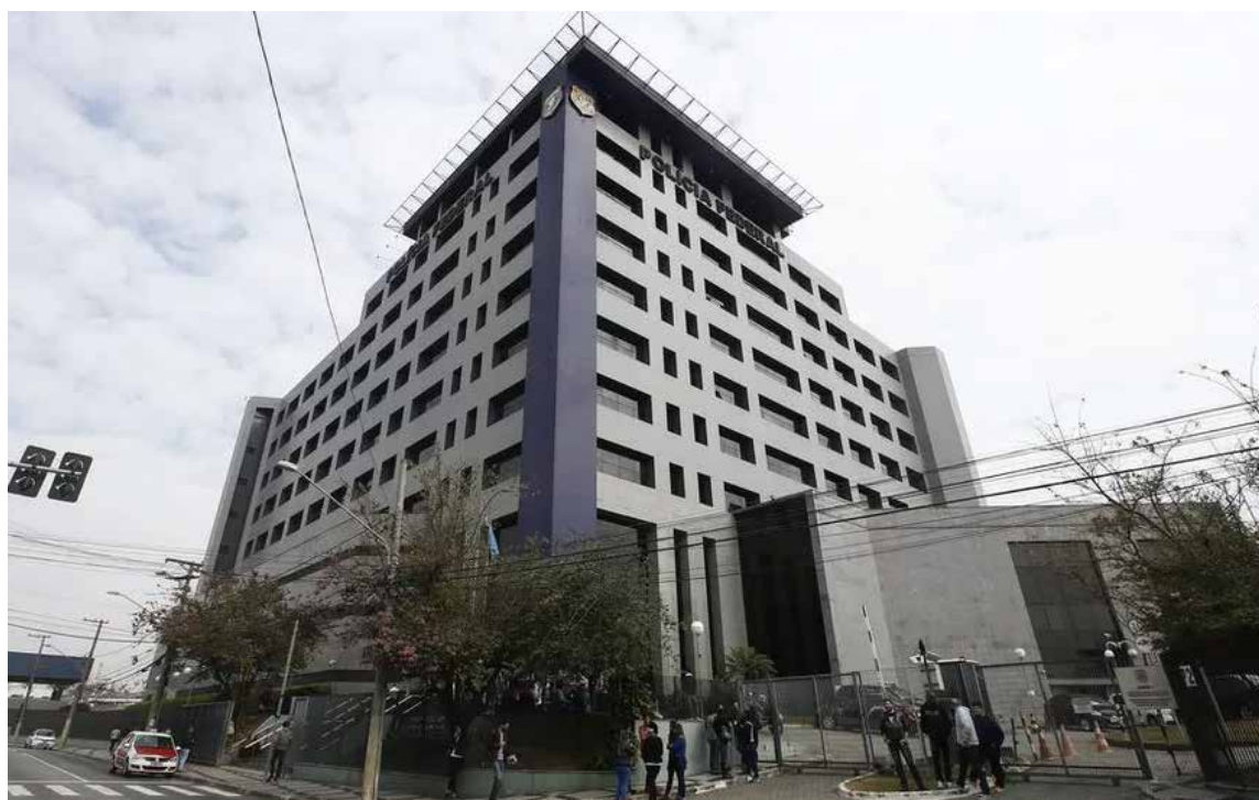
According to Brazilian authorities, two men were arrested in São Paulo who appear to have links to the Lebanon-based Islamist group Hezbollah.

Like Hamas in the Gaza Strip, it is considered a ter-