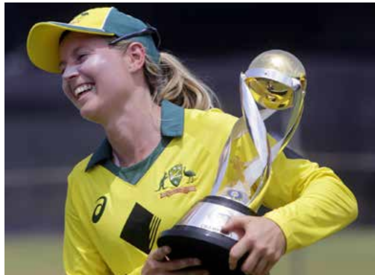
Australia's captain Meg Lanning with the trophy smiles after winning the final of Women's cricket T20 Triangular Series in Mumbai, India, Saturday, March. 31, 2018. Australia women's cricket captain Lanning has announced her international retirement on Thursday, November 9, 2023.

captain in 2014, becoming Australia’s youngest ever skipper at just 21. She led Australia in 182 matches, more than any other women’s player. She leaves behind one of Australia’s most successful international teams.