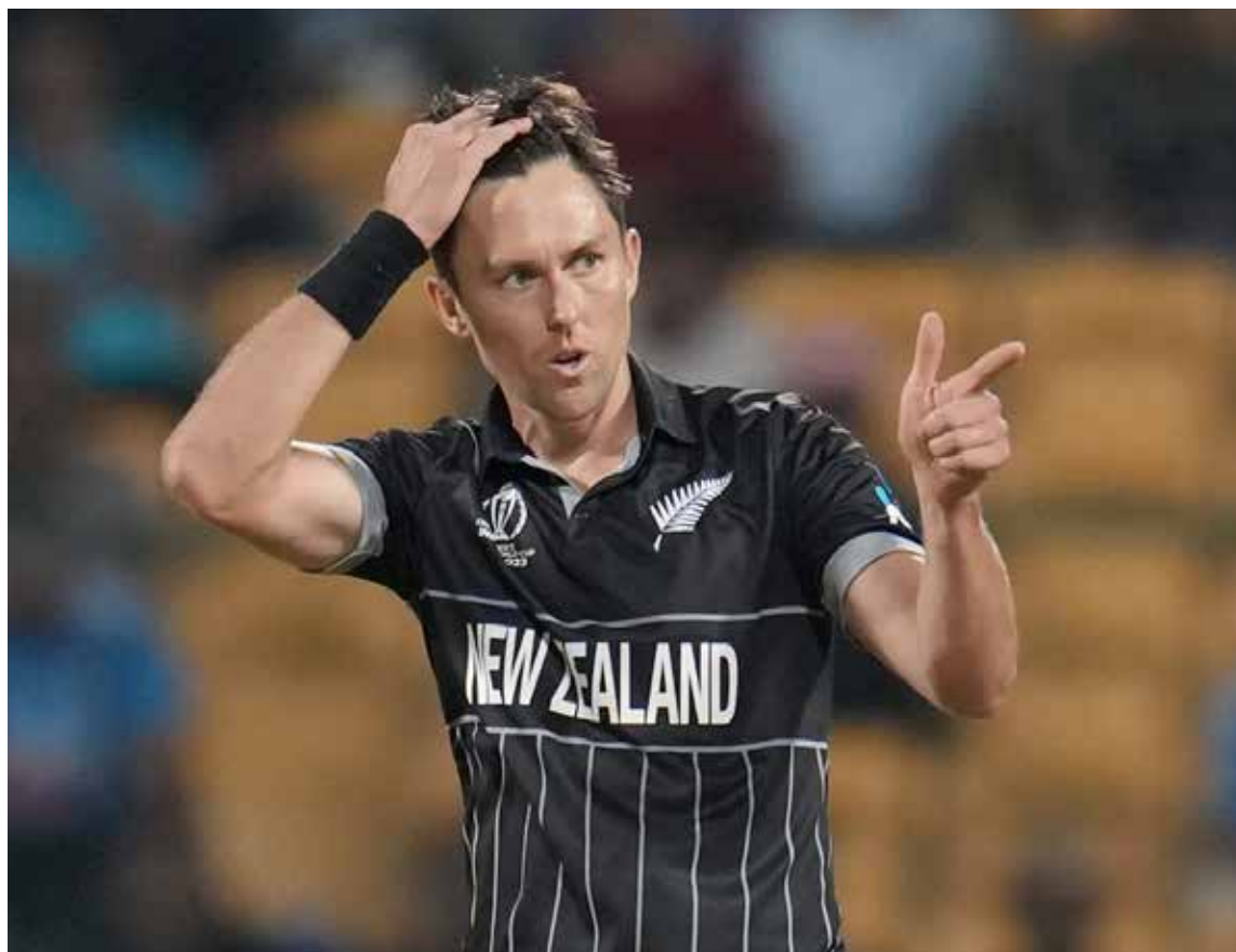
New Zealand's Trent Boult reacts after a delivery during the ICC Men's Cricket World Cup match between New Zealand and Sri Lanka in Bengaluru, India, Thursday, Nov. 9, 2023.

"Really good performance," said New Zealand skipper Kane Williamson. "The early wickets and spin was a challenge through those middle overs. The pitch really slowed down later.