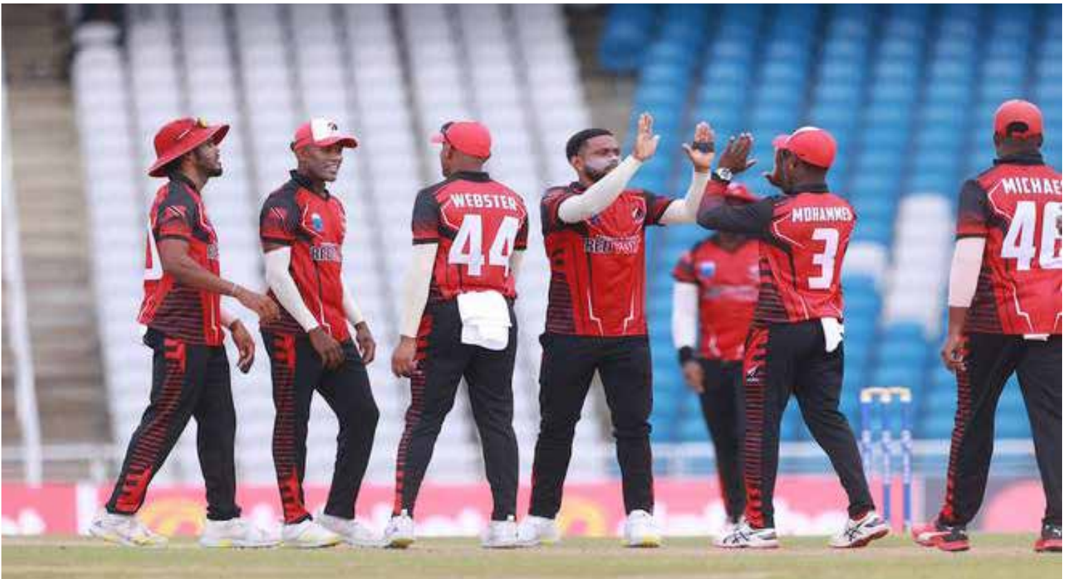
The players of the Trinidad and Tobago Red Force celebrate after capturing a wicket during the CG United Super50 Cup semifinal against Guyana Harpy Eagles at the Brian Lara Cricket Academy in Tarouba, Trinidad, on Wednesday, November 8, 2023.