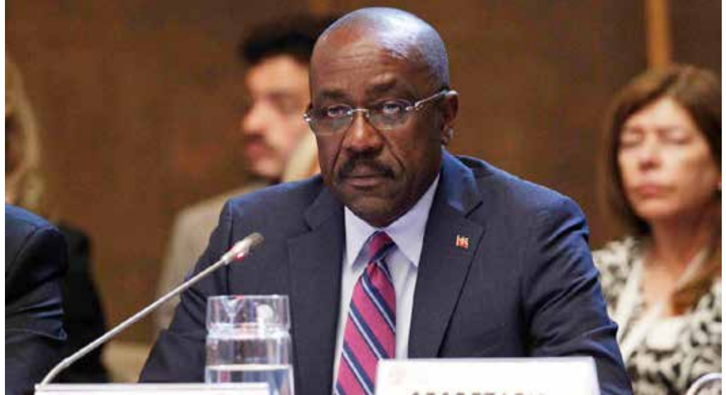
Foreign Affairs Minister, E.P. Chet Greene conflict between Israel and the Palestinian Group.

On Sunday, the United Nations Security Council convened an emergency meeting to discuss the ongoing