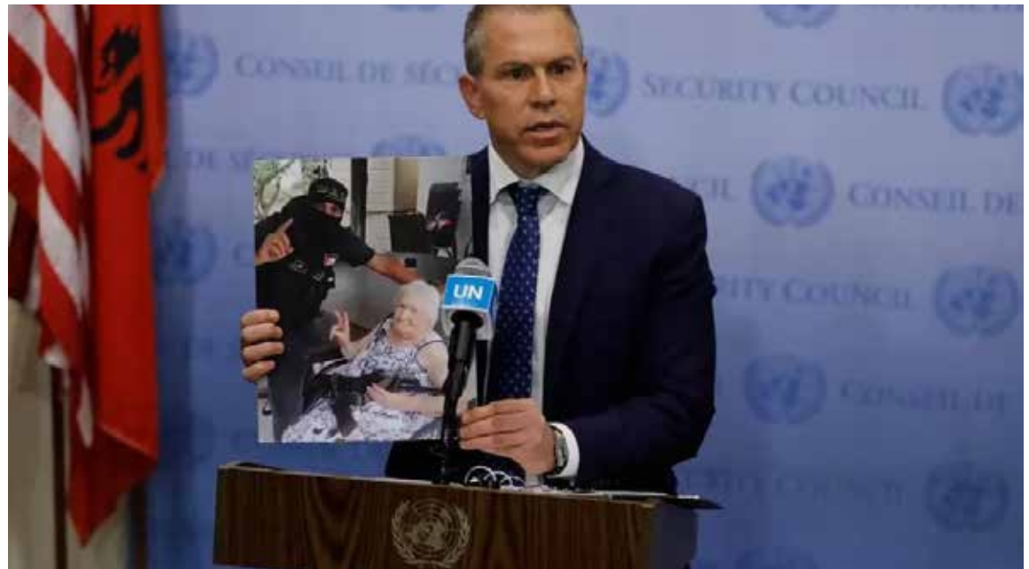
Israel’s UN ambassador holds up a picture of an Israeli woman captured by Hamas.

Iran’s President Ebrahim Raisi has expressed support for the Hamas attack, saying Israel needed to be held to account for endangering the