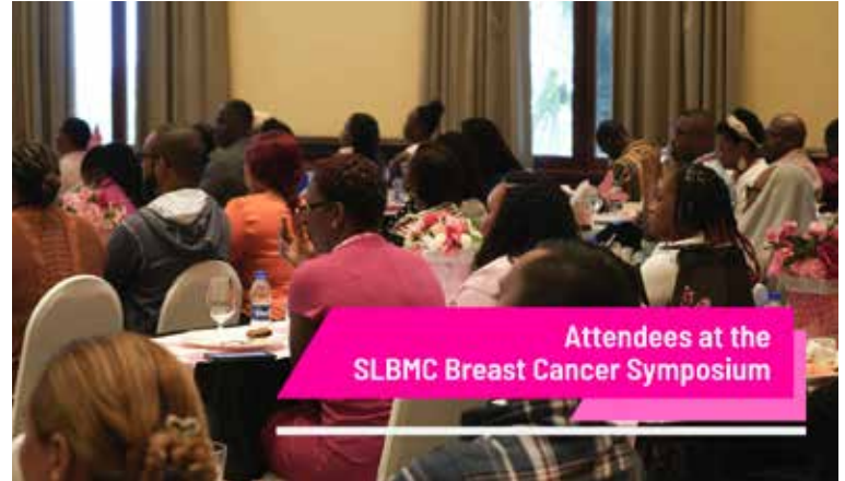
Attendees at the SLBMC Breast Cancer Symposium

Hearing from some of the brightest minds across the field – including researchers, oncologists, surgeons, and patient advocates – attendees considered and discussed the latest advances and emerging practices and how these may impact their areas of expertise.