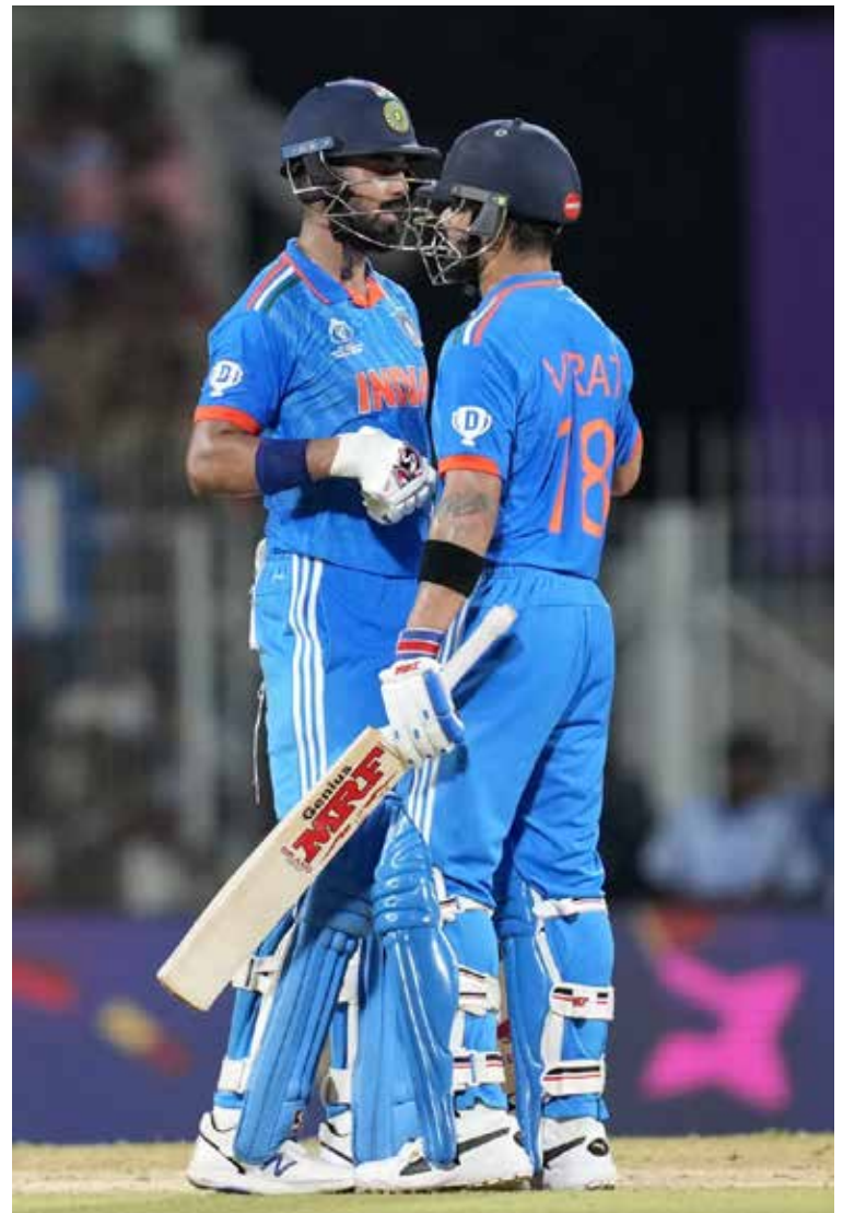
India's Virat Kohli, right, greets his batting partner KL Rahul after he scored fifty runs during the ICC Cricket World Cup match between India and Australia in Chennai, India, Sunday, Oct. 8, 2023.

India's poor start became a veritable nightmare