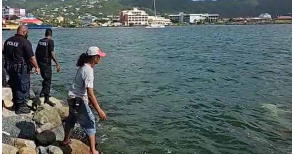
Screengrab from JTV Channel 55 Facebook Live video of the search earlier today.

After a period of effort, they noticed an unresponsive male inside the vehicle.