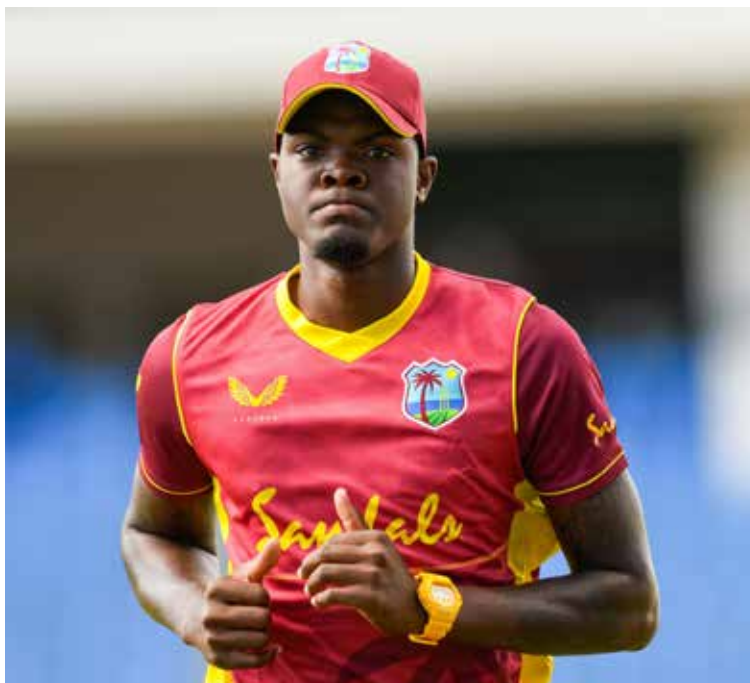
West Indies fast bowler Alzarri Joseph