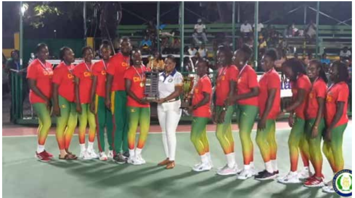
The Grenada team is presented with their awards for winning the Eastern Caribbean Central Bank International Netball Series at the YMCA Sports Complex on Saturday night.

Only teams from the Commonwealth of Dominica, Grenada, Montserrat, St.