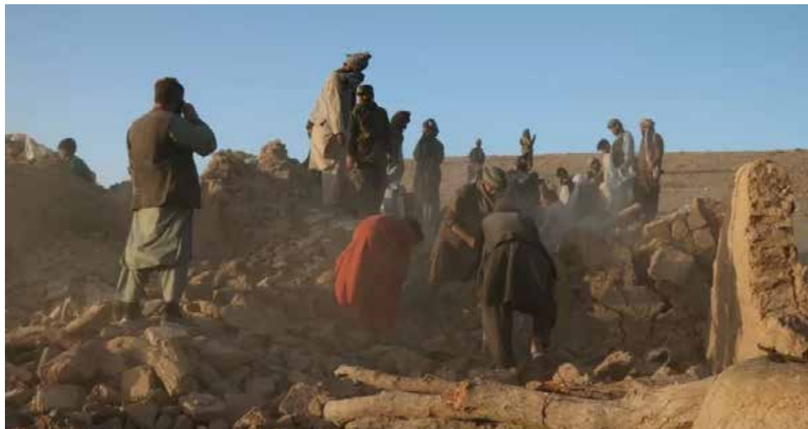
Villagers are using their bare hands to pull people from what is left of their mud houses.

Villagers have used shovels and their hands to pull survivors from the