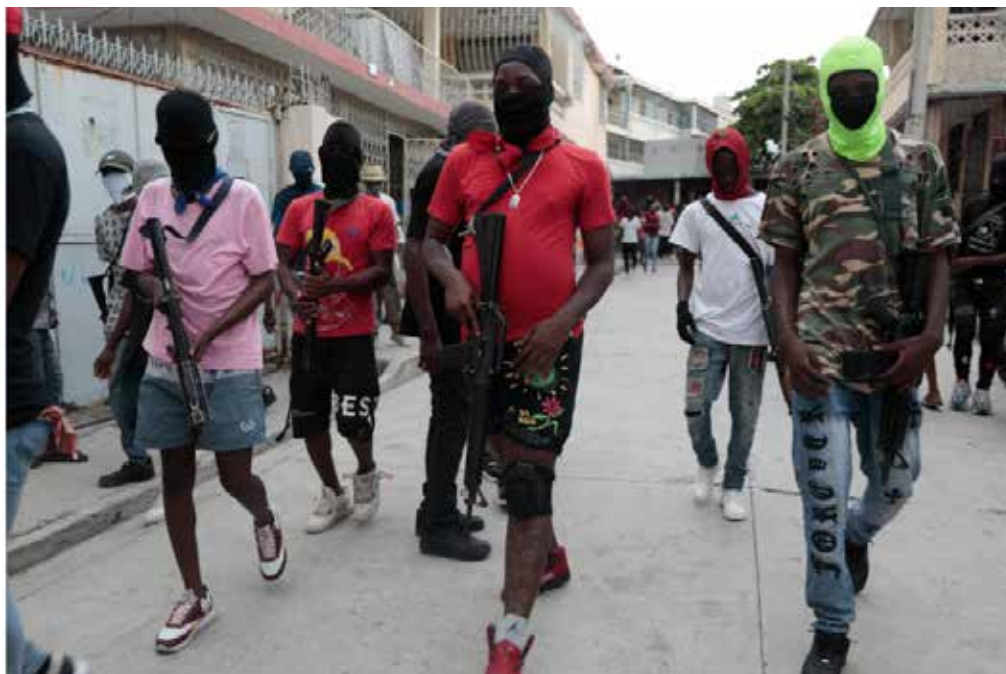
Armed members of "G9 and Family" march in a protest against Haitian Prime Minister Ariel Henry in Port-au-Prince, Haiti, Tuesday, September 19, 2023.

required to inform the council on the mission's goals, rules of engagement, financial needs and other matters before a full deployment.