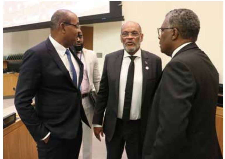
Prime Minister the Hon. Gaston Browne in discussion with Haitian President Ariel Henry (centre) during a meeting of the Ad Hoc Advisory Group on Haiti at last week’s UN General Assembly.

Antigua and Barbuda also became one of the first signatories to the BBNJ Treaty, and the presence of Health