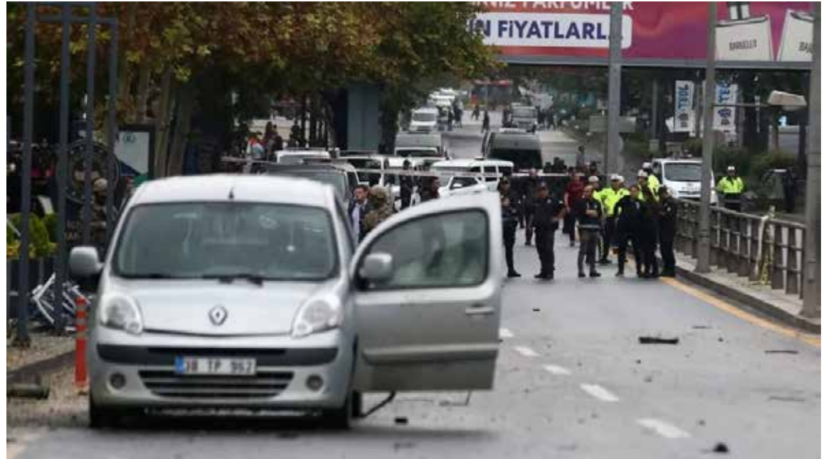
The explosion happened just hours before parliament was due to reconvene.

They were carried out following an explosion on Ankara’s Ataturk Boulevard that happened hours before