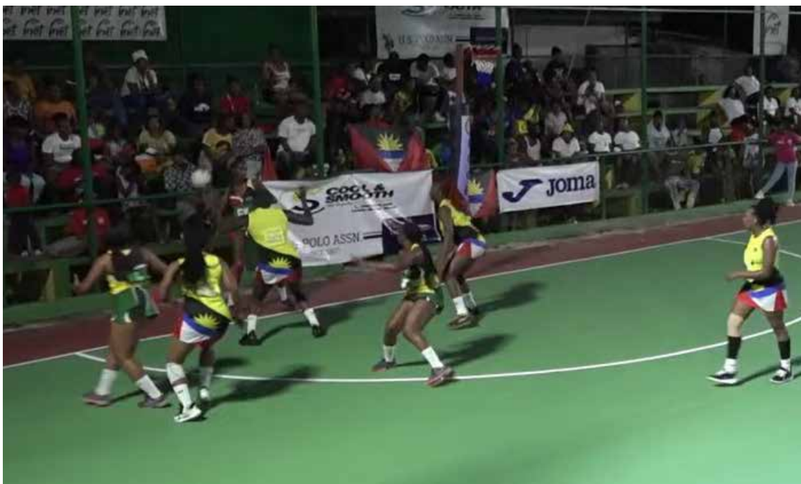
Players of Antigua and Barbuda compete against Dominica in the ECCB International Netball Series at the YMCA Sports Complex on Saturday, September 30, 2023.

The tournament officially commenced with a parade of teams and an opening ceremony earlier on Saturday. The guest team, Barbados, is the other participant in the annual competition.