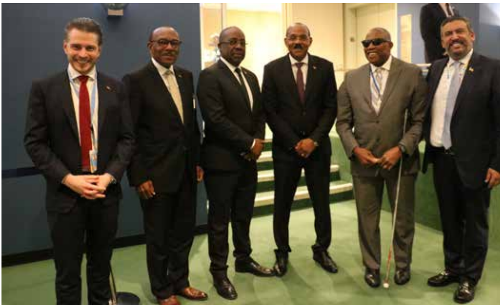
Flanking Prime Minister Browne, Minister of Health Sir Molwyn Joseph and Foreign Affairs Minister EP Chet Greene are Permanent Representative to the United Nations in Geneva Boris Latour (far left) and Resident Ambassador of Antigua and Barbuda to Jordan Sami al Mufleh (far right).

The nation scored a major achievement with its execution of two major side-events which resulted in significant outcomes and recommendations. The International Finance and Energy Transition Diplomacy held on September 18 garnered feedback from high-ranking SIDS and non-SIDS officials who discussed and made recommendations for the energy transition in SIDS within the scope of the next 10-year agenda to be adopted in Antigua and Barbuda, at the