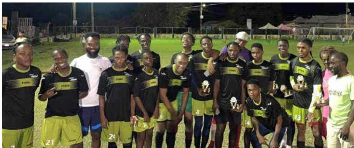
The Garden Stars team and officials celebrate with their trophies after the presentation of awards to conclude the Warriors Cup football competition at the Radio Range playing field in Ottos on Thursday, September 28, 2023.

"A win is always comforting and always welcomed. We were working on some stuff in terms of going into the premier league. We got to work on our shape, positioning, and