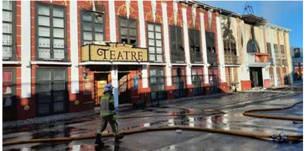
The fire spread from Fonda Milagros to the next door Teatre club.

those who died were at La Fonda, but added 14 people were still unaccounted for. They warned the number of deaths would probably rise.