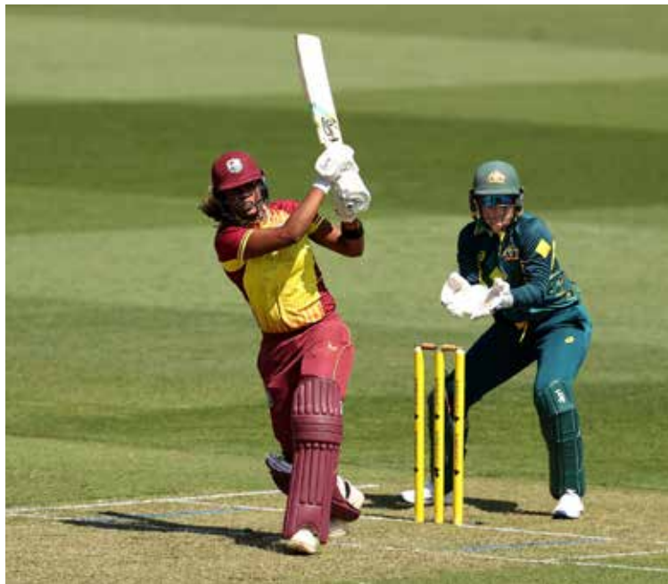
West Indies Hayley Matthews, left, plays an attacking shot during the first T20 International against Australia Women at the North Sydney Oval in Sydney, Australia, October 1, 2023.

The West Indies, riding on Matthews' brilliance, posted a defensible total. However, the opposition seemed unfazed by the challenge and chased down the target in 13.2 overs, losing only two wickets in the pro-