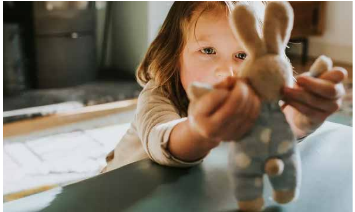
There is evidence that intervening very early on may help stop conditions arising or worsening.