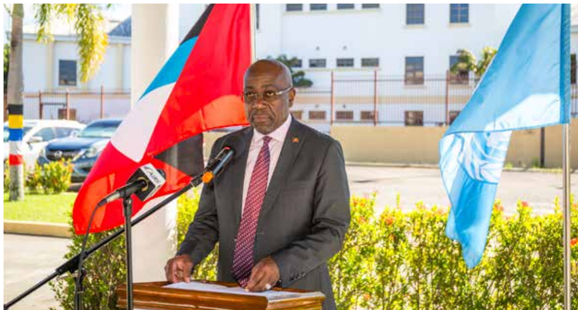
Foreign Affairs Minister, E.P. Chet Greene

He drew attention to the call from the UN Secretary-General for a ceasefire and peace among the countries involved in the current Ukraine, Syria, and Israel/Palestine conflicts. This, he noted, reflects how necessary it is for an institution like the UN to be part of the