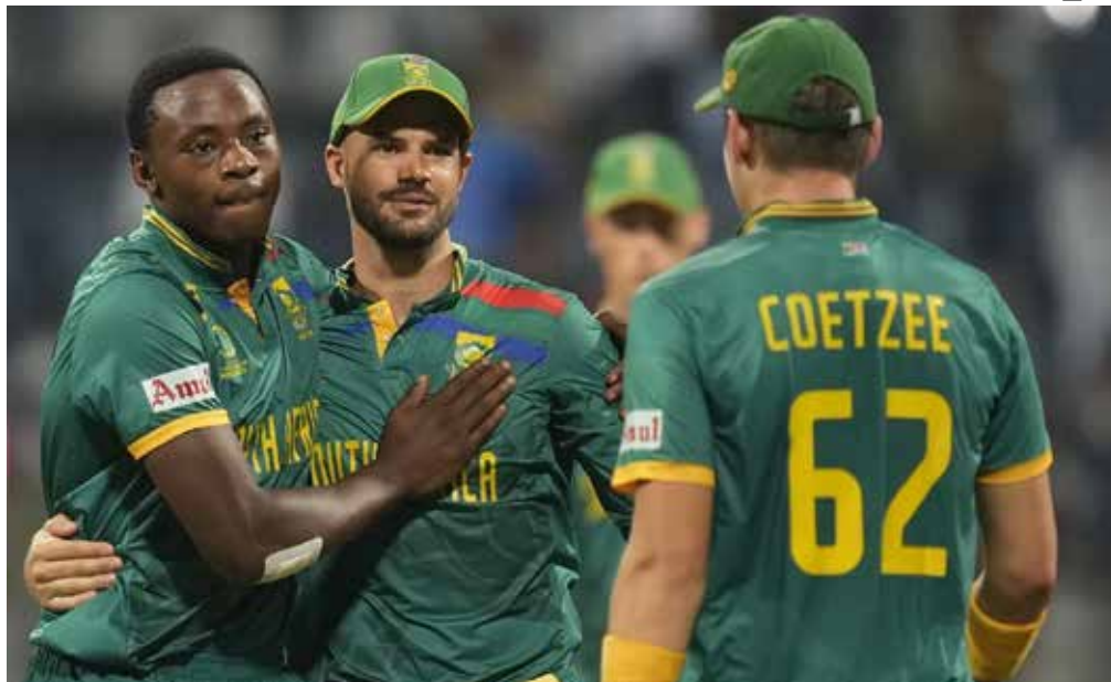
South Africa's Kagiso Rabada, first left, celebrates the wicket of Bangladesh's Hasan Mahmud during the ICC Men's Cricket World Cup match between Bangladesh and South Africa in Mumbai, India, Tuesday, Oct. 24, 2023.

De Kock combined with Markram (60) in a 131-run stand to steady the innings before he and Heinrich Klaasen tore apart the Bangladesh attack,