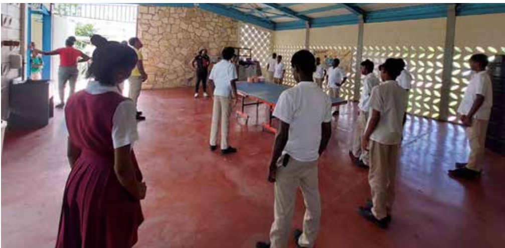
Students participate in a table tennis training session at Pares Secondary School.

Due to the passage of Tropical cont'd on pg 23