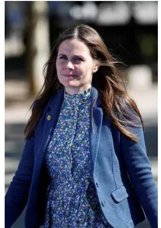
Katrín Jakobsdóttir will not work in protest at the gender pay gap and gender-based violence.

Iceland has been ranked the best country in the world for gender