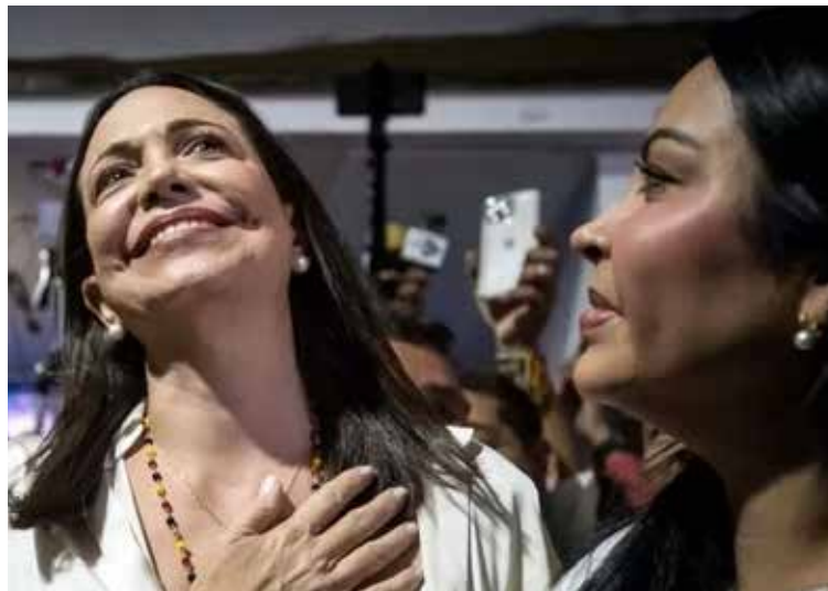
María Corina Machado thanked her supporters as the results came in.

The US last week eased some of the sanctions it had imposed on Venezuela's oil and gas industry following a deal between Venezuelan government and opposition representatives to have the 2024 election monitored by international observers.