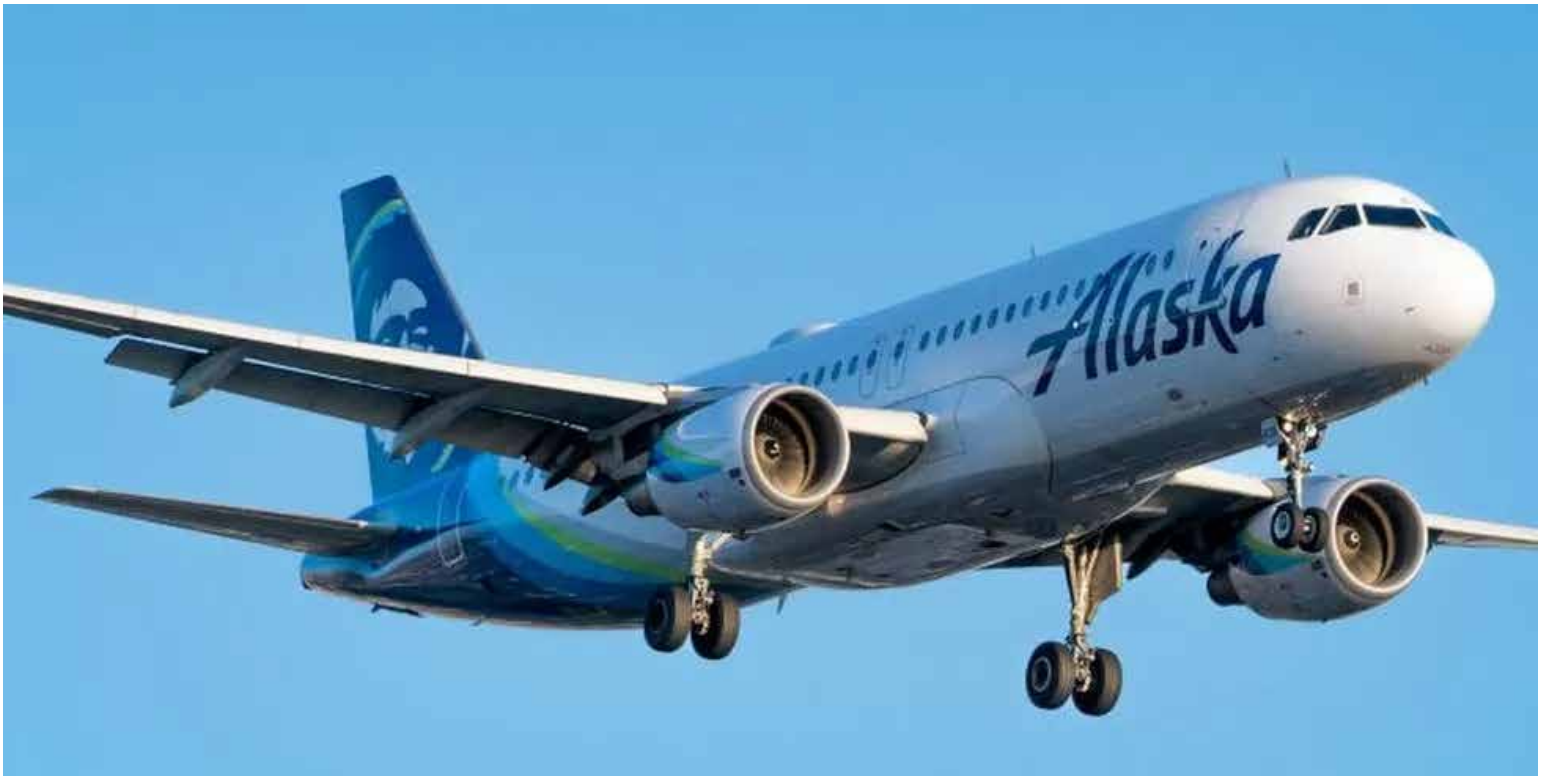
A file image of an Alaska Airlines flight.