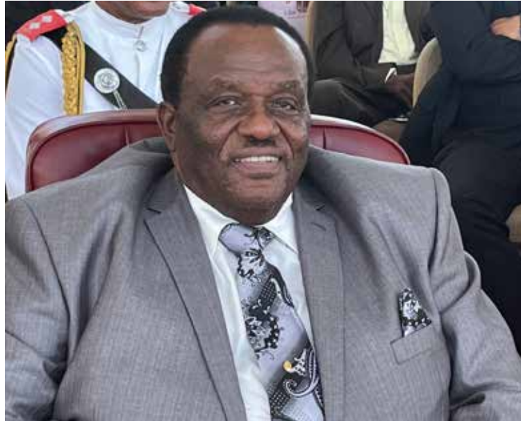
Attorney General, Steadroy Benjamin

Accordingly, he said that as the Attorney General, it