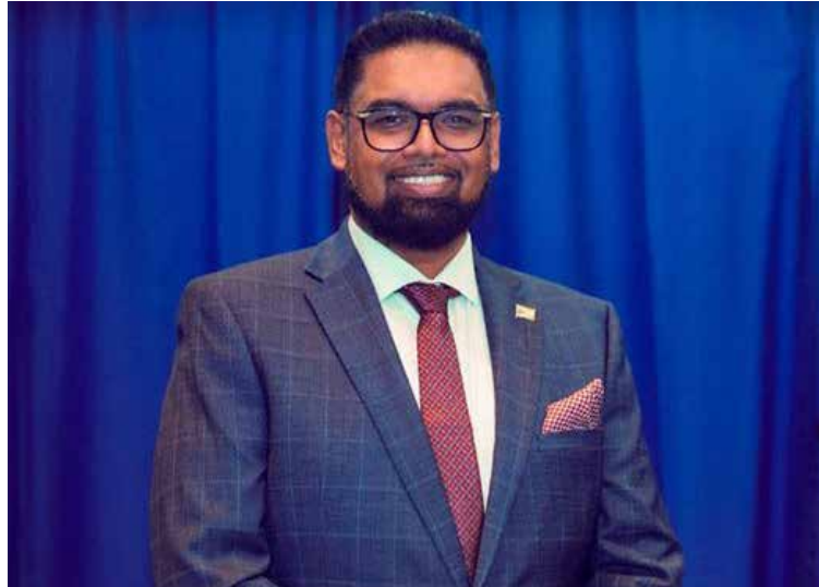
President of the Co-operative Republic of Guyana, His Excellency Dr. Mohamed Irfaan Ali.