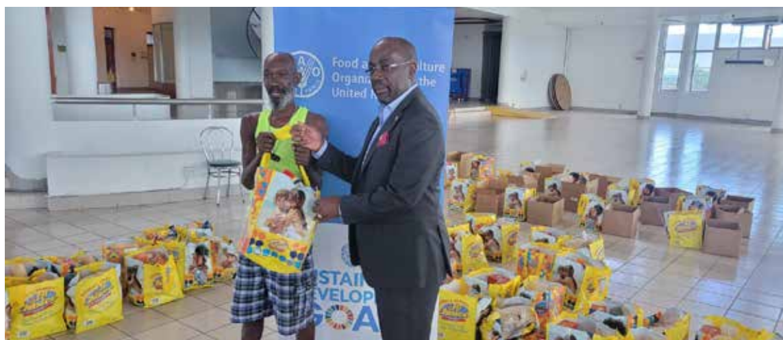
Agriculture Minister E.P Chet Greene was among those lending a hand in the distribution of food packages

He disclosed that he has had the assistance of several private sector entities who have made generous donations to the cause. Unfortunately, several farmers were not able to fulfill their pledges to assist because of crop damage caused by the recent tropical storm. "The items are from well-wishers who believe in giving back to the society. The donations are the result of a total of 35