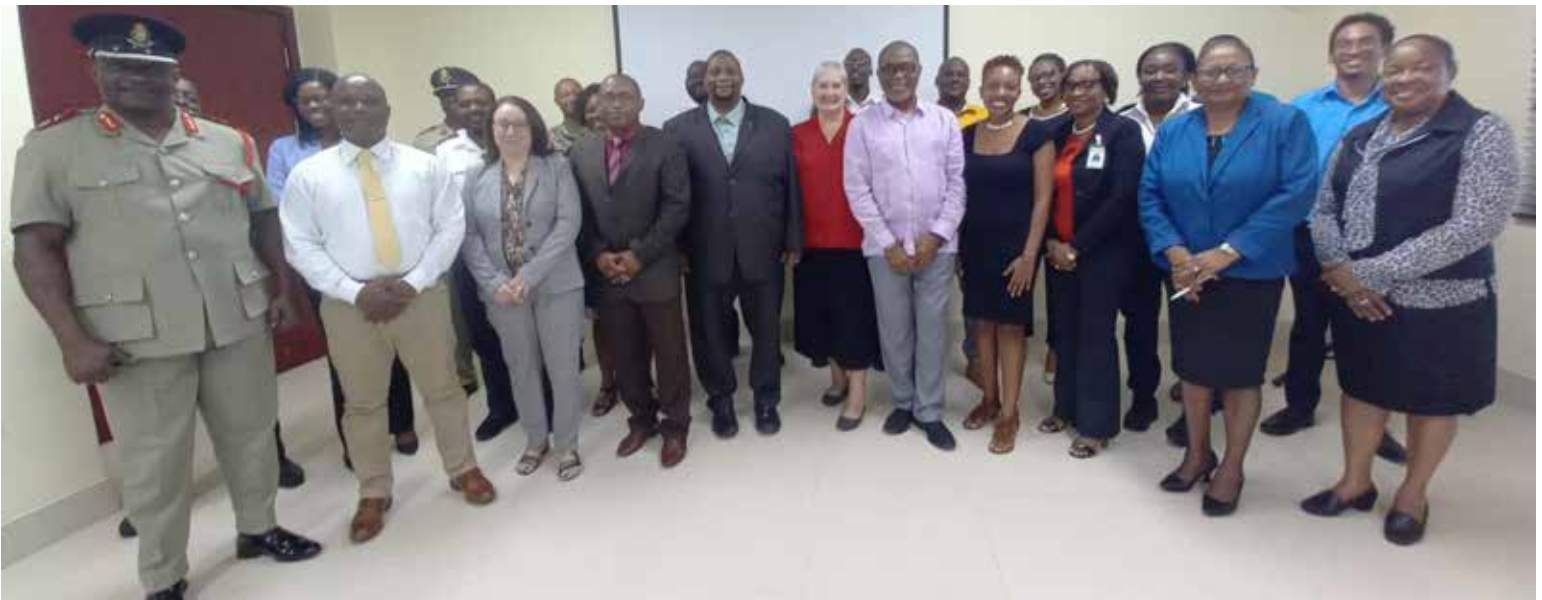
IAEA training session participants and facilitators