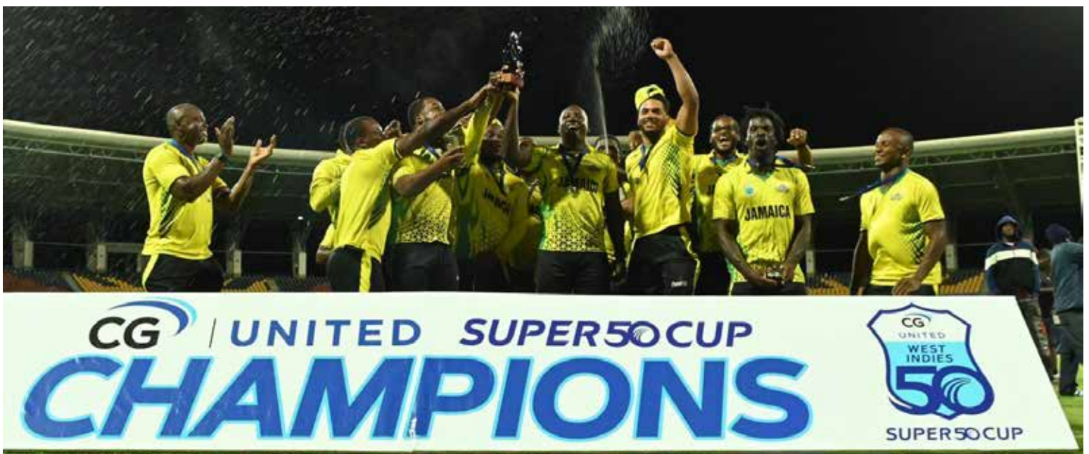
The Jamaica Scorpions are the reigning champions of the CG United Super50 Cup. (File photo)