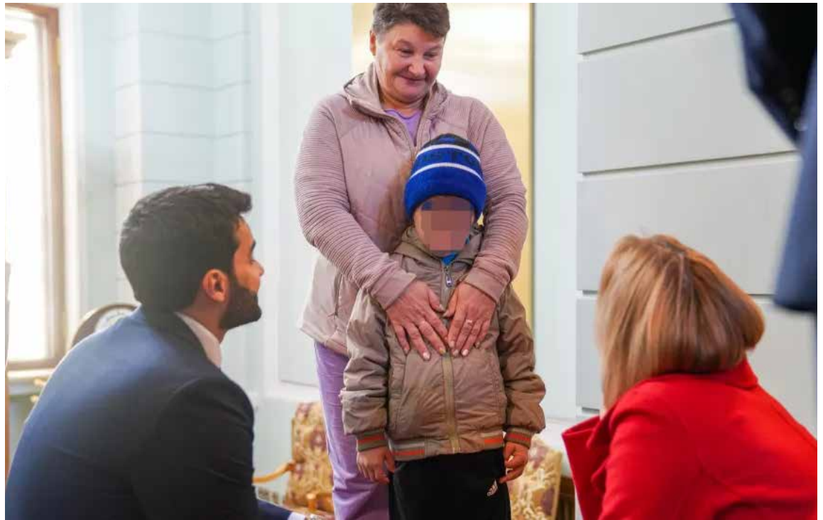
A Ukrainian boy, pictured with his grandmother and Russia's children's rights commissioner Maria Lvova-Belova, is one of the four children.

The return of the four children will test a scheme worked on by Qatar after it headed talks with Moscow and Kyiv, a diplomat who asked to remain anonymous due to the scheme's sensitivity told news agencies.