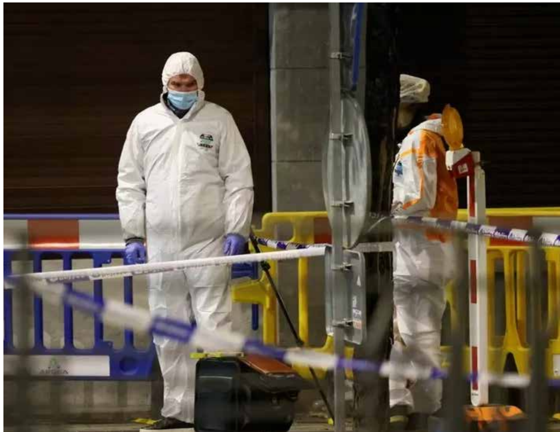
Belgian police officers search for evidence.

Federal prosecutors say a terrorism inquiry has been