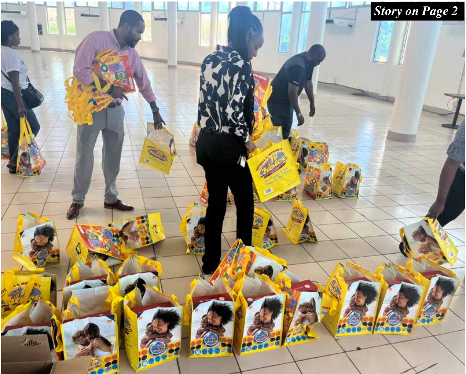
Food packages being prepared for distribution to the most vulnerable on World Food Day.