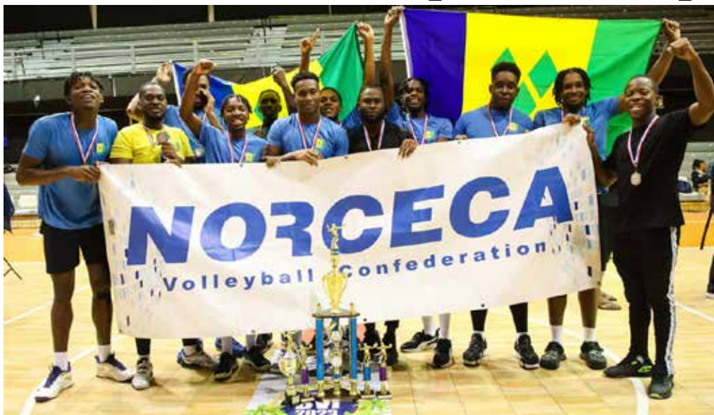
The St. Vincent and the Grenadines team celebrate after winning the Eastern Caribbean Volleyball Association Under-23 Men's Championship in Road Town, Tortola, on Sunday, October 15, 2023.

The Antiguans launched their campaign with a 3-1 win against Saba, as they prevailed 25-21, 18-25, 25-23, and 25-14.