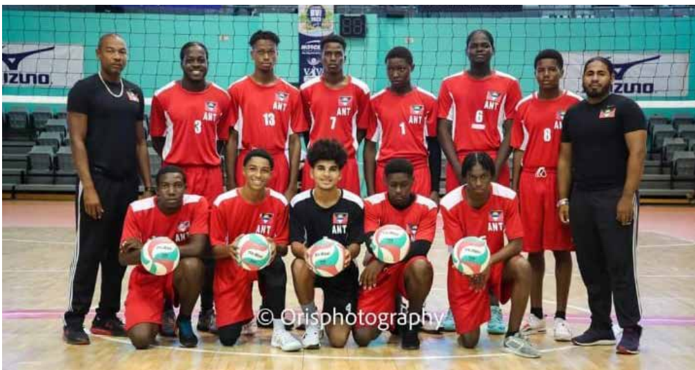
Antigua and Barbuda Under-23 men's volleyball team.

St. Lucia finished in fifth place, the British Virgin Islands sixth, Grenada seventh, Saba ninth, and Anguilla ended in the cellar position.