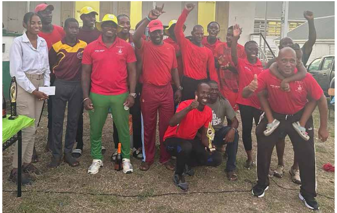
Dredgers celebrate after capturing the LL Supply Limited Island Boys Sports Club T20 Taped Ball Classic Championship at the AGS playing field on Sunday, October 15, 2023.

Buckley’s 3J’s captured third place. Buckley’s 3J’s defeated the TG Welding & Fabrication Underdogs by 10 runs in the third-place playoff at the same venue