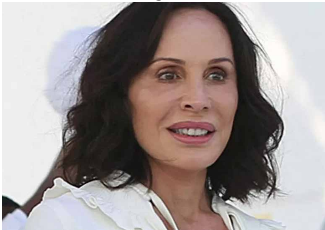
Sylvia Bongo has been married to the ousted president since 1989.