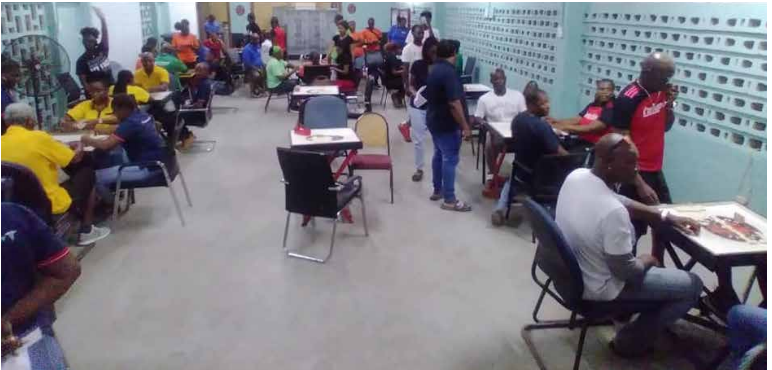
Players compete in the Team Three-Hand domino competition at the ABNDA's headquarters in Ottos.