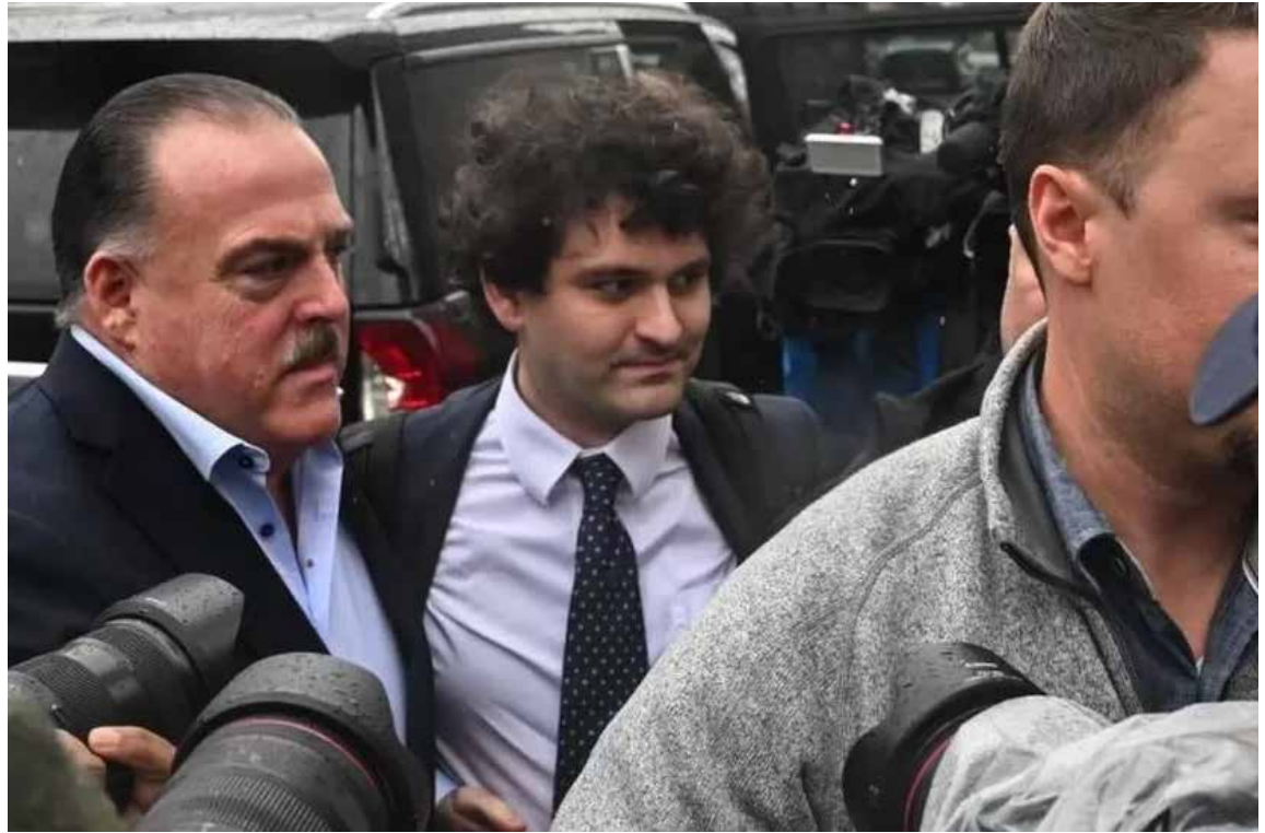
Sam Bankman-Fried is accused of fraud and money laundering.

No one knows how the thief - or thieves - was