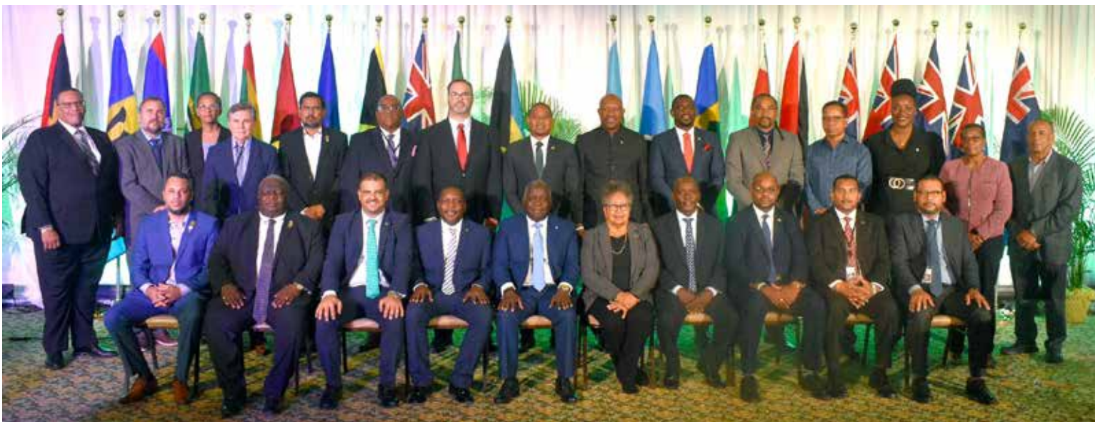
CWA ministers group photo