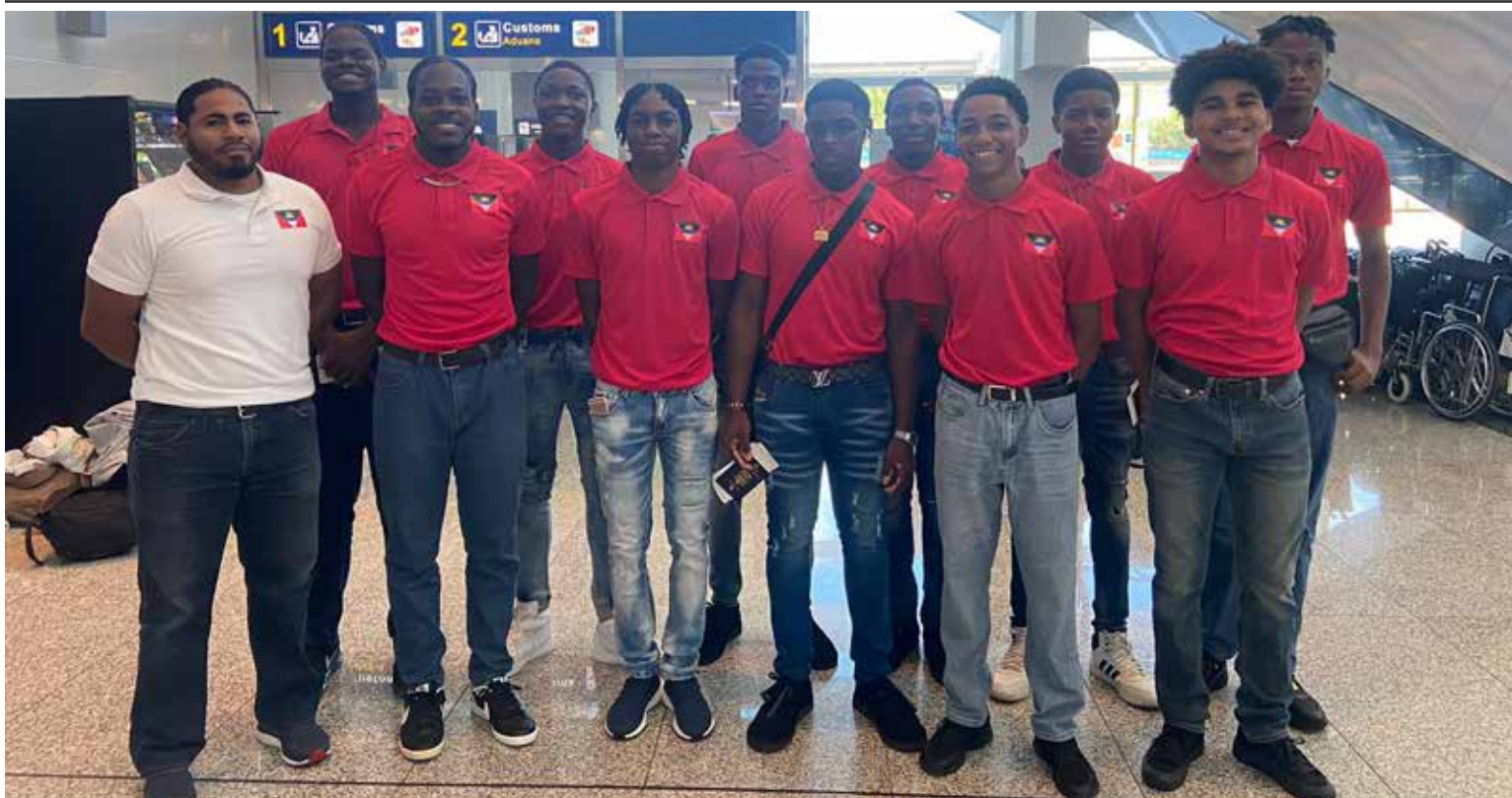
The Antigua and Barbuda Under-23 men's volleyball team. (File photo)