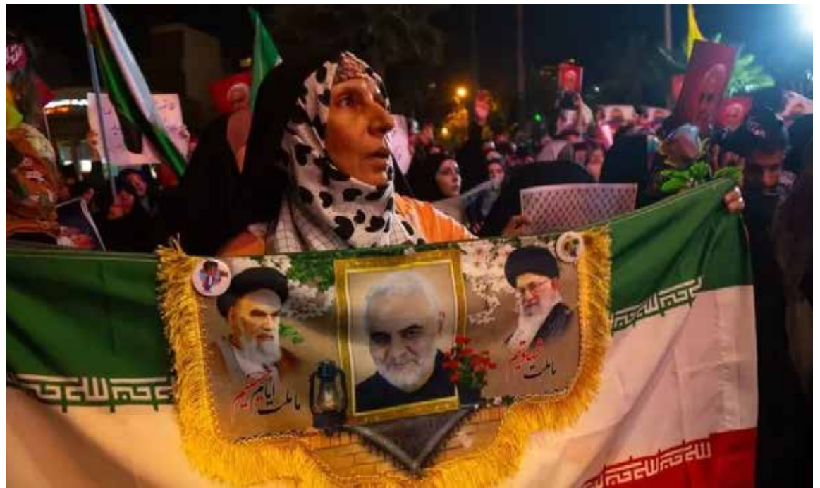
An Iranian pro-government protester in Tehran joins a celebration of the Hamas attack on Israel.

White House spokesman John Kirby would not confirm reports that the funds had been frozen.