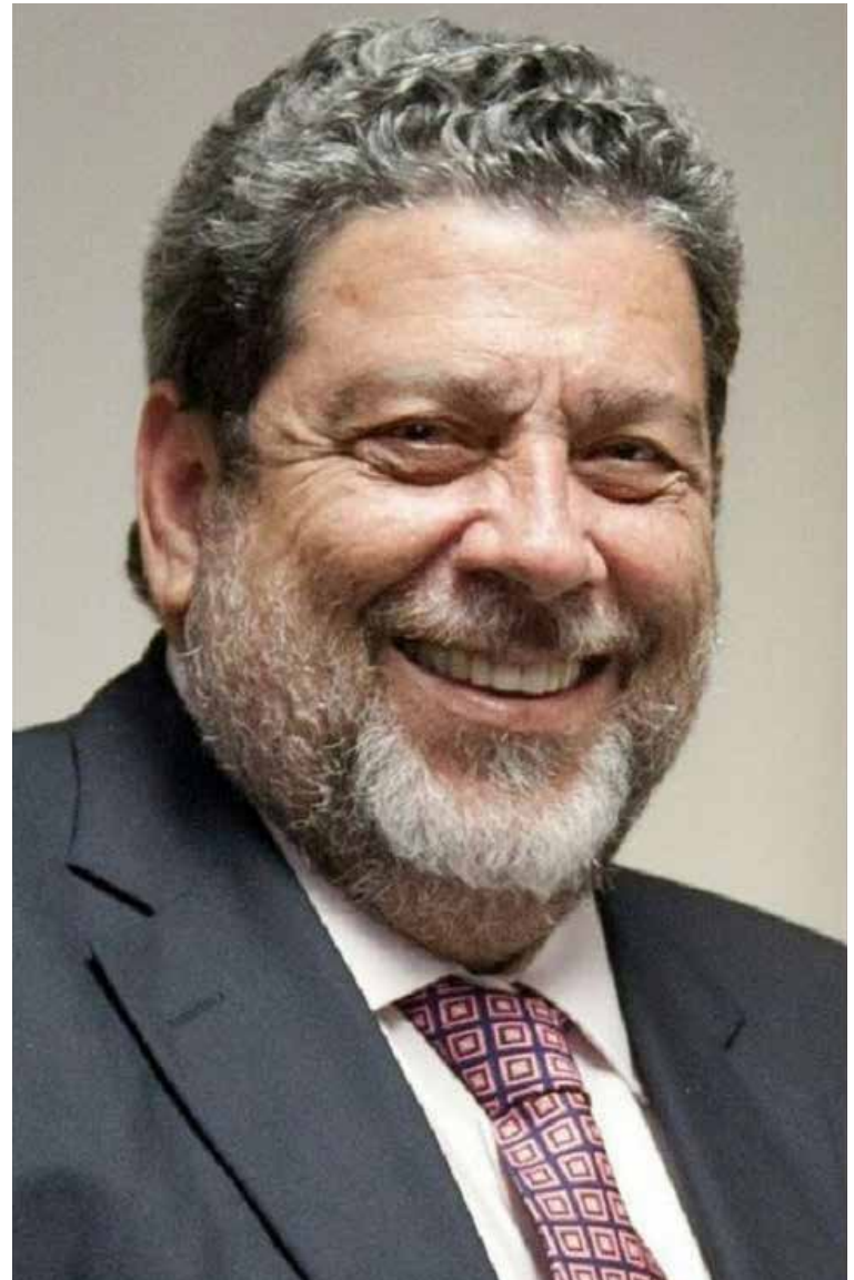
Prime Minister of St Vincent and the Grenadines, Dr Ralph Gonsalves.

There is often outrage here over the sentencing for indecent assault with