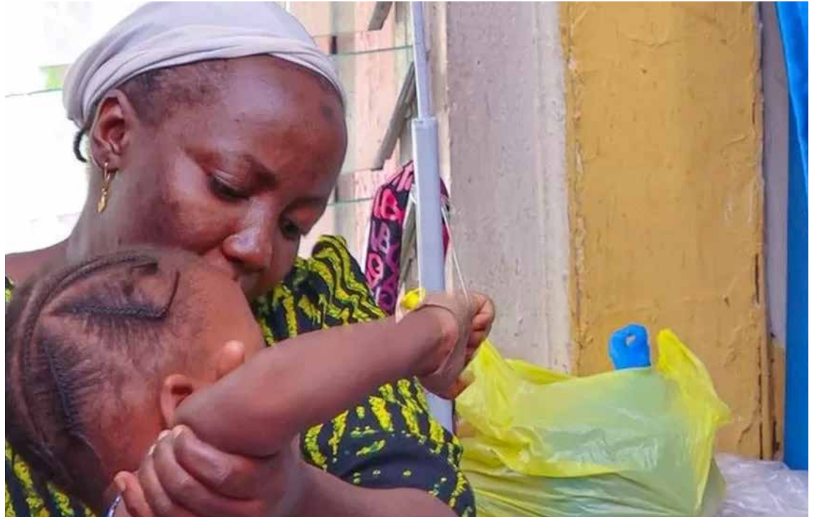
Health authorities are encouraging parents to get their children immunised.

theria isolation centre in Kano city on Wednesday, he added: "Witnessing the young children suffering from this entirely preventable disease at the centre today was profoundly heart-wrenching."