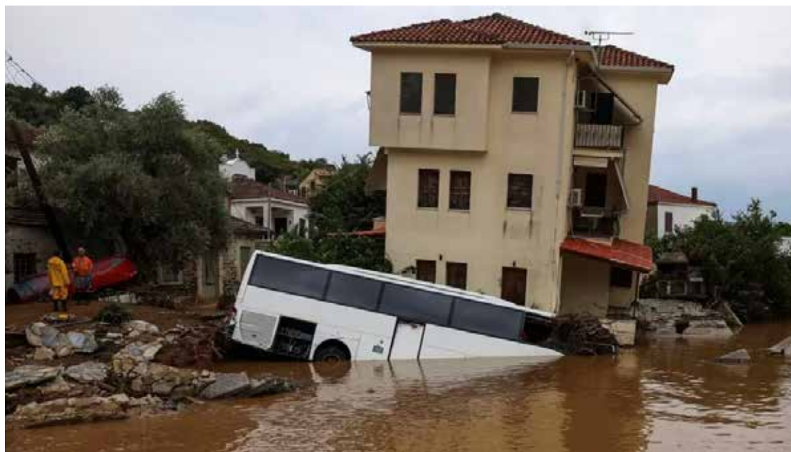
Some Greek regions have received more rain than they do normally in a year.

He added that the couple, from the Austrian city of Graz, had married shortly after arriving on their holiday.