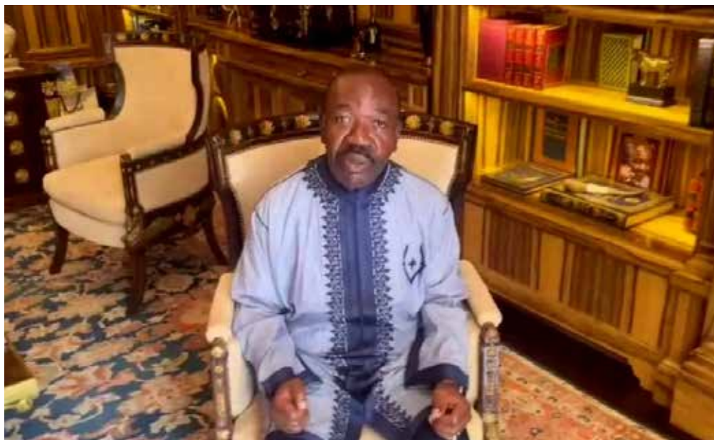
Ali Bongo managed to release a video from house arrest, calling for help.

A seven-year corruption investigation by French police into the Bongo