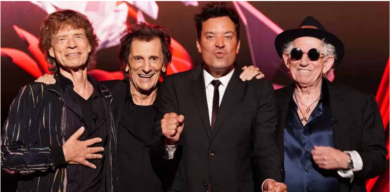
US talk show host Jimmy Fallon (second right) interviewed Sir Mick Jagger, Ronnie Wood and Keith Richards in Hackney.