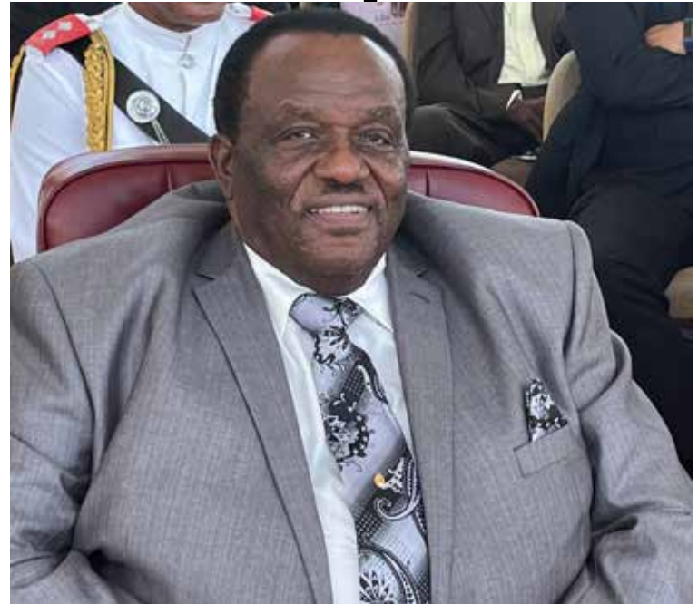
National Security Minister Steadroy Benjamin

“Drug trafficking and Cybercrimes are among two of the most threatening crimes which undermine the rule of law and the certainty which Caribbean civilization needs to flourish,” the National Se-