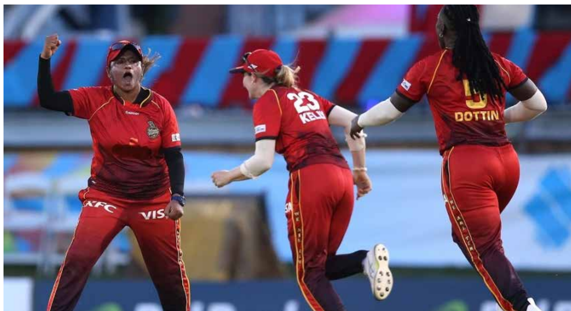
Players of the Trinbago Knight Riders women celebrate a dismissal during their match against the Barbados Royals in the 2023 Massy Women's Premier League at the Queen's Park Oval in Trinidad on Wednesday, September 6, 2023.

Knight Riders scored 33 runs inside two overs in the Power-Play courtesy of