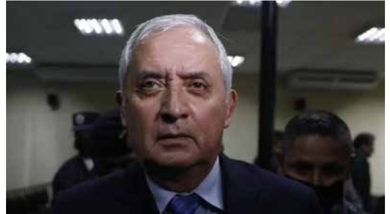
Otto Pérez Molina governed from 2012 to his resignation in 2015.

was kicked out of Guatemala in 2019 by Pérez Molina's successor in office, Jimmy Morales, when it started to investigate Mr Morales over alleged funding irregularities