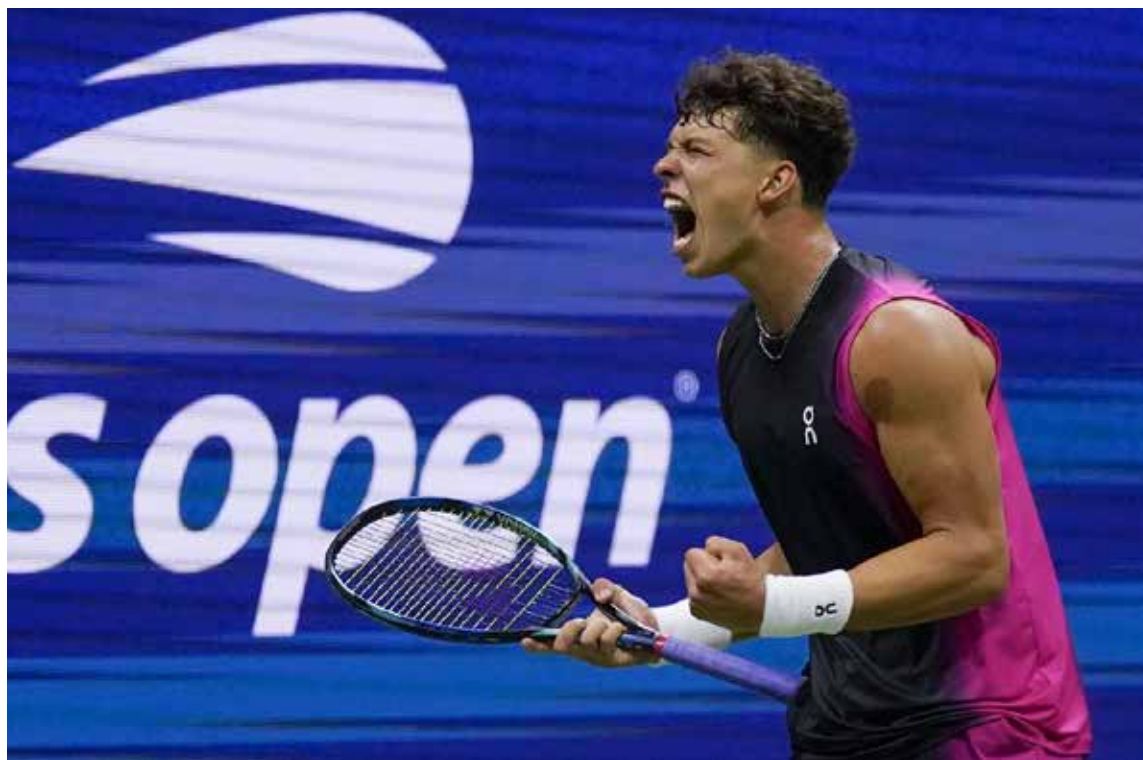
Ben Shelton, of the United States, reacts during a match against Frances Tiafoe, of the United States, during the quarterfinals of the US Open tennis championships in New York, Wednesday, Sept. 6, 2023.

Shelton will be appearing in his first major semifinal. His opponent Friday, Djokovic? This is No. 47 for him, one more than Roger Federer for the most by a man in the Open era. Medvedev is in his seventh trip to the final four; his opponent, Alcaraz, has made it this far