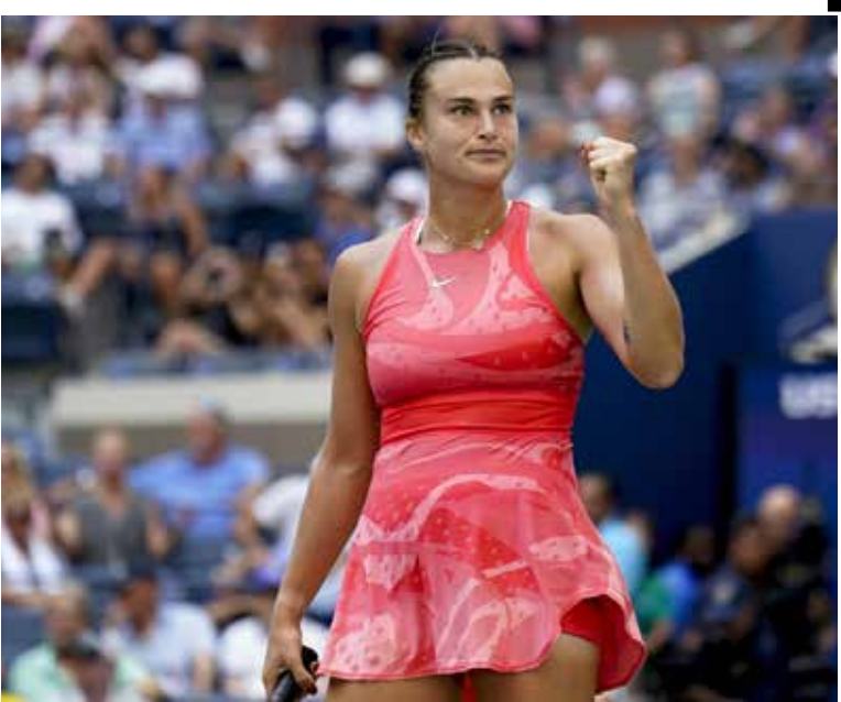
Aryna Sabalenka, of Belarus, reacts after defeating Zheng Qinwen, of China, during the quarterfinals of the US Open tennis championships in New York, Wednesday, Sept. 6, 2023.

NEW YORK -Aryna Sabalenka moved into the US Open semifinals on Wednesday, looking every bit like a player who soon will be ranked No. 1 while rolling to a 6-1, 6-4 victory over Zheng Qinwen in just over an hour.