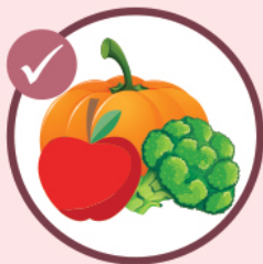
HEALTHY FOODS, FRUITS & VEGETABLES