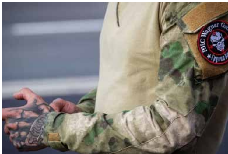
A Wagner fighter mourns Yevgeny Prigozhin in St Petersburg.

And in July, the UK said the group had carried