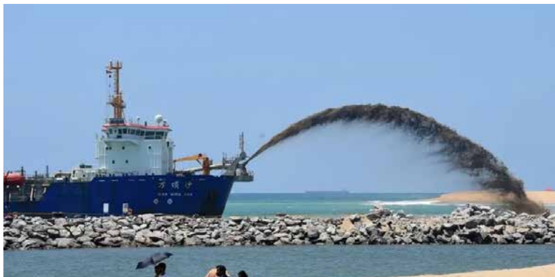
A dredger pumps sand to reclaim land in Sri Lanka.

The new data coincides with the launch of a new analysis tool called Marine Sand Watch that monitors dredging activities using marine tracking and arti-