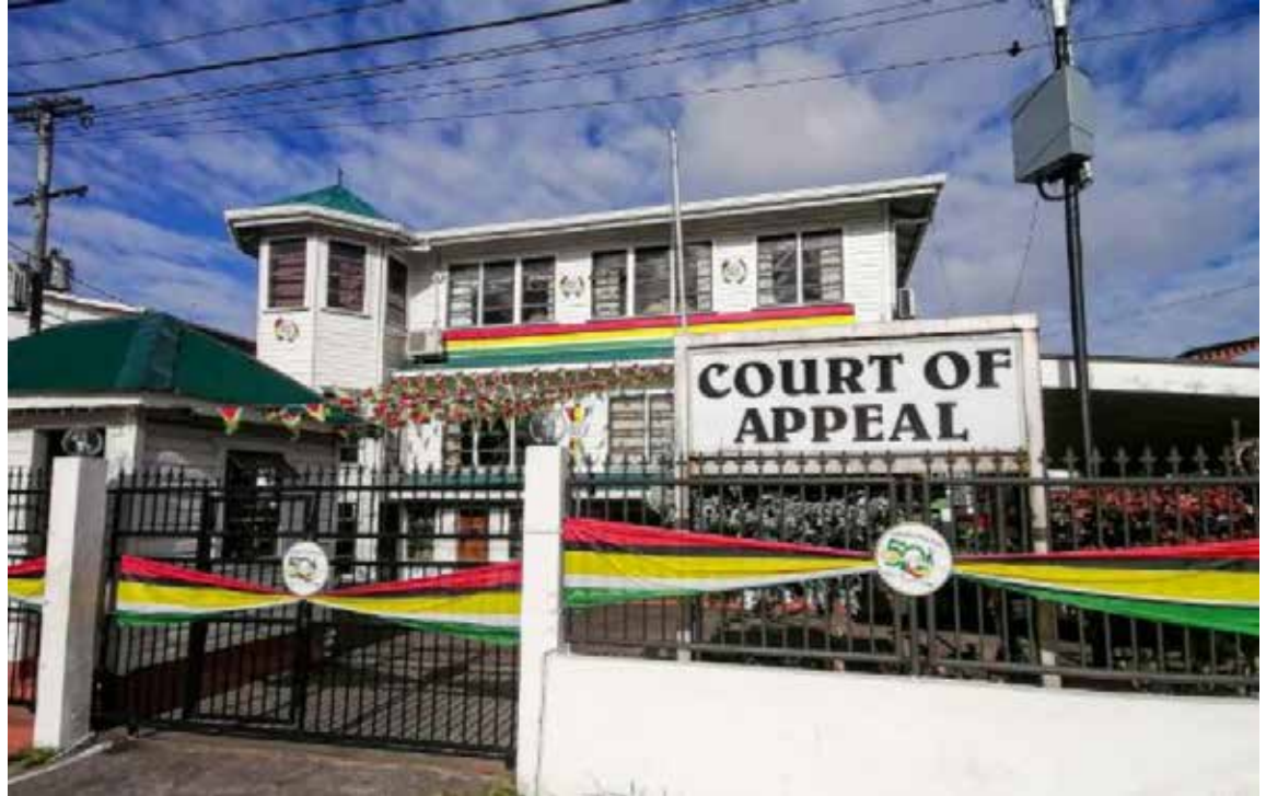
File- Guyana Court of Appeal.