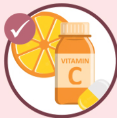
VITAMINS AND MEDICATION