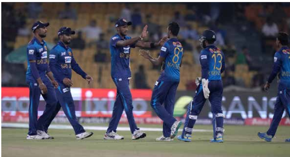
Sri Lanka's Matheesha Pathirana, third left, celebrates with teammates after the dismissal of Afghanistan's Hashmatullah Shahidi during the Asia Cup cricket match between Afghanistan and Sri Lanka in Lahore, Pakistan, Tuesday, Sept. 5, 2023.

No. 11 batter Fazalhaq Farooqi defended the next two balls of part-time spinner de Silva before getting trapped lbw off the next ball