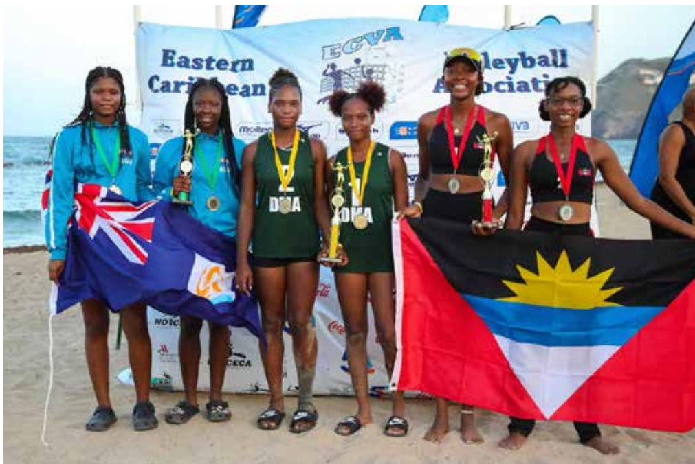
The top three teams that won medals in the female division of the Eastern Caribbean Volleyball Association Under-19 Beach Tournament at the Marriott Beach in Frigate Bay, St. Kitts, on September 2-3, 2023. From left: Third place finishers Anguilla, champions Dominica, and Antigua and Barbuda.

my girls right now. They are the shortest in the competition, and everyone doubted them, but it goes to show that height does not win volleyball. It was down to our serving, passing, and communicating with one another and being able to trust one another."