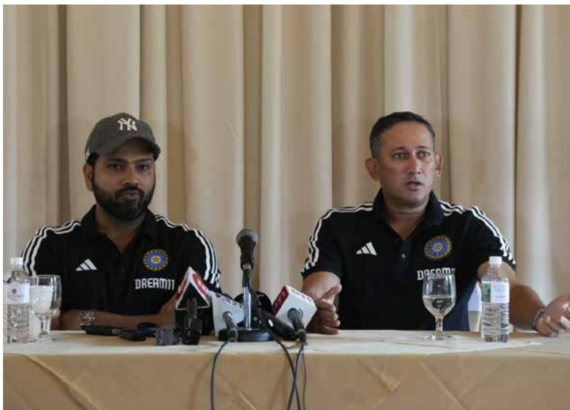
Board of Control for Cricket in India (BCCI) Chairman of the selection committee Ajit Agarkar, right, and Indian cricket captain Rohit Sharma speak to the media as they announce the Indian squad for the upcoming cricket World Cup in Pallekele, Sri Lanka, Tuesday, Sept. 5, 2023.

Rahul had been sidelined since he tore a tendon