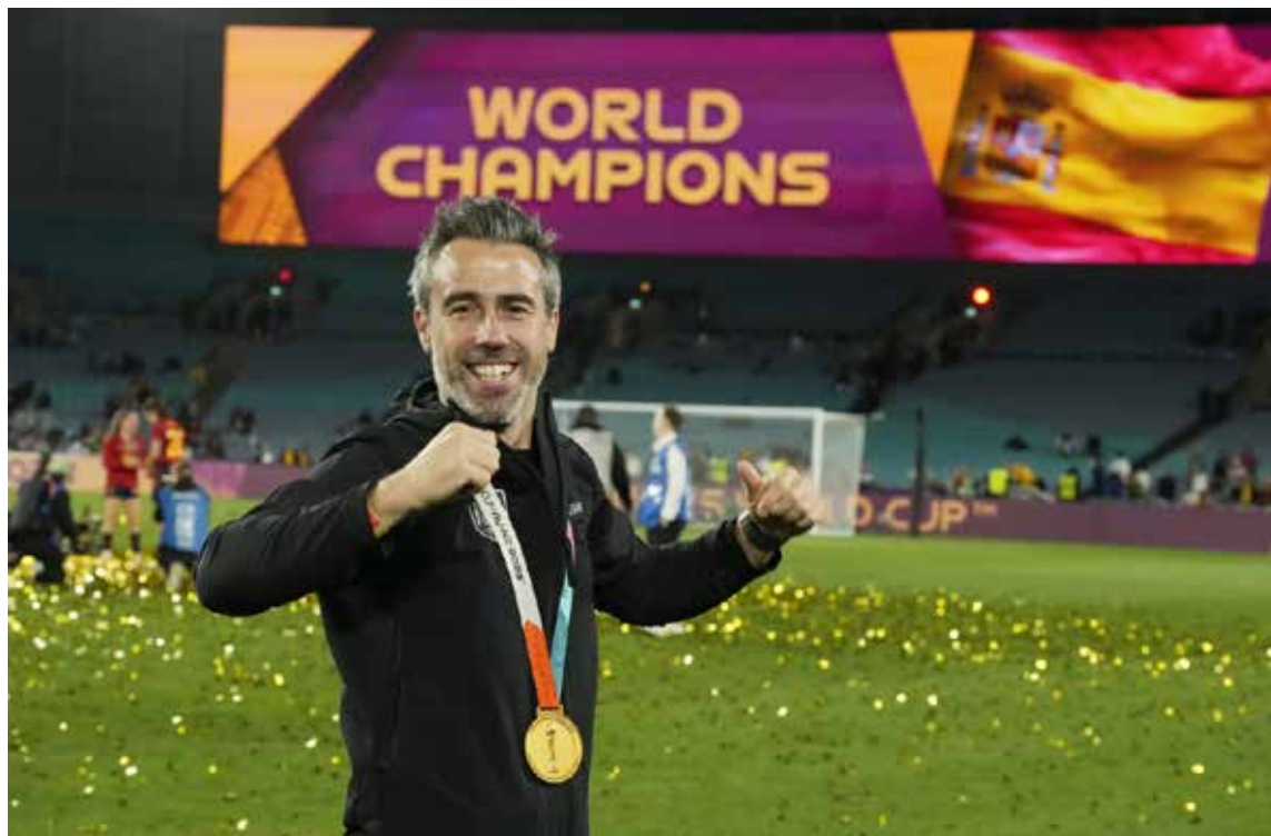
Spain's head coach Jorge Vilda celebrates with the gold medal after the final of Women's World Cup soccer between Spain and England at Stadium Australia in Sydney, Australia, Sunday, Aug. 20, 2023. The Spanish soccer federation has fired women's national team coach Jorge Vilda less than three weeks after Spain won the Women's World Cup title and amid the controversy involving suspended federation president Luis Rubiales.

grabbed his crotch in a lewd victory gesture after the final game, has been provisionally suspended by FIFA and faces a Spanish government case against him for the conduct that prompted a storm of criticism and led to widespread calls for his resignation.