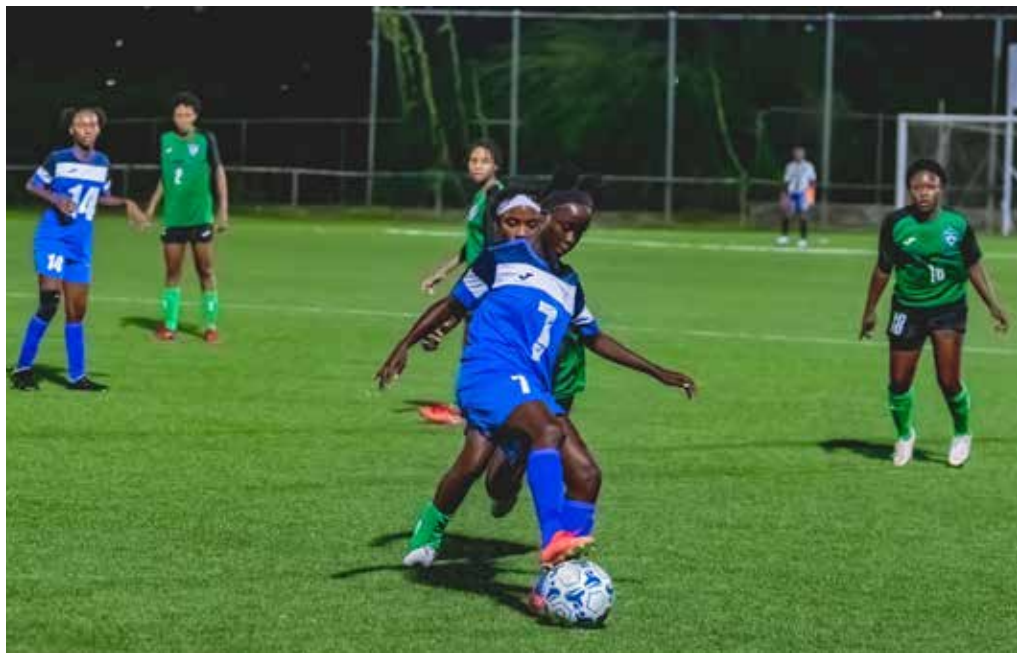
A Fort Road player (blue uniform) fends off a challenge from a Wadadli United's player during their encounter in the women's knockout competition at the ABFA's Technical Center at Paynters on Saturday, July 15, 2023.

"As a result of that, there is some heavy-duty work that we have to un-