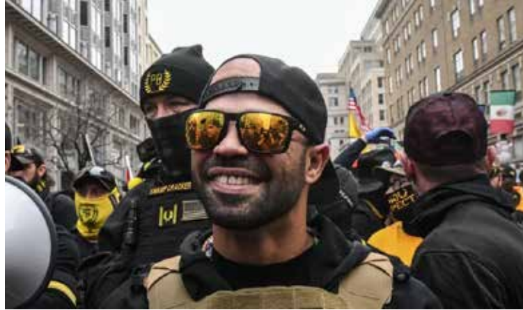
Ex-Proud Boys leader Enrique Tarrío.

Trump had lost the November 2020 presidential election, Tarrío said: "I am not a political zealot. Inflicting harm or changing the results of the election was not my goal.