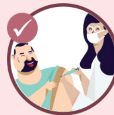
FLU SHOT/ VACCINATION