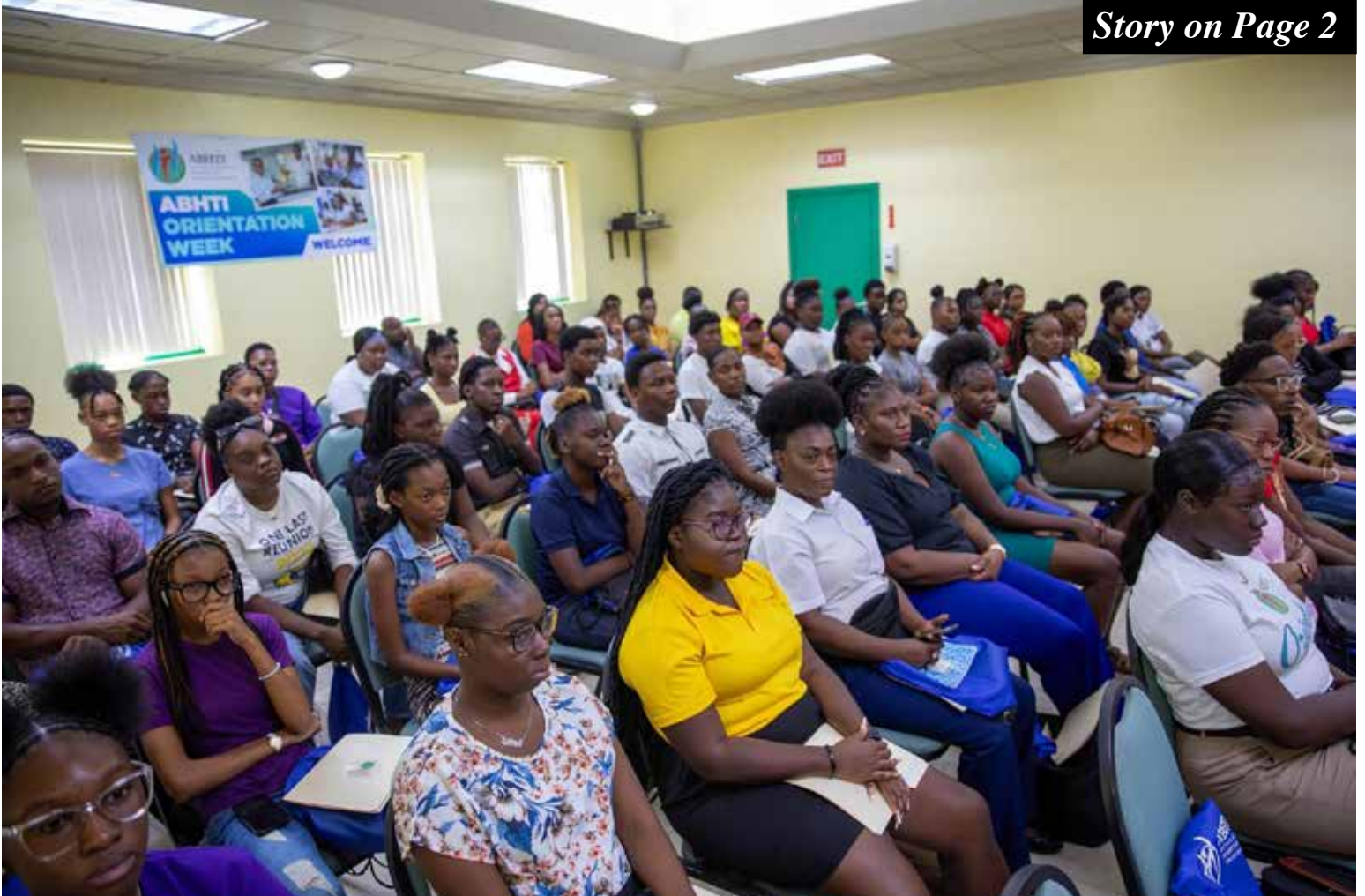
New students at ABHTI attend Orientation Week activities during Week One of their training.