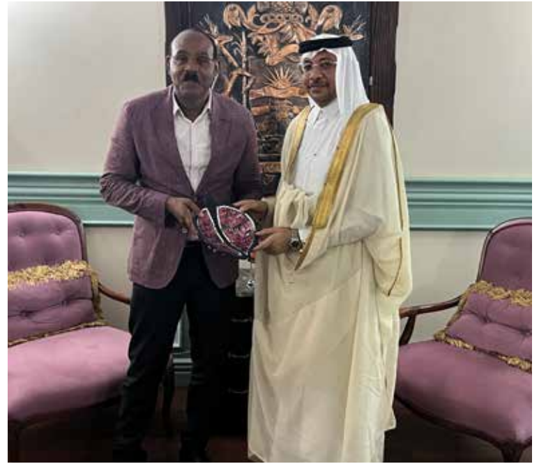
Prime Minister Gaston Browne, left, with Qatari Ambassador for Antigua and Barbuda, Yaser Awad Al-Abdulla

During a similar courtesy call on Foreign Affairs Minister, E. P. Chet Greene, the minister used the opportunity to reach out to Qatar for assistance in Antigua and Barbuda’s hosting of the Small Islands Develop-