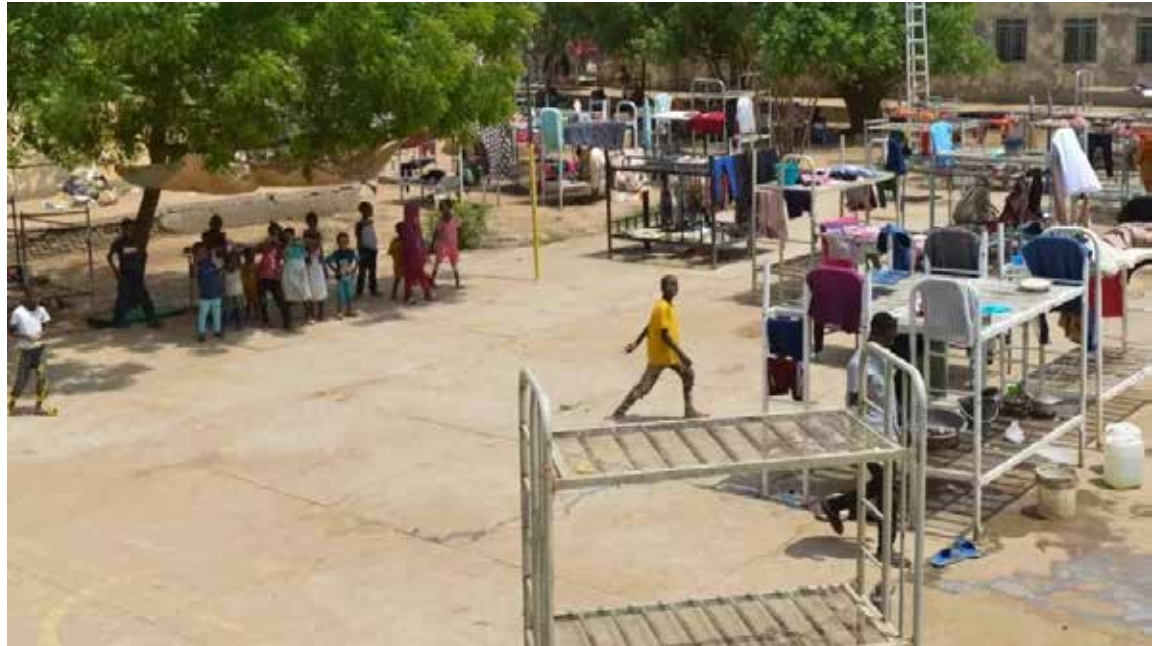
Millions of civilians have been displaced by the fighting.

Roughly 2.2 million people have been displaced