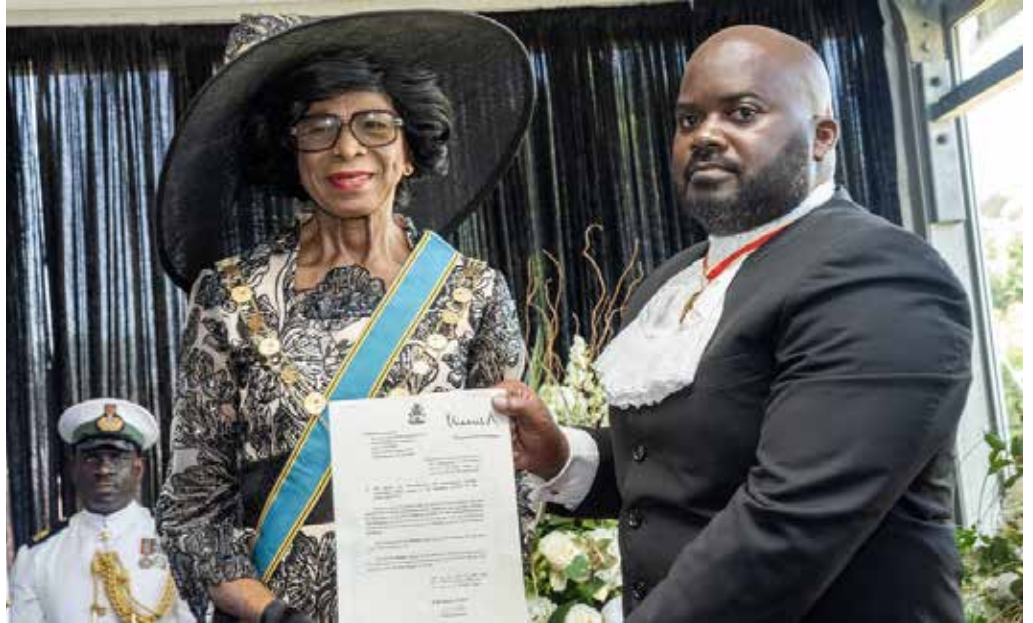
Cynthia ‘Mother’ Pratt is the new Governor-General of The Bahamas.

“Support the weak, lift up the fallen,” she said. “I pray that with the help of God we shall together lift up our eyes to the rising sun and build up our nation in peace, love and joy.”