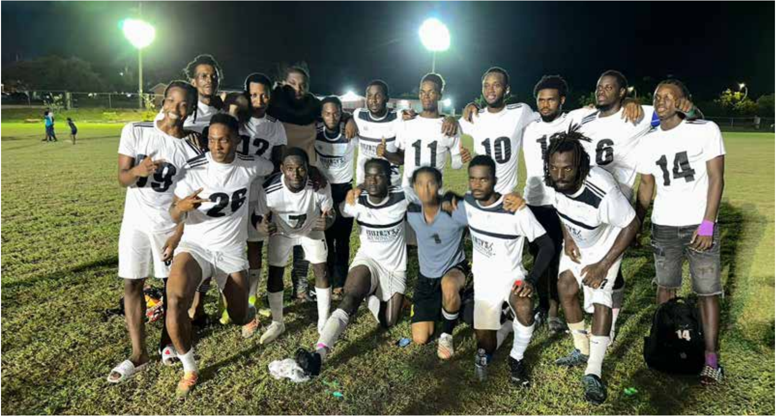
The Pigotts Bullets team celebrate after winning the inaugural Parham Super League football competition at the Parham playing field on Saturday, September 2, 2023.