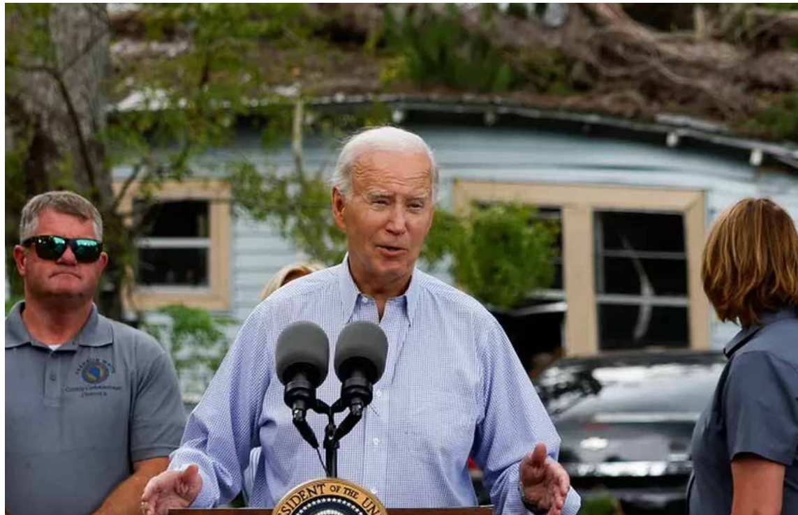
President Joe Biden said he was ready to mobilise support for Florida.

Mr Biden praised Mr DeSantis during his visit on Saturday and said he was not disappointed by the