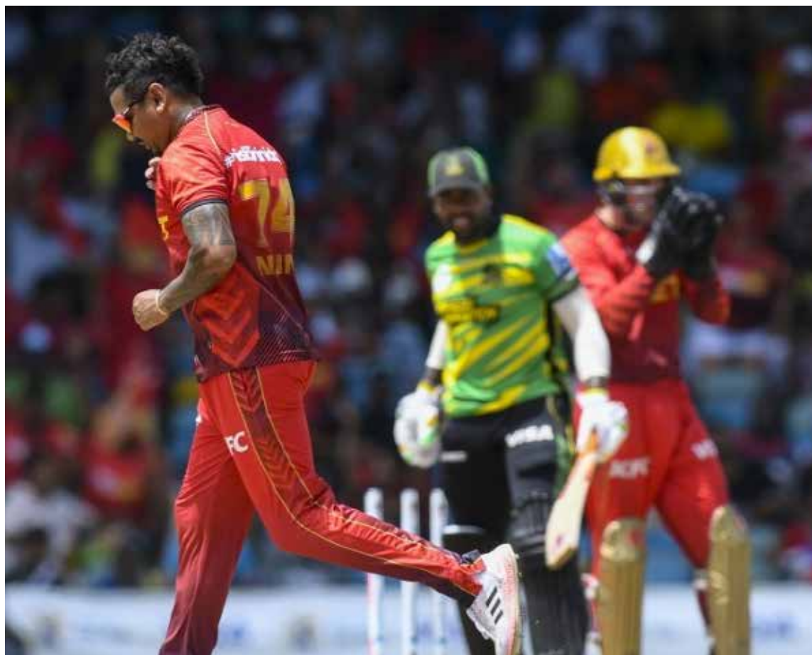
Trinbago Knight Riders spinner Sunil Narine, left, celebrate against the Jamaica Tallawahs in their CPL encounter at the Kensington Ovals in Barbados on Sunday, September 3, 2023.