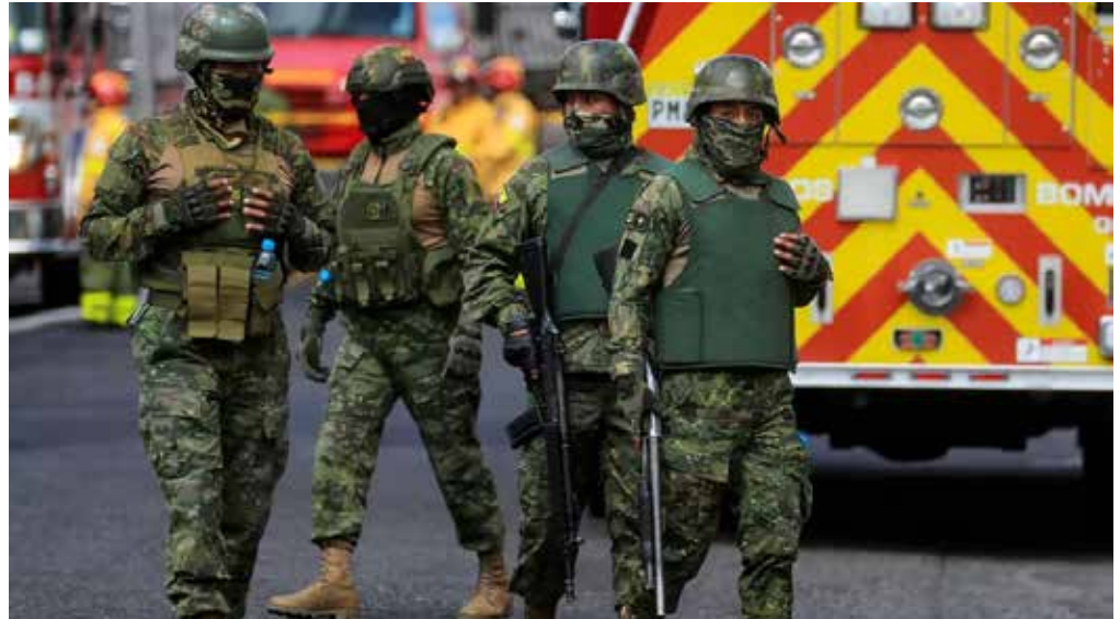
Officials say normal activities have resumed in the six facilities.

soldiers carried out the search at Coto-paxi jail in Latacunga, about 55 miles (88km) south of Quito, as part of ef-