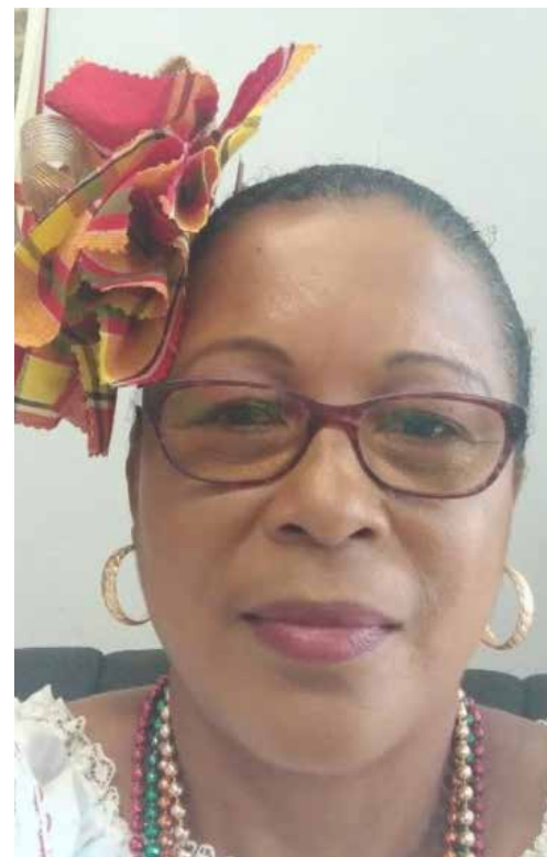
President elect Sylvanie Burton.

“All of what the Senator would have said in his arguments to the House to indicate that the candidate Sylvanie