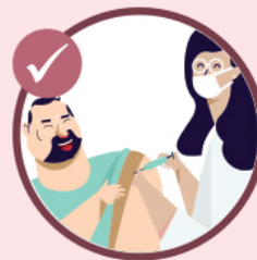
FLU SHOT/ VACCINATION