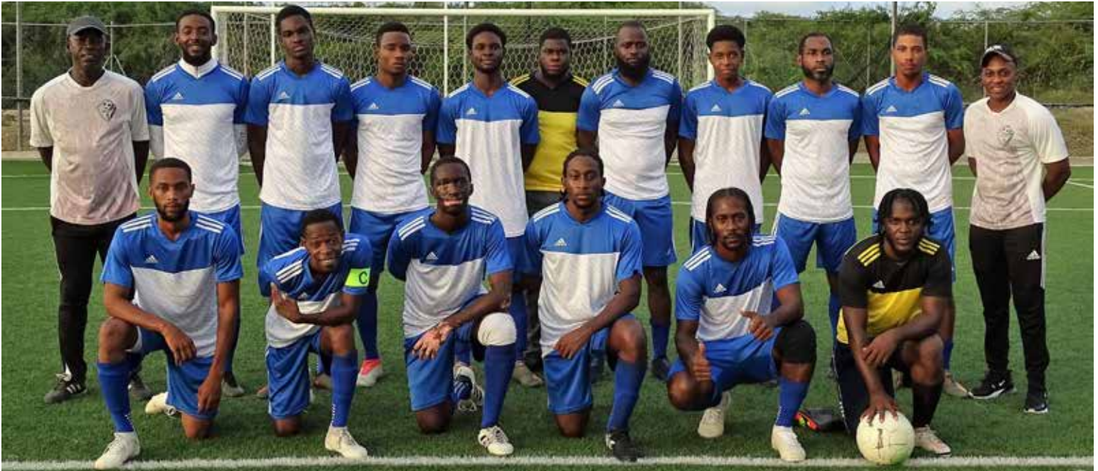
The Sea View Farm football team. (File photo)