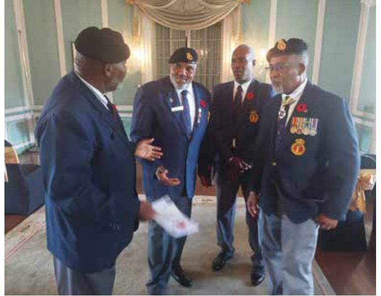
Members of the ABESA at Government House on Wednesday being compiled and will soon be sent to the British Archives who the association must then contact. He further disclosed that the sacrifices went beyond fighting in the war

He disclosed that the organization has written to the UK War Museum seeking information of the nationals who went off for the war and that it has been told that the records are