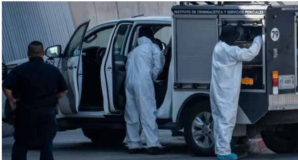
Forensic experts were called to seven sites where human remains had been dumped.

In their attempts to scare their rivals, the cartels would hang bodies from bridges or leave body parts next to signs