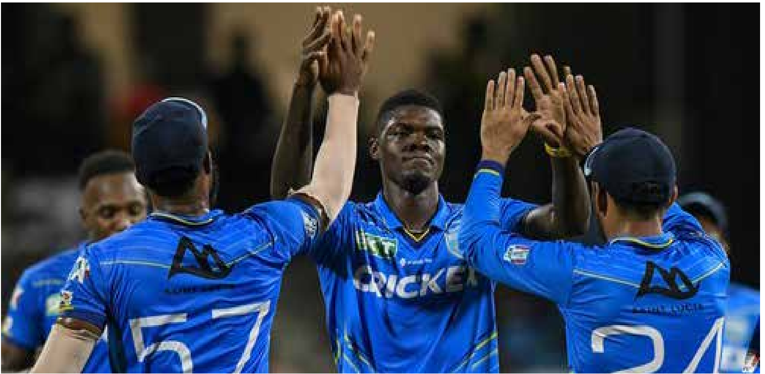
Antiguan and West Indies fast bowler Alzarri Joseph, center, celebrates with his St. Lucia Kings teammates after taking a wicket during the 2023 Republic Bank Caribbean Premier League.