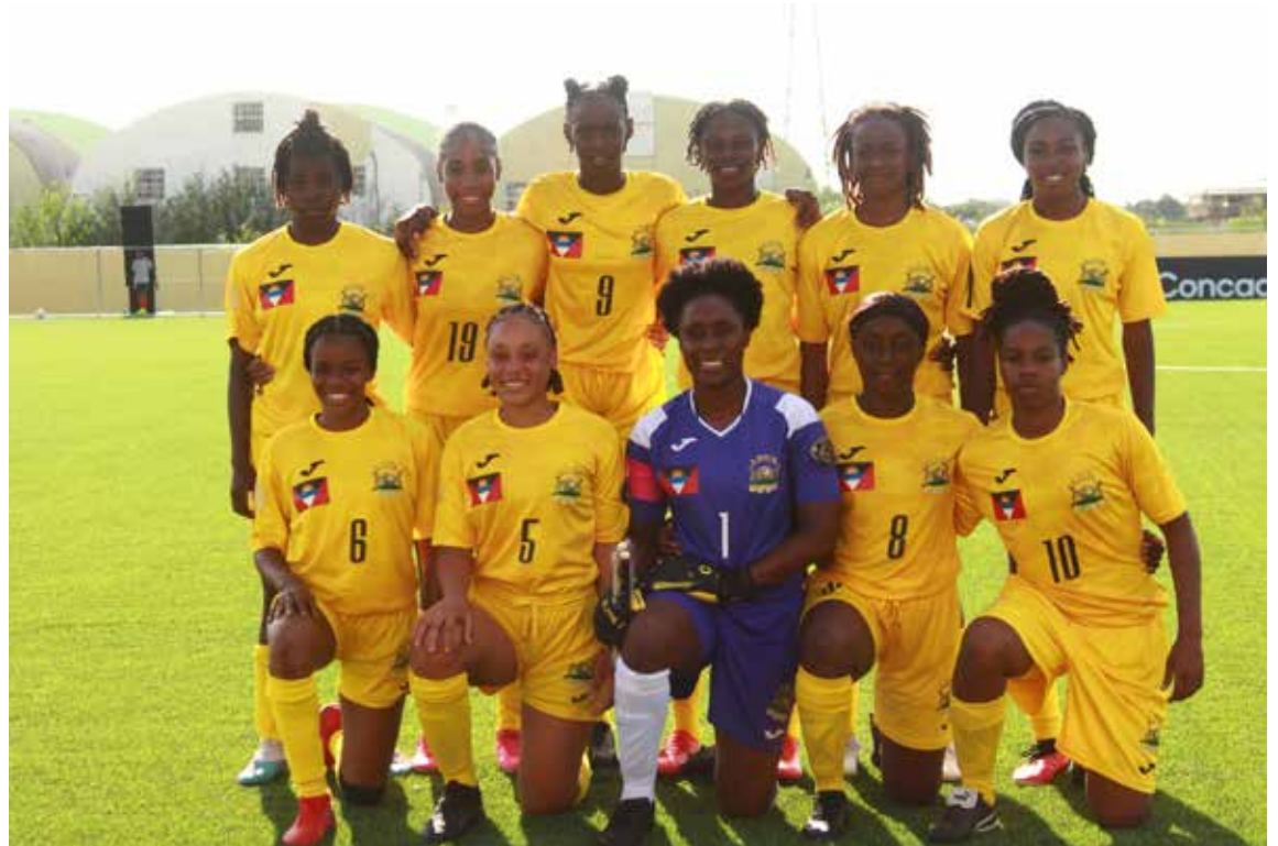
The Antigua and Barbuda senior national women's team. (File photo)