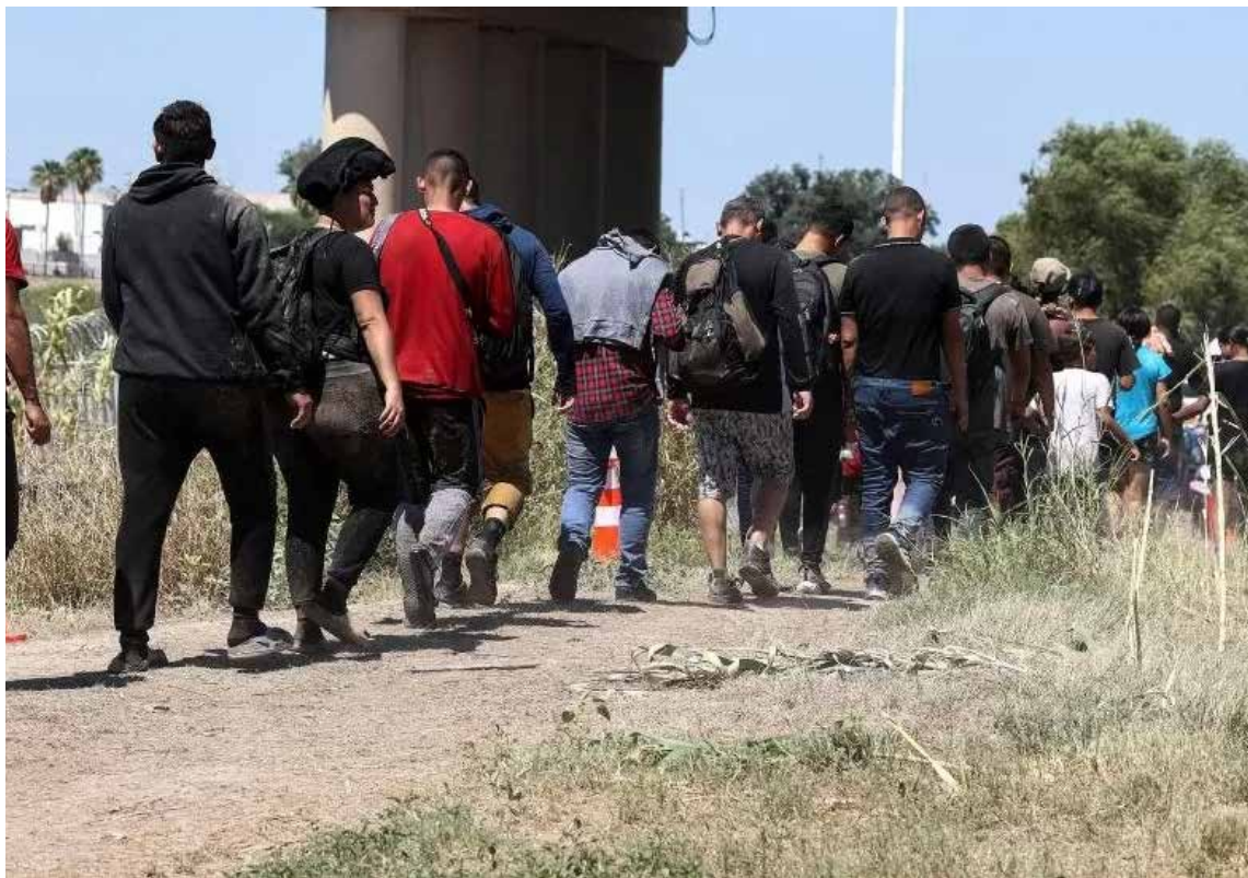
Eagle Pass declared a state of emergency earlier this week because of rising migrant figures.

The barrier has been the focus of intense legal wrangling, and a federal judge ruled earlier this month that they be moved