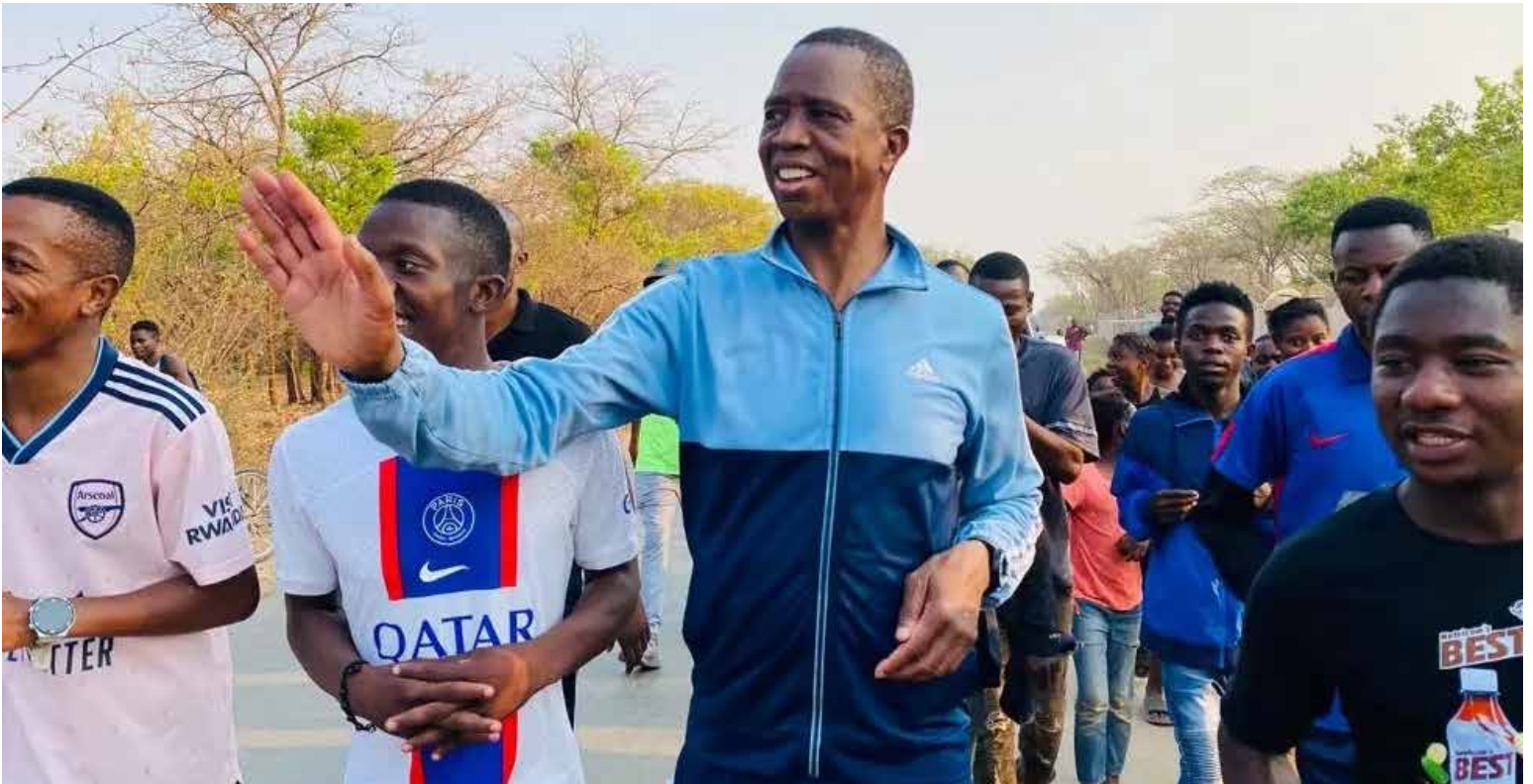
Ex-President Edgar Lungu's weekly jogs have been attracting the attention of curious onlookers.