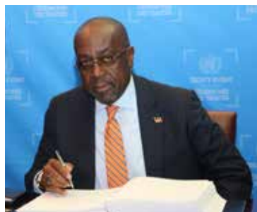
Minister of Foreign Affairs and Trade E.P Chet Greene

The ceremony represented a ground-breaking moment for Antigua and Barbuda, as the signing comes after nearly two decades of talks that culminated last June when governments adopted the internationally legally binding instrument.