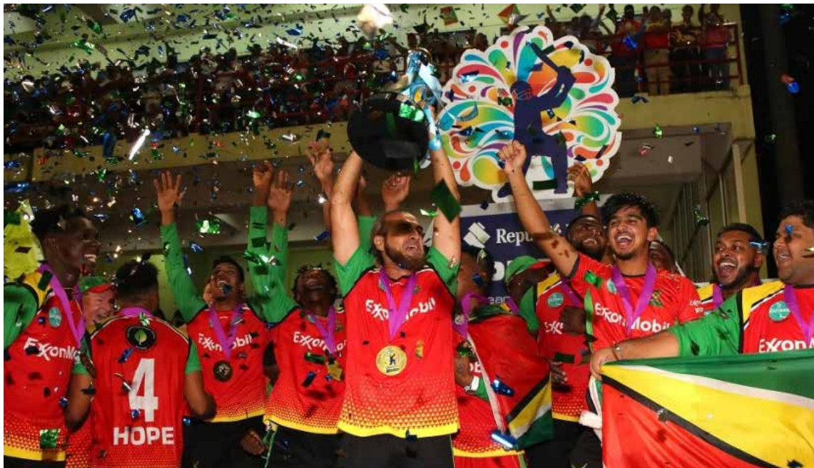
The Guyana Amazon Warriors celebrating their historic first-ever CPL title following an emphatic nine-wicket victory over Trinbago Knight Riders at Providence in Guyana on Sunday, September 24, 2023.