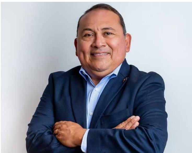
Former Minister of Blue Economy and Civil Aviation, Andre Perez.

Sylvestre eral Anthony says the investigation into the allegations against the embattled former Minister of Blue Economy and Civil Aviation, Andre Perez, is ongoing and will be done "in a timely manner".