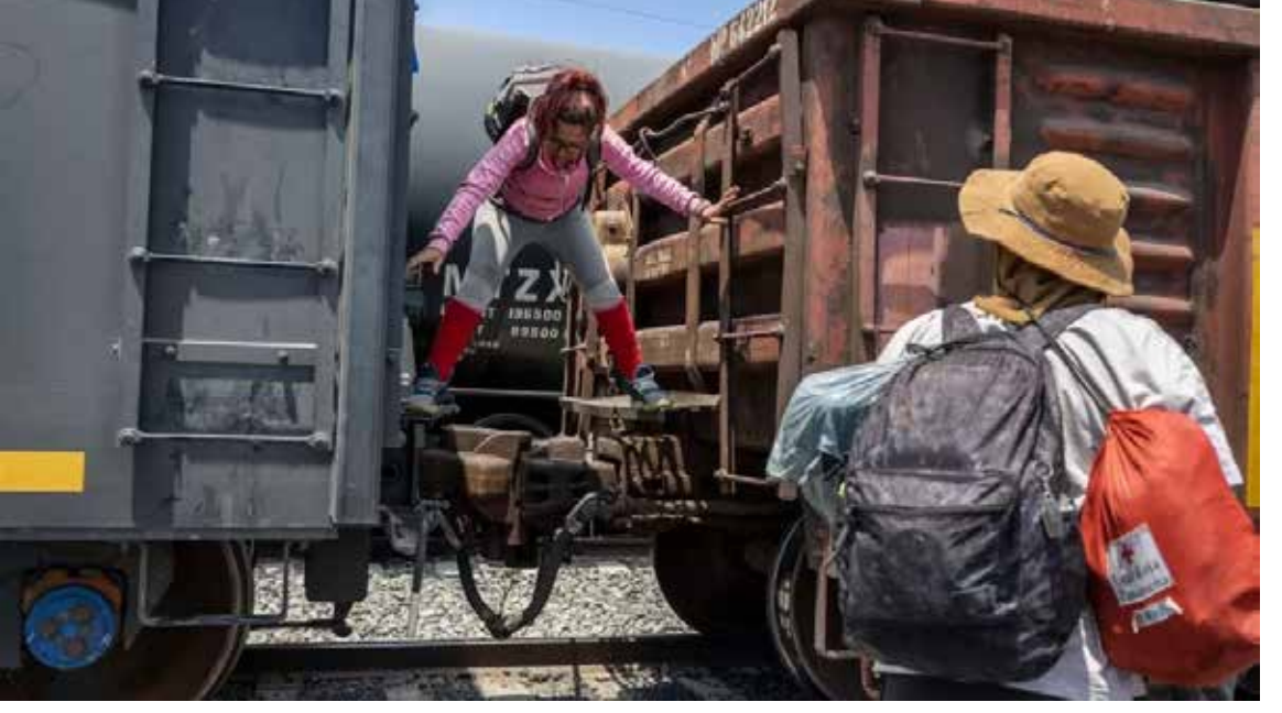
Clambering up and down the wagons is very risky, and many migrants have been maimed or killed.