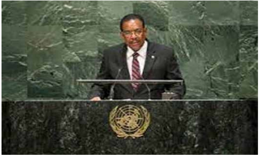
Dominica's President Charles Savarin addressing Sustainable Development Goals summit.

"To this end, decisive action must be taken to better support developing