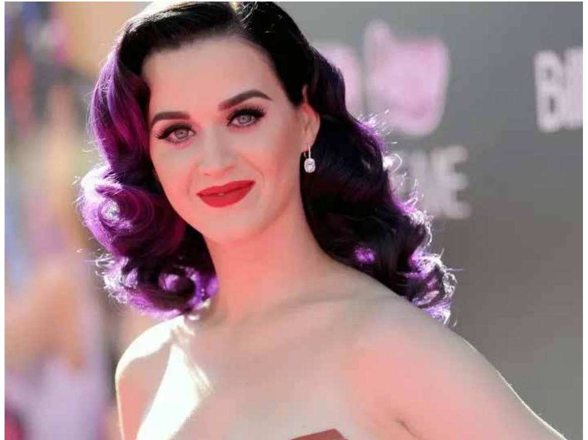
Katy Perry's Las Vegas residency is due to end this November.

2010s, Perry has slowed her work rate down in recent years, concentrating on her Las Vegas residency and raising a family with her partner, the actor Orlando Bloom.