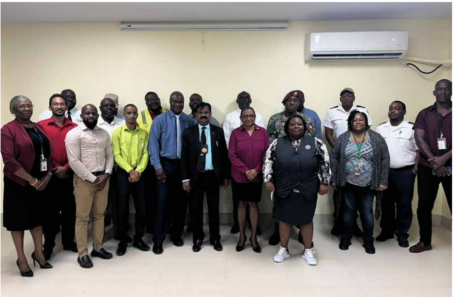
Border control officers from the Customs Division and the Antigua Port Authority are undergoing weeklong training in the detection and safe handling of radioactive sources and use of detection and safety equipment. Story on page 3