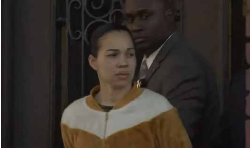
A lawyer for Grei Mendez says she was unaware there were drugs in the nursery.

Fentanyl, a pharmaceutical drug that can be given to treat pain, has been blamed for an increase in drug deaths.