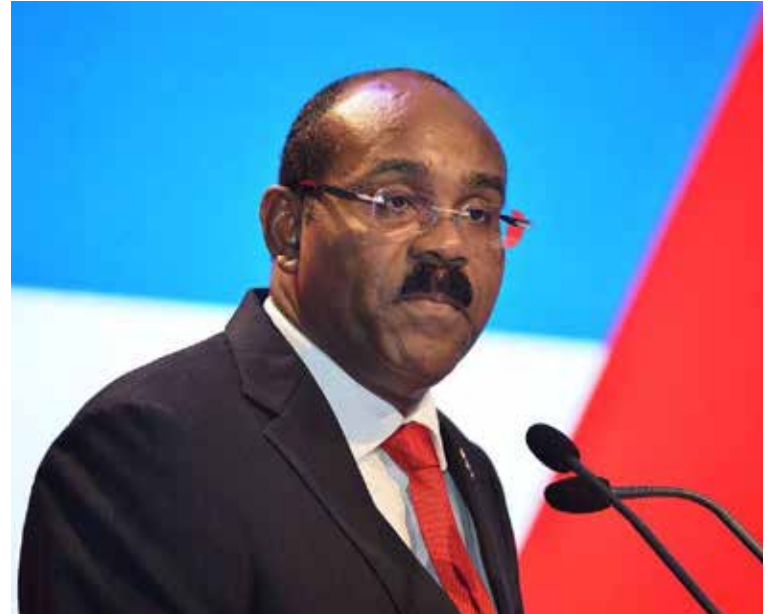
Prime Minister Gaston Browne

The theme for this year’s UNGA is “Rebuilding trust and reigniting global solidarity: Accelerating action on the 2030 Agenda and its Sustainable Development Goals