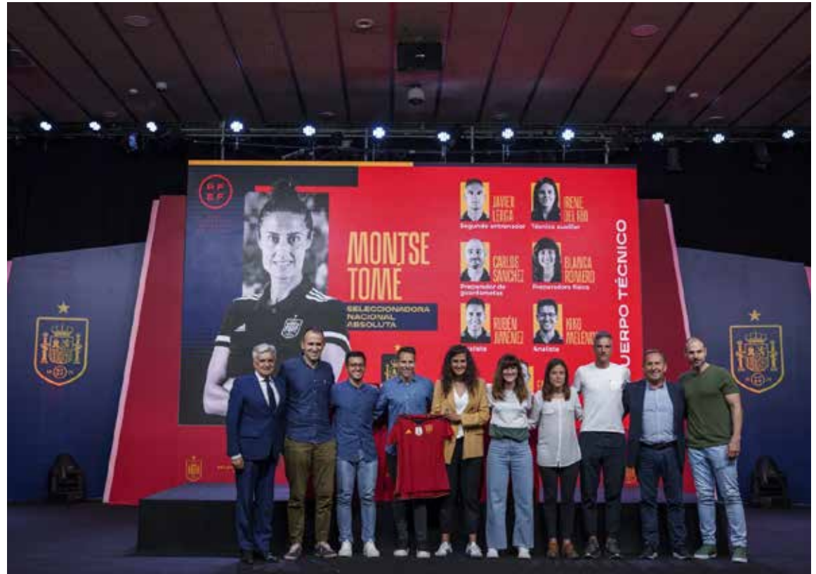
Spain's new women's national team coach Montse Tomé, center, holds a jersey during her official presentation with her technical staff at the Spanish soccer federation headquarters in Las Rozas, just outside of Madrid, Spain, Monday, Sept. 18, 2023. Tomé replaced Jorge Vilda less than three weeks after Spain won the Women's World Cup title and amid the controversy involving suspended federation president Luis Rubiales who has now resigned.

Those punishments would have to be requested by the federation to the government's sports council,