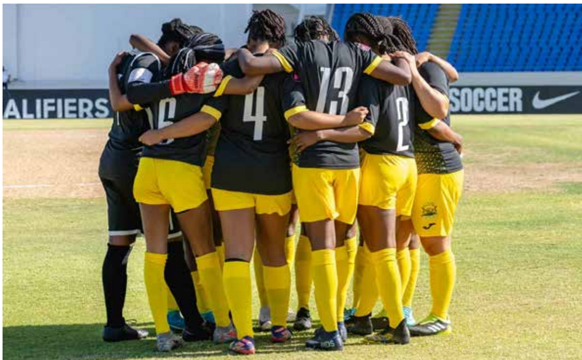
Antigua and Barbuda's Benna Girls will kick off their campaign today in the Concacaf qualifiers against Guyana in their quest to qualify for the group stage of the inaugural 2024 female Gold Cup competition. (File photo)

The inaugural female Gold Cup competition will