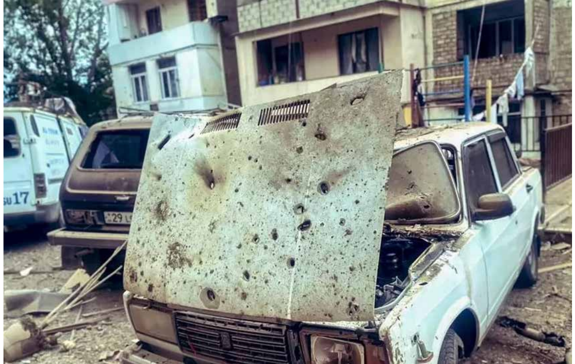
Buildings and vehicles were damaged by shelling in the Karabakh regional capital.

But hundreds of Armenian protesters, frustrated