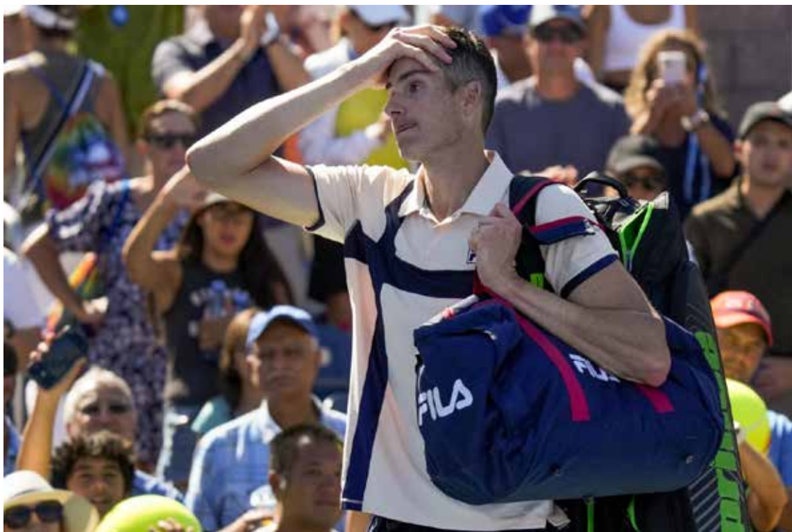
John Isner, of the United States, reacts after losing to Michael Mmoh, of the United States, during the second round of the U.S. Open tennis championships, Thursday, Aug. 31, 2023, in New York.

The 38-year-old Isner, who needed a wild card to get into the main draw at Flushing Meadows, blasted 48 aces and won 86 percent of his first-serve points in a match that also included 63 unforced errors.