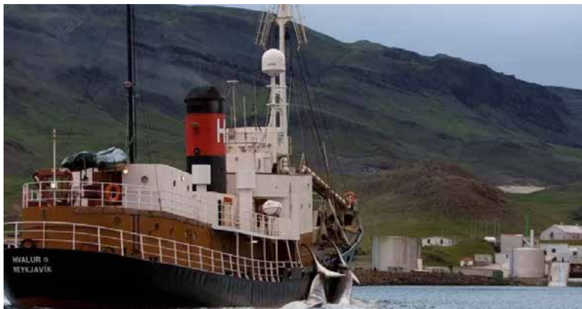
Hvalur is the only company still whaling off Iceland but it will have to follow strict new rules.

The summer whaling season in Iceland is traditionally over by the end of