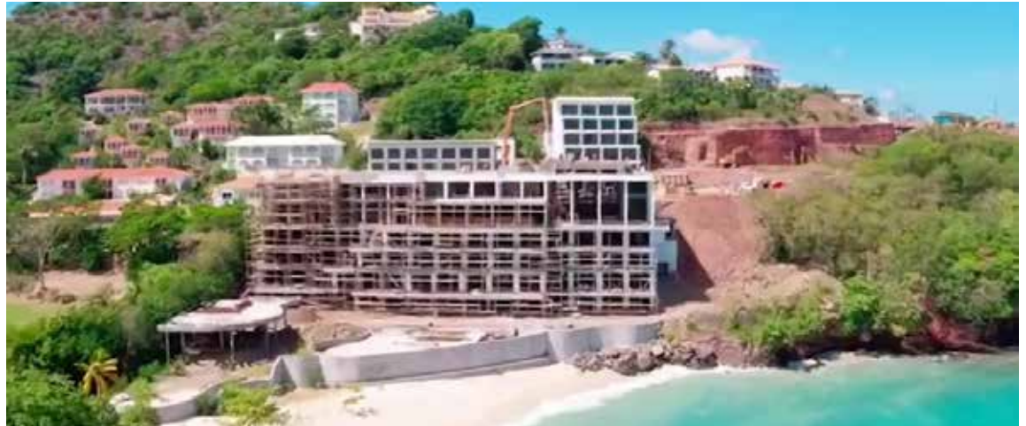
Kimpton Kawana Bay hotel project.