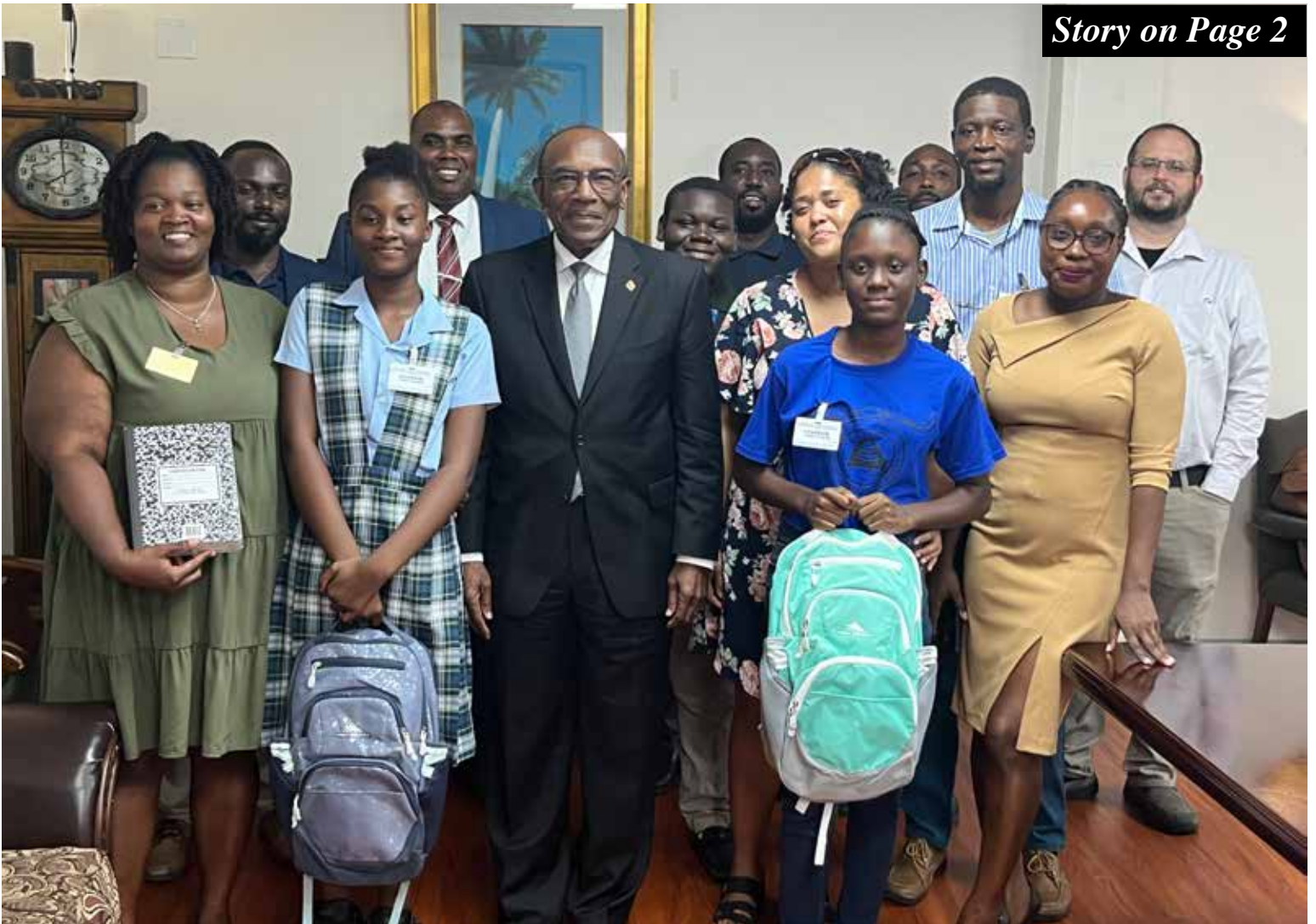
Minister of Health Sir Molwyn Joseph, centre, is flanked by the top two public school students in the Grade Six National Assessment who received more than $8,000.00 in cash and prizes for their achievement.