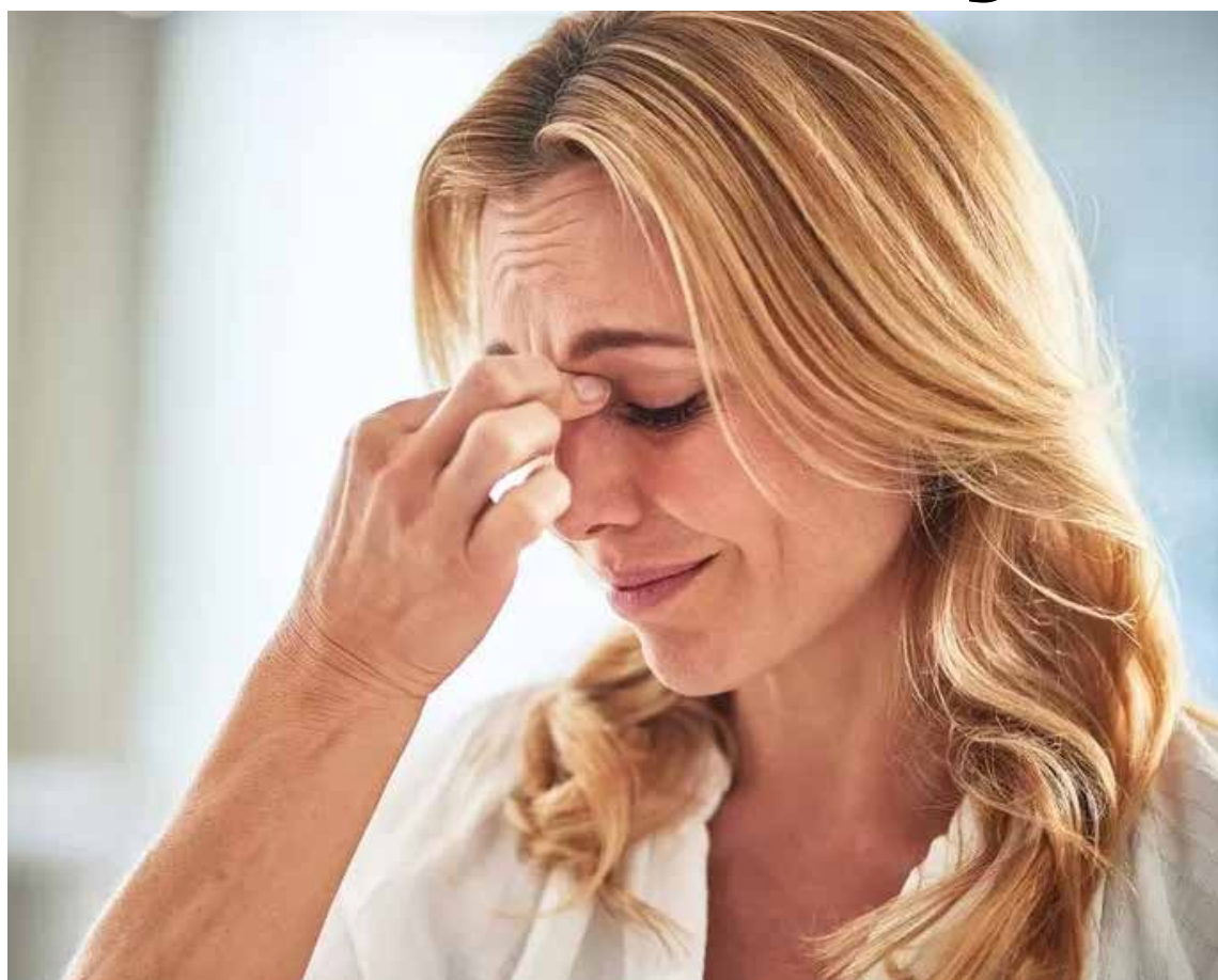
Long Covid can take different forms but why it develops remains unclear.

But there may still be many different causes of