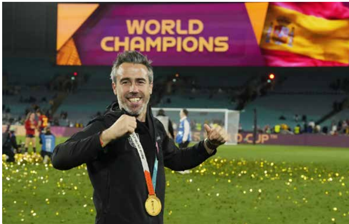
Spain's head coach Jorge Vilda celebrates with the gold medal after the final of Women's World Cup soccer between Spain and England at Stadium Australia in Sydney, Australia, Sunday, Aug. 20, 2023.

The board is also negotiating with women players to end their strike over the Rubiales case, the source said, in a furore that has overshadowed the team's remarkable run at the World Cup culminating in a 1-0 victory over England.