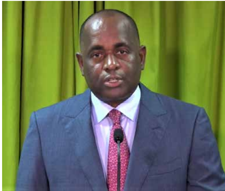
CARICOM Chairman and Dominican Prime Minister Roosevelt Skerrit.

“They have been engaging a wide cross section of