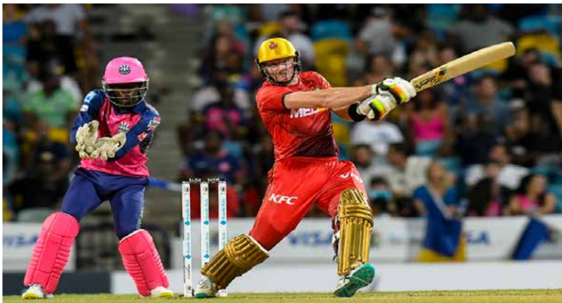
Martin Guptill of Trinbago Knight Riders hits a four during match 13 of the Republic Bank Caribbean Premier League against Barbados Royals at the Kensington Oval in Barbados on Wednesday, August 30, 2023.

The Royals' reply was derailed by Andre Russell, who grabbed three quick wickets in the power-play -