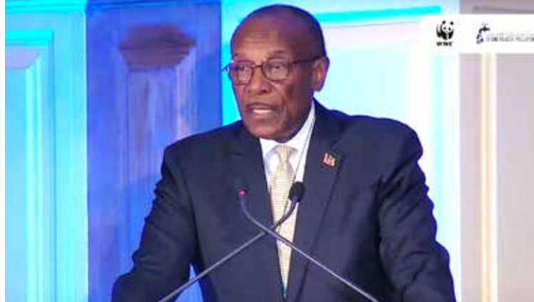
Health Minister, Sir Molwyn Joseph

In response to requests for an update on how soon the new cemetery will become usable, Sir Molwyn