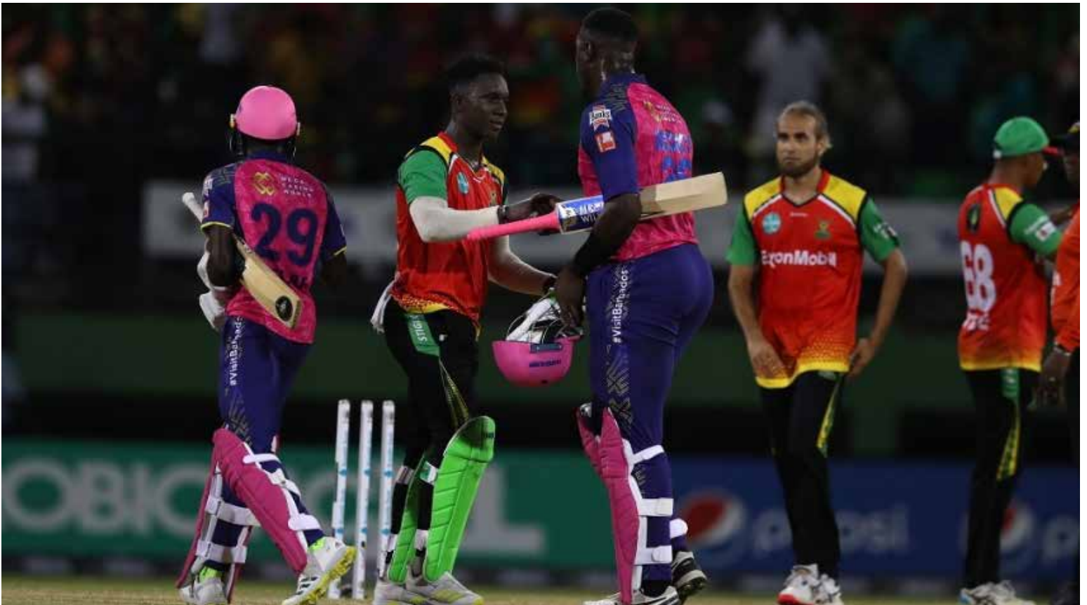
Barbados Royals Carlos Brathwaite, center, congratulates Guyana Amazon Warriors Kevlon Anderson, second left, at the end of their CLP encounter at Providence in Guyana on Sunday, September 17, 2023.