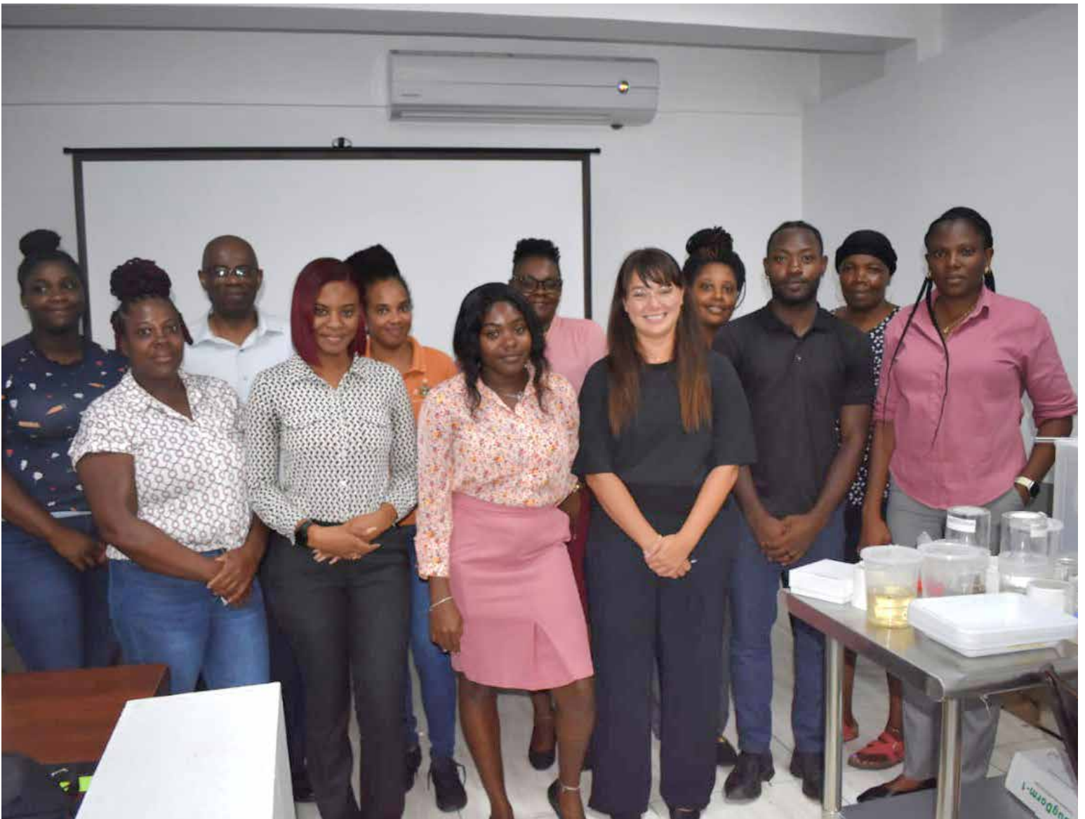
Vector Control Technicians and Laboratory Technicians attached to the Central Board of Health and the Dunbar's laboratory are participating in an Insecticidal Resistance Workshop in collaboration with the Pan American Health Organization/World Health Organization (PAHO/WHO). Story on page 7.