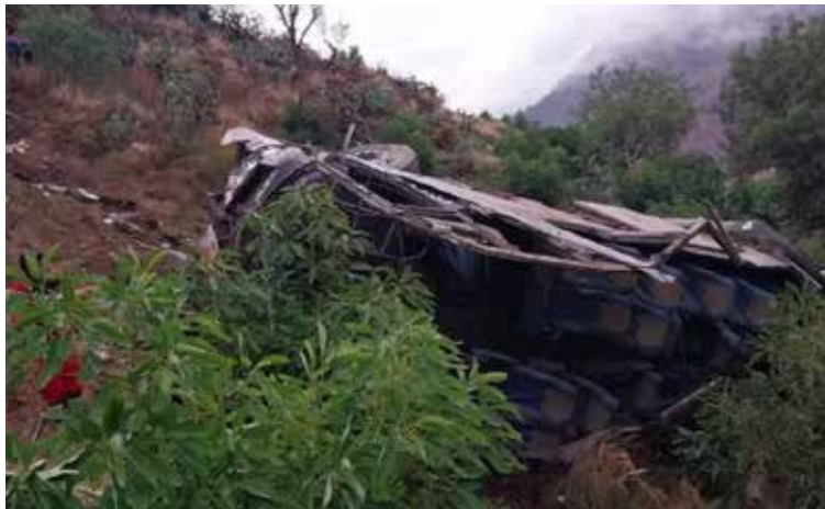
The coach plunged some 200m from a mountain road into a ravine.

So far, officials have not said what might have