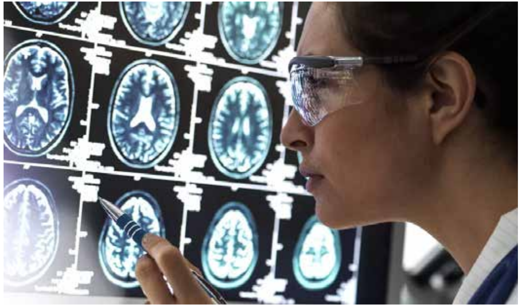
Researchers believe new findings about a form of cellular suicide gives new ideas for treating Alzheimer's.