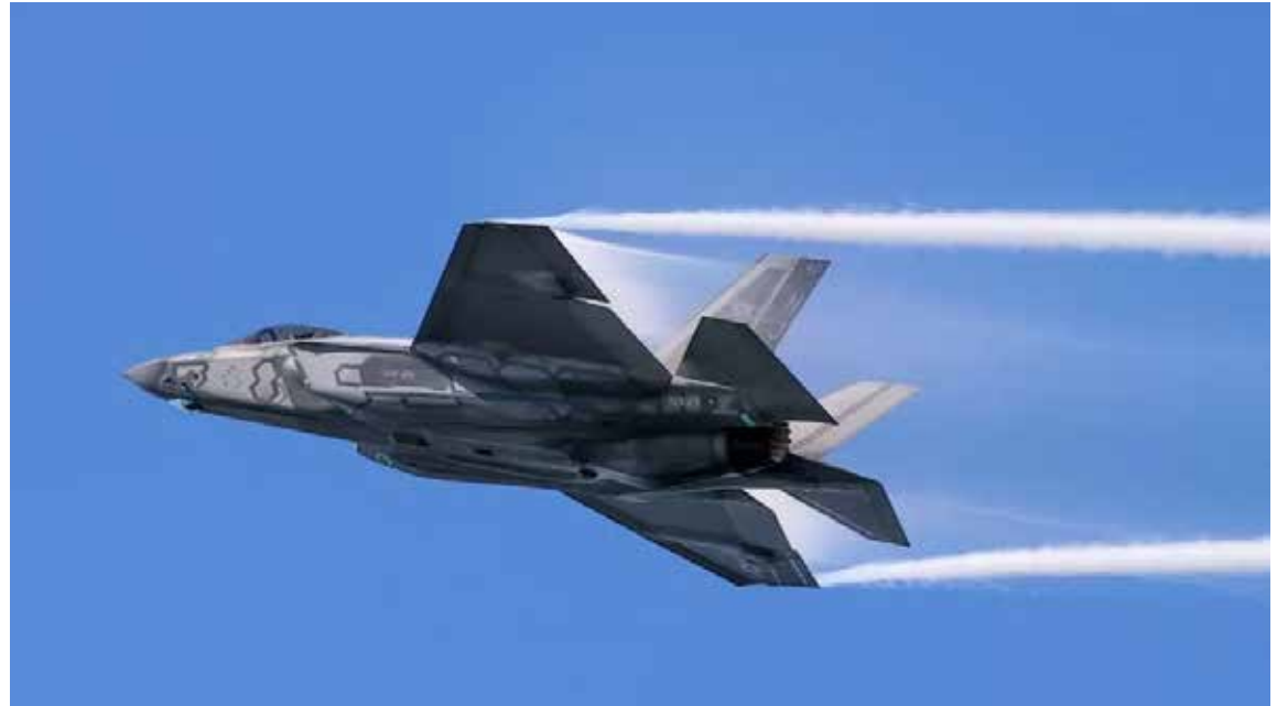
A file photo of F-35 jet seen at San Francisco's fleet week.

The fighter jet was left in autopilot mode when the pilot ejected, a spokesman at Joint Base Charleston