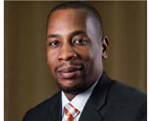
Governor of the Eastern Caribbean Central Bank (ECCB), Timothy Antoine

The Governor wants a society-wide involving in the creation of a strategy to address the issue including the education system. He questioned the efficacy of students passing multiple subjects at