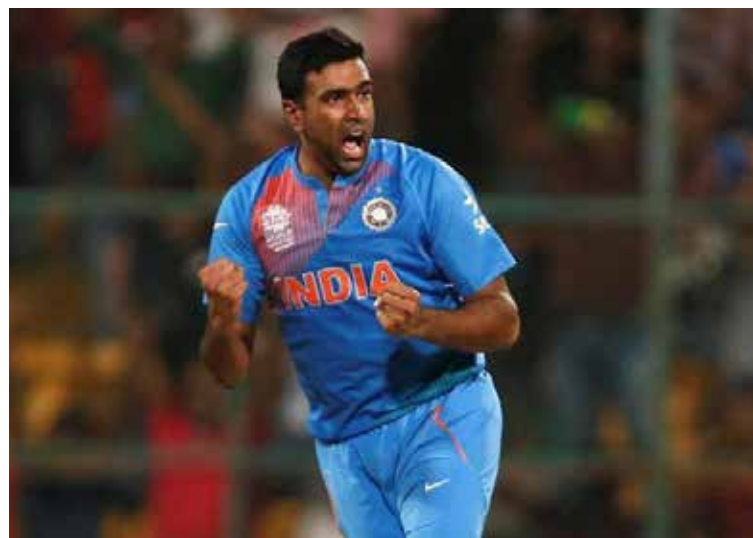
India's spinner Ravichandran Ashwin.

Meanwhile, Axar Patel, who missed the Asia Cup final due to a quadriceps strain, has been named in the squad for the final ODI, but his participation is sub-