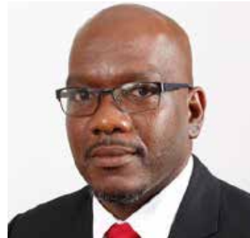
Education Minister, Daryll Matthew

The minister explained that after the drawings for the ABICE complex were completed it was recognised that the 4-million pounds allocated by Harrison would not be sufficient. However, the ministry took a decision that rather than scale down the building to continue and that