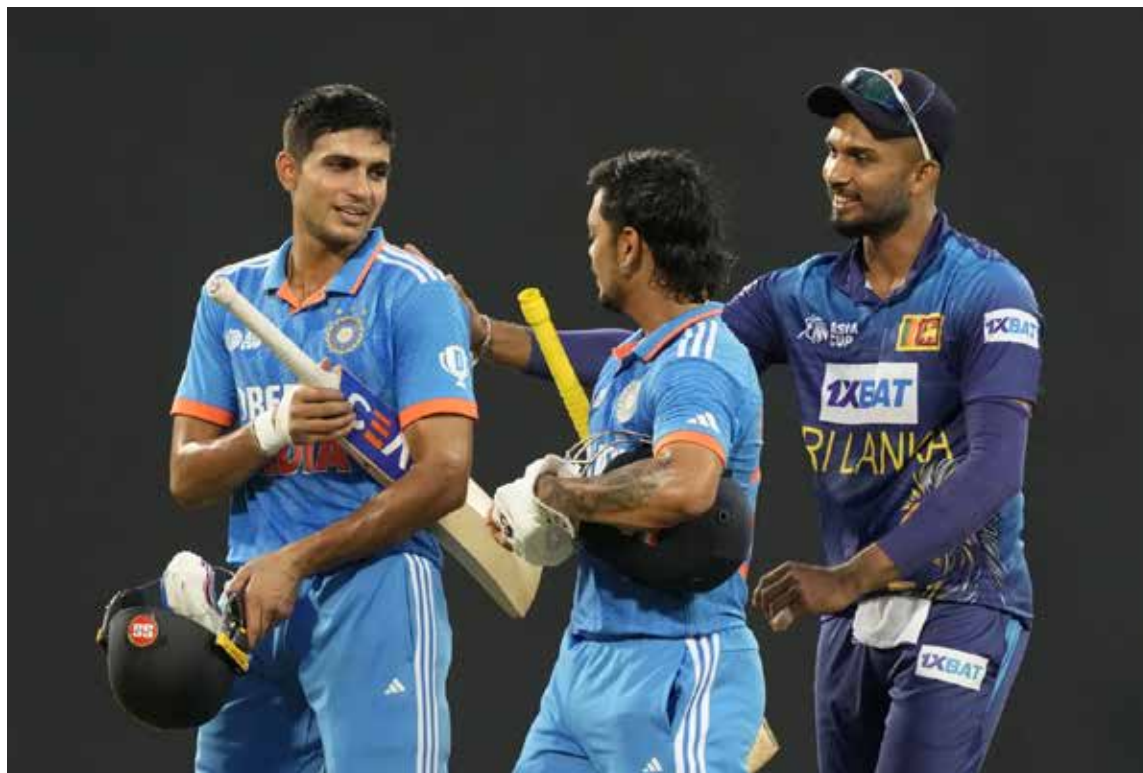
Sri Lanka's captain Dasun Shanaka, right, congratulates India's Subhman Gill, left, and Ishan Kishan after India won against Sri Lanka during the Asia Cup final cricket match in Colombo, Sri Lanka, Sunday, Sept. 17, 2023.

ets last time I played Sri Lanka (earlier this year), but unfortunately, I could not register a five-wicket haul.