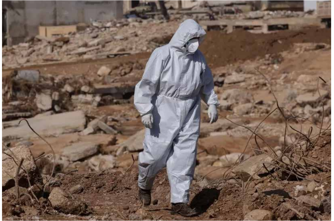
The Greek rescuers were travelling to join other international teams in Derna (file image).

Libya is split between two rival governments - a UN-backed administration based in the capital Tripoli,