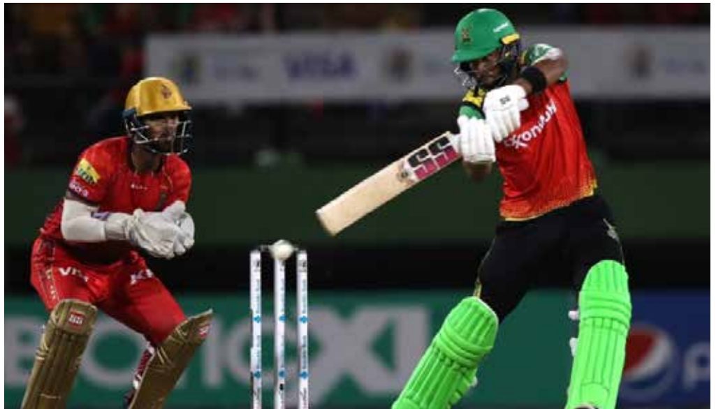
Guyana Amazon Warriors batsman Shai Hope bats against the Trinbago Knight Riders in the Caribbean Premier League (CPL) at Providence in Guyana on Saturday, September 16, 2023.

In reply, the Amazon Warriors got off to the best possible start in the Power-Play. Openers Odean Smith and Saim Ayub guided the Warriors to 56 at the end of six overs. But Ayub fell immediately after the fielding restrictions were lifted, skying a delivery from Akeal Hosein and was caught.