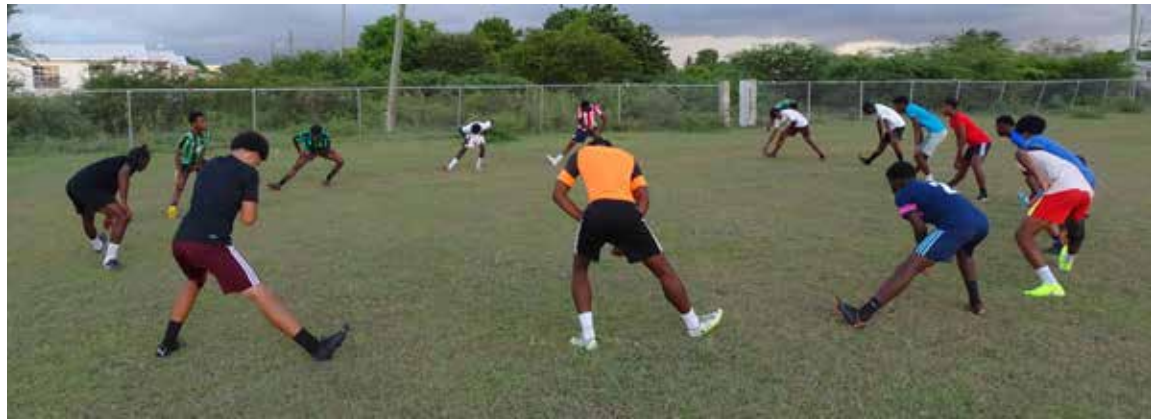
Members of the Villa Lions team engage in a warm-up exercise during a training session at the Fort Road playing field earlier this month.