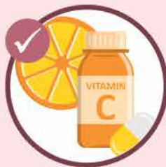
VITAMINS AND MEDICATION