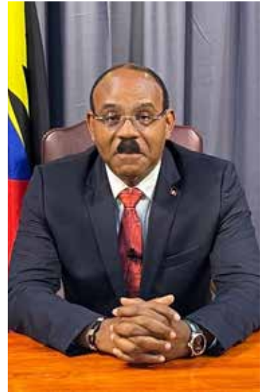
Prime Minister Gaston Browne

Browne added that ECAB growth has been due largely to its consolidation with ABI Bank and the purchase of Scotiabank a few