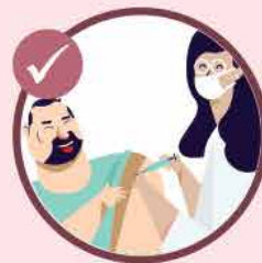
FLU SHOT/ VACCINATION