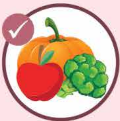
HEALTHY FOODS, FRUITS & VEGETABLES