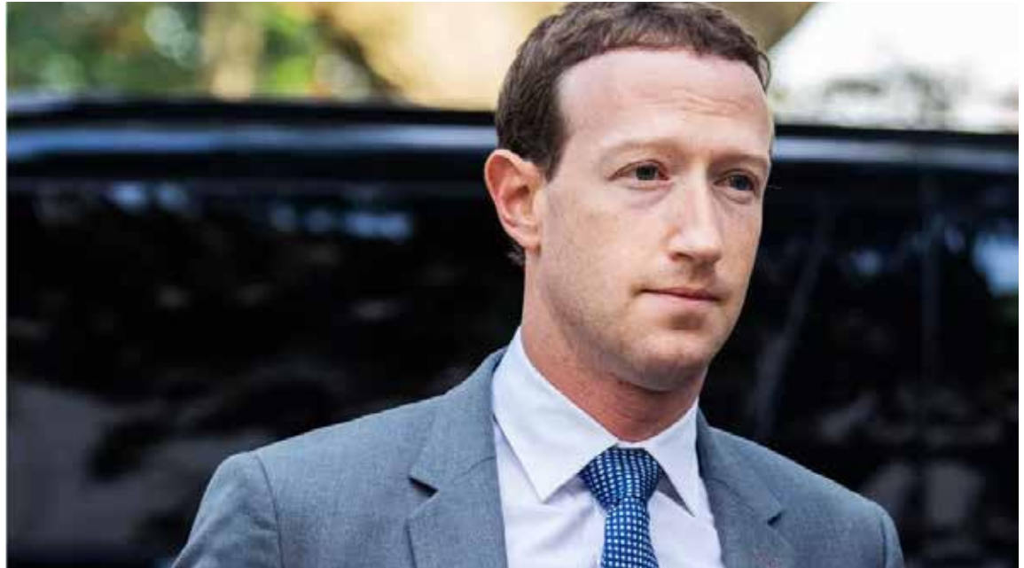
Meta CEO Mark Zuckerberg said Congress needs to support AI innovation and safeguards.

In May, Sam Altman, the CEO of OpenAI, the company behind ChatGPT, testified before a US Senate committee, describing the potential pitfalls of the new technology.