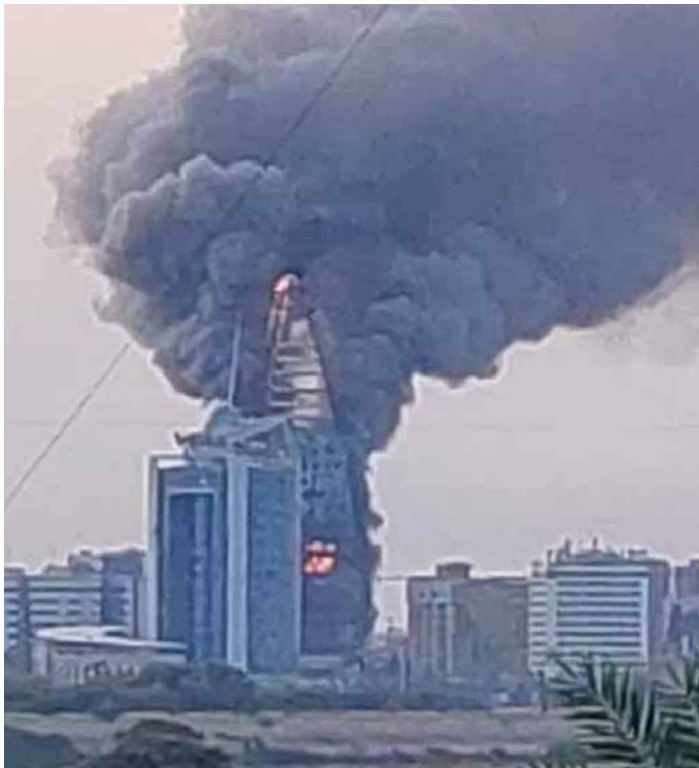
The RSF has been fighting to take control of Sudan's capital.

The Sudan War Monitor, which provides analysis of the conflict, said the RSF had attacked areas controlled by the army on Saturday, including an office block at the justice ministry. Several government buildings are reported to have caught fire