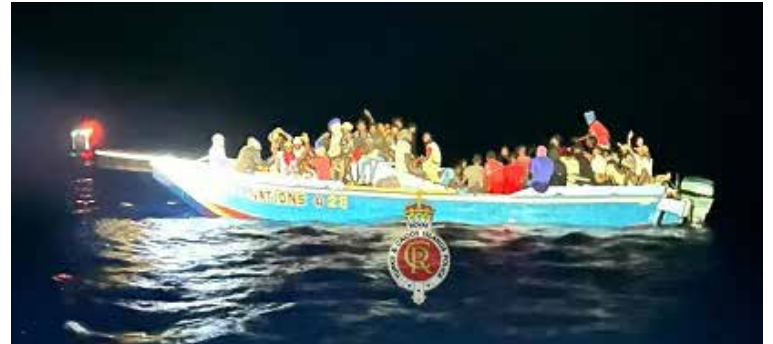
Haitian nationals stopped near TCI.