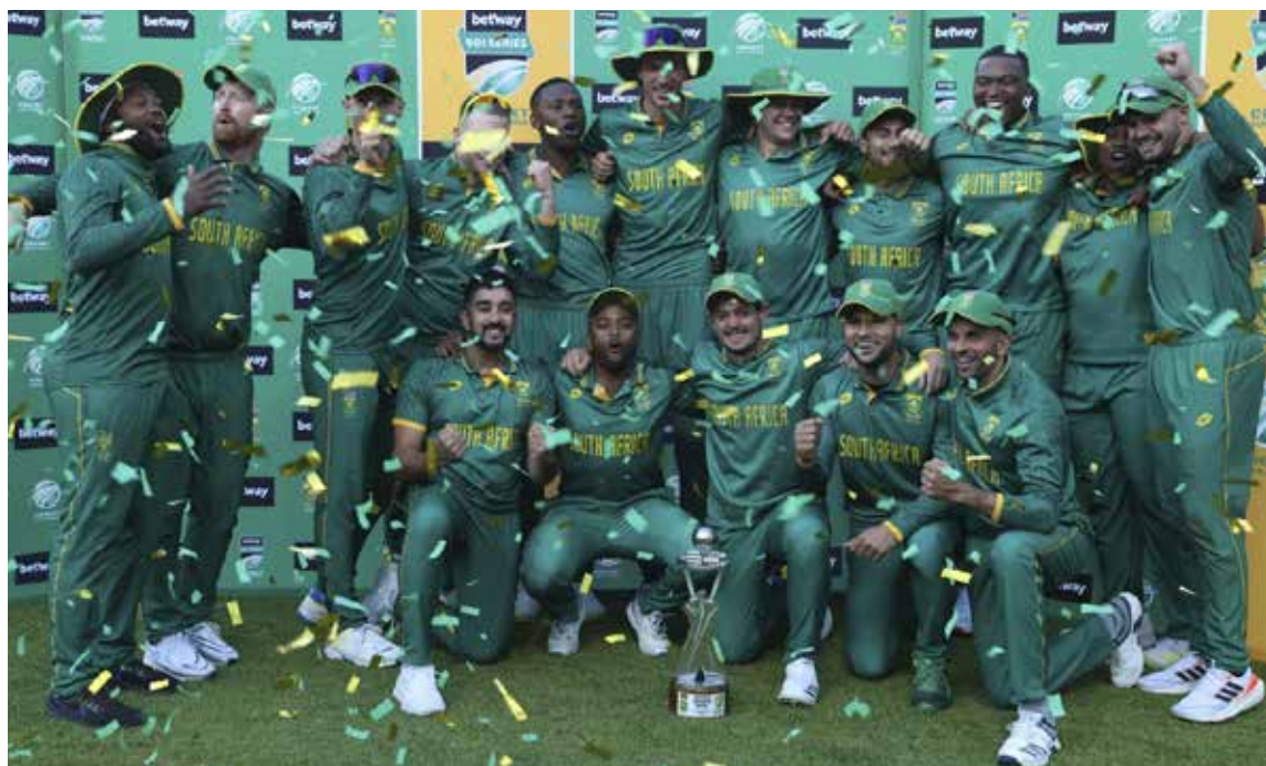
South Africa cricket team celebrates their 3-2 series win against Australia at the Wanderers Stadium in Johannesburg, South Africa, Sunday, Sept. 17, 2023.

The new ball seamed around early in the thin Highveld air and saw South Africa struggle with opener Quinton de Kock, who has announced his retirement from ODIs after the World Cup, out cheaply in his last home innings.