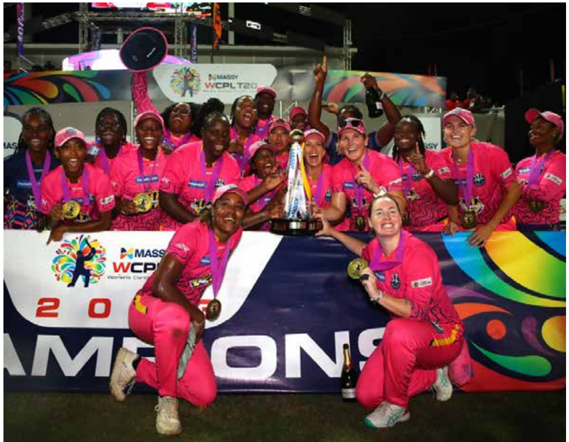
Barbados Royals celebrate after being crowned the 2023 Women's Caribbean Premier League champions.