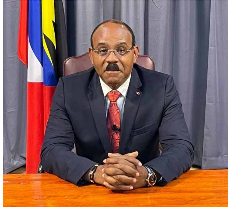
Prime Minister Gaston Browne

Honourable Gaston Browne, Prime Minister of Antigua and Barbuda is leading a delegation in helping to plead the case cont'd on pg 6