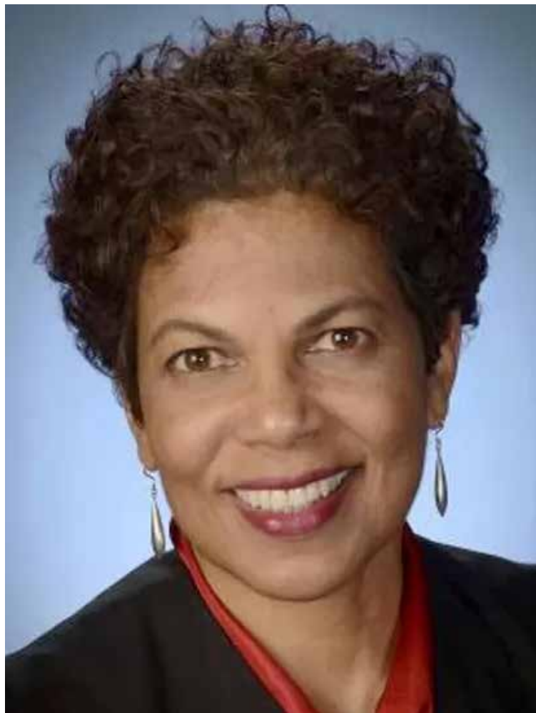
Judge Tanya Chutkan was appointed in 2014.

Under US federal law, any judge of the United States must voluntarily recuse themselves in any proceeding in which their impartiality might reasonably be questioned.