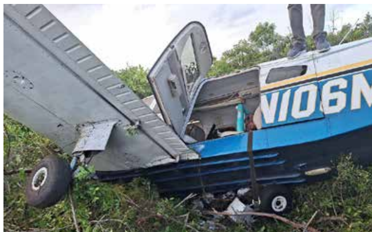
Abaco plane crash

The AAIA said that the crash occurred shortly after the plane at 4.10 pm (local time), with five people on board including the pilot, took off from Leonard Thompson International Air-