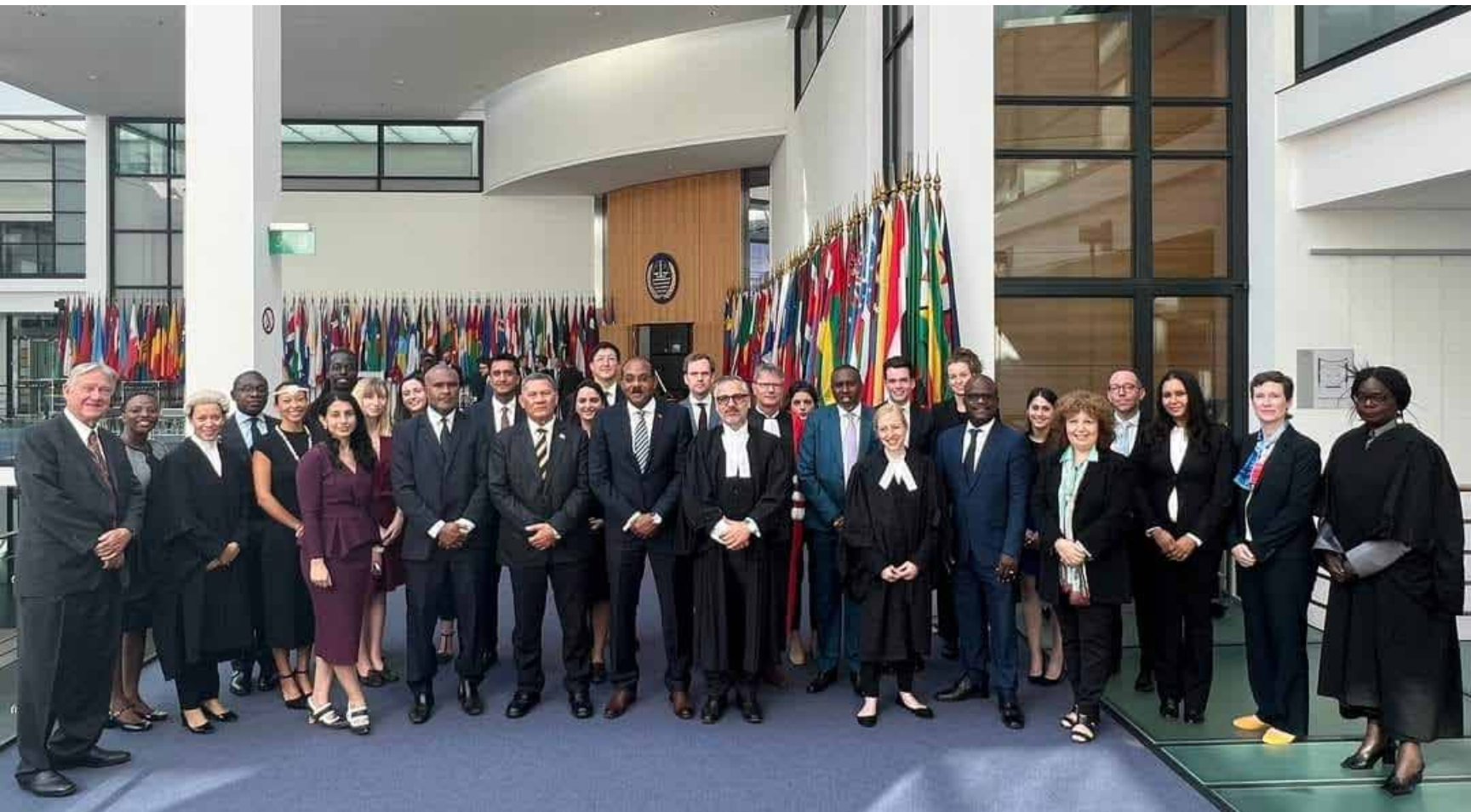
Prime Minister Gaston Browne is leading a delegation in helping to plead the case of island nations for climate justice before the International Tribunal for the Law of the Sea (ITLOS) in Hamburg, Germany. Story on page 5.