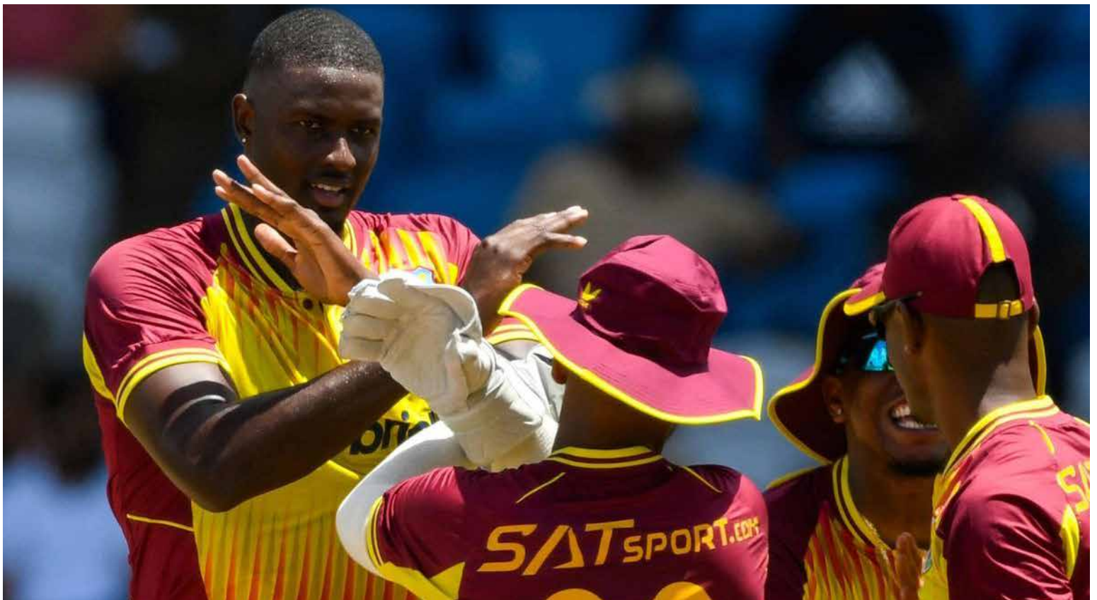
West Indies pacer Jason Holder, left, celebrates the dismissal of Suryakumar Yadav of India during the first T20I match between West Indies and India at the Brian Lara Cricket Academy in Tarouba, Trinidad and Tobago, on August 3rd, 2023.