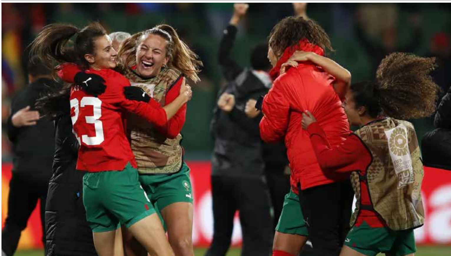
Players of Morocco celebrate after the Women's World Cup Group H soccer match between Morocco and Colombia in Perth, Australia, Thursday, August 3rd, 2023.