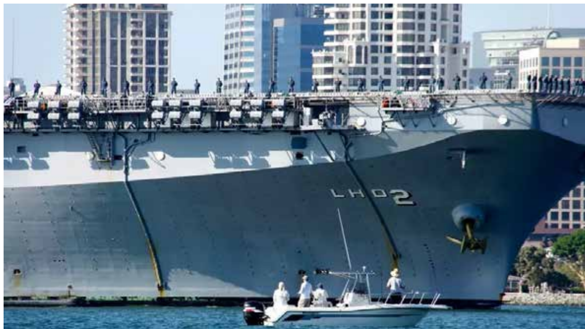
One of the suspects served on the USS Essex, shown here near San Diego in a file photo from 2012.

The agent paid Mr Wei, who also goes by the name