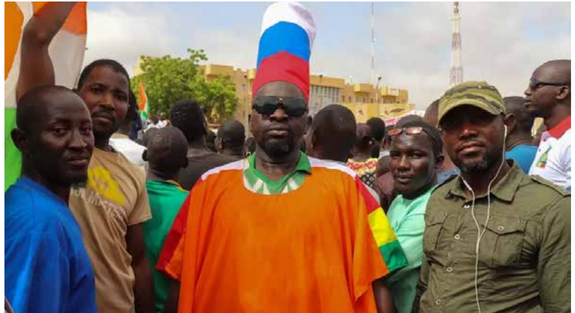
A supporter of the coup wears a hat in the colours of the Russian flag during a rally in the capital on Thursday.

"Fighting for our shared values, including democratic pluralism and respect for the rule of law, is the only way to make sustainable progress against poverty and terrorism," Mr Bazoum wrote.