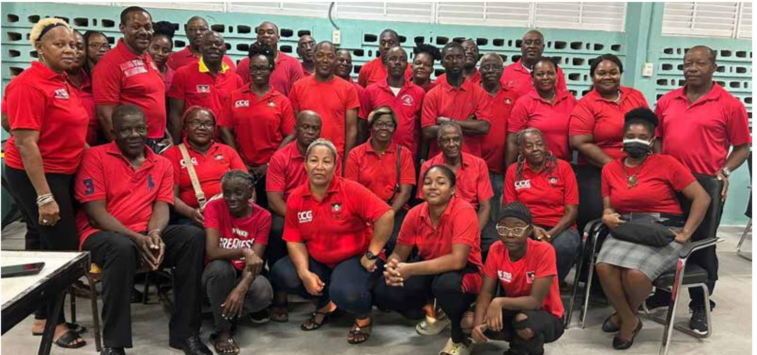
The national domino team, the Wadadli Warriors, will be representing Antigua and Barbuda at the 19th World Council of Domino Federation's Championship in Guyana later this month.