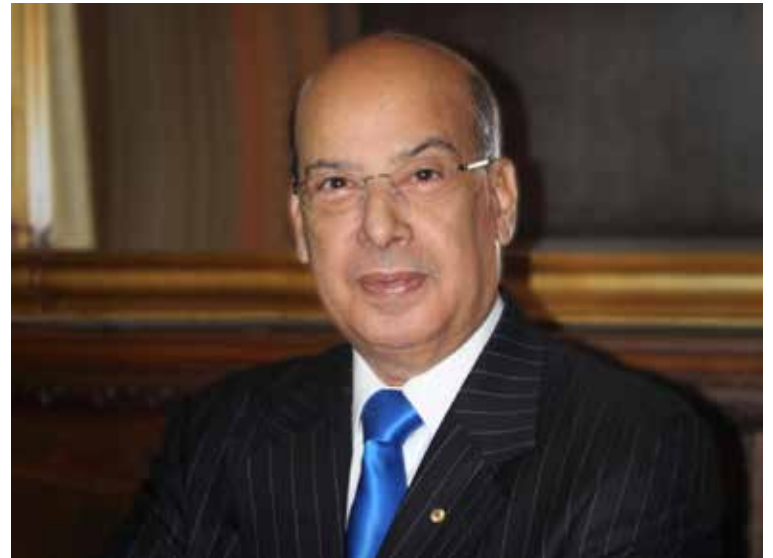
Sir Ronald Sanders

For its part, the Kenyan government has said that it is ready to deploy 1,000 police officers to help train and assist Haiti's police to "restore normalcy in the country and protect strategic installations". The form of assistance was not clarified, and the government also made it clear that its "proposed deployment will crystallize" once it gets a mandate from the U.N. Security Council "and other Kenyan constitutional processes are undertaken".