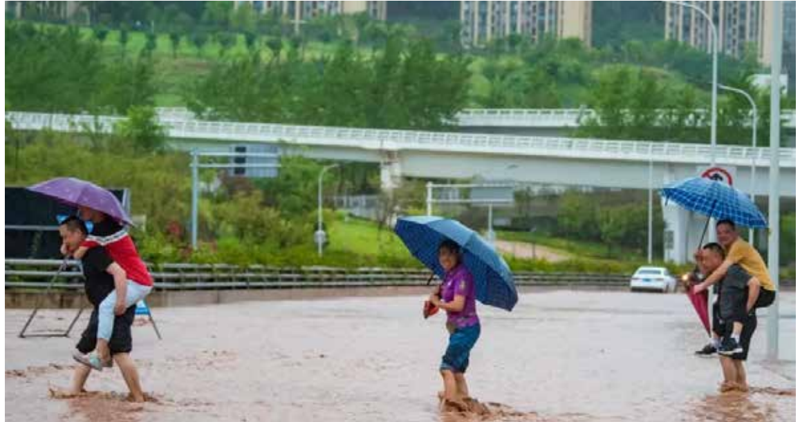
China has borne the brunt of a ferocious start to the Pacific typhoon season.

have long warned that global warming would increase the intensity and frequency of storms and heatwaves, both of which have hit parts of Asia in the past month.