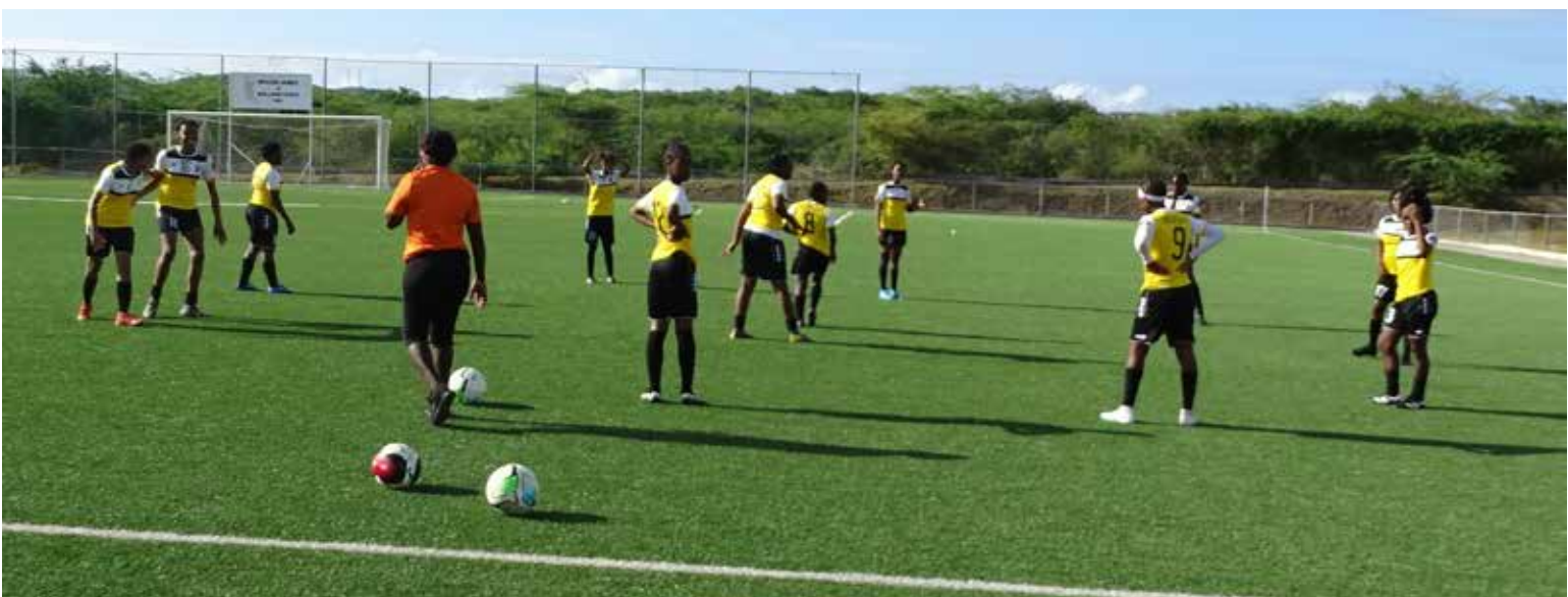
The national Under-17 Girls team in training at the ABFA's Technical Center at Paynters on Tuesday, August 1st, 2023.