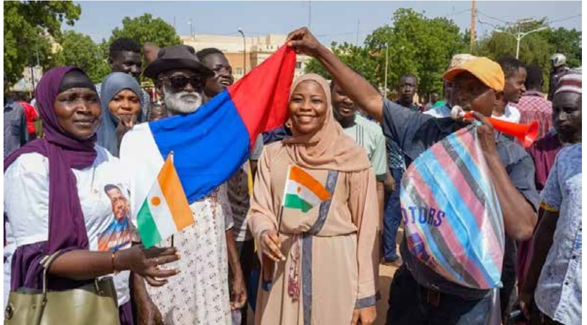
Protesters with a Russian national flag and Niger's flags during a rally in Niamey on Sunday.

France, the former colonial power in Niger, and the EU have already suspended financial and development aid.