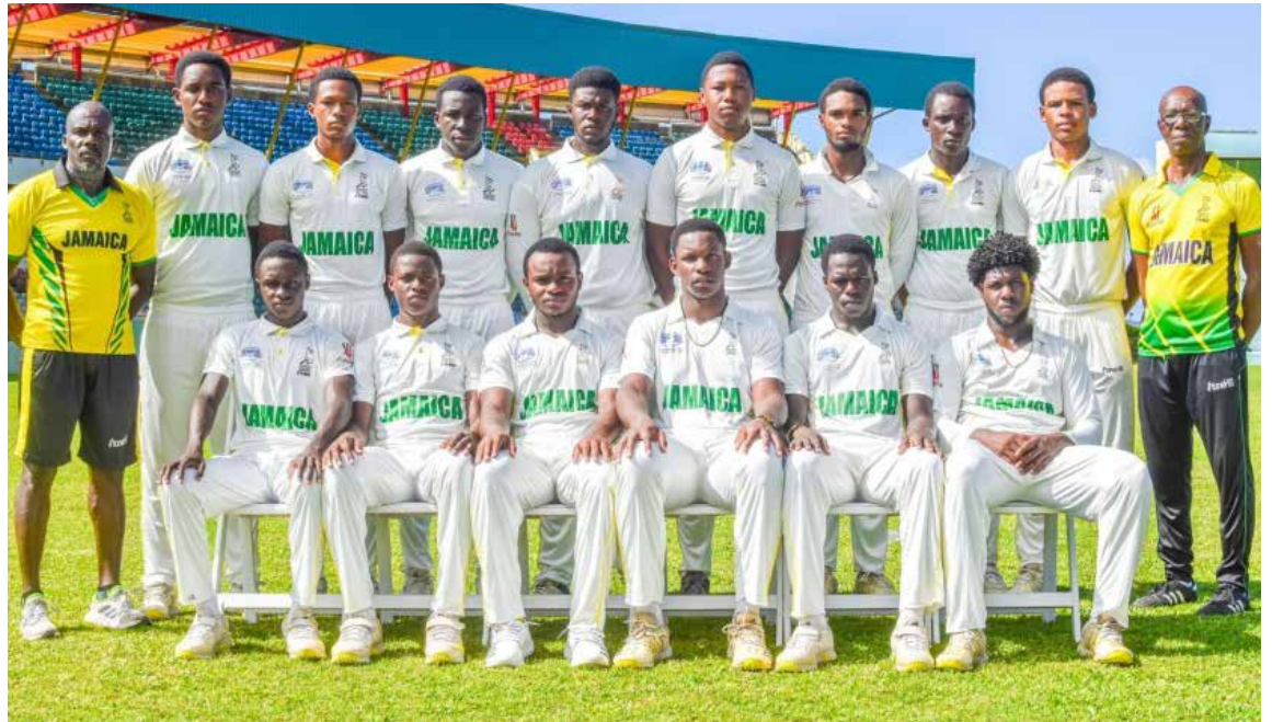
Jamaica defeated Barbados by 56 runs to complete the double in the Cricket West Indies Rising Stars Men's Under-19 Championship.

Resuming the morning on four without loss and an