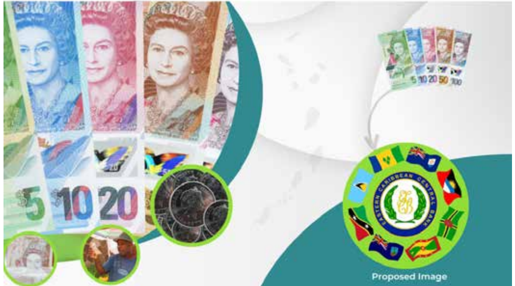
Proposed image from ECCB.

Recommendations can be sent by direct message to the ECCB Connects Facebook Page, by email to newECim-age@eccb-centralbank.org .