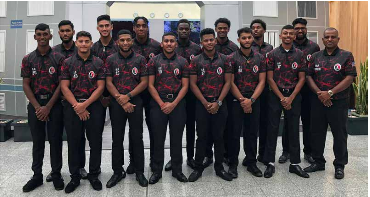
The Trinidad and Tobago Under-19 Cricket Team.