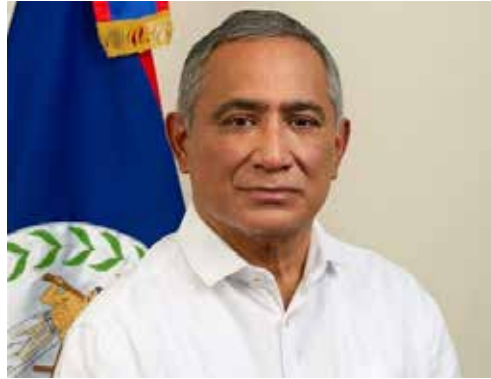
Prime Minister of Belize, John Briceño.

“This decision was reached after an informed discussion in Cabinet and after receiving legal advice from multiple attorneys of international repute,” the statement said, adding that Cabinet had further determined that the government should proceed to meet with the parties “with a view to negotiate or