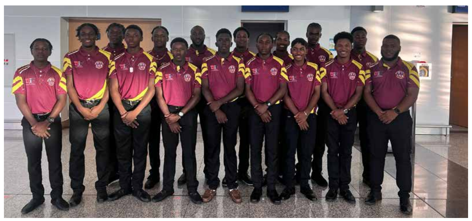
The Leeward Islands Under-17 Cricket Team. (File photo)