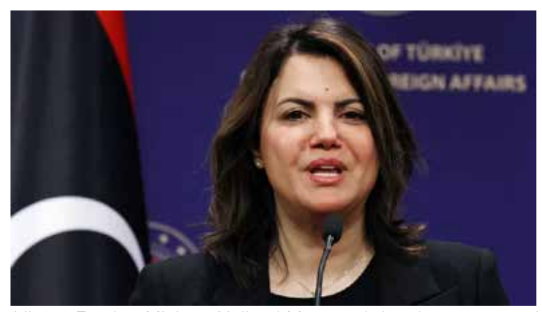
Libyan Foreign Minister Najla al-Mangoush has been accused of grand treason and referred for investigation.

The statement was also unusual in its level of detail, perhaps intended to offset any anticipated denial from the Libyan side - also by identifying and