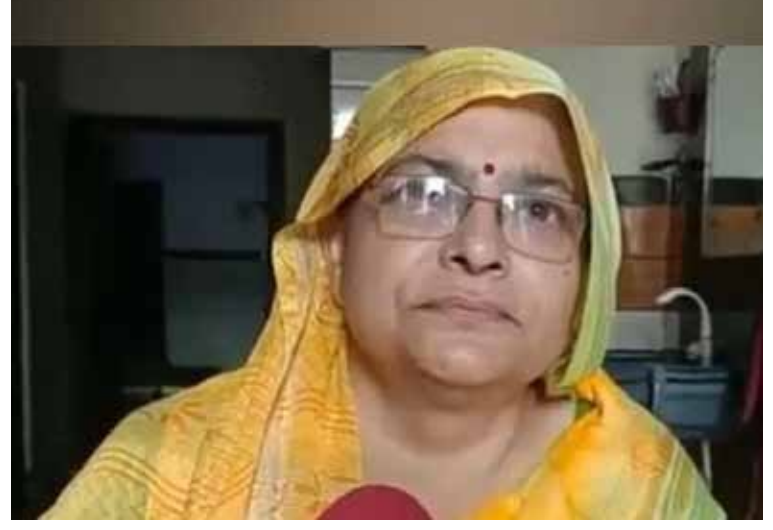
The teacher has been accused of making anti-Muslim remarks and asking students to hit their classmate.

An unnamed official told the Indian Express