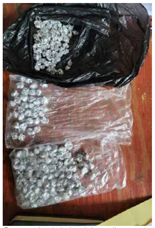
Drugs seized during joint police operation in SVG.

In St Vincent and the Greandines, a joint police operation between the Rapid Response Unit, the Narcotics Unit and the Special Services Unit in Paul's Avenue resulted in the arrest of eight persons and the seizure of 182 rocks of Cocaine, a quantity of Cannabis, and the sum of US$448, EC$2,270 ECC and BB$20.