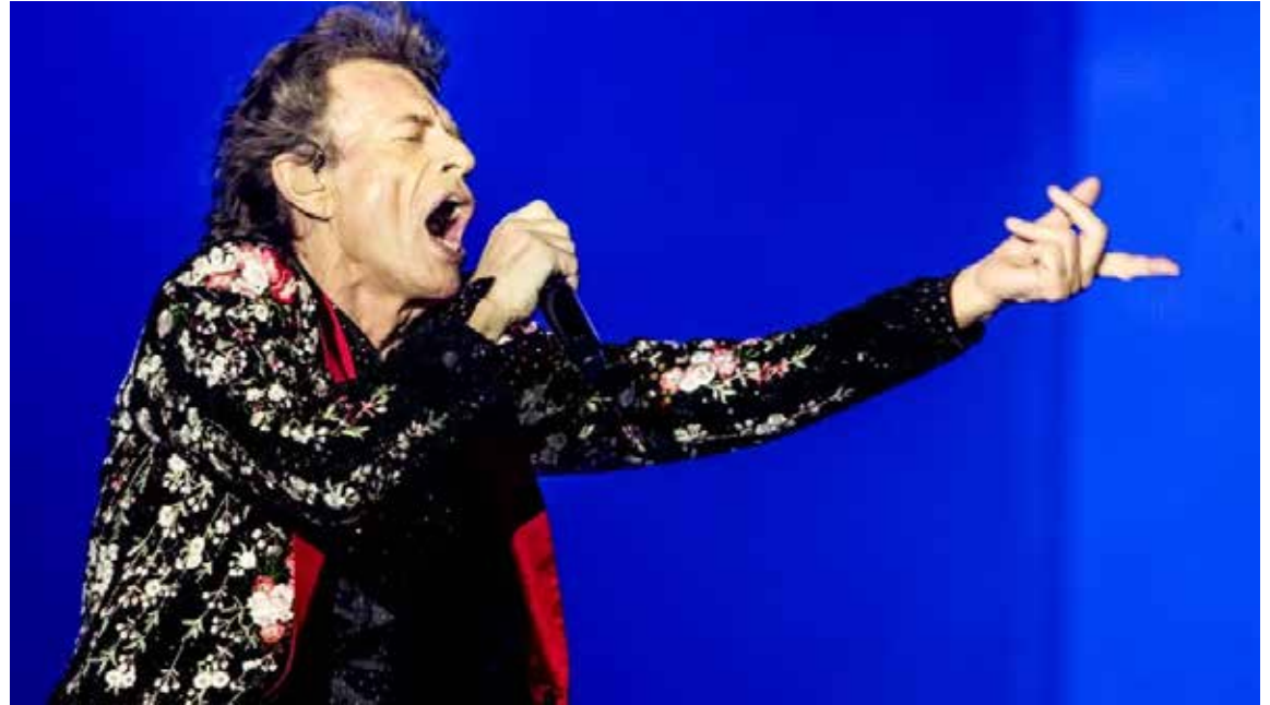
Sir Mick Jagger paid an emotional tribute to the band's late drummer on their US tour last year.

If they do, they hear a recorded message that says: