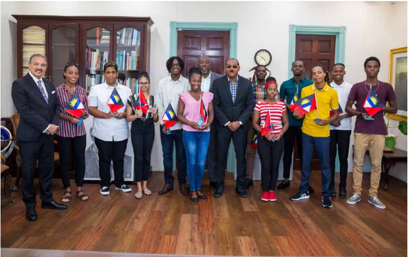
Eleven students who secured scholarships to pursue studies in the People's Republic of China are traveling today (Thursday) to begin their study programmes, with the full blessings of the Antigua and Barbuda Cabinet. Story on page 6.