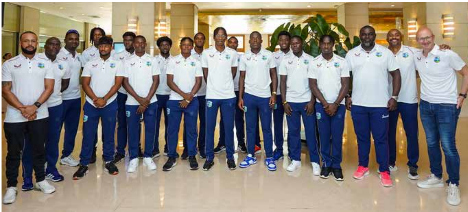
The members of the West Indies Rising Stars Men's Under-19 team have arrived in Sri Lanka.