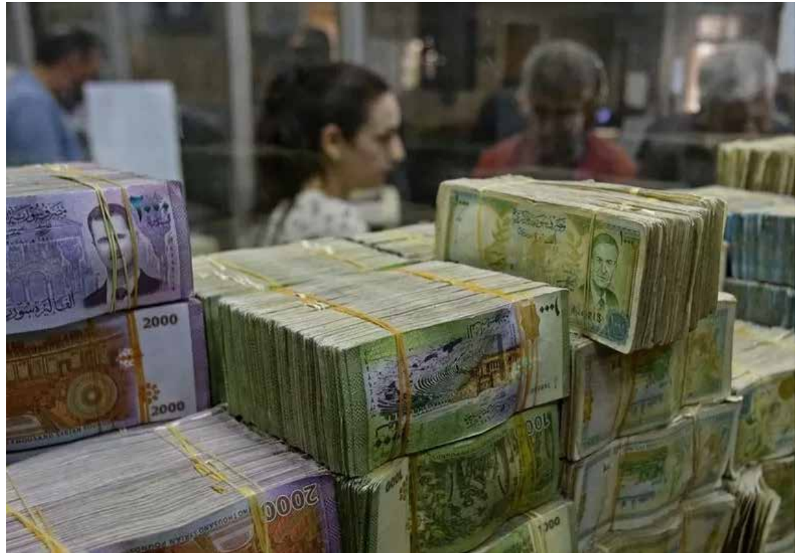
At the start of the civil war, one US dollar was worth 47 Syrian pounds. Now, it is worth 15,000.

all minimum monthly wage for all workers at 185,940 Syrian pounds, which is worth $21.76 (£17.09) at the official exchange rate of 8,542 and $12.40 at the current parallel market rate of 15,000. At the start of the war, a dollar was worth 47 Syrian pounds.