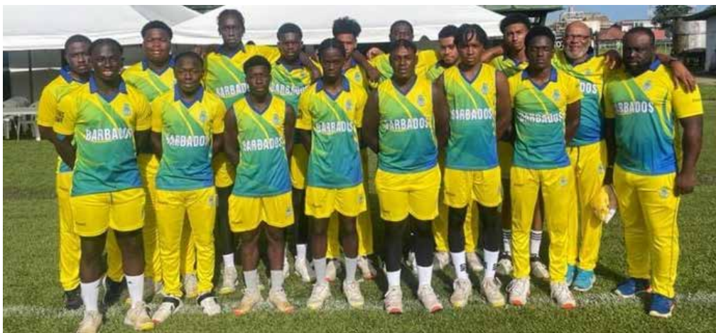
The Barbados Under-17 cricket team.

The opening round will see Trinidad and Tobago hosting the Leeward Islands at Inshan Ali Park, the Windward Islands will meet Barbados at PowerGen and Jamaica and Guyana will do battle at the National Cricket Centre in Couva.