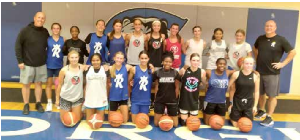
Players of the CPTSA Wings basketball team with the Simcoe Muskoka Royals team following a session at the Georgian College facility in Barrie, Canada, on Monday, August 20th.

The Tough Gals will be training with several other clubs throughout their week-long stay in Ontario,