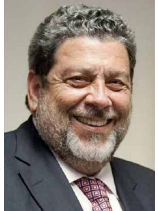
Prime Minister of St Vincent and the Grenadines, Dr Ralph Gonsalves.

"I had to buy a new ticket to get to my destination. When I asked how am I gonna be refunded, a rude reply was 'go to reservation'. How inconvenient!"