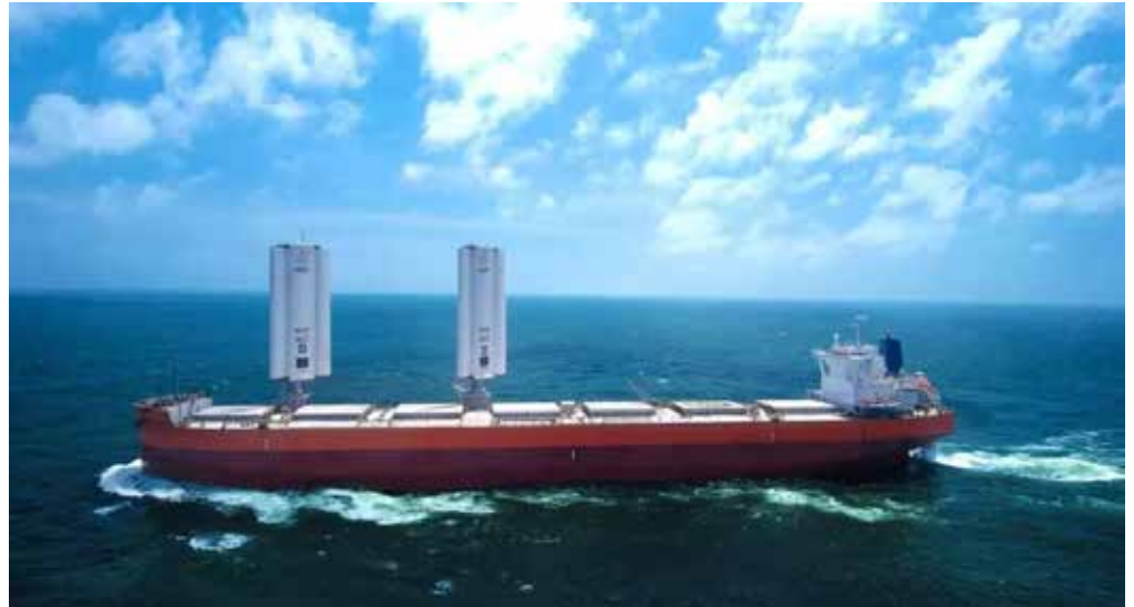
The ship at sea trying out its sails.

"Five years later, I think the narrative has changed completely and everybody is really convinced that they need to do their part - everybody is just