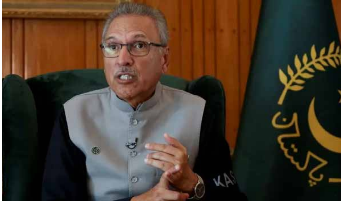
Pakistan President Arif Alvi has denied signing two controversial bills.

The disputed bills were sent to President Alvi before parliament was dissolved on