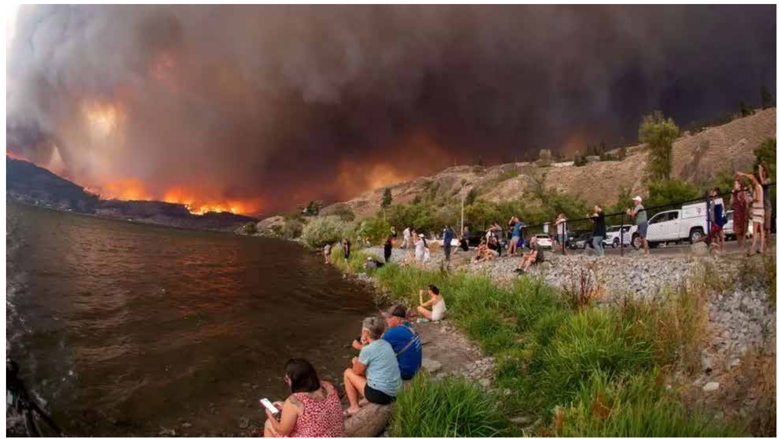
One Kelowna resident told the BBC the fires came over the mountainside like an "ominous cloud of destruction".