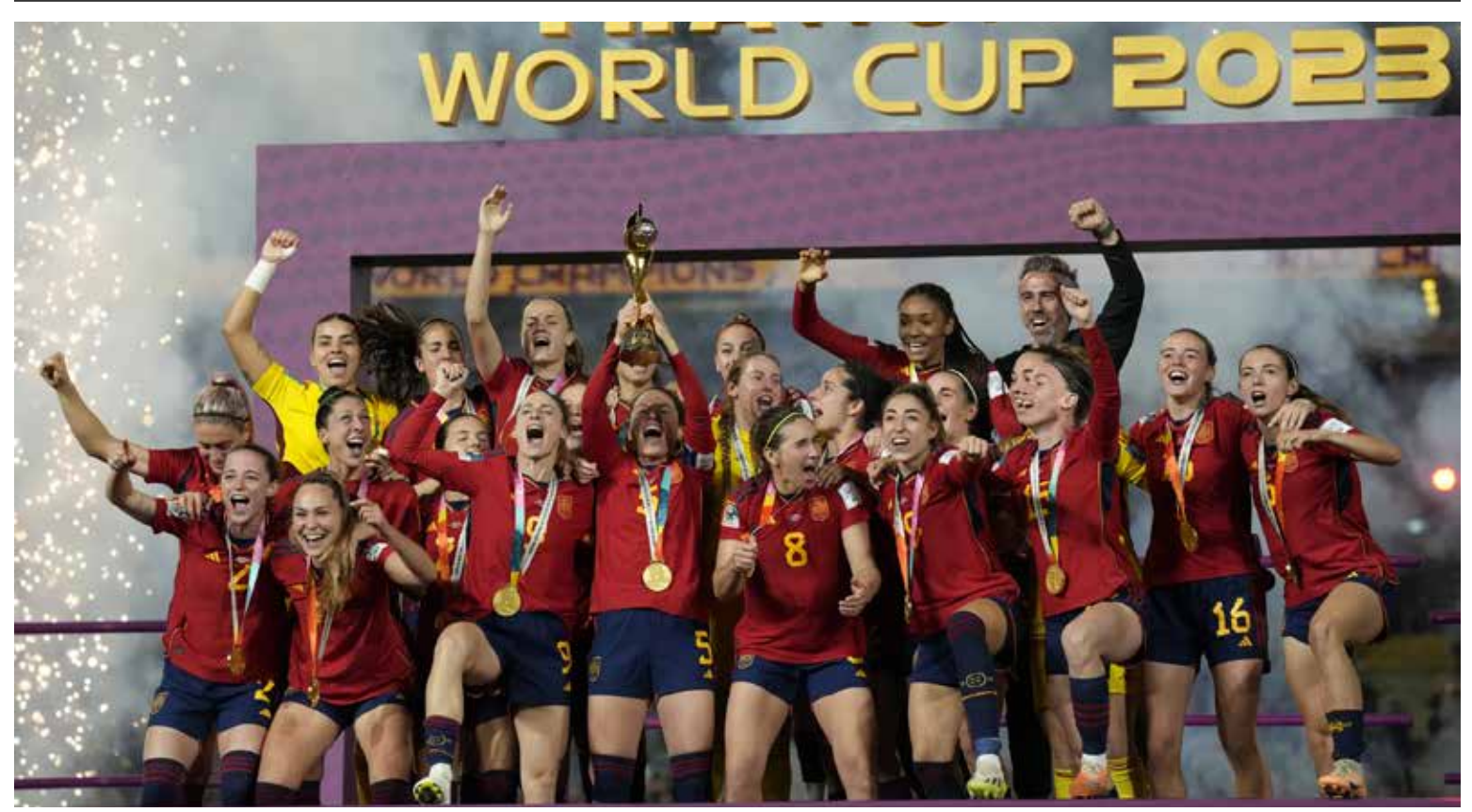
Team Spain celebrates after winning the Women's World Cup soccer final against England at Stadium Australia in Sydney, Australia, Sunday, Aug. 20, 2023.