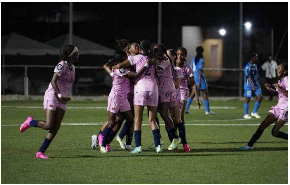
The players of the Bermuda team celebrate after scoring one of their two goals against Antigua and Barbuda in the 2023 CFU Girls' U14 Challenge Series at the ABFA Technical Center at Paynters on Friday, August 18, 2023.

Barbados broke the deadlock in the 32nd min-