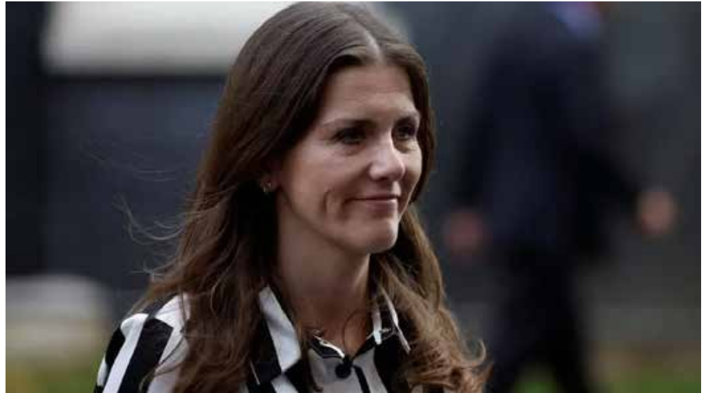
Michelle Donelan MP, Secretary of State for Science, Innovation and Technology.

Ms Donelan claimed the government was not anti-encryption and access would only be requested as a last resort.