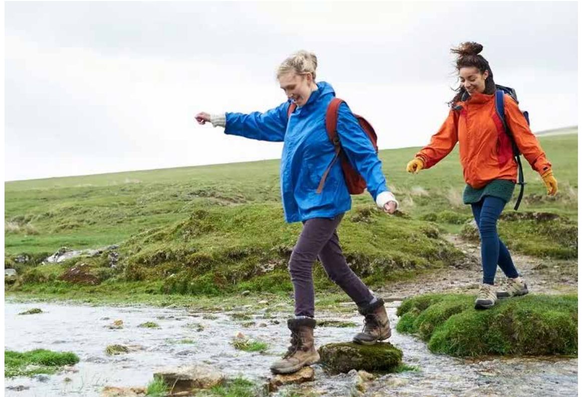
Walking is key to reducing the risk of premature death, according to a new study.

"I believe we should always emphasise that lifestyle changes, including diet and exercise, which was a main hero of our analysis,