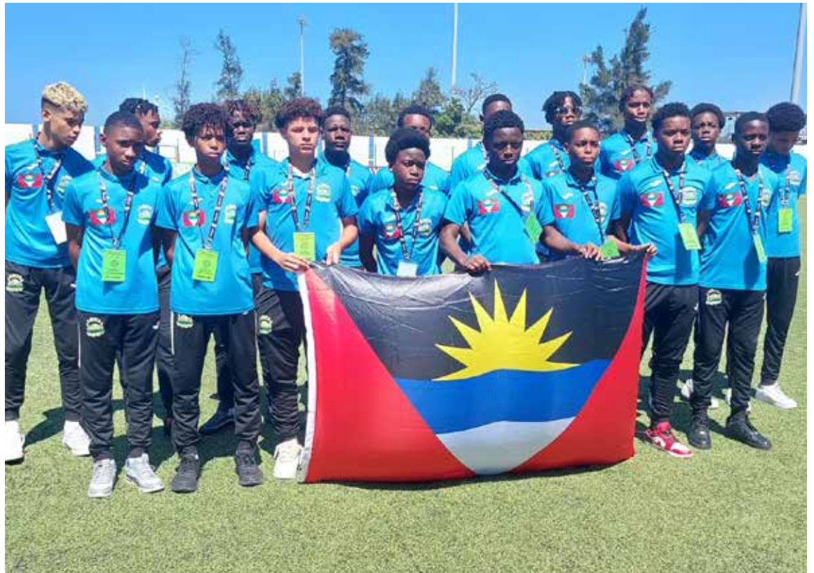
The Antigua and Barbuda's young Benna Boys at the CONCACAF Boys' Under-15 Championship, which is being hosted at two stadiums in Curacao, the Ergilio Hato Stadium and the Stadion Rignaal Jean Francisca, from August 6th to 13th.

But despite the result, the Antigua and Barbuda Benna Boys advance to the quarter-finals after finishing as runners-up behind League B, Group H winners Curacao.