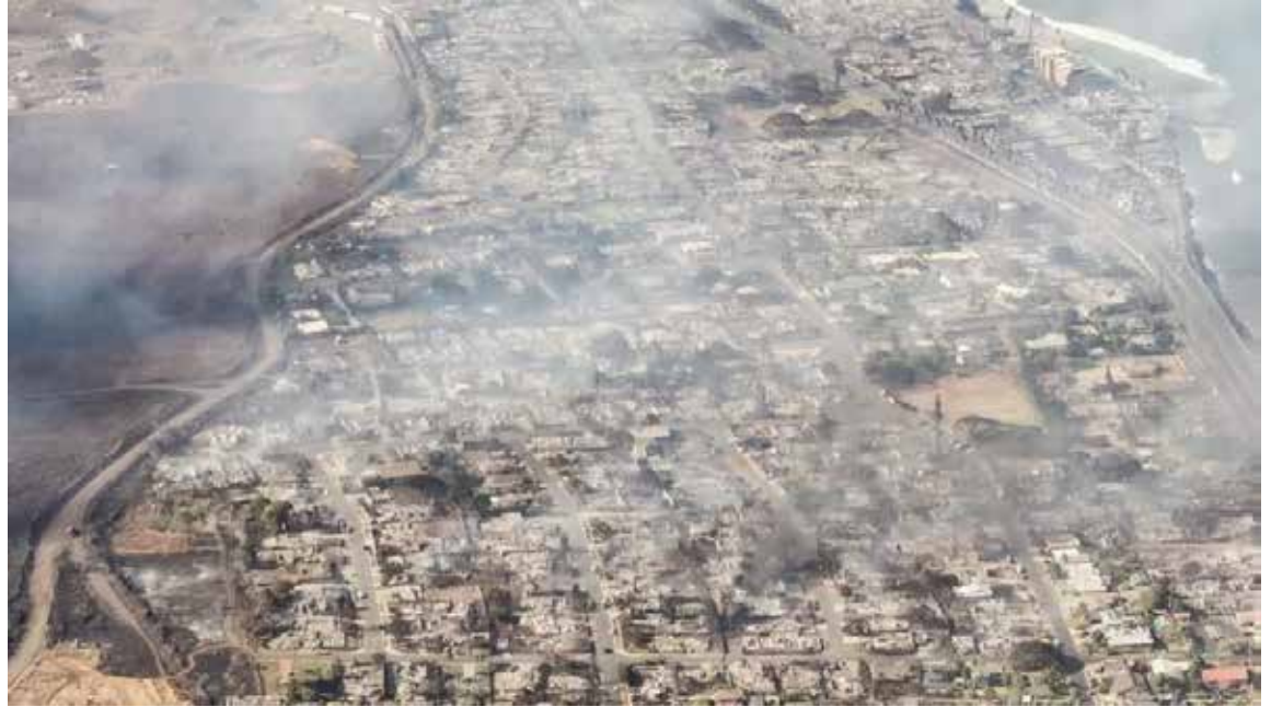
Parts of Lahaina were destroyed or severely damaged by the blaze.

An emergency order has been signed discouraging people from coming to Maui, which is a popular