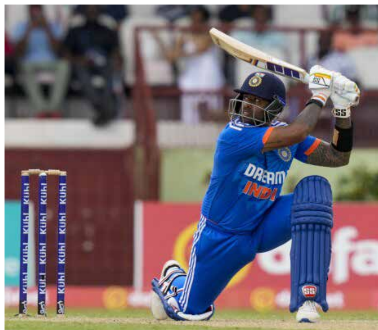
India's Suryakumar Yadav plays a shot against West Indies during the third T20 International cricket match at Providence Stadium in Georgetown, Guyana, Tuesday, August 8th, 2023.

GUYANA (Reuters) - Superb batting from Suryakumar Yadav has kept India alive in the T20 series against West Indies and he hopes to replicate that form in the 50-overs format where he has done less well ahead of the World Cup later this year.