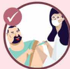
FLU SHOT/ VACCINATION