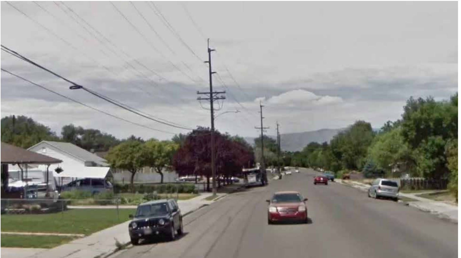
The raid took place at property close to this road in Provo, Utah.