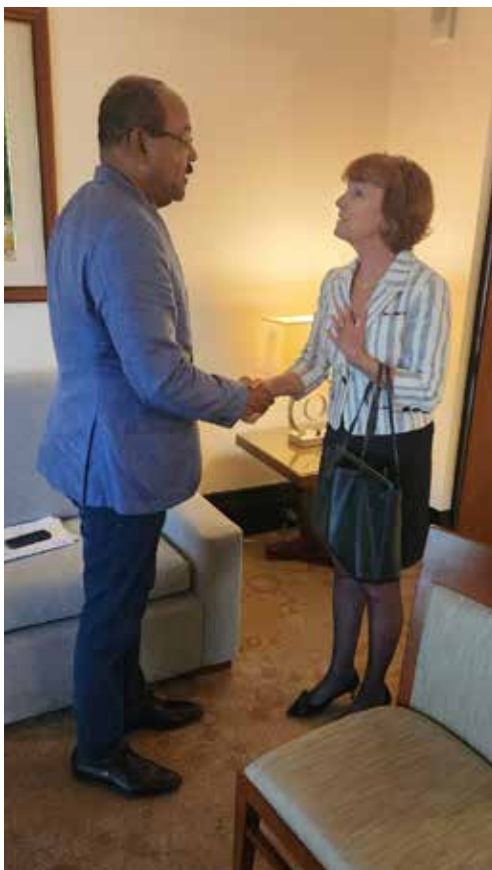
PM Browne also greets US candidate for International Court of Justice, Sarah Cleveland

The Prime Minister was impressed with her excellent credentials and noted that Antigua and Barbuda is willing to support her candidature, trusting that she will do an excellent job, once in the position.