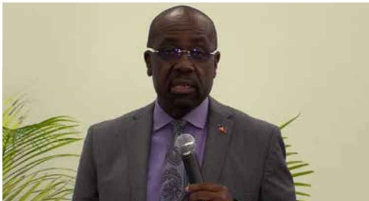
Foreign Affairs Minister E.P Chet Greene

“Those of us who did GCE (British exams), when the time came for CXC,