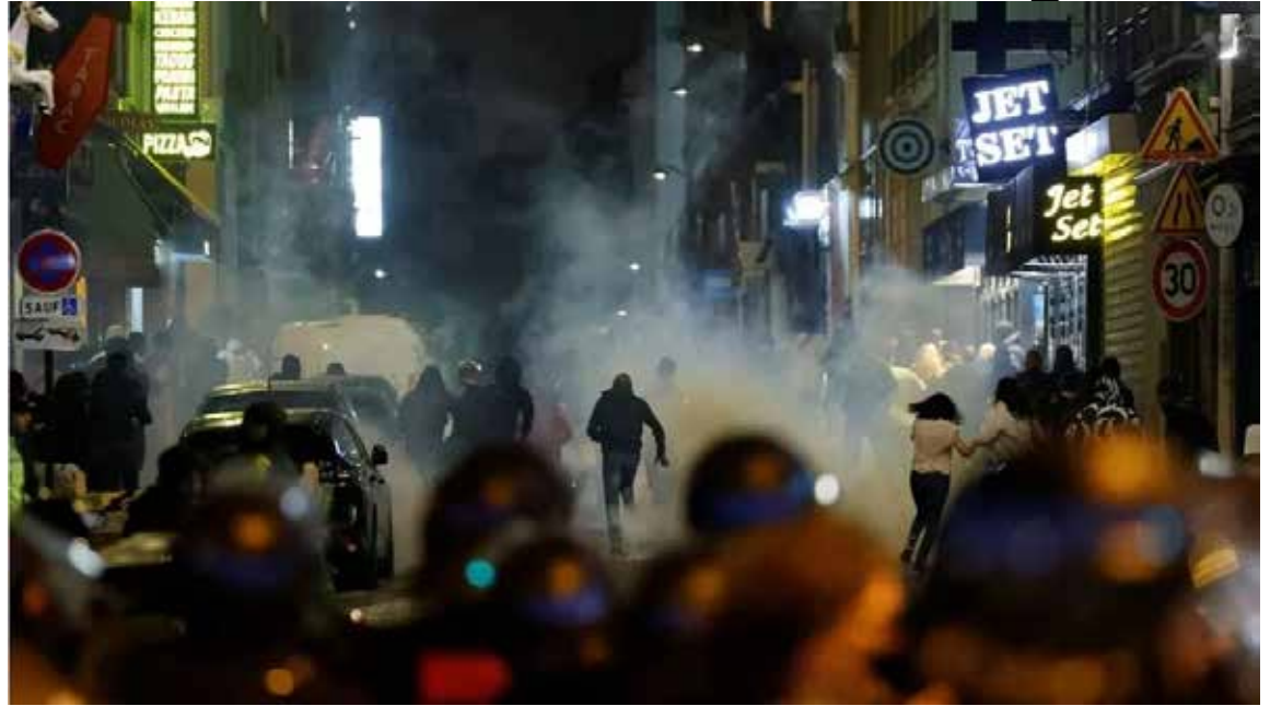
Rioters run as French police officers use tear gas in Paris on 2 July.