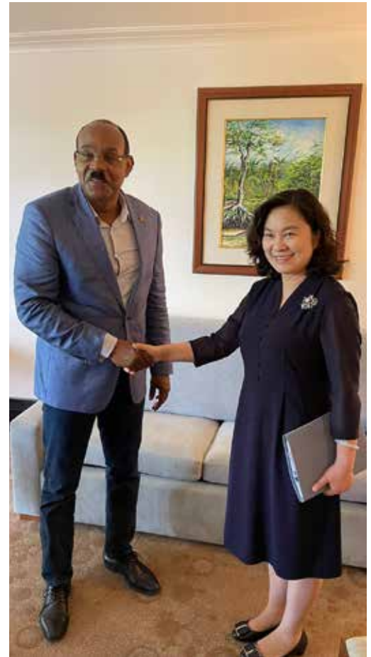
PM Browne greets PRC's Assistant Foreign Minister Chunying

There were also discussions on a state visit to China by Prime Minister Browne during the course of this year, perhaps at the time of a Trade Expo to be held in Shanghai in November. Prime Minister Browne welcomed this