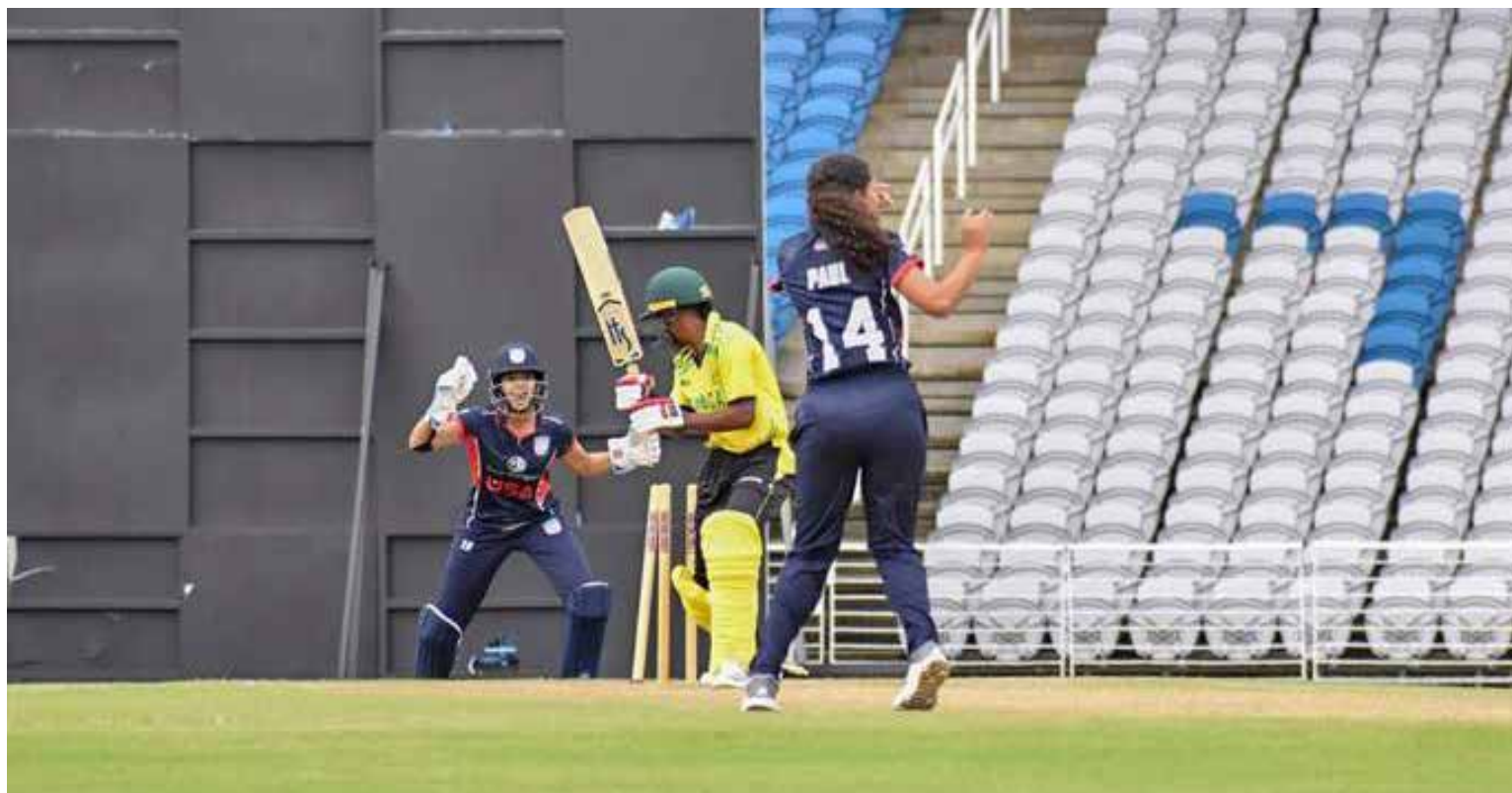
Champions USA and Jamaica (yellow shirt) compete during last year's inaugural Cricket West Indies Rising Stars Women's Under-19 Championship in Trinidad.