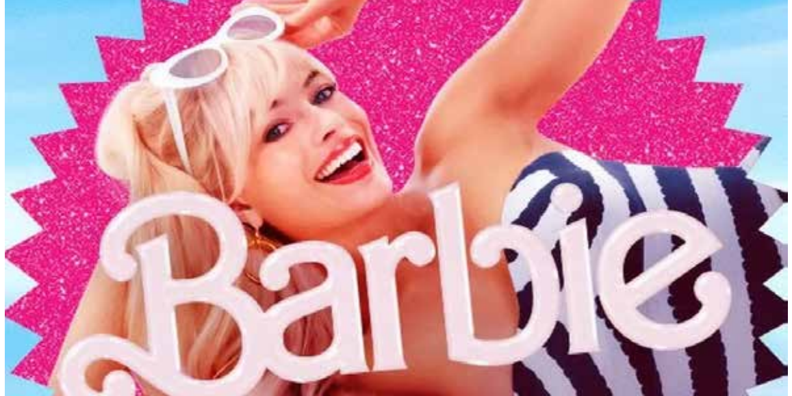
Margot Robbie plays the lead in the Barbie movie.

The nine-dash line is used in Chinese maps of the