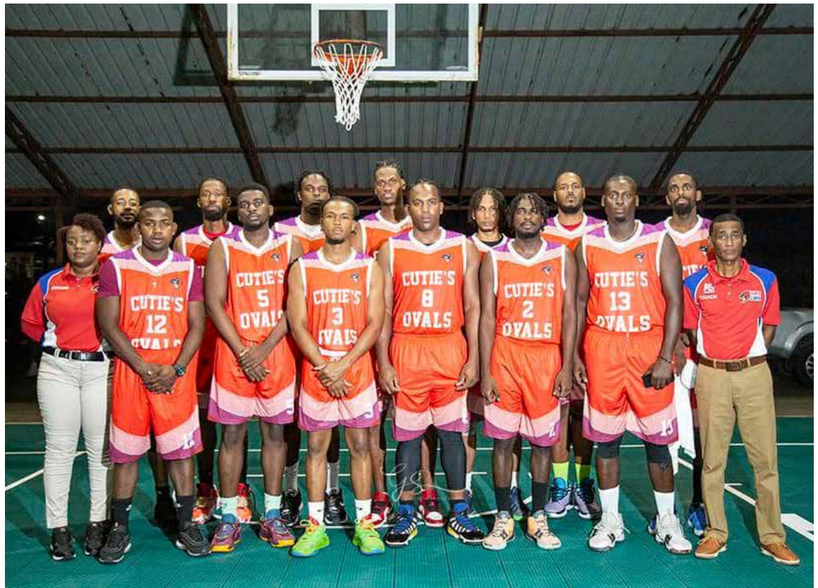
The Cuties Ovals Ojays basketball team