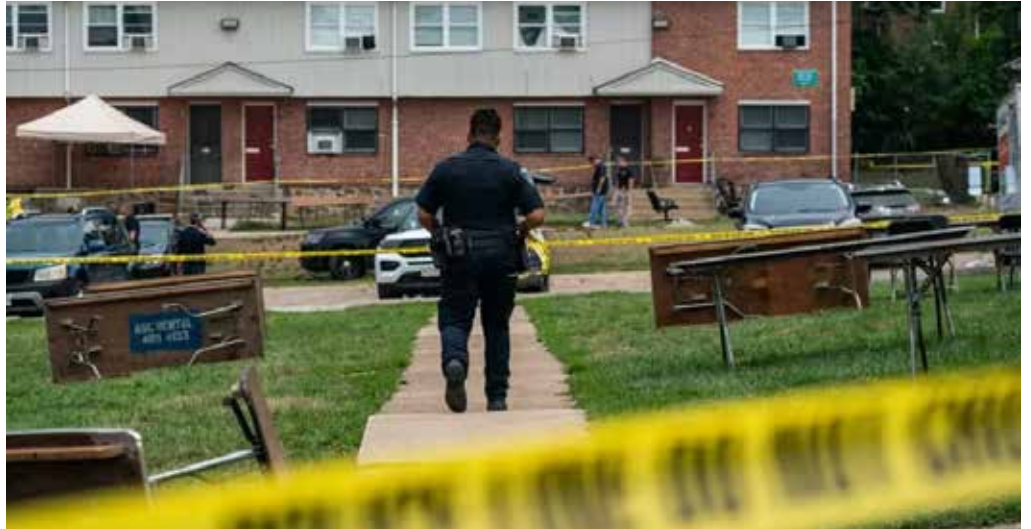
Witnesses said hundreds of people were at the party when the shooting unfolded.

The victims were mostly teenagers, ranging in age from 13 to 19. The others were aged 20, 22, 23, 31 and 32, according to police.