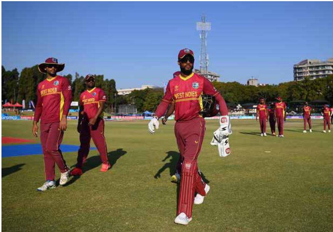
The West Indies team players leave the field after losing to Scotland in the ICC Cricket World Cup Qualifiers in Harare, Zimbabwe, on Saturday, July 1st, 2023.

However, once that partnership was broken, wickets kept falling at regular intervals and the West Indies