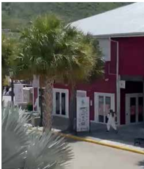
Robbery at C.B. Romney Tortola Pier Park. (Photo via: RVIPF).

tional Security Council (NSC) have been briefed by the Commissioner of Police on Saturday’s armed robbery at the Cyril B. Romney Tortola Pier Park.