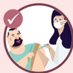
FLU SHOT/ VACCINATION