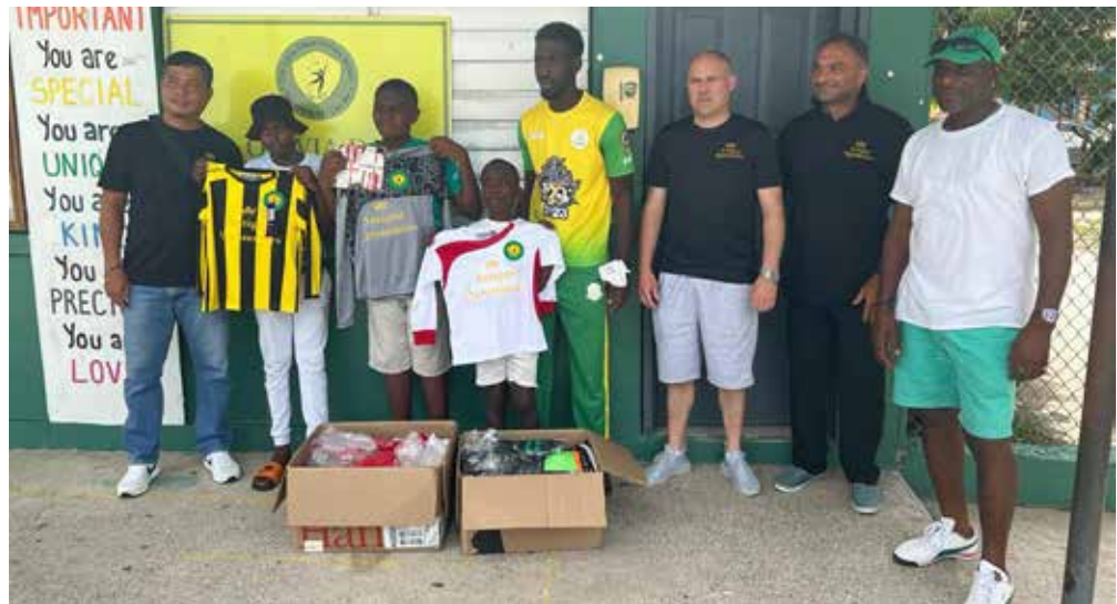
Antigua Agronomics donates to S.R Olivia David Primary School in Bolans

The Kingdom of Morocco has been donating fertilizers to Antigua and Barbuda over a period of years.