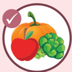
HEALTHY FOODS, FRUITS & VEGETABLES