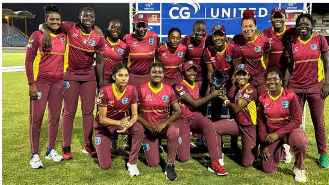
The players of the West Indies women's team celebrate with the trophy after winning the ODI series against Ireland at the Daren Sammy Cricket Ground in St. Lucia on Saturday, July 1st, 2023.

her 40th ODI half-century, showcased her experience and composure in a challenging situation, constructing her innings carefully.