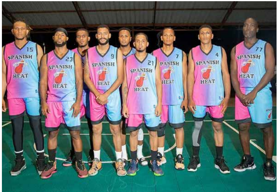
The Spanish Heat basketball team

The Stingerz surged to their ninth win in 10 encounters by trouncing the Braves by 40 points in the opening affair following a two-week break to facilitate the senior national team's preparation and participation in the FIBA AmeriCup