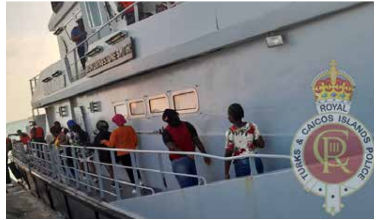
Interception of migrants near TCI

In response to this rising threat to our National Security, we are working in collaboration with our coun-