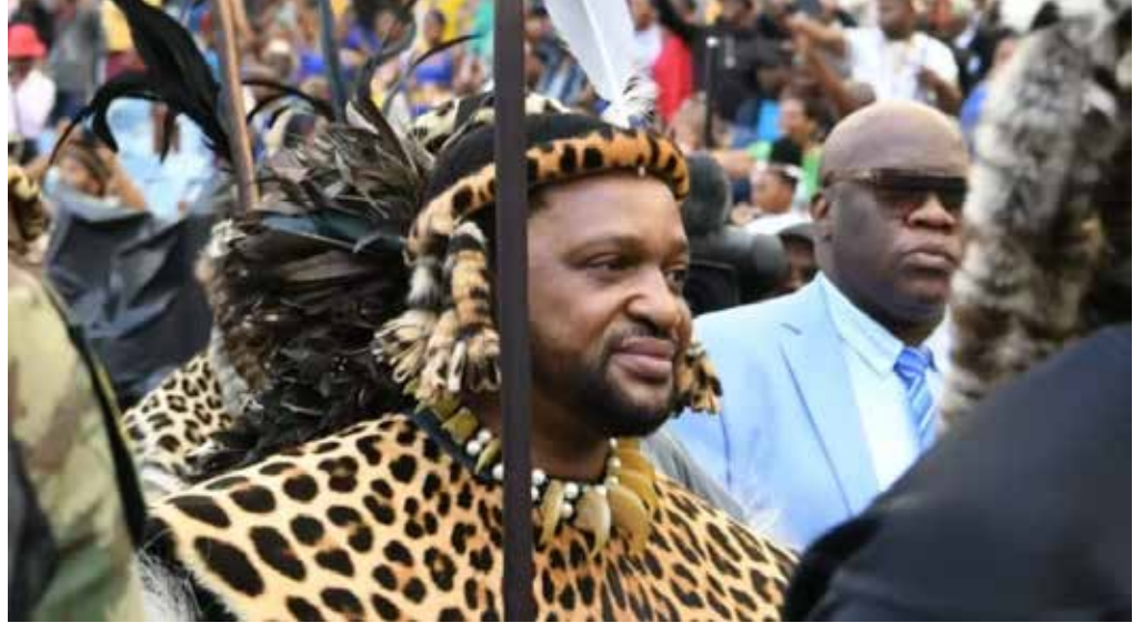
The monarch has been at the centre of bitter feuds within the royal family.

They insist that another son of the late king, Prince Simakade, should be the monarch.