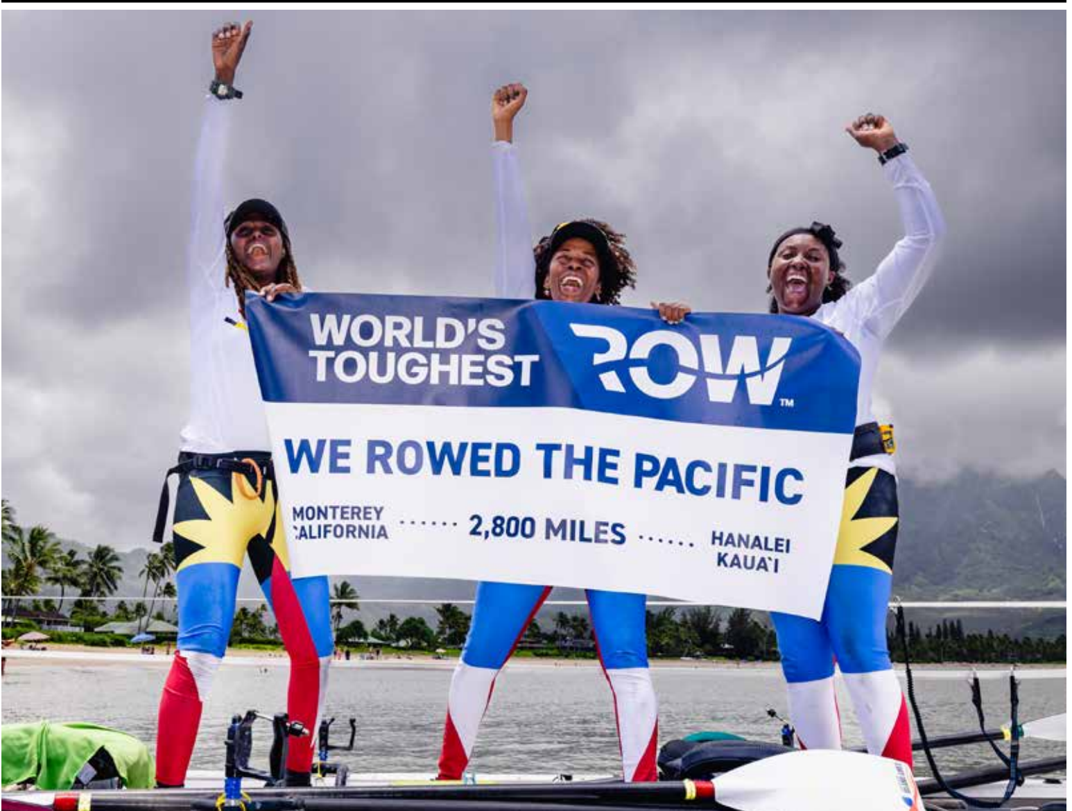
Team Antigua Island Girls does it again by rowing across the Pacific Ocean. Story on page 6.