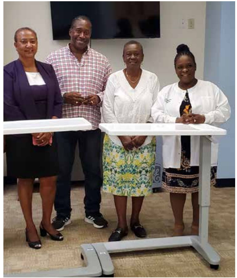
Friends of MSJMC

It was noted that in the case of one corporate citizen, Rubis Caribbean significantly contributed to the cause, by underwriting the cost for ten of the 65 over-bed tables.