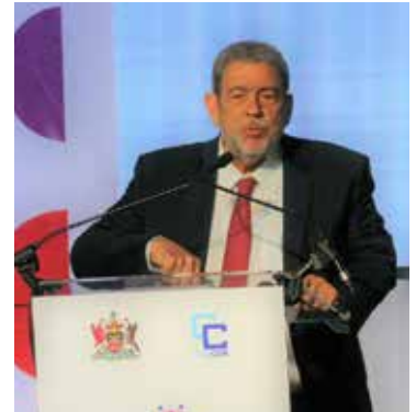
Prime Minister Dr Ralph Gonsalves.

"They have a mission in St Lucia but they are going to split, they're gonna evolve the one in St Vincent, hopefully into a full-