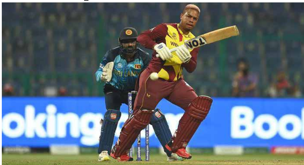
West Indies and Guyanese middle-order batsman Shimron Hetmyer has been recalled to the Caribbean side for the three-match CG United One Day International Series powered by YES BANK against India, which starts on Thursday, July 27th, at the Kensington Oval in Barbados.