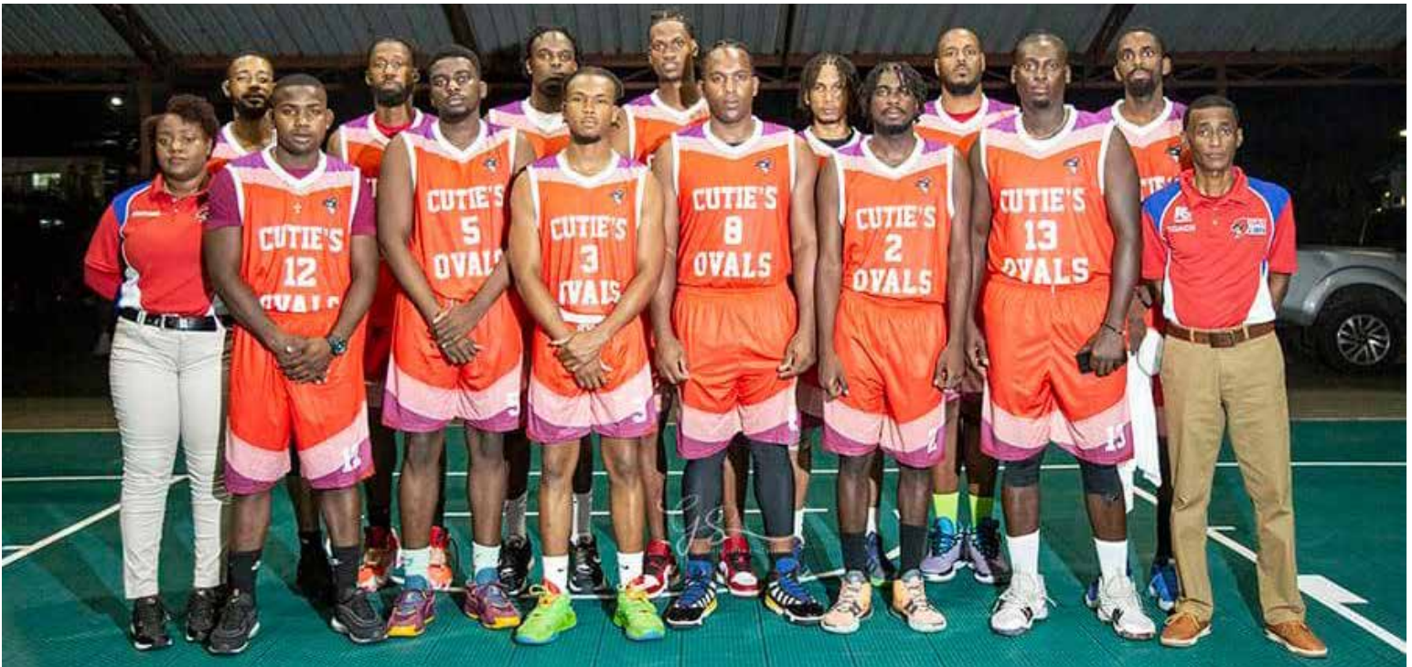
The Cuties Ovals OJays basketball team.