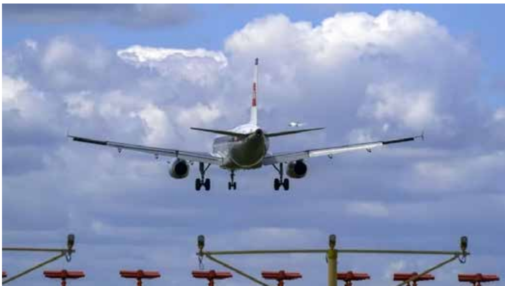
The IMF says post-pandemic demand for travel is helping global economic growth.

So-called emerging economies such as China and India are set to