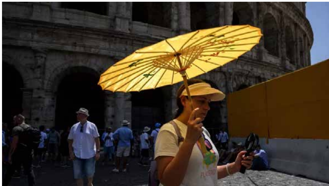
Temperatures reached 45C in Rome, Italy in the recent heatwave.

In July, temperature records were broken in parts of China, the southern US and Spain. Millions of peo-