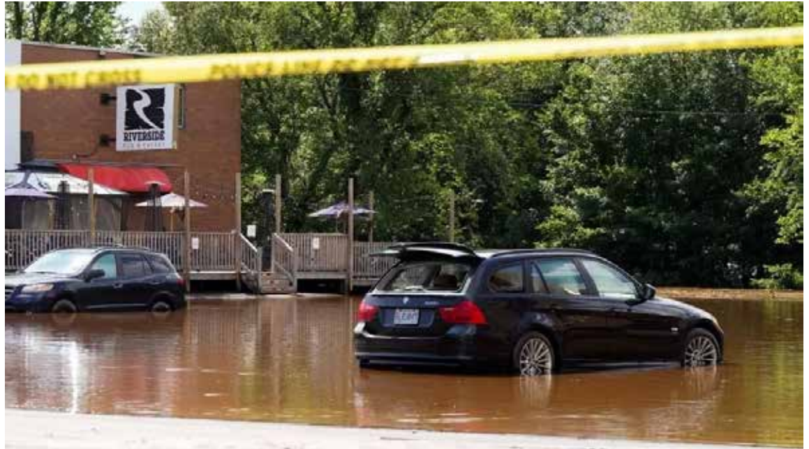
Nova Scotia was hit by 250 millimetres of rain in a 24-hour period - equivalent to what the province would usually see over three months.

Mounted Police said they recovered the bodies of one of the missing children on Tuesday morning, around 10:45 local time (14:45 BST).