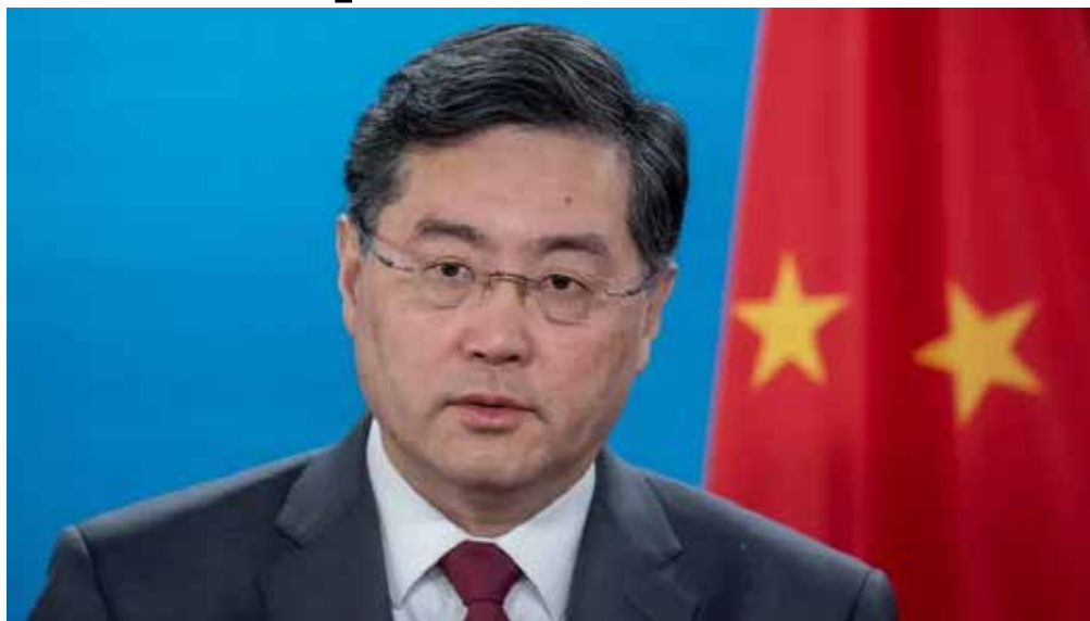
Qin Gang is one of the most high-level officials in the Chinese Communist Party to have been absent for this long.

Wang Yi, a career diplomat who speaks Japanese, is returning to a post he held between 2013 and 2022. He has been standing in for Mr Qin and is currently in South Africa attending a Brics national security meeting.