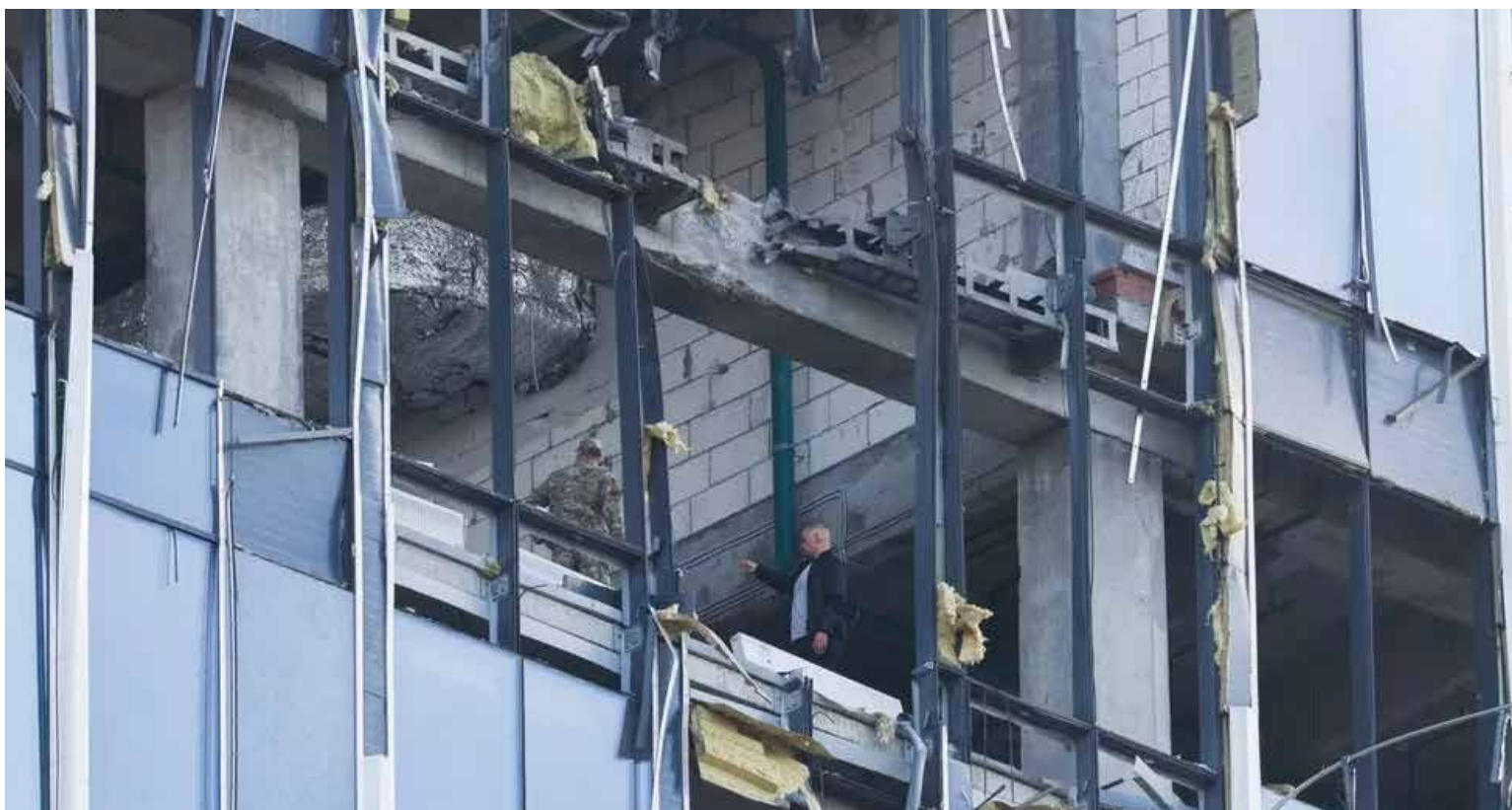
Moscow's mayor says "two non-residential" buildings were hit in the drone attack.