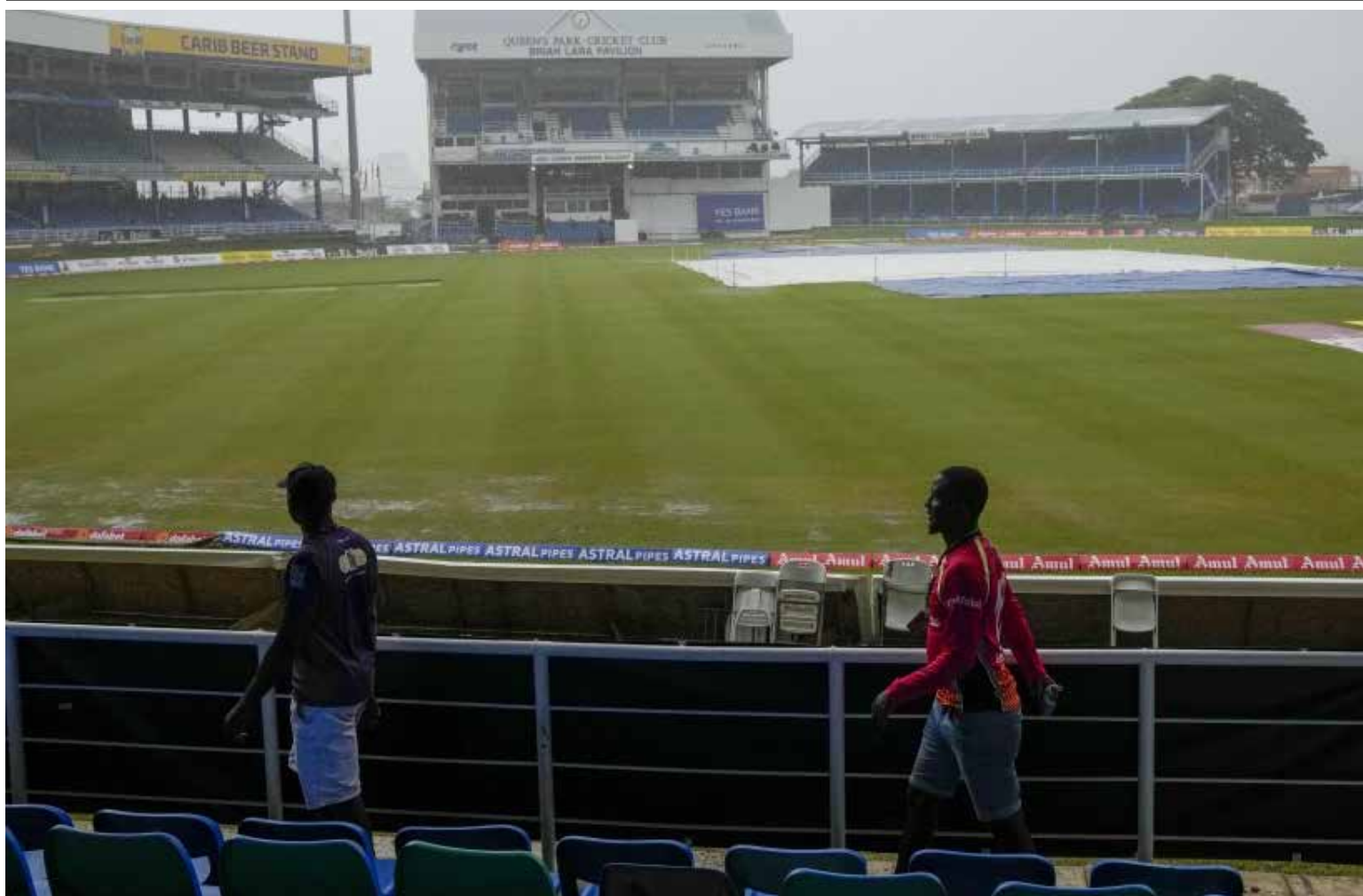
The covers are out as rain delays the start of play on day five of the second cricket Test match between India and West Indies at the Queen's Park Oval in Port of Spain, Trinidad and Tobago, Monday, July 24th, 2023.