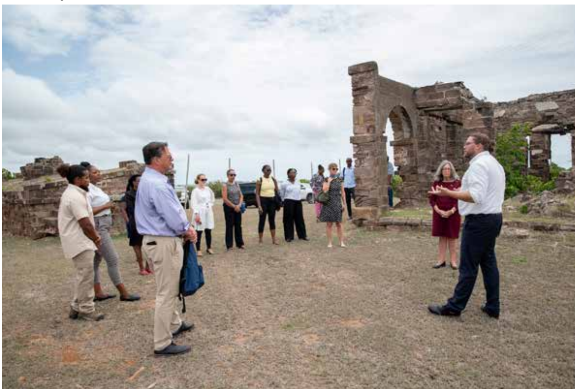
The NPA and US Embassy Team at Blockhouse

From Shirley Heights, the Ambassador saw the entirety of the UNESCO World Heritage Site, the historical structures, landscapes and the key viewscapes of that inscription. She also was briefed on the marine ecosystems of the NPA, including the coral restoration project to keep the coral reefs healthy, and the inclusion of new swim and no propellor zones in Freeman's Bay and Pigeon Point to preserve the lives of swimmers, snorkelers, feeding turtles and protect the seagrass bed ecosystems. Additionally, the erosion undermining parts of Fort