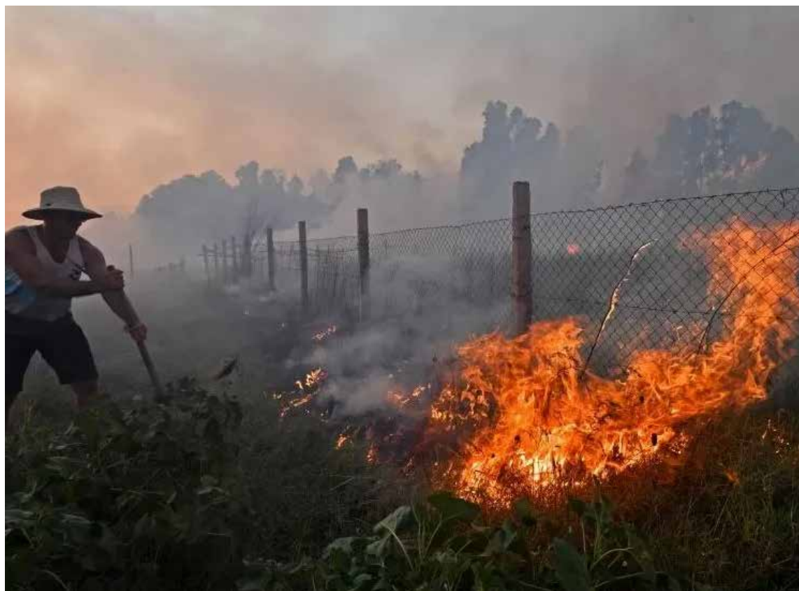
Fires have been sweeping North Africa on the border between Tunisia and Algeria.

cal Office has warned that temperatures of more than 48C are likely to continue until the end of the month in the north of the country.