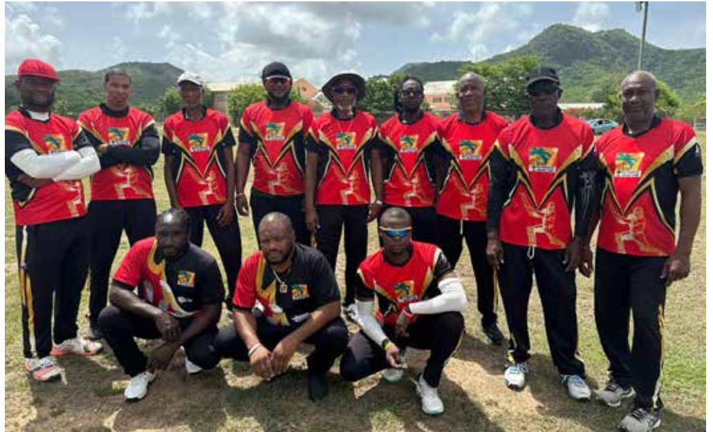
The Antigua and Barbuda Softball Cricket Association's Men T20 champions Rackaman Construction Strictly Business after winning the title at the Jennings playing field on Sunday, July 23rd, 2023.