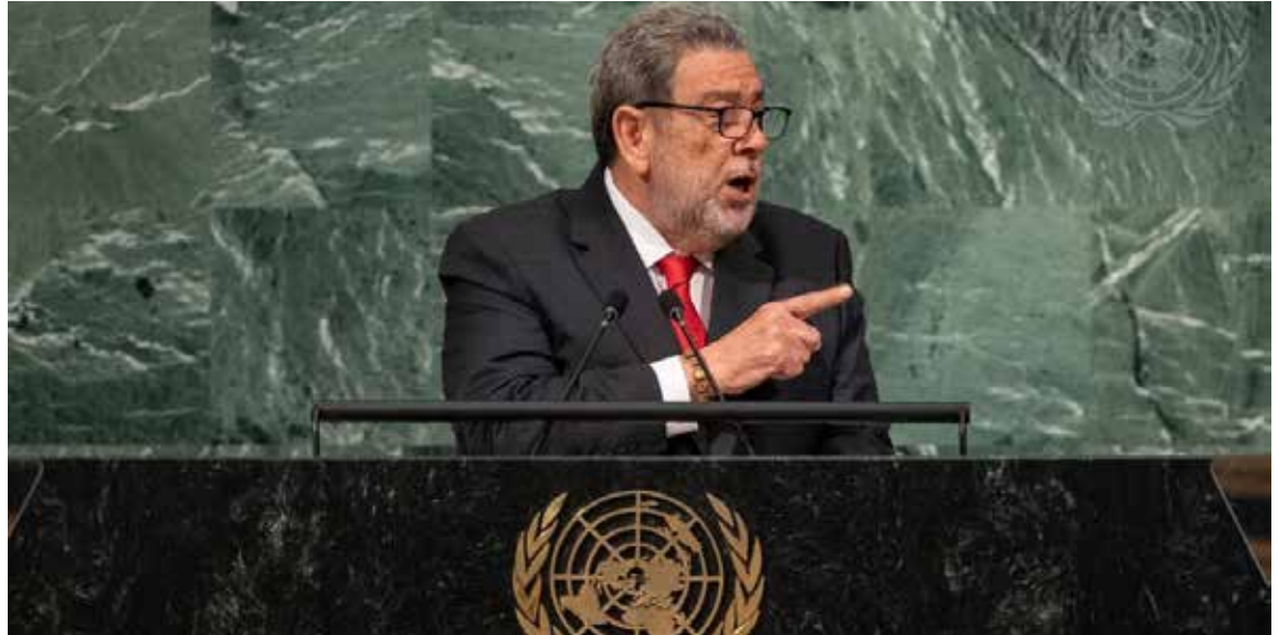
Prime Minister Ralph Gonsalves.

Look, those who didn't see it, and who wanted to base an economic strategy on that, like the opposition in St Vincent and the Grenadines, they now get their comeuppance. It's your how mature judgment brought to bear when I say this thing is not sustainable. You can't base your eco-