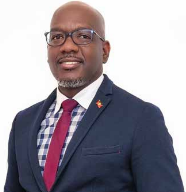
Education Minister, Daryll Matthew

The minister identified the Golden Grove Primary School as one of the insti-