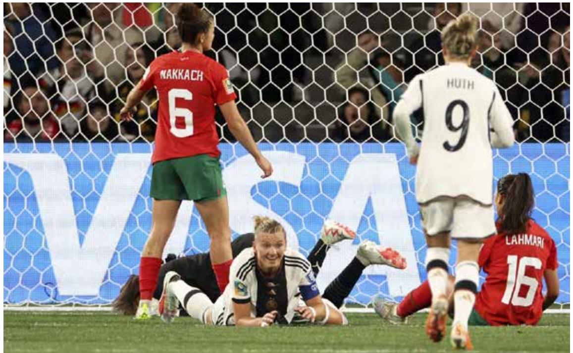
Germany's Alexandra Popp, center, reacts after scoring her side's second goal during the Women's World Cup Group H soccer match between Germany and Morocco in Melbourne, Australia, Monday, July 24th, 2023.

Brazil powered ahead of France at the top of Group F with a commanding 4-0 win over Panama.