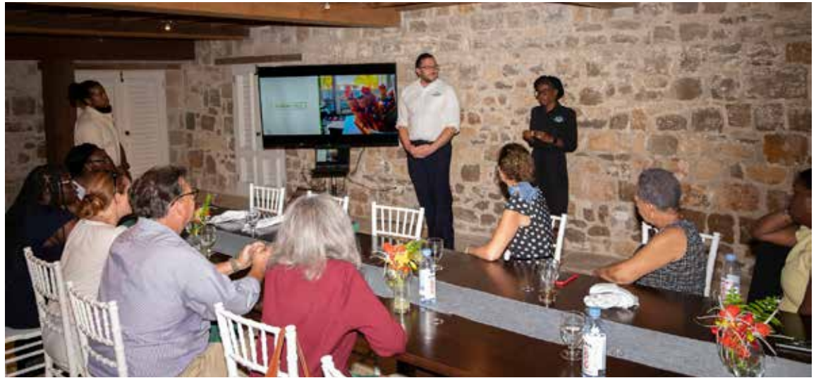
The NPA presents to the US Embassy Team

bassador was shown the boundaries of the NDNP, stretching from Mamora Bay to Cactus Hill at Carlisle Bay.