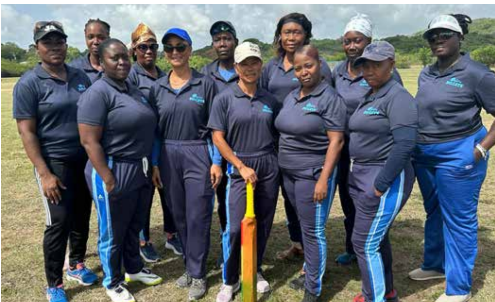
The Antigua and Barbuda Softball Cricket Association's Women T20 champions Bryson's Shipping & Insurance Bullets after capturing the title at the Jennings playing field on Sunday, July 23rd, 2023.