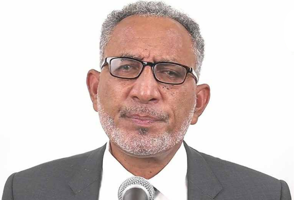
Dr Godwin Friday- Opposition leader in St Vincent and the Grenadines.

He says stakeholders need to come together to work on a national plan to deal with crime.