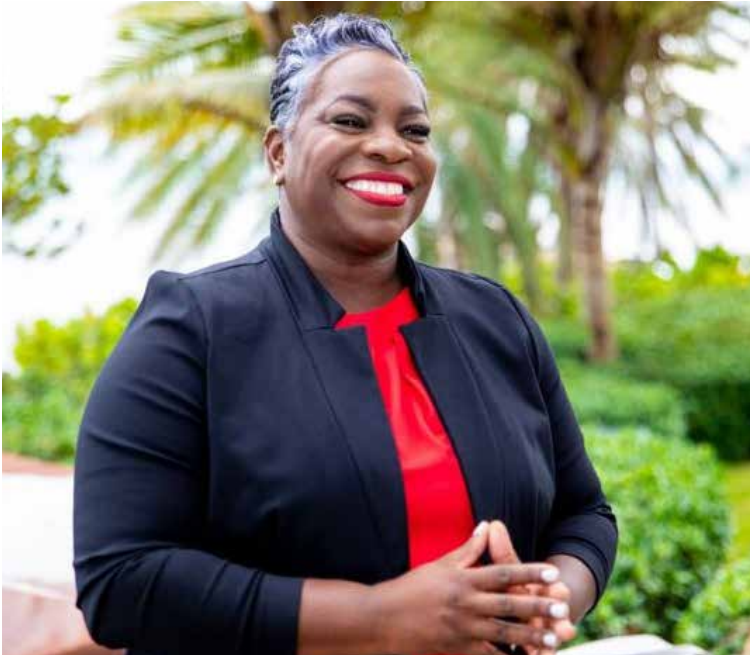
Senator Samantha Marshall

The distribution of lands is now taking place in the Cades Bay area in the St Mary's South constituency east of Urlings, and efforts are being made to ensure that people who are from the area are first in line.