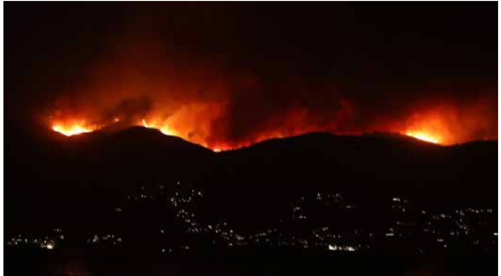
Photos uploaded to social media show flames engulfing Corfu.

ated by land and 3,000 by sea on the island, according to local officials. Greece’s Ministry of Climate Change and Civil Protection said it was “the largest evacuation from a wildfire in the country”.