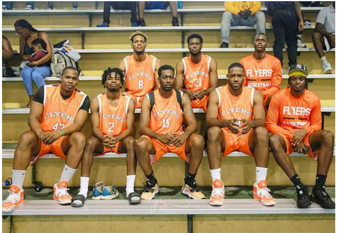
The Flyers basketball team.