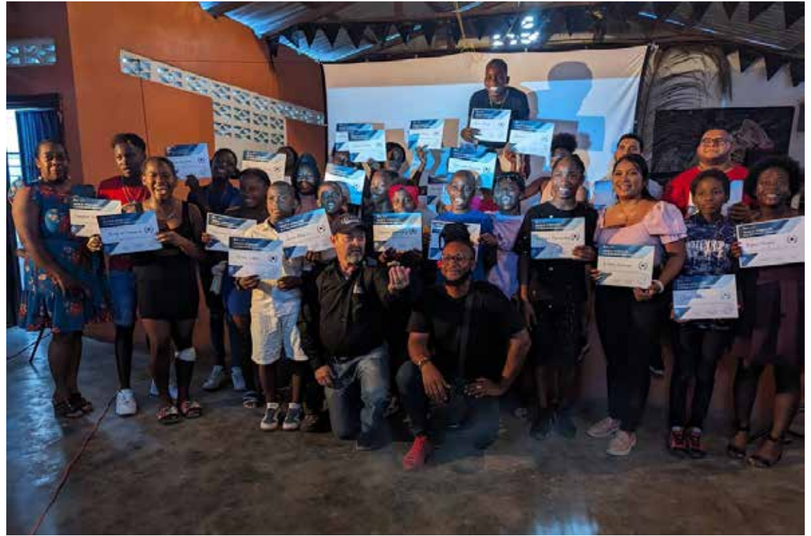
Garifuna film workshop- Honduras

The Garifuna people are an ethnic group of