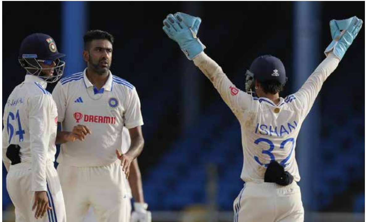
India's Ravichandran Ashwin, second left, celebrates with teammates the dismissal of West Indies' captain Kraigg Brathwaite on day four of their second cricket Test match at Queen's Park in Port of Spain, Trinidad and Tobago, Sunday, July 23rd, 2023.

Rohit (57) and opening partner Yashasvi Jaiswal