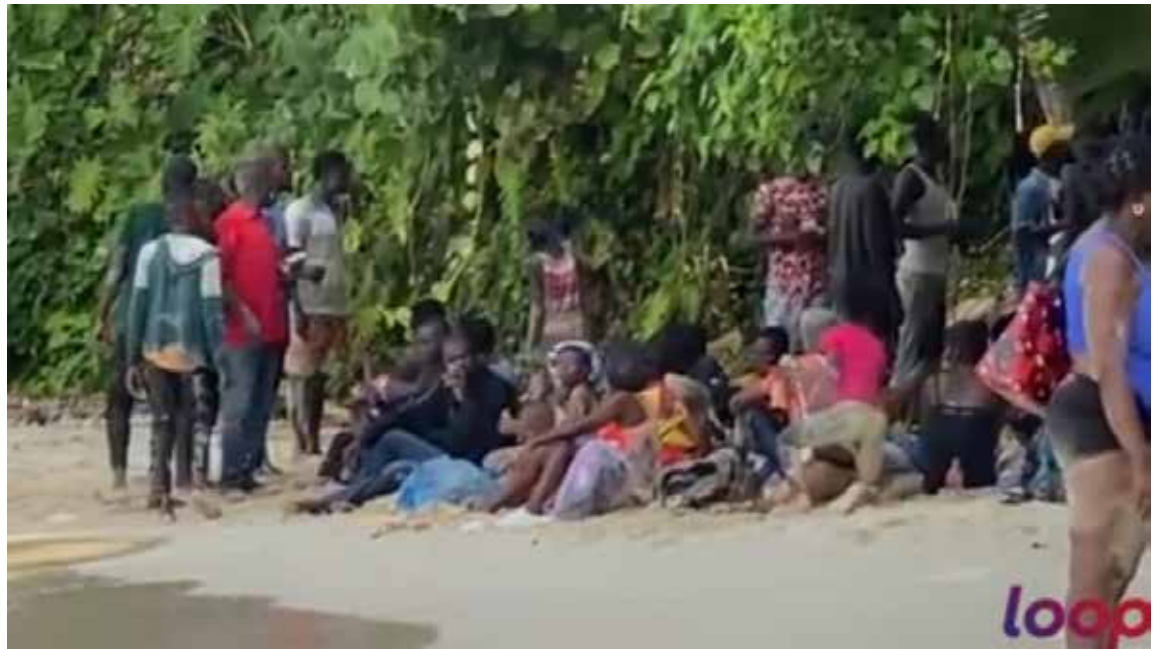
Haitians land in Portland, Jamaica.

The 29 adults were subsequently charged with illegal entry in Jamaica