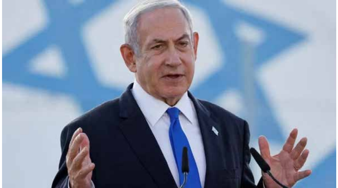
Israeli PM Benjamin Netanyahu faces pressure from reservists and former security chiefs ahead of key vote on the country's judicial reform.

Mr Netanyahu said he should be well enough to attend parliament after the procedure. The next 48