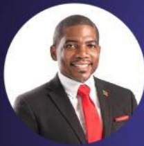
The Honourable Dr. Terrance M. Drew, Prime Minister, St. Kitts & Nevis

Eon Nigel Harris Council Room, The UWI Regional Headquarters