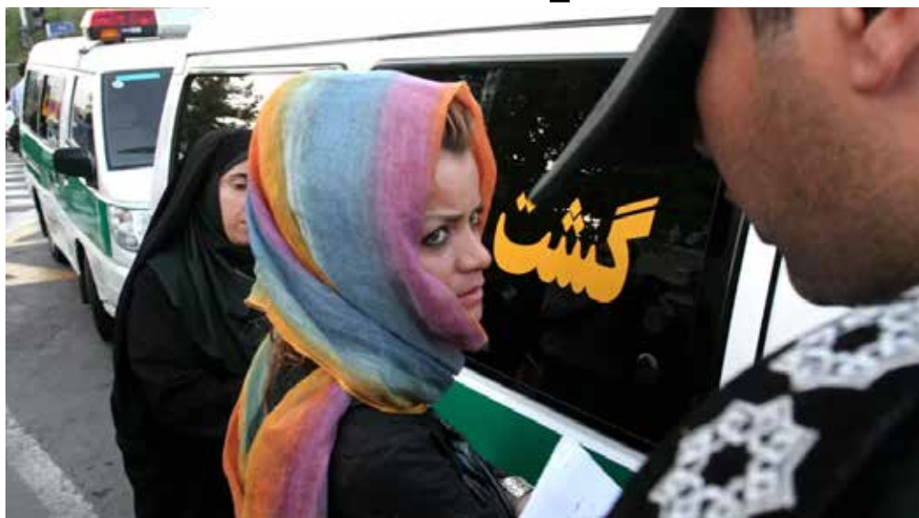
Iran's controversial morality police are tasked with enforcing the country's strict dress code (file image)

Mahsa Amini, a 22-year-old Kurdish woman, was detained by the force