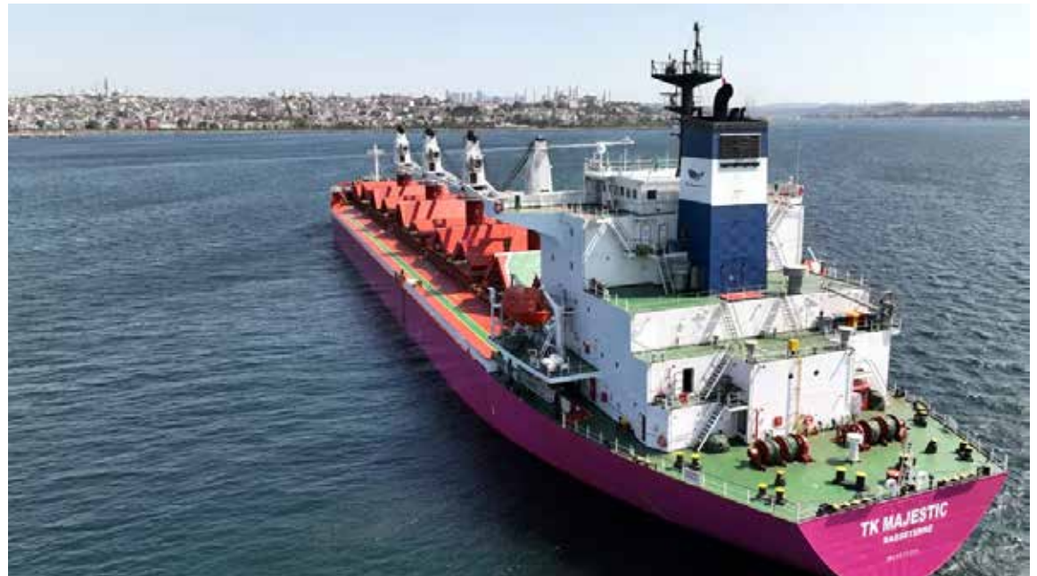
Russia has accused the West of putting commercial interests ahead of humanitarian ones with regards to the grain deal.

The country's foreign ministry on Monday reiter-