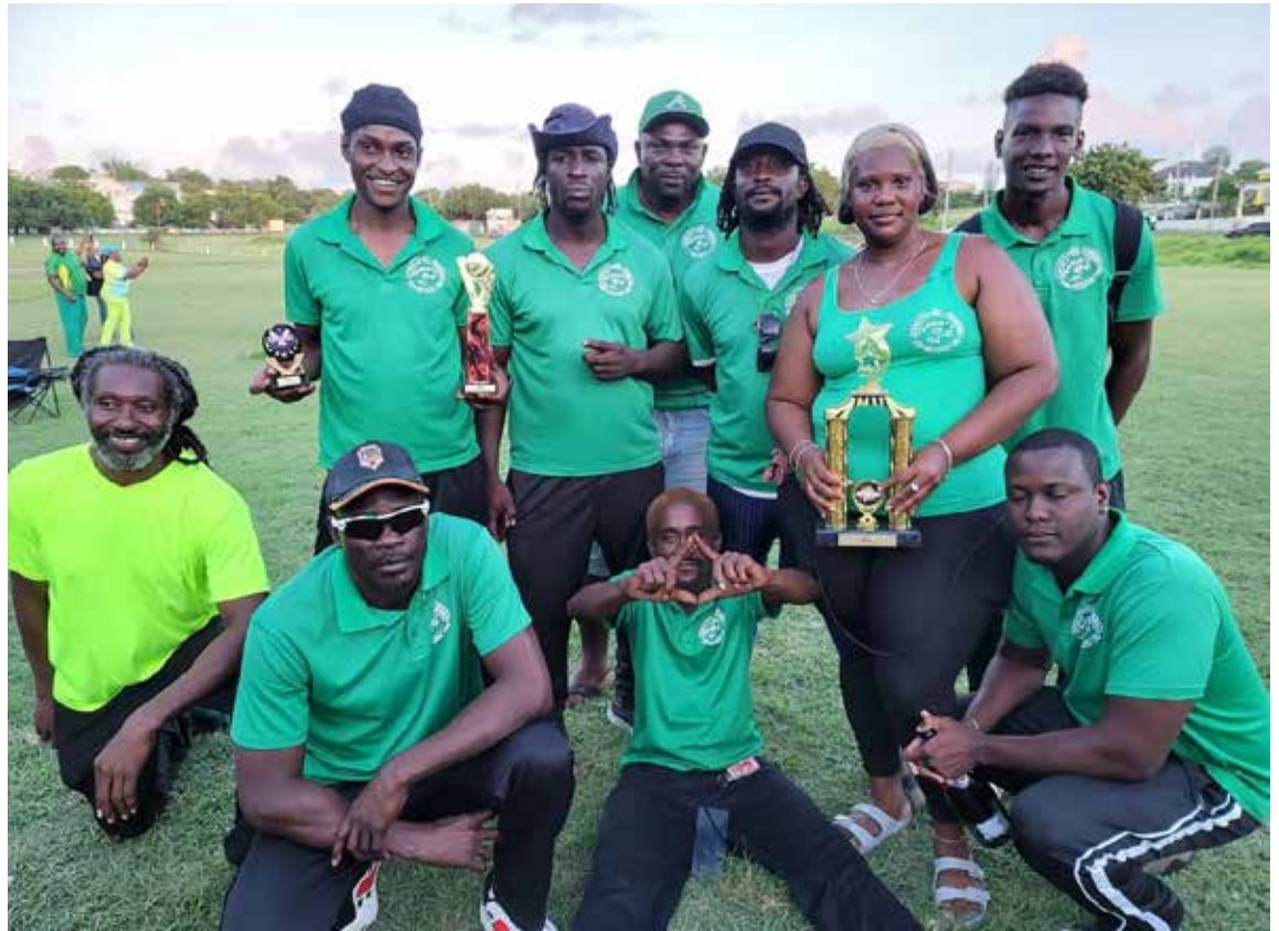
The Marco Inc./Grill Box Buckleys 3J's have advanced to the final of the Antigua and Barbuda Softball Cricket Association's (ABSCA) Men's T20 Championship. (File photo)