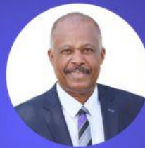
Professor Sir Hilary Beckles, Vice-Chancellor, The UWI