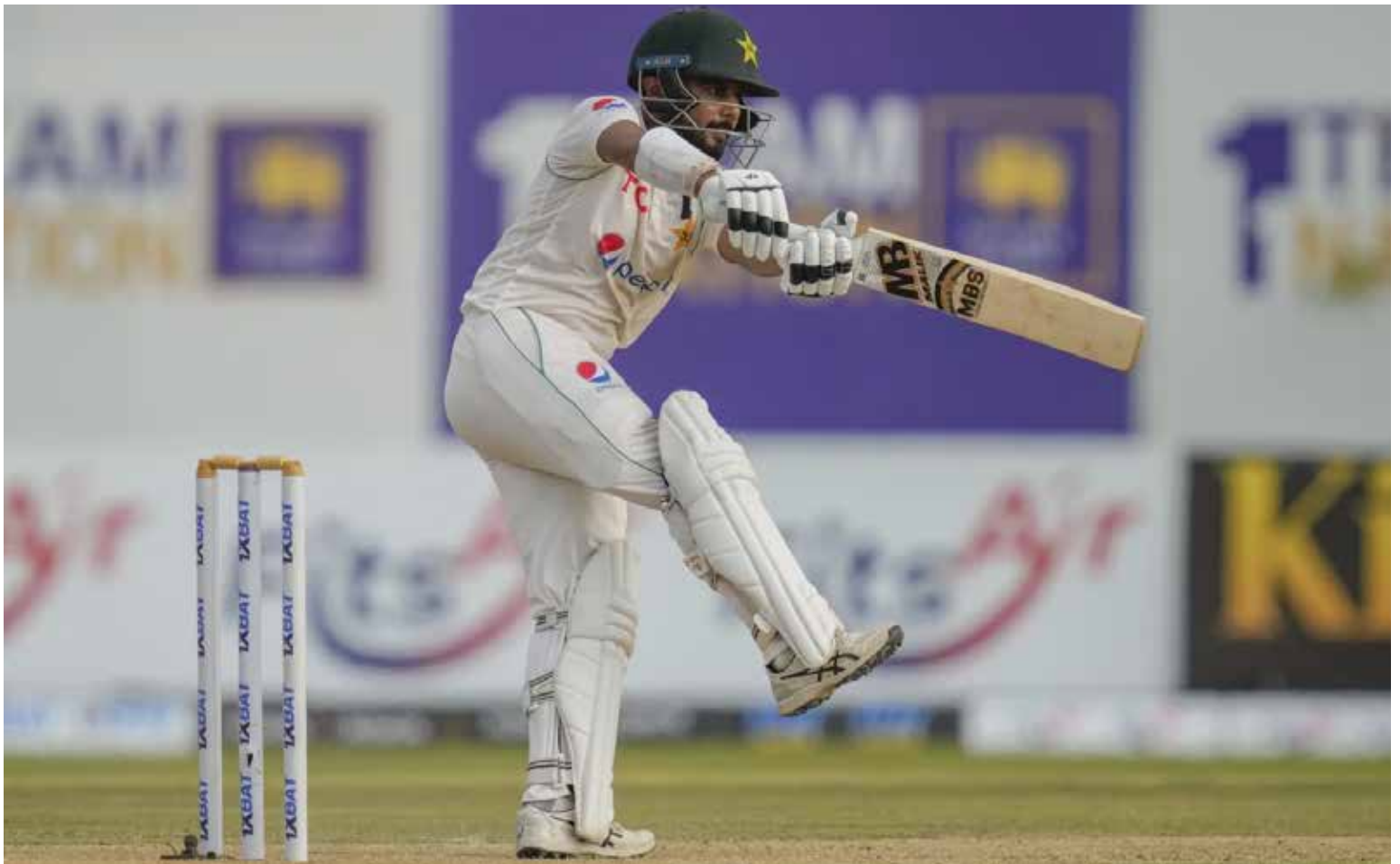
Pakistan's Saud Shakeel plays a shot as Sri Lanka's Sadeera Samarawickrama watches during the second day of the first cricket Test match in Galle, Sri Lanka, on Monday, July 17th, 2023.