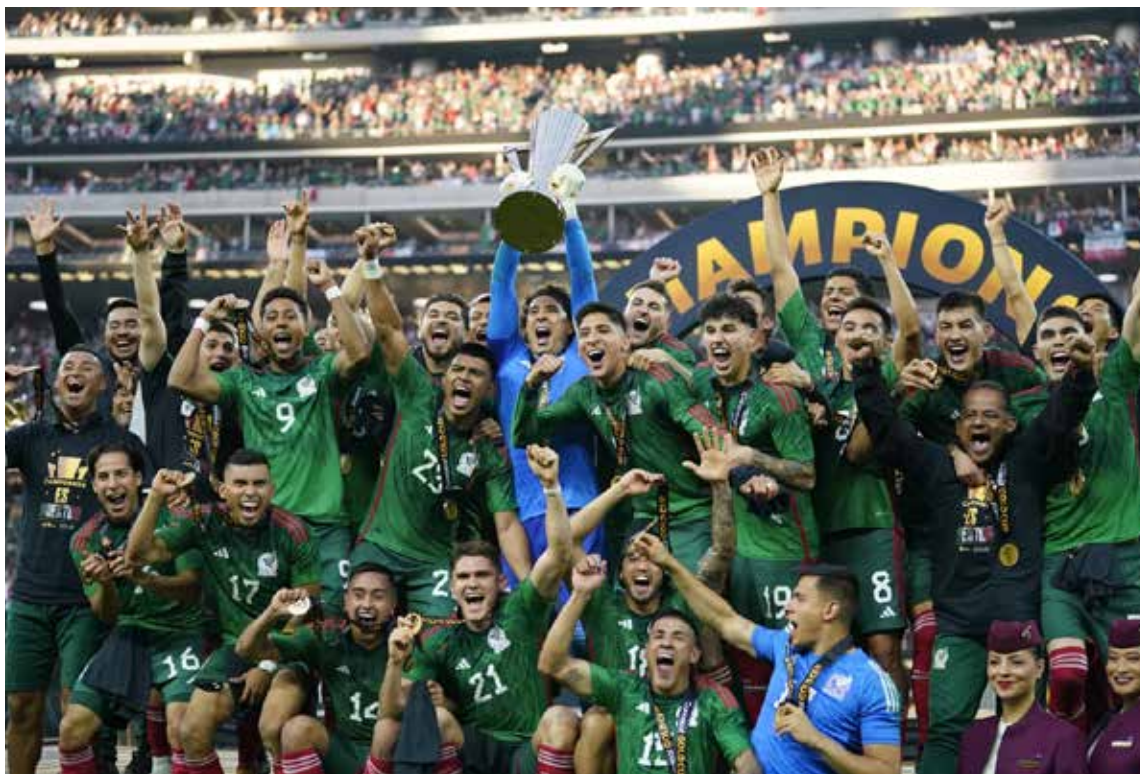
Mexico's players celebrate with the winner's trophy after beating Panama during the CONCACAF Gold Cup final soccer match at SoFi Stadium on Sunday, July 16th, 2023.