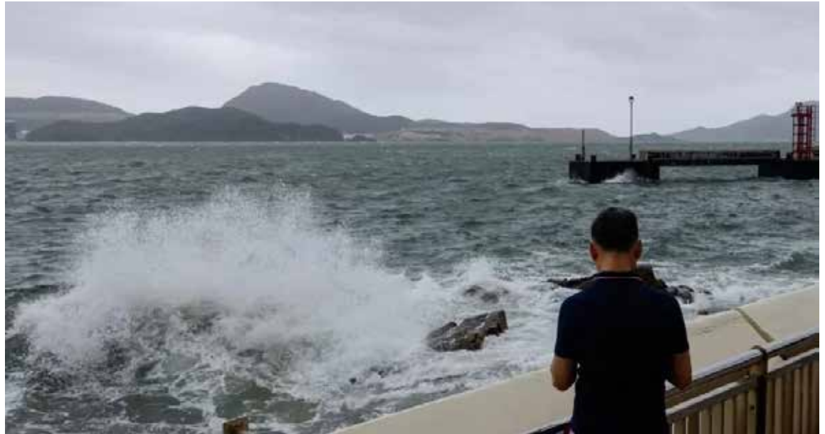
A man watches the waves in Hong Kong on Monday.

Talim made landfall at around 10:20 local time (14:20 GMT), the China Meteorological Administration said, issuing an orange alert, its second-highest warning in a four-tier sys-