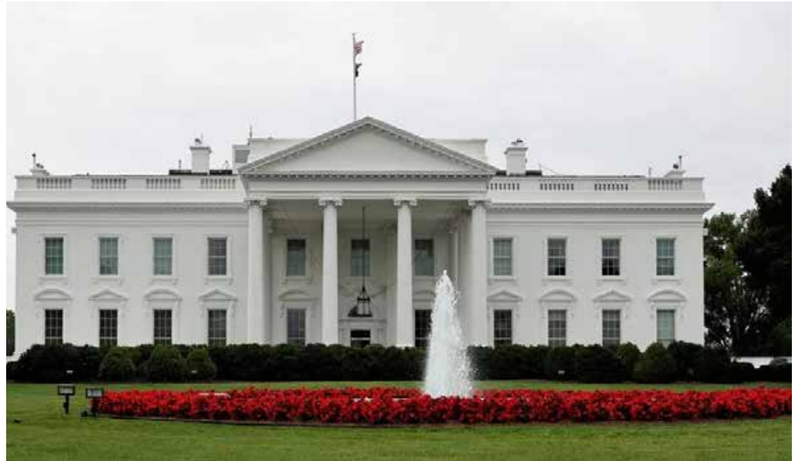
The Secret Service said the investigation had ended due to a lack of physical evidence.

Tests of the material determined it was cocaine, and further analysis was carried out on the composition of the substance. Advanced fingertip and DNA analysis