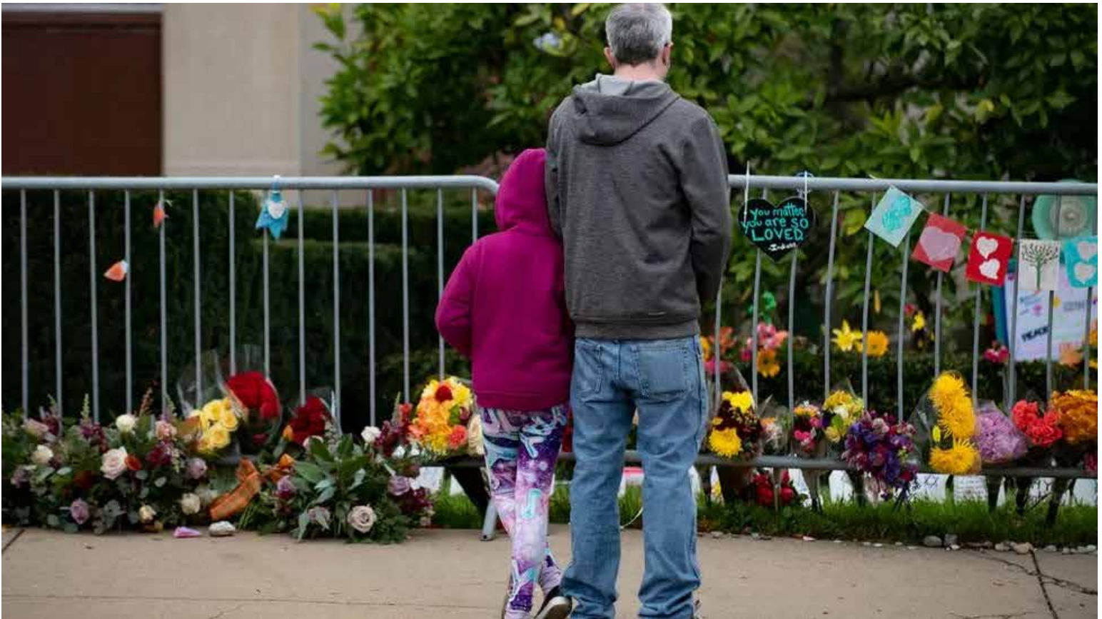
Robert Bowers shot and killed 11 people at Pittsburgh synagogue and injured several more.