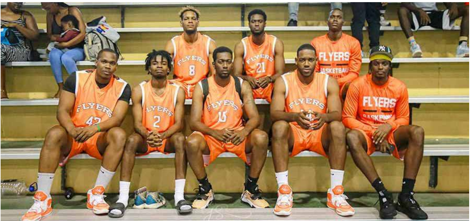
The Flyers basketball team. (File photo)