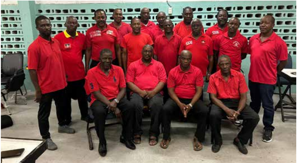
The male players of the Antigua and Barbuda national Wadadli Warriors domino team.