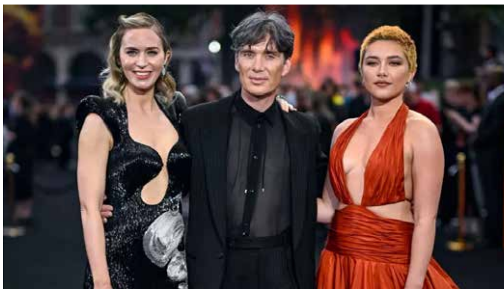
Actors Emily Blunt (L), Cillian Murphy (centre) and Florence Pugh (R) left the premier of Oppenheimer as the strike was announced.

On Wednesday, the union - officially known as the Screen Actors Guild-American Federation of Television and Radio Artists, or SAG-AFTRA - announced it was unable to