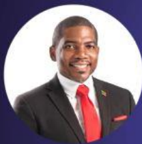
The Honourable Dr. Terrance M. Drew, Prime Minister, St. Kitts & Nevis

Eon Nigel Harris Council Room, The UWI Regional Headquarters