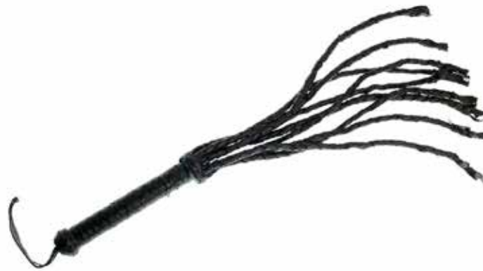
Cat o' nine tails.

"So, my motion is to amend the Criminal Code to remove flogging as a pun-