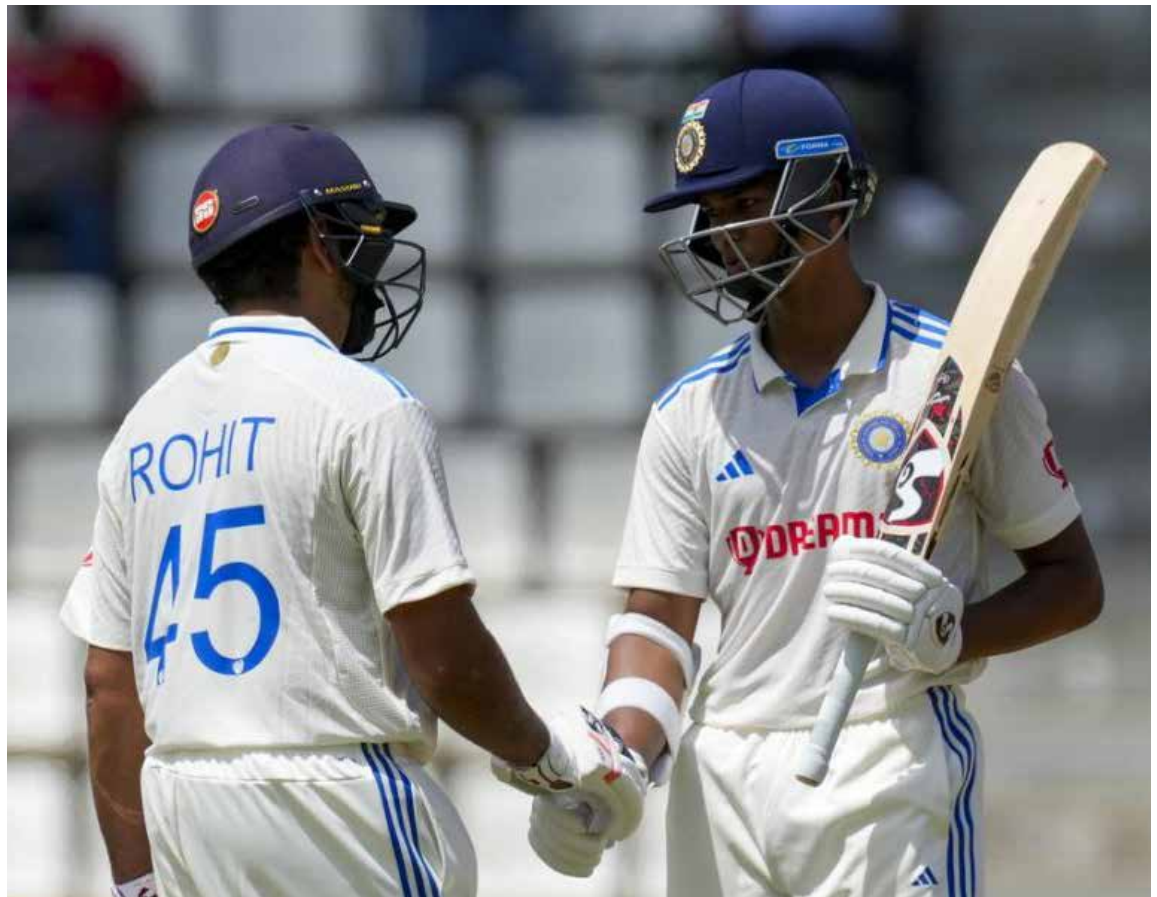
India's captain Rohit Sharma, left, congratulates fellow opener Yashasvi Jaiswal after he reached his maiden century on debut against the West Indies on the second day of the first Test at Windsor Park in Dominica on Thursday, July 13th, 2023.