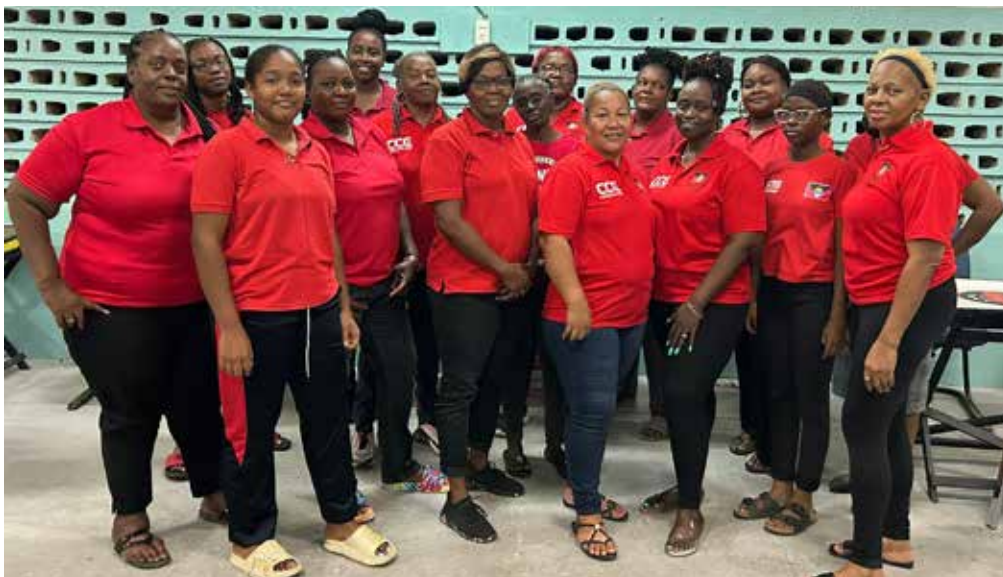
The female players of the Antigua and Barbuda national Wadadli Warriors domino team.

Participants will compete in the following eight disciplines: Team Four Hand, Female Three Hand, Male Three Hand, Mixed Pairs, Female Pairs, Male Pairs, Queen of Domino, and King of Domino.