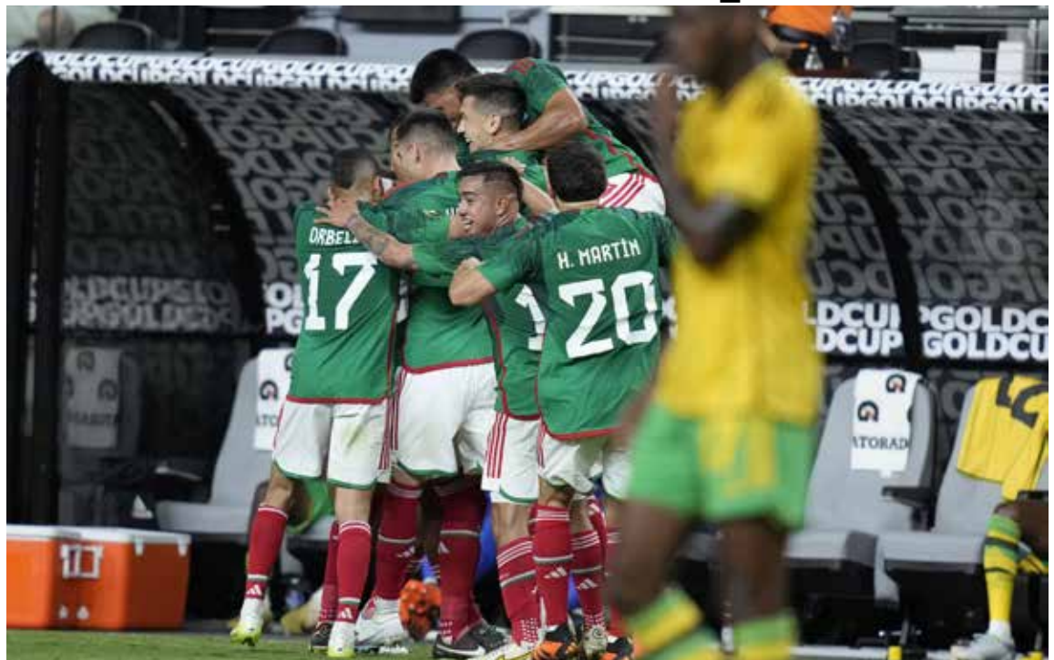
Mexico's players celebrate after Luis Chavez scored against Jamaica during the first half of their Concacaf Gold Cup semi-final soccer match in Las Vegas, USA, on Wednesday, July 12th, 2023.

Adalberto Carrasquilla converted the decisive penalty kick after Cristian Roldan was stopped in his attempt, and Panama beat the Americans 5-4 in a shootout follow-