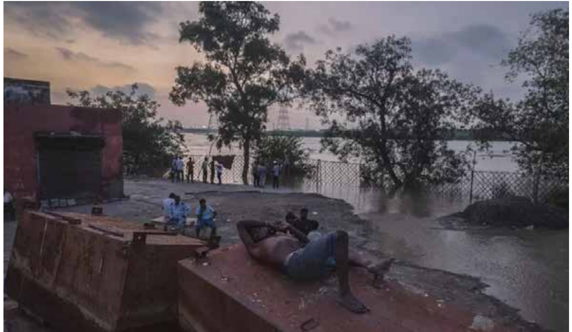
The river Yamuna has risen to a 45-year high, according to Delhi's chief minister.

Footage from local TV channels showed the street outside Chief Minister Arvind Kejriwal's home flooded, while PTI news