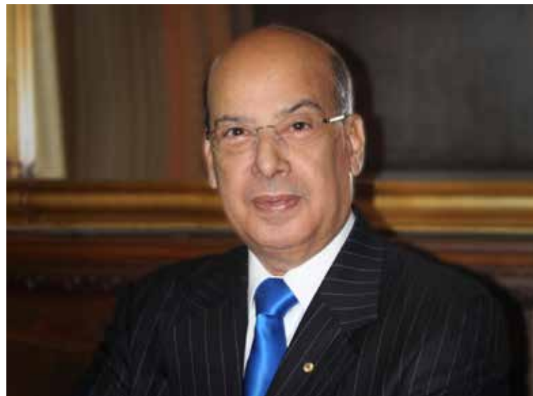
Sir Ronald Sanders

According to a statement made by the Heads of Government of the Caribbean Community (CARICOM) at their 50th anniversary meeting in Trinidad from July 3 to 5, Henry told them "that he will not seek election but will head a Transition Government to secure the arrangements to transition the country from the security and humanitarian crises until the holding of credible, free and fair elections". Insiders reveal that this statement had to be extracted from Henry who resisted being asked to make