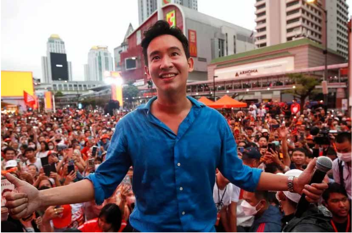
Mr Pita has ridden a voters' rebuff of nearly a decade of conservative rule.

The other that Move Forward's proposal to amend the draconian royal defamation law, which has jailed hundreds of critics of the monarchy, amounts to an attempt to overthrow Thailand's entire political