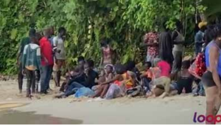
The Haitians who landed in Jamaica on Monday are seen on Boston Beach in Portland. have confirmed. maica if they deem it nec-

The Haitians are being housed at an undisclosed facility in St Mary at this time, the parish's police