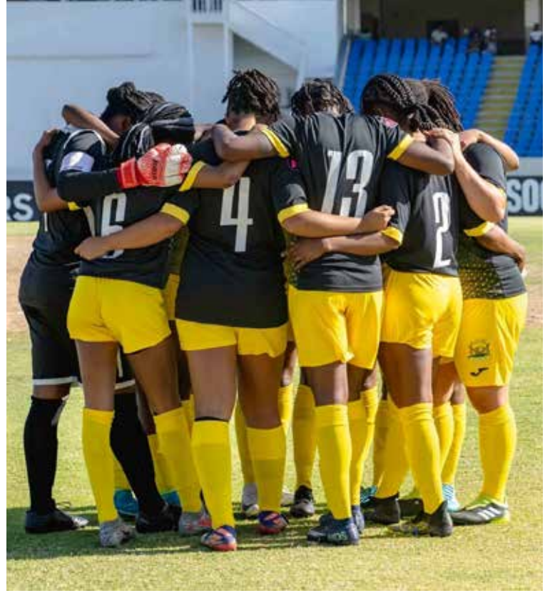
Antigua and Barbuda's Benna Girls will be among 35 Concacaf women's senior national teams that will participate in a series of qualifiers for the group stage of the inaugural 2024 female Gold Cup competition.

Antigua and Barbuda will contest League B Group A along with Dominica, Guyana, and Suriname. Contesting League B Group B will be El Salvador. Nicaragua, Hon-