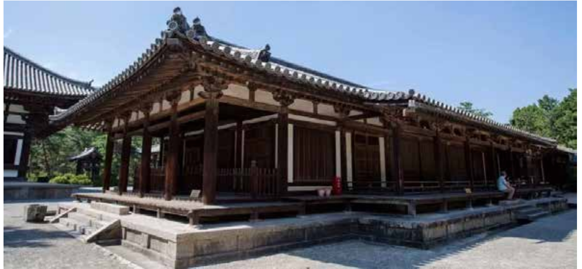
Toshodaiji Temple in Nara is identified as a national treasure of Japan.

Police also told CNN that the boy said his actions