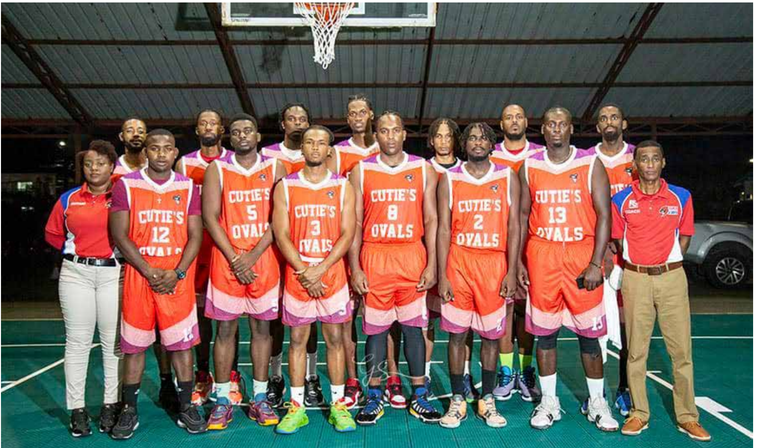
The Cuties Ovals OJays Basketball team. (File photo)