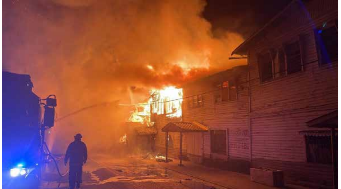
Fire officers attempting to quell a fire at the Hong Wei Supermarket.

Firefighters rescued five Chinese nationals who were trapped in the building. Three of them were sent to the hospital for smoke inhalation, along