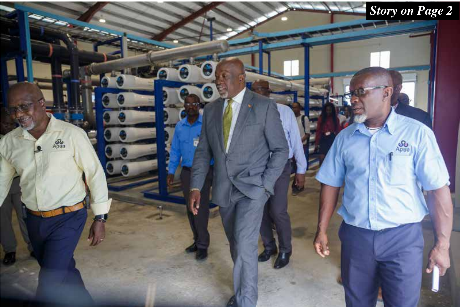
APUA is working towards having uninterrupted water service available to all consumers. Utilities Minister Melford Nicholas, centre, along with senior officials of APUA took part in a tour of the new reverse osmosis plant at Fort James.