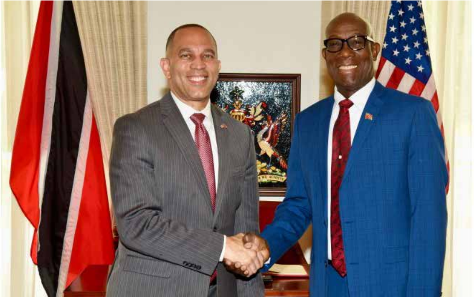
Congressman Hakeem Jeffries and Trinidad and Tobago’s Prime Minister Dr Keith Rowley.

He said during a meeting with the regional leaders chaired by Dominica’s Prime Minister Roosevelt Skerrit, they discussed “several issues of mutual concern, including the rise of