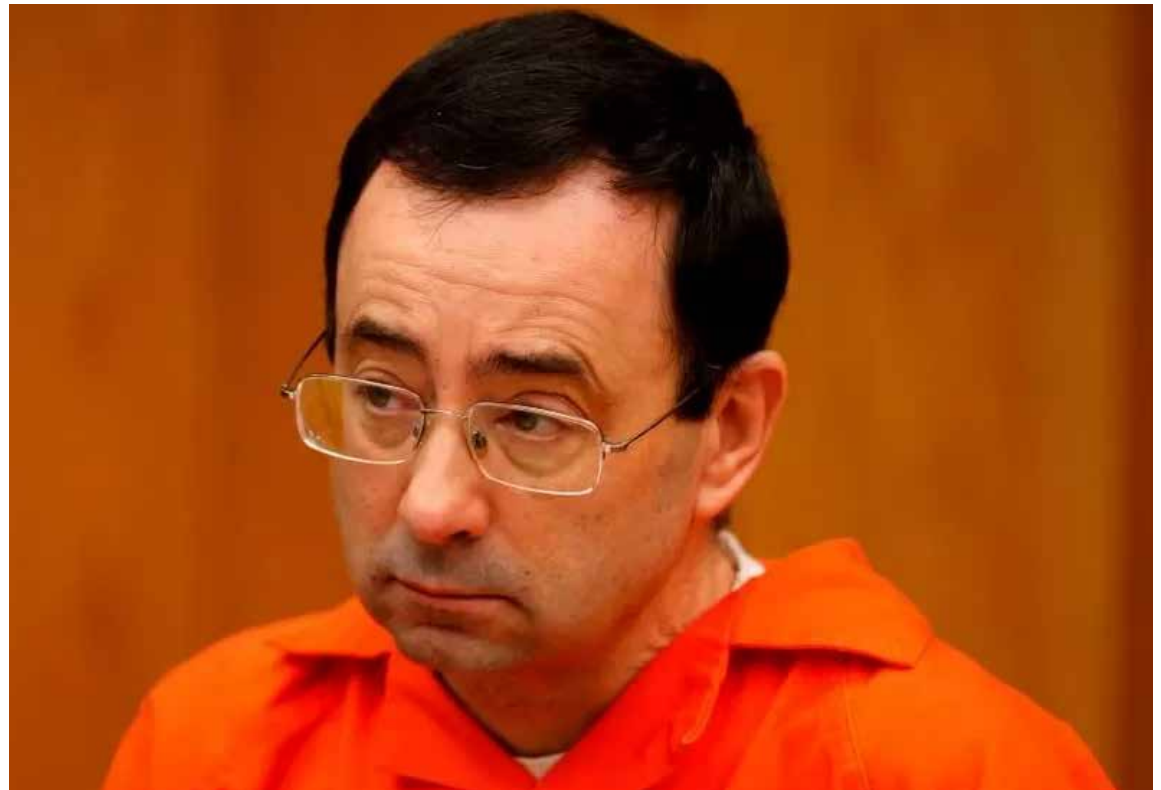
Larry Nassar is believed to have been stabbed several times in a prison fight.

“Responding staff immediately initiated life-saving measures”, the agency told BBC News. The inmate was taken to a local hospital “for further treatment and