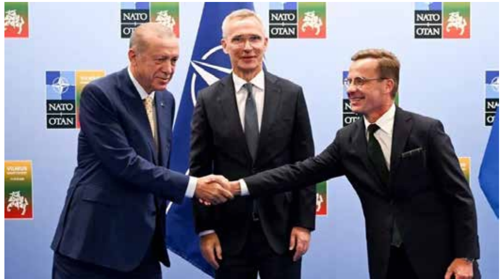
Turkish President Recep Tayyip Erdogan and Swedish Prime Minister Ulf Kristersson shake hands with Nato chief Jens Stoltenberg looking on.

Finland - both nations with a long history of wartime neutrality - announced their intention to join Nato in May last year, several months after Russia launched its full-scale invasion of Ukraine. Finland formally joined in April.