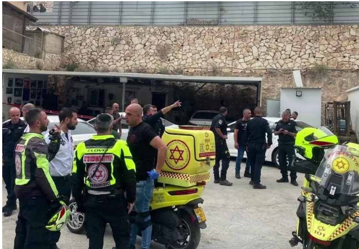
The shooting appears to have been the deadliest incident of criminal violence in Israel in recent years.

accounts for about one-fifth of the population, but in recent years it has experienced the vast majority of the country's murders.