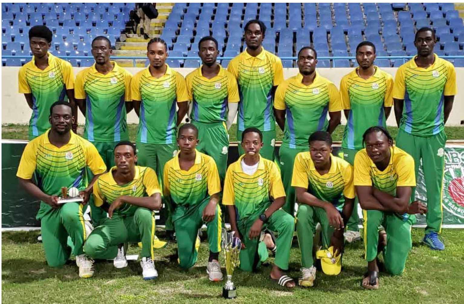
The Empire Nation cricket team, champions of the 2023 ABCA 10 splash cricket tournament, have already booked their spot in the semi-finals of the two-day competition.