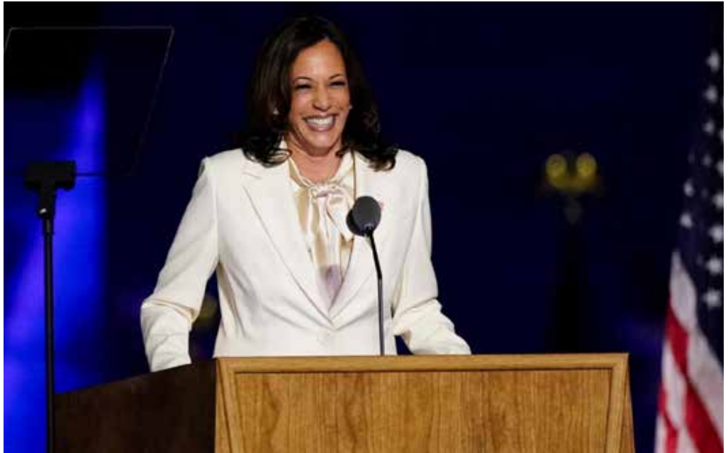
US Vice President-elect, Kamala Harris.

The State Department also expects to work with Haiti's National Police, a severely underfunded