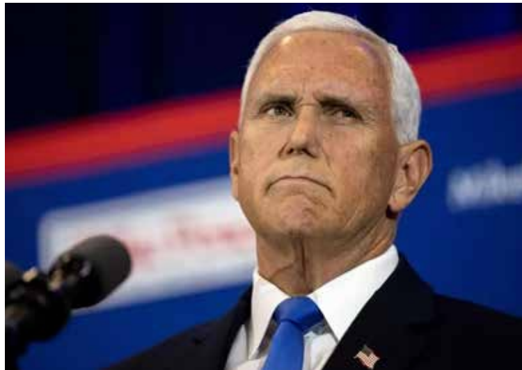
Mike Pence digs at Trump in 2024 campaign launch.

who puts themselves over the constitution should never be president of the United States," he said.