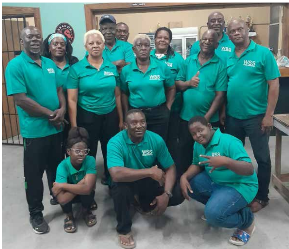
The Willikies Super Stars have won back-to-back Team Four Hand titles in the Antigua and Barbuda National Domino Association's League. (File photo)

Double Six Diamonds advanced to 393 points after scoring 70 points to finish second in their encounter