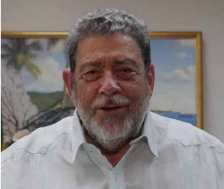
Prime Minister of St Vincent and the Grenadines Dr Ralph Gonsalves