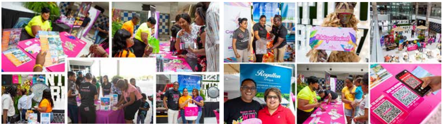
The Antigua and Barbuda Tourism Authority and partners bring the Antigua Carnival experience to Trinidad and Tobago