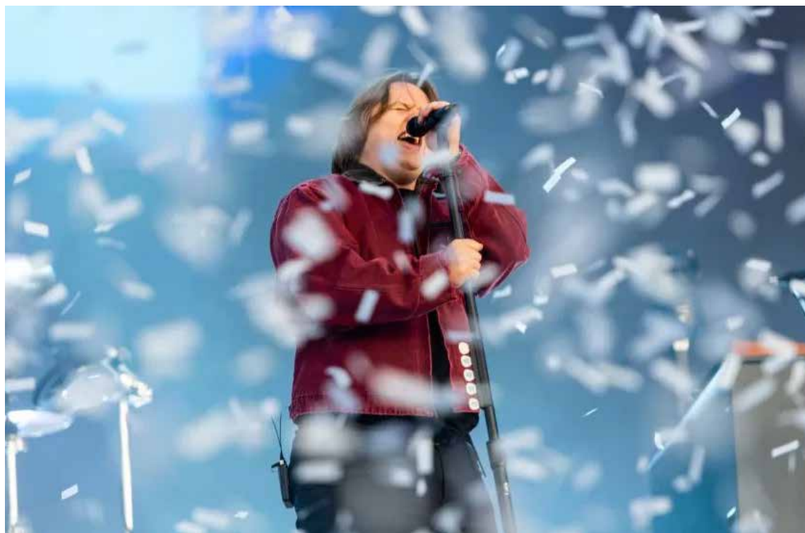
Lewis Capaldi headlined BBC Radio 1's Big Weekend in Dundee last month.

mense, with gruelling schedules, anti-social working patterns and lots of travel.