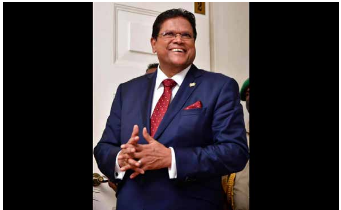
President Chandrikapersad Santokhi.

"Suriname can be seen as the most important sup-