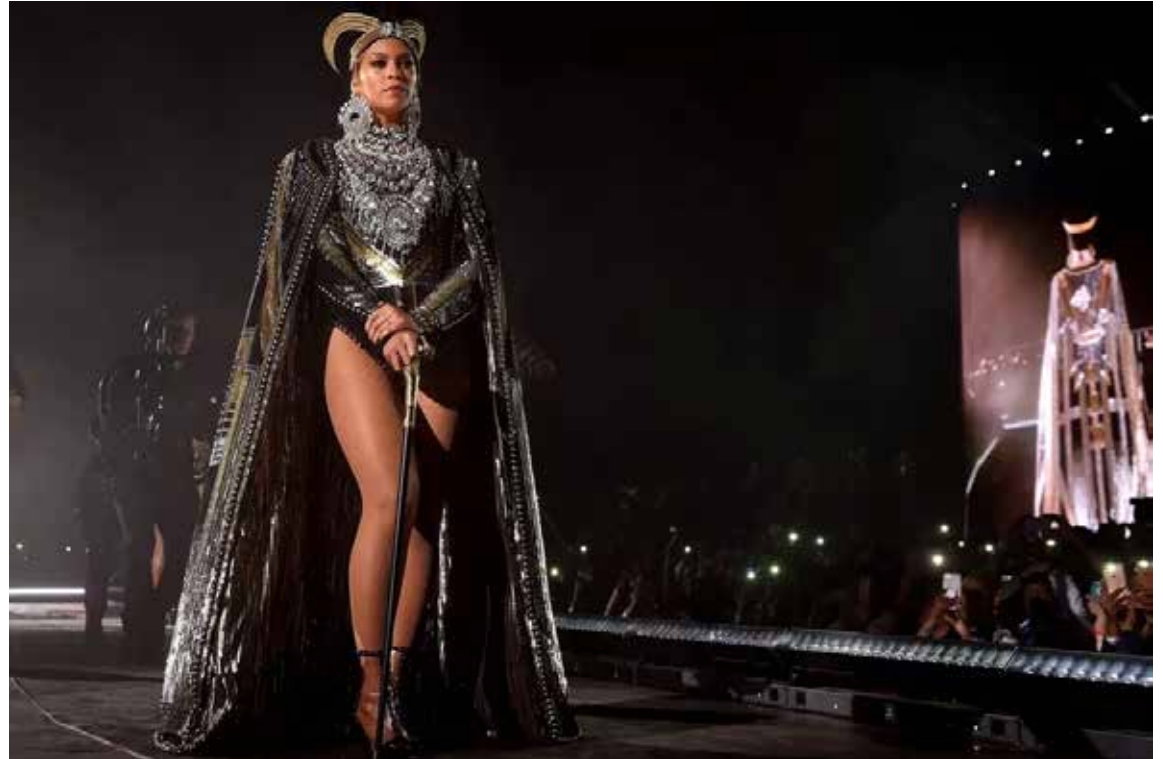
Beyoncé wore an Nefertiti-inspired costume while performing at the 2018 Coachella festival.

try insisted that Cleopatra had “Hellenistic (Greek) features”, including “light skin”.