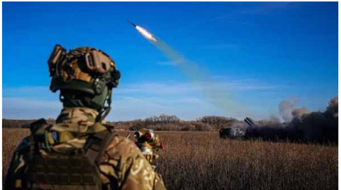
Ukraine has been planning a counter-offensive for months.

The Russian paramilitary group Wagner had claimed to have captured