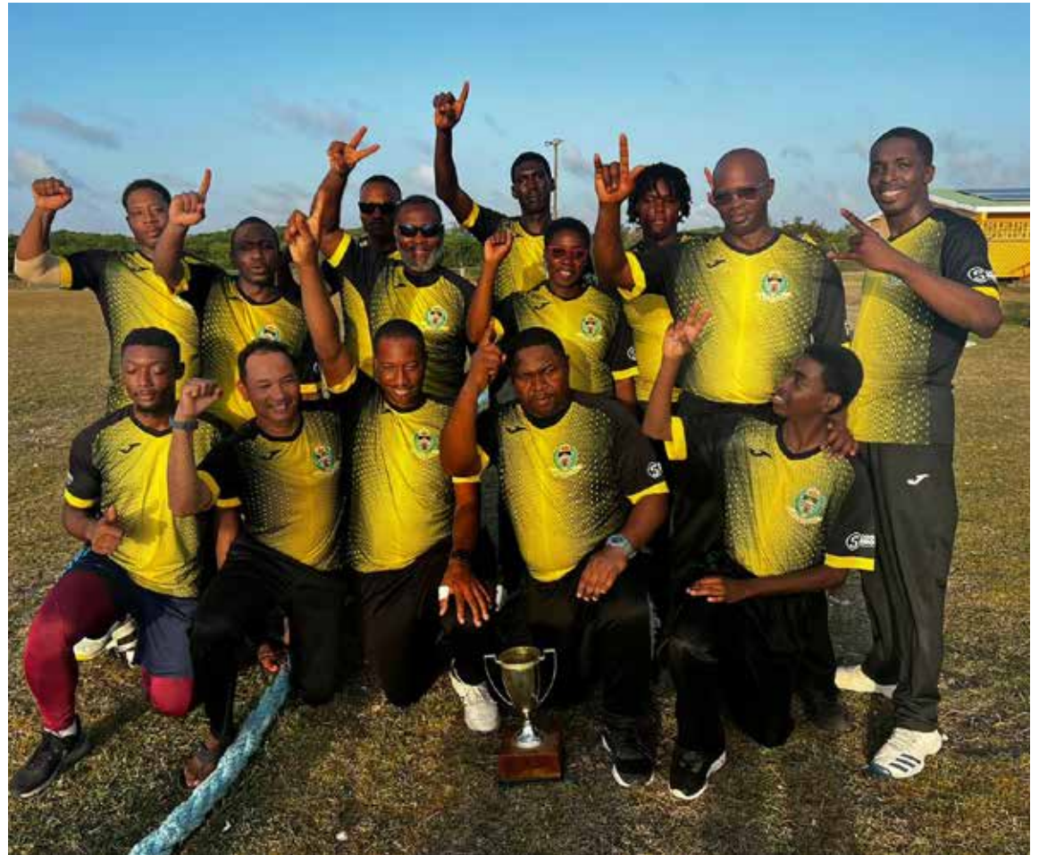
Police celebrate with their trophy after beating host Freetown in the final to retain the Sir Richie Richardson Limited Overs Championship on Sunday, 4th June, 2023.