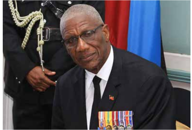
Governor General Sir Rodney Williams

ever he shall deem it advisable ’ finds its application not as the trigger of a COI on the Governor General’s