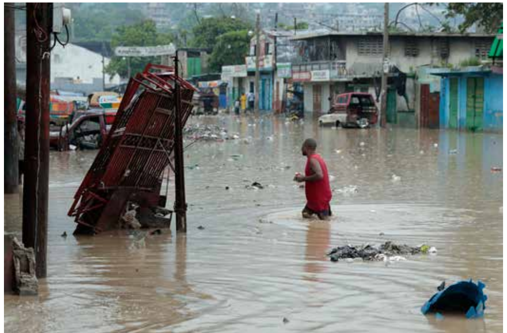
A man wades through a street flooded after a heavy rain in Port-au-Prince, Haiti, Saturday, June 3, 2023.

It said the authorities have had to put in place several emergency measures to ensure the safety of the affected populations.