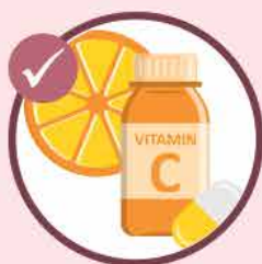
VITAMINS AND MEDICATION