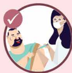
FLU SHOT/ VACCINATION