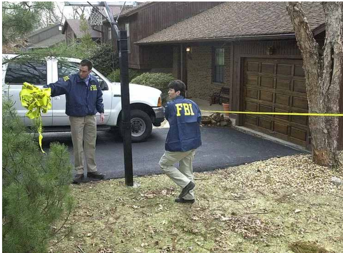
Hanssen lived in a modest four-bedroom house in suburban Virginia.

Because of his counter-intelligence role, he had access to classified informa-