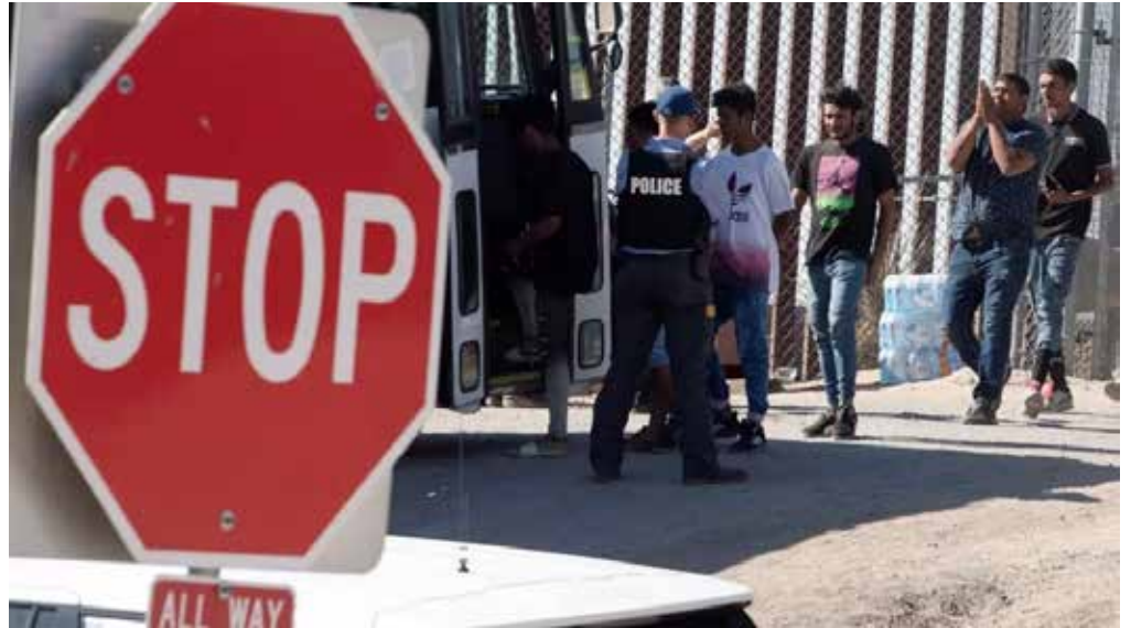
Texas, where the family crossed into the US, is a hotspot of border control activity.

It said a different member of medical staff reported bringing “a pile of documents” and some folic acid tablets from the family home to the nurse the