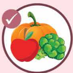
HEALTHY FOODS, FRUITS & VEGETABLES