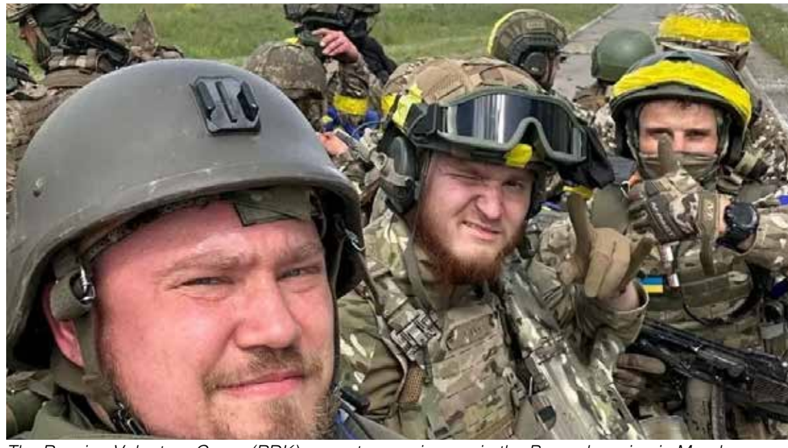
The Russian Volunteer Corps (RDK) came to prominence in the Bryansk region in March.

The message was posted by the Liberty of Russia Legion (FRL) and described as a joint statement with the Russian Volunteer