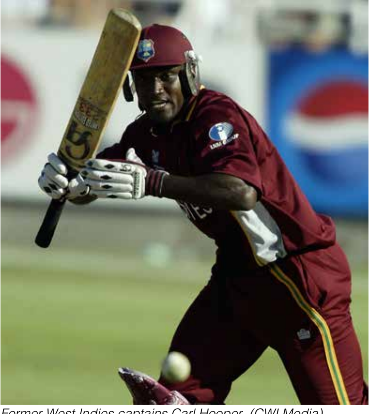
Former West Indies captains Carl Hooper.

Hooper is one of the most successful allrounders in West Indies history - the only player to score over 5.000 runs and take over 100 wickets in both Tests and ODIs. He worked previously at various levels coaching in the Caribbean and Australia. Reifer also has experience across various levels from regional up