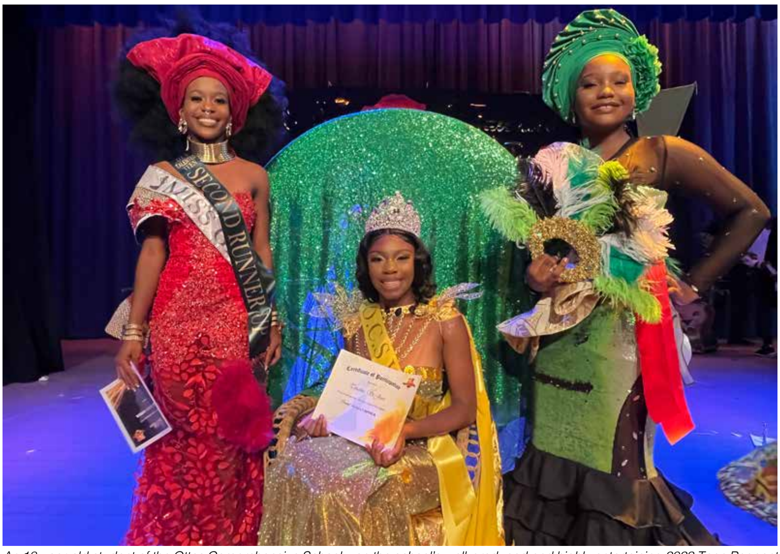
An 18-year-old student of the Ottos Comprehensive School won the school's well-produced and highly entertaining 2023 Teen Pageant held at the Dean William Lake Cultural Centre, on Saturday night. Story on page 7.