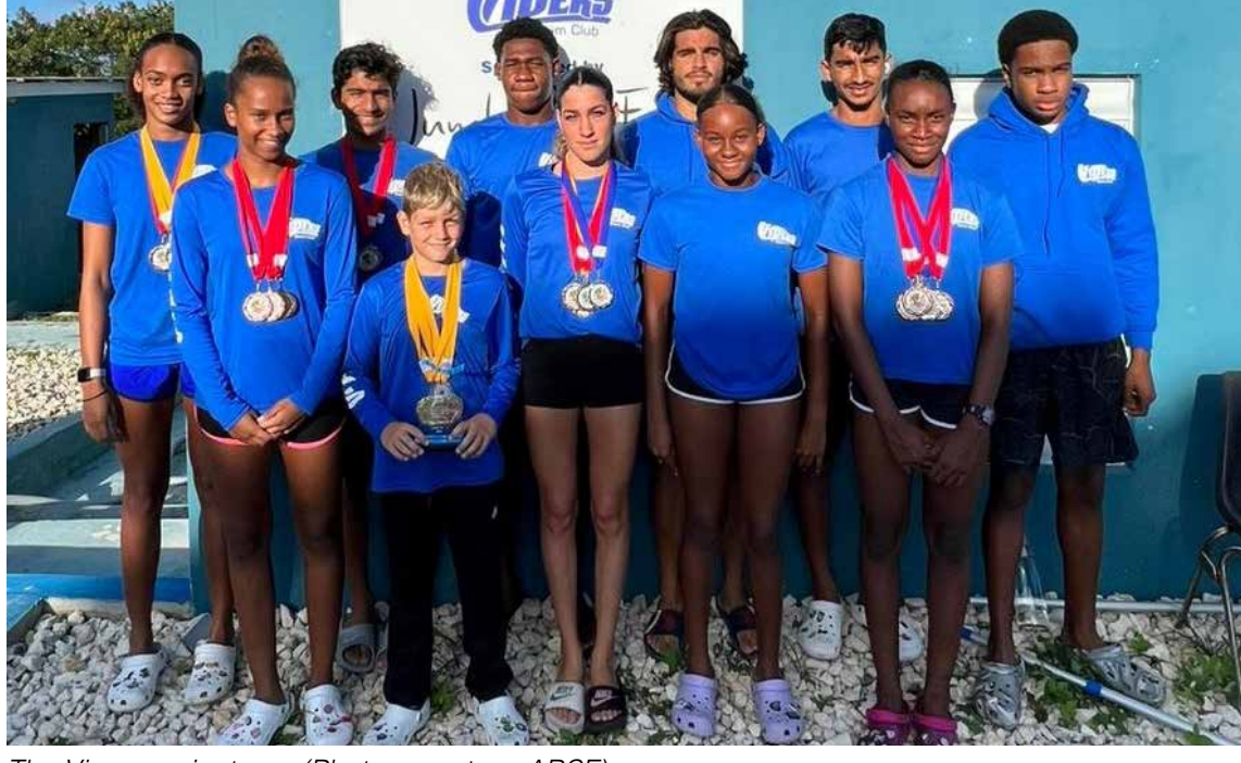
The Vipers swim team

tional record in 100-meter backstroke in the boys' 8 and under category. He also placed second overall in the boys, 7-8 year old age group.