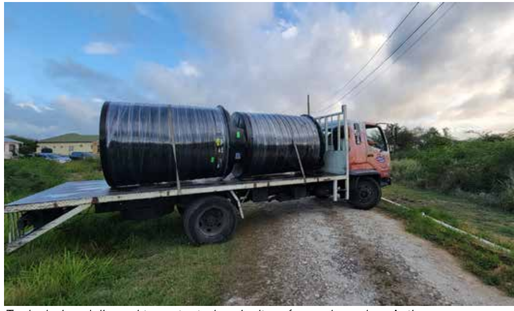
Tanks being delivered to protected agriculture farmer based on Antigua

project focuses on assisting farmers in Antigua and Barbuda in attaining sustainable water access through various interventions. These 1000-gallon tanks provide an immediate solution to the water storage needs of 12 farmers, with 7 located in Antigua and 5 in Barbuda. By storing water in these tanks, farmers can optimize irrigation practices and ensure a consistent water supply for their crops, mitigating the impact of climate change on agricul-