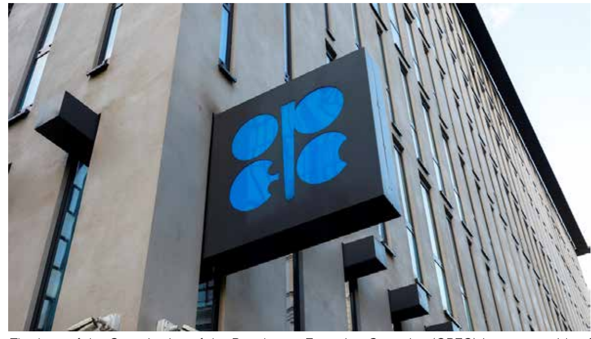
The logo of the Organization of the Petroleoum Exporting Countries (OPEC) is seen outside of OPEC's headquarters in Vienna, Austria, on March 3, 2022.

mark Brent crude climbed as high as $87 per barrel but has given up its post-cut gains and has been loitering below $75 per barrel in recent days. US crude has dipped below $70.