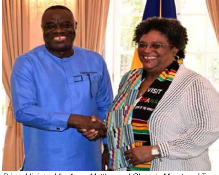
Prime Minister Mia Amor Mottley and Ghana's Minister of Tourism, Arts and Culture, Ibrahim Awal.

A government statement said that there is a firm commitment from the two countries to work on making the much-talkedabout air bridge a reality.