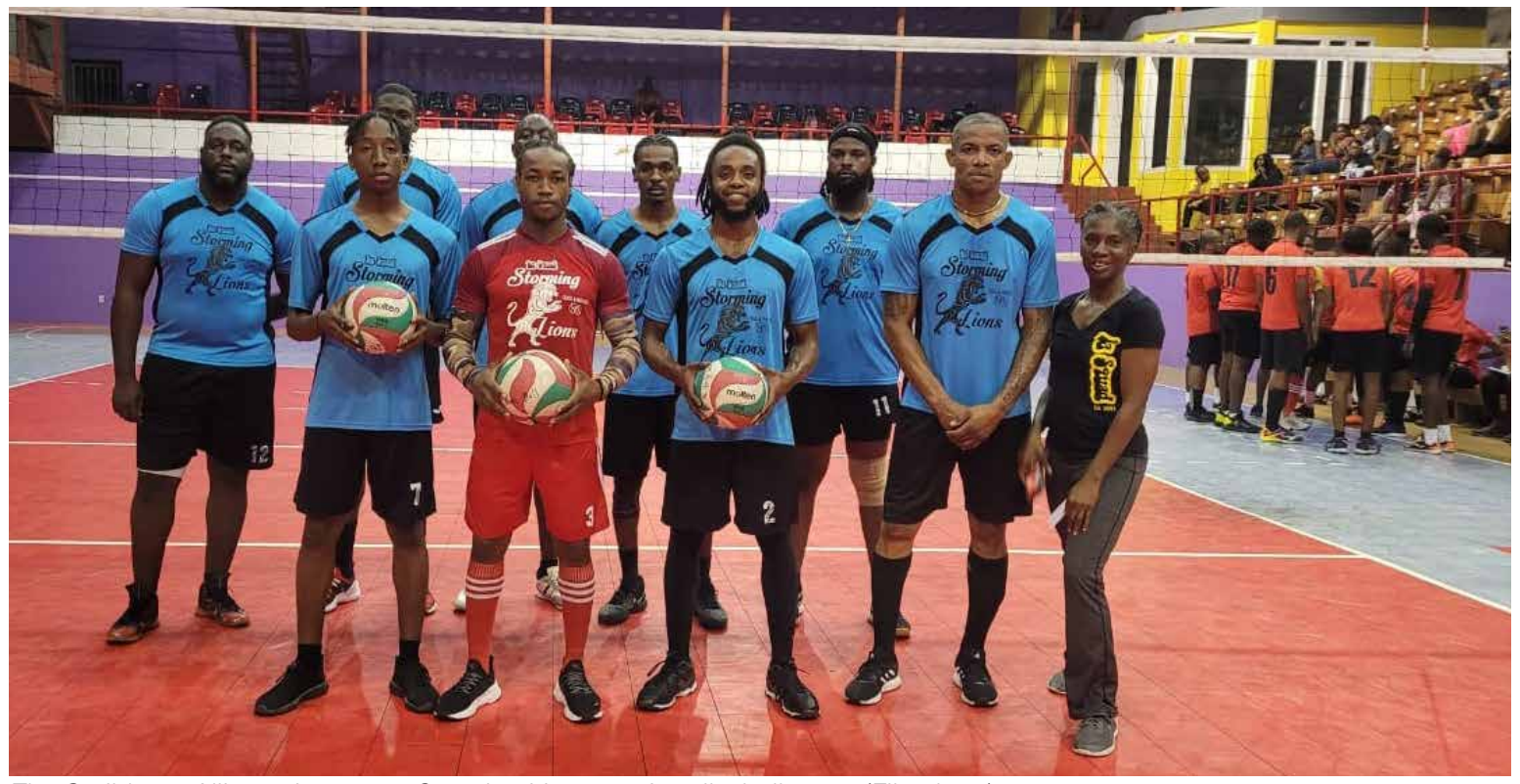
The Caribbean Alliance Insurance Storming Lions men's volleyball team. (File photo)