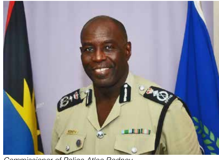
Commissioner of Police Atlee Rodney

"The theme of the conference was' Transnational organized crime; a growing threat to regional security. This was our theme and all the discussions and presentations focused on how we can address transnational organized crime because