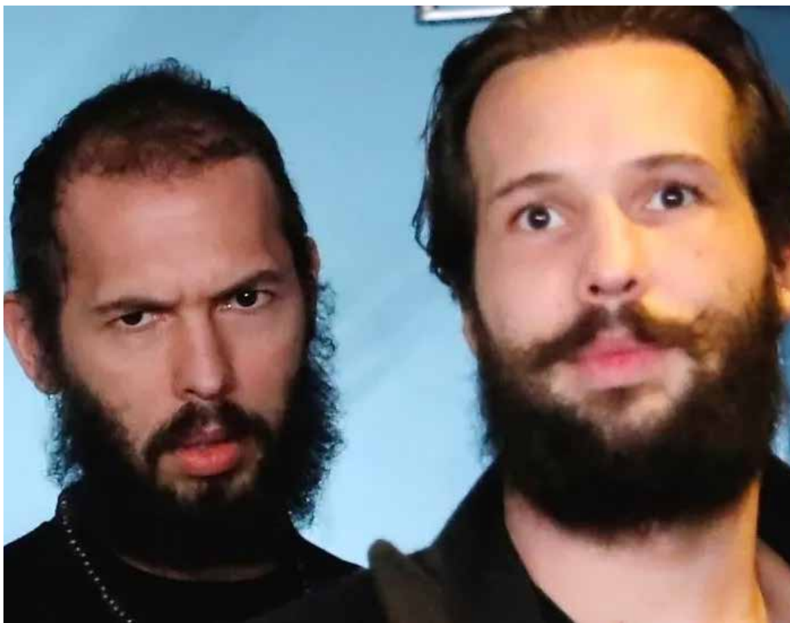
Andrew Tate, left, and his brother Tristan were first arrested at their Bucharest home in December.

The alleged victims were later taken to buildings in Ilfov county in Romania where they were intimidated, placed under constant surveillance and control and forced into debt, according to a statement from Romanian prosecutors.