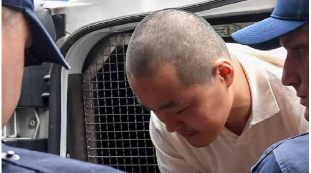
Do Kwon arriving at court in Montenegro.

They will also be able to appeal the verdict within eight days of receiving written notification from the court.