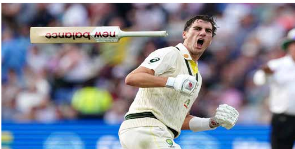
Australia captain Pat Cummins celebrates after beating England during day five of the first Ashes Test cricket match, at Edgbaston, Birmingham, England, Tuesday, June 20th, 2023.

The end came in agonising fashion at 7.20pm – 80 minutes after the scheduled close due to morning rain – when Cummins steered the ball to deep third and a sprawling Harry Brook parried