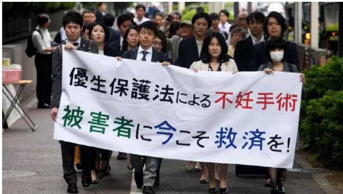
The families of those who have been forcibly sterilised demand compensation.

Some people were told that they were undergoing routine procedures like ap-