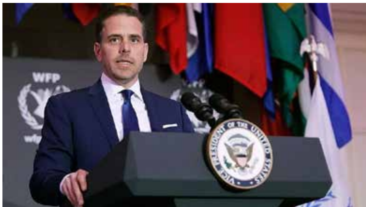
Hunter Biden is expected to avoid jail time under a plea agreement.