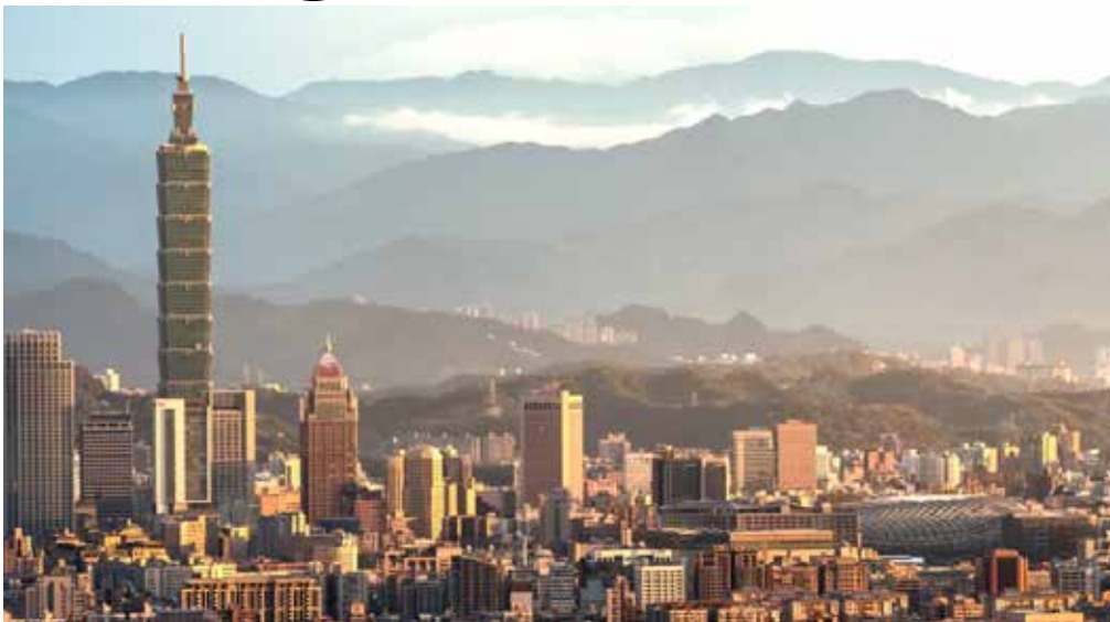
Five teachers at a preschool in Taiwan have been accused of drugging students.

found four doctors guilty of misconduct and improper use of phenobarbital on about 20 children. They were ordered to suspend their practice for six months, and were fined 1.4m Taiwanese dollars (£35,989, $46,121).