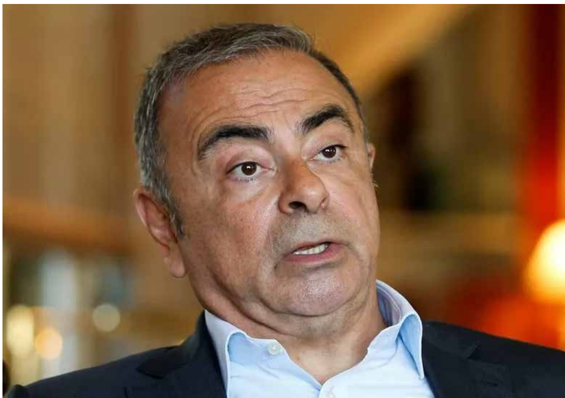
Former Nissan boss Carlos Ghosn

Credited with reviving Nissan from near bankruptcy in the early 2000s, Mr Ghosn was appointed chief executive of French carmaker Renault in 2005,